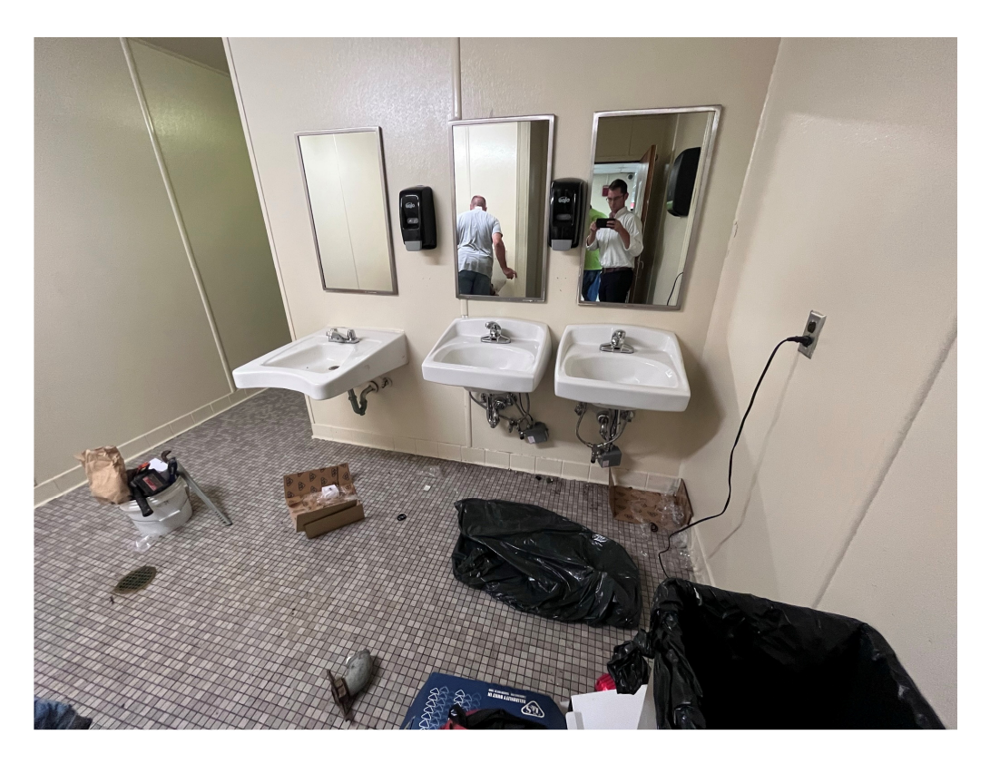
Figure 1 – Contractor on site at Leflore County