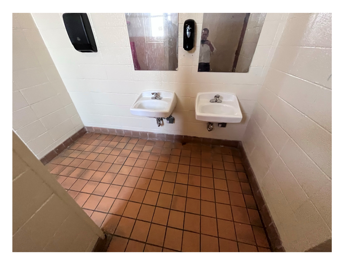
Figure 3 – New Touchless Fixtures at Leflore County