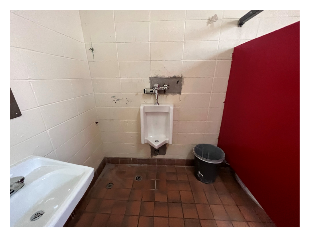
Figure 2 – New Touchless Fixtures at Leflore County