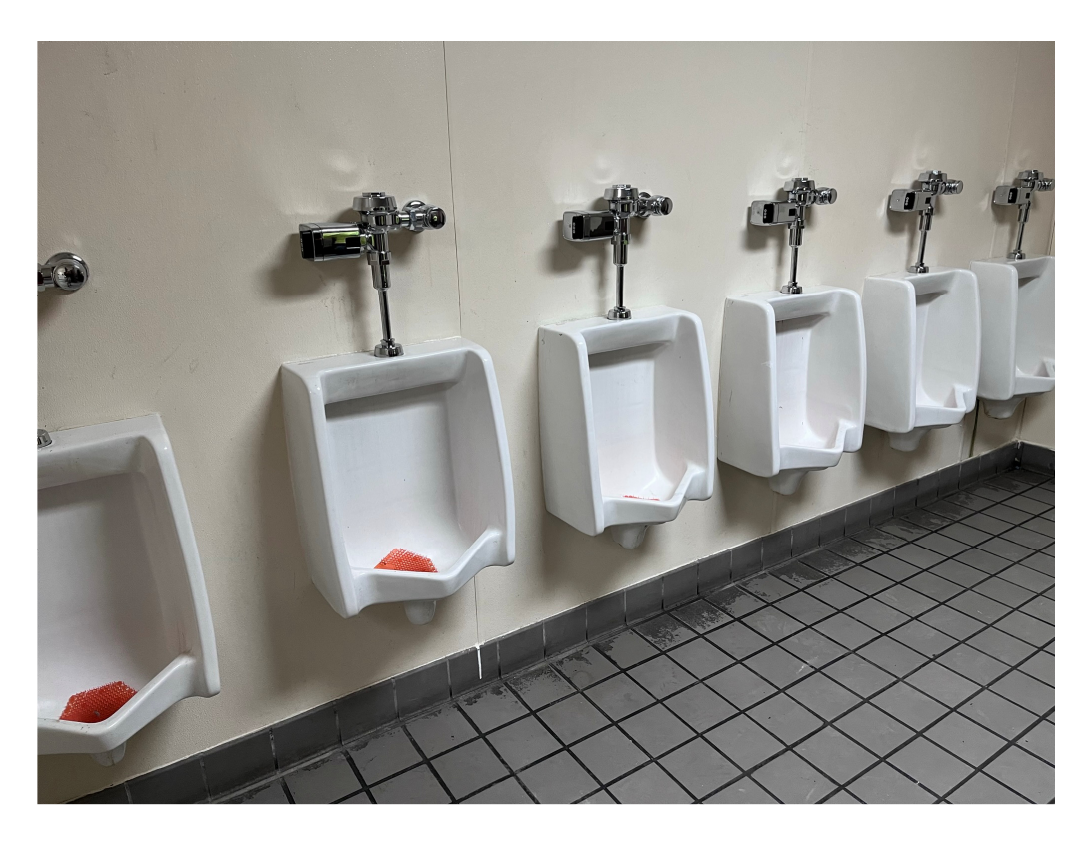
Figure 5 – Flush Valves Changed out at Leflore County