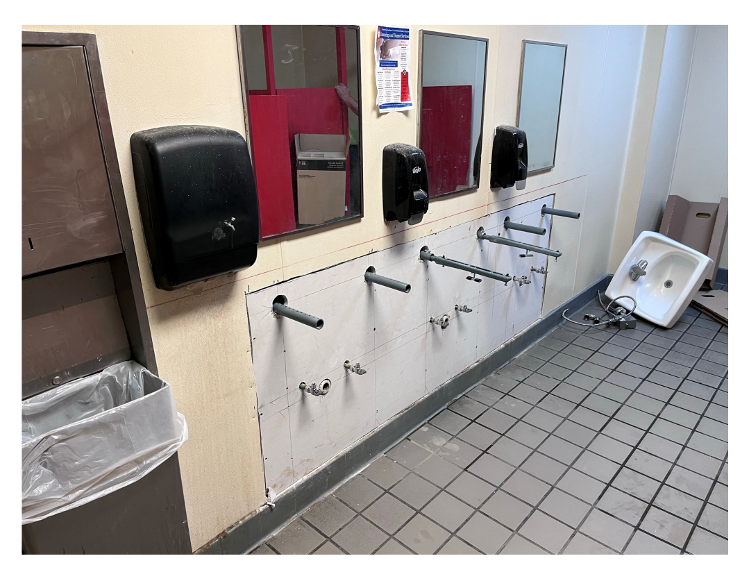
Figure 4 – New Lavatory Work at Leflore County