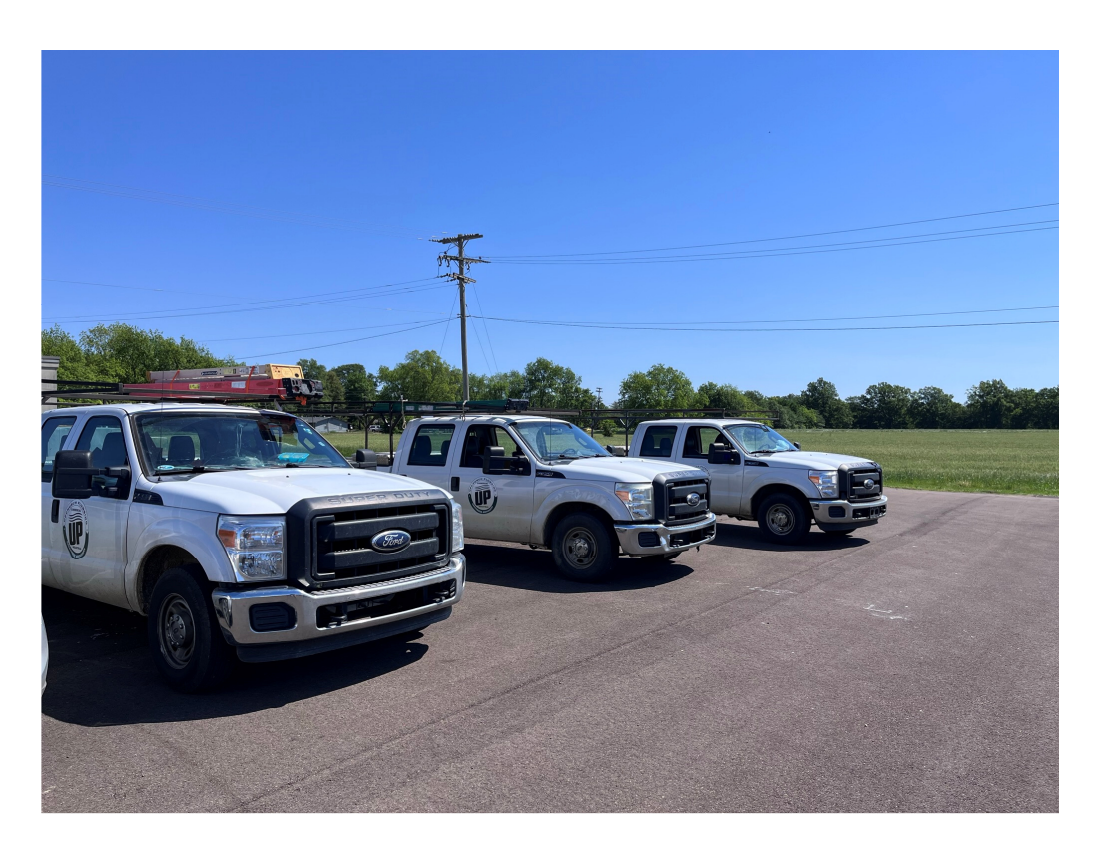
Figure 1 – Contractor on site at Leflore County