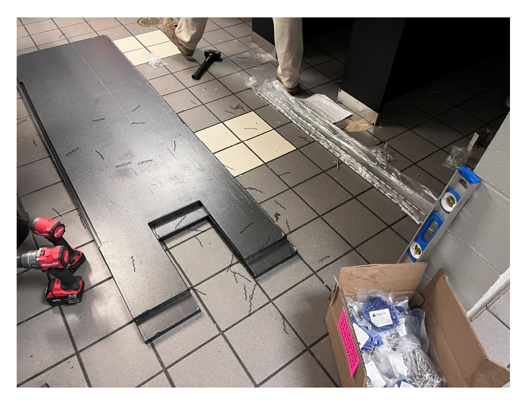
Figure 12 – Partition installation, starting at Greenwood Middle