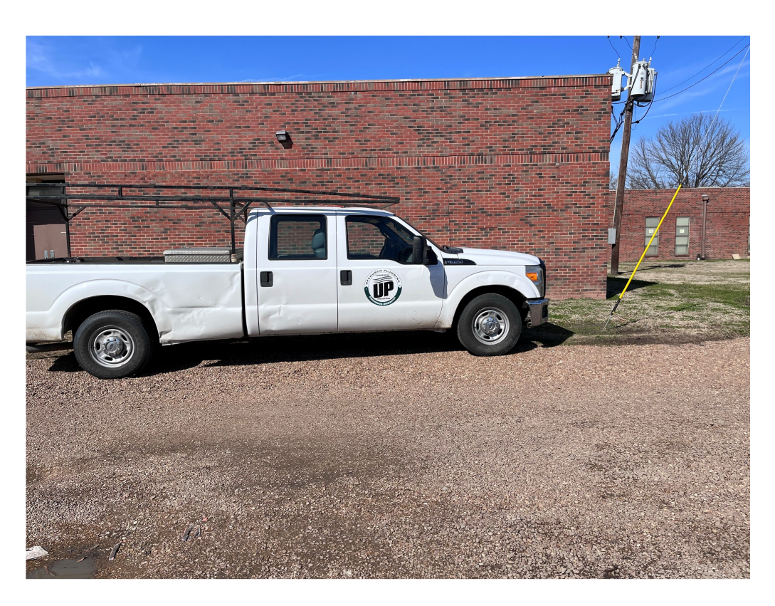
Figure 1 – Upchurch parked at rear of Davis Elementary