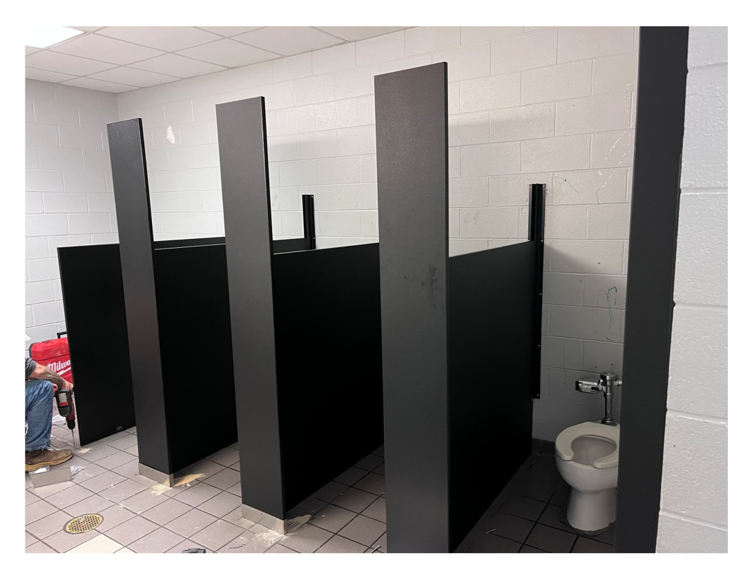
Figure 11 – Partition installation, starting at Greenwood Middle