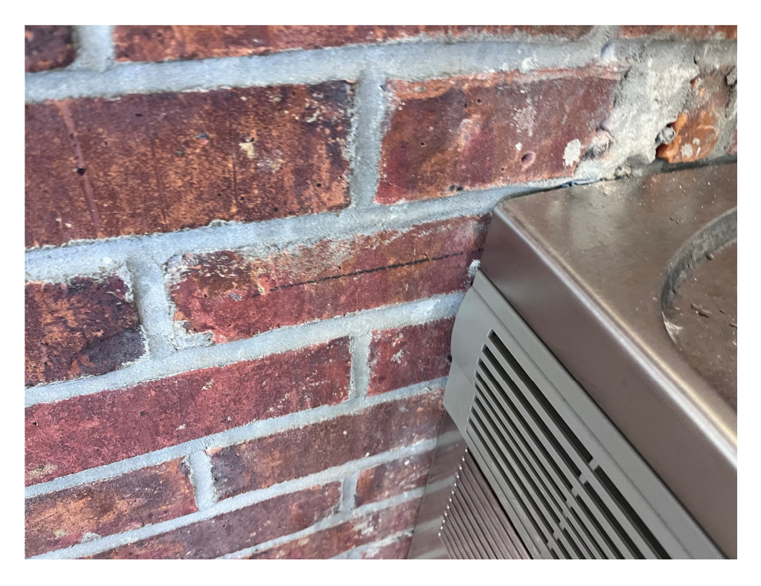
Figure 6 – Remove any construction markings