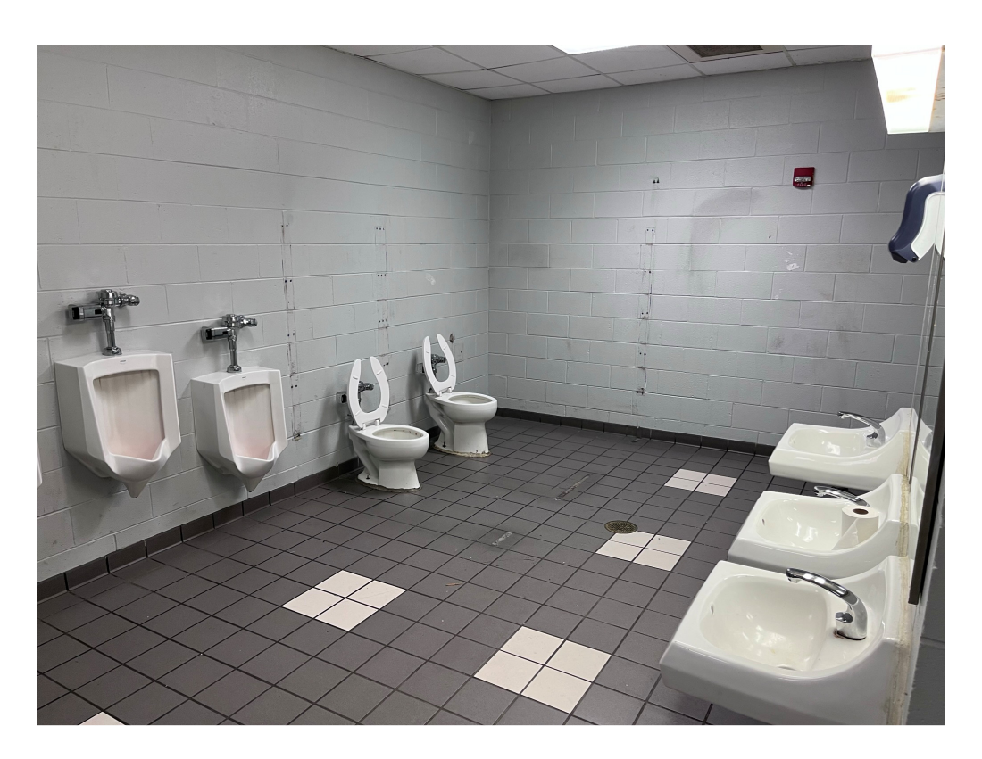
Figure 9 – Partitions removed at Greenwood Middle