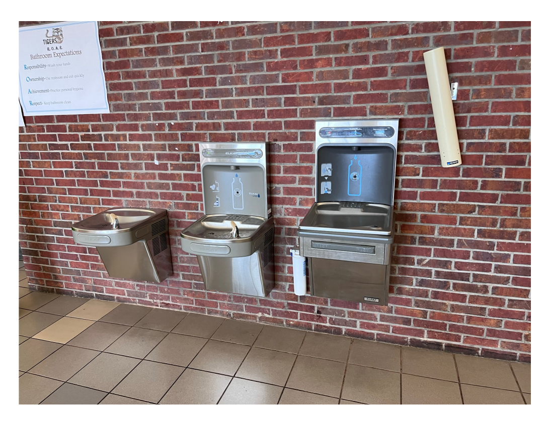
Figure 5 – New Fountains installed