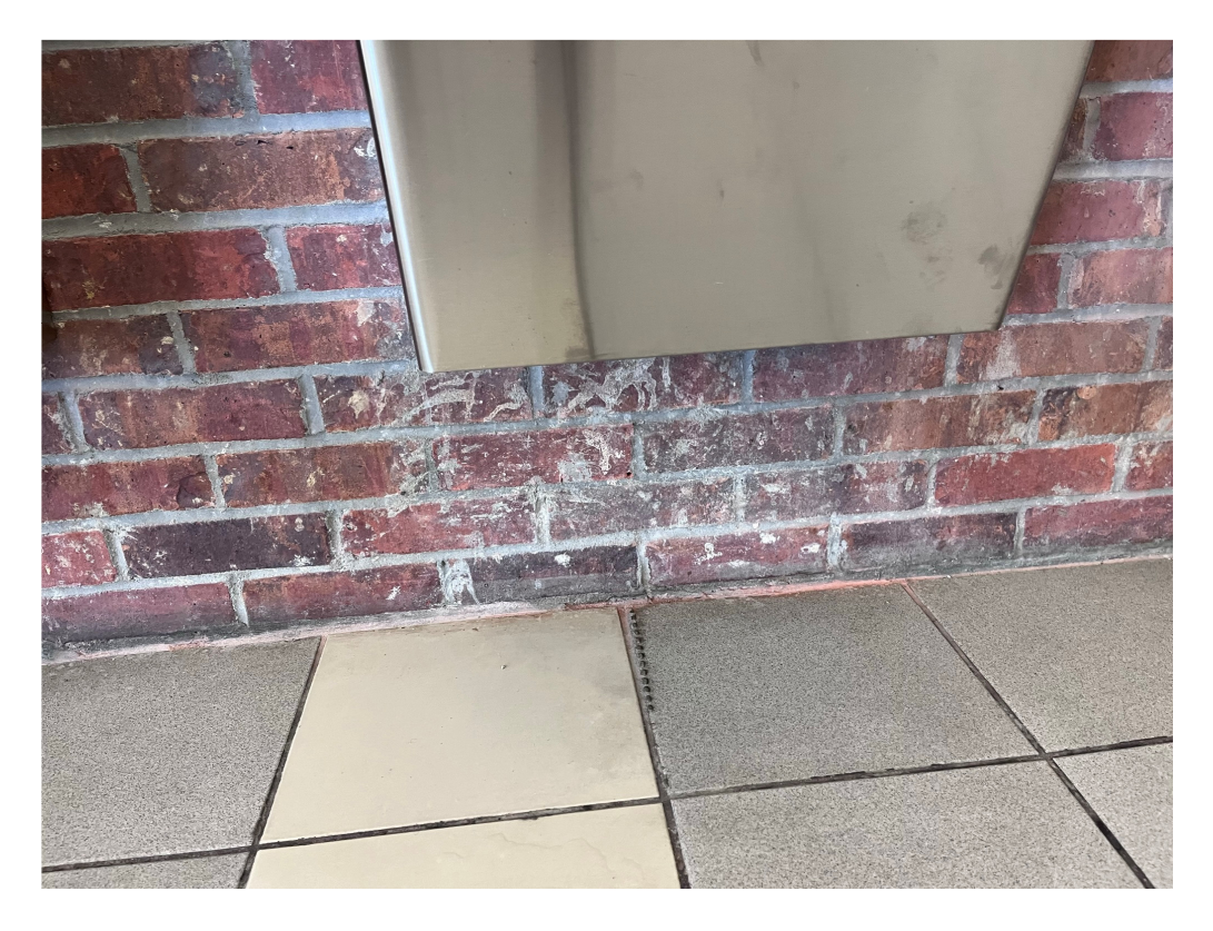
Figure 8 – Masonry dust from installation needs to be removed from brick face