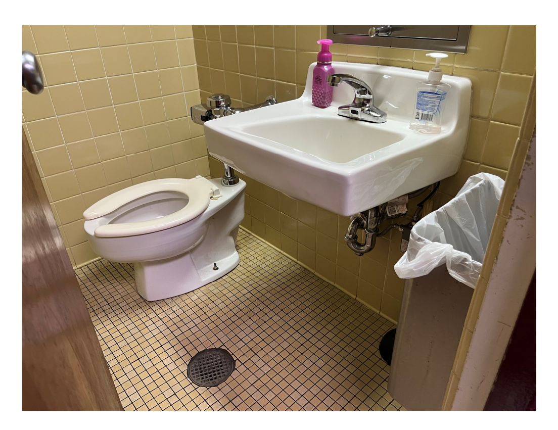
Figure 3 – Insulation still needed in some areas