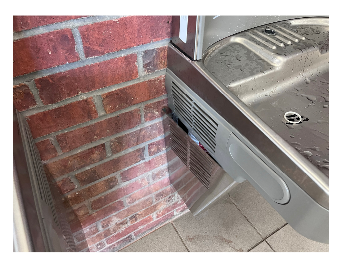
Figure 7 – Ensure that covers are fully secured