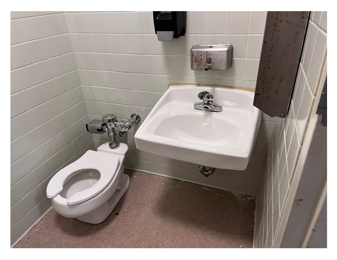
Figure 2 – New Toilet Fixtures at Davis Elementary