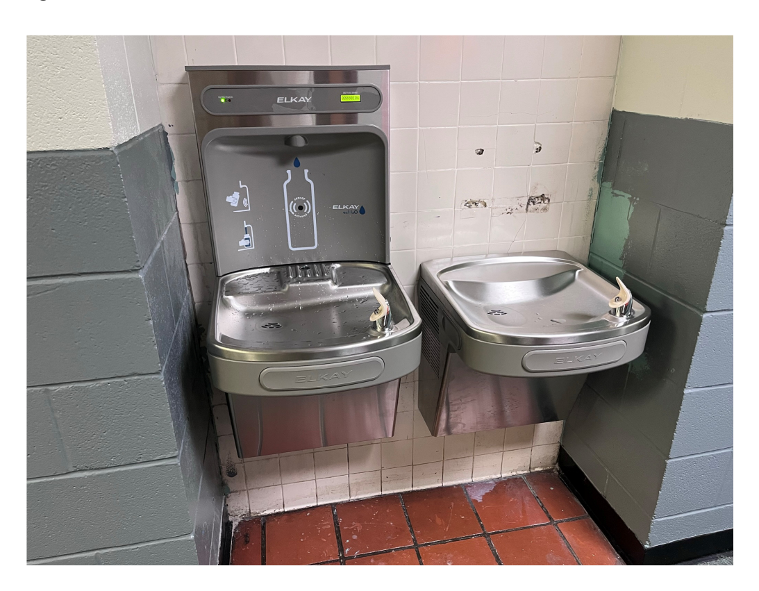
Figure 4 – New Fountains installed