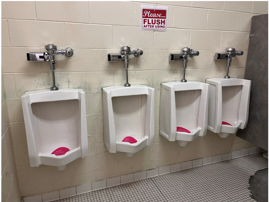
Figure 2 – Typical Urinal Valves