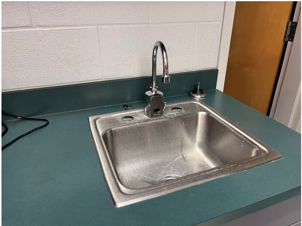
Figure 10 – Typical New Faucet @ Greenwood Middle