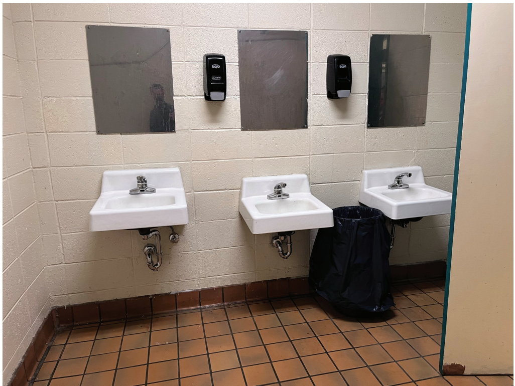
Figure 14 – New Faucets at Amanda Elzy