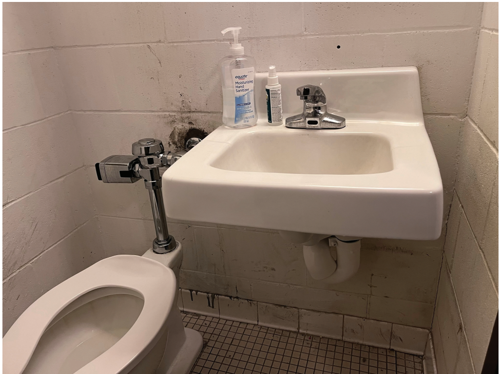
Figure 4 – Typical New Faucet @ Claudine Brown