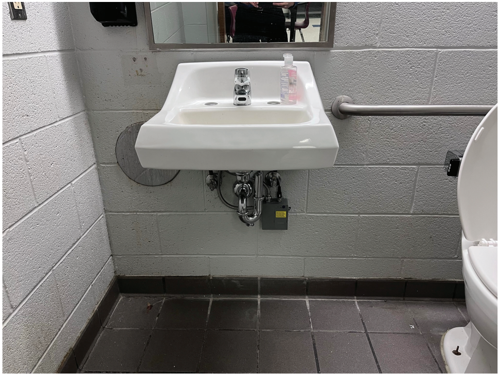
Figure 11 – Typical New Faucet @ Greenwood Middle