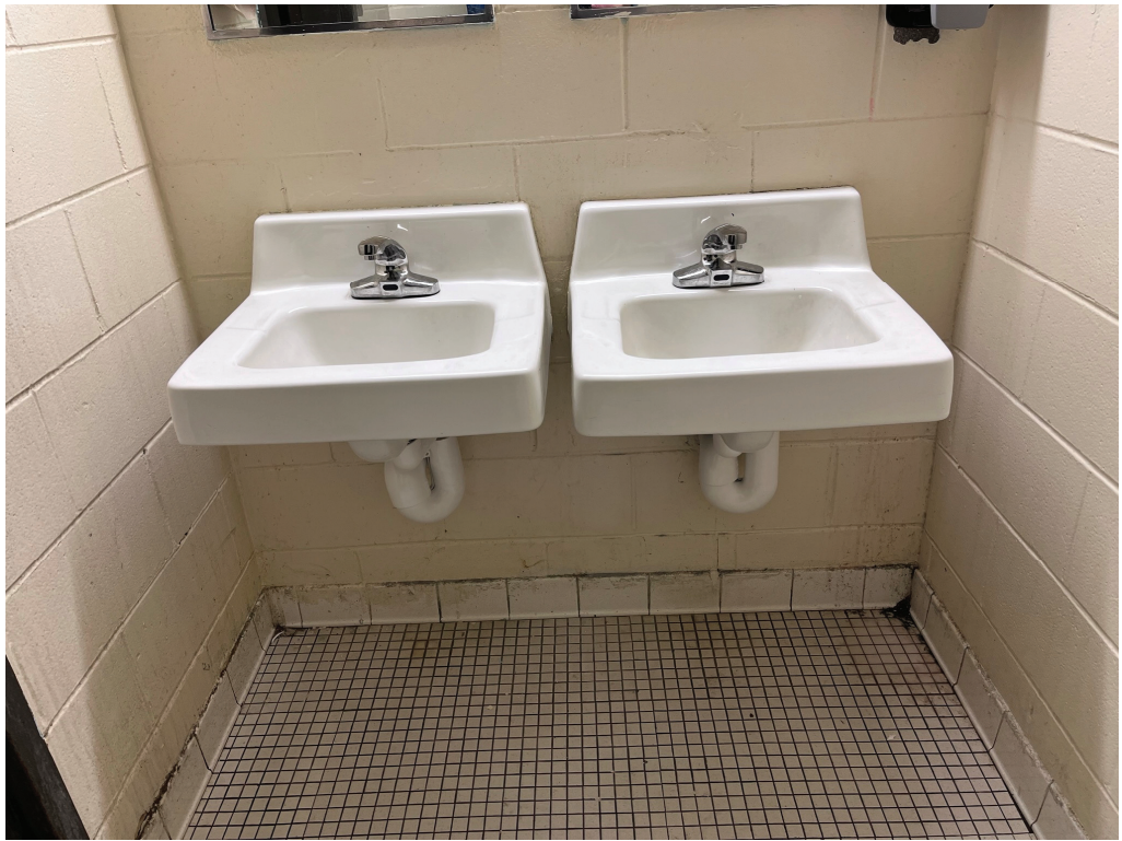
Figure 1 - Typical Finished Installation at Claudine Brown