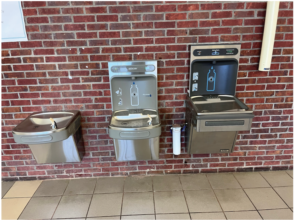
Figure 9 – 2 New Bottle Fillers in Plans for here; is the other still to come?