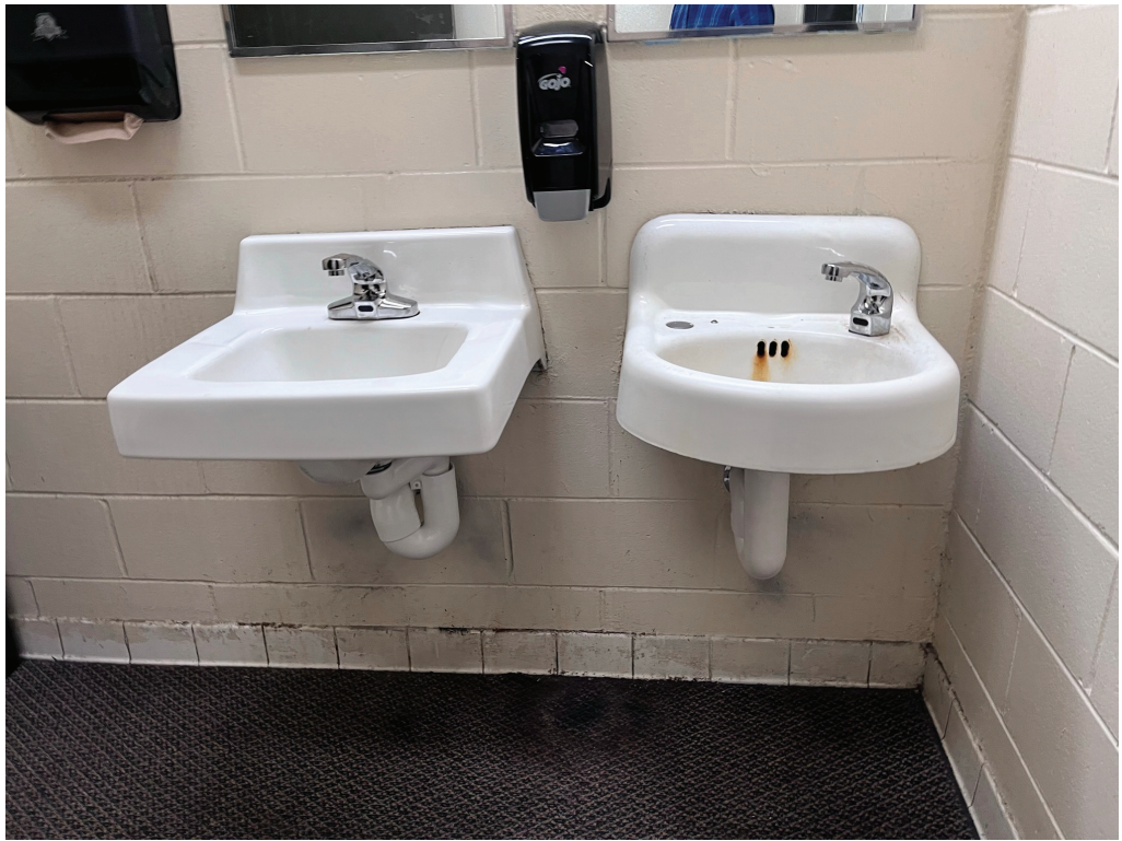
Figure 3 – Please Provide Price to replace sink on right with like sink as on left