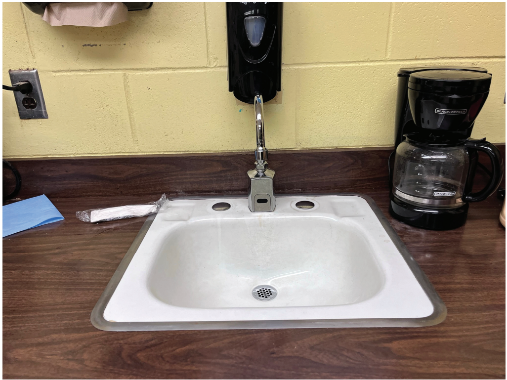
Figure 5 – Typical New Faucet @ Claudine Brown