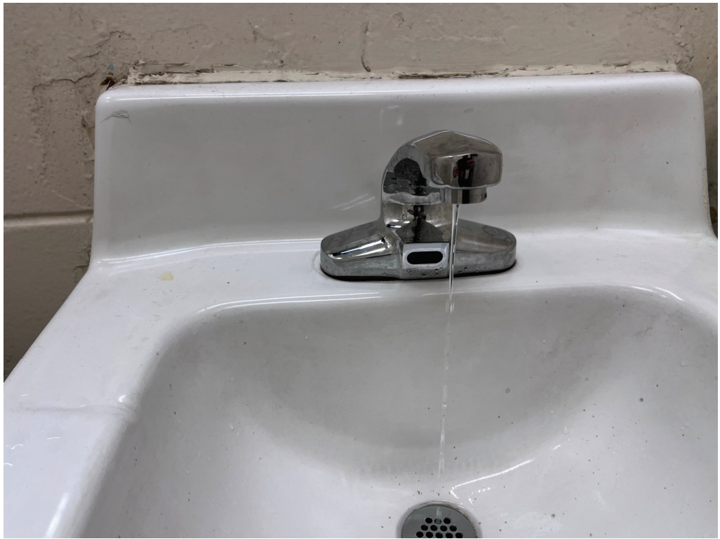
Figure 7 – Some Faucets Dripping