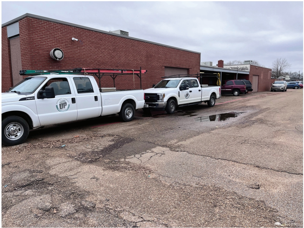
Figure 13 – Upchurch On Site at Amanda Elzy