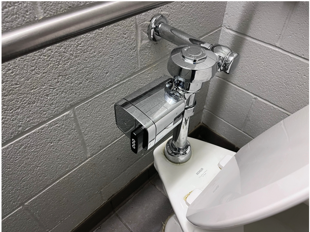
Figure 12 – Typical New Flush Valve @ Greenwood Middle