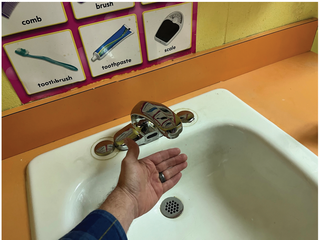
Figure 6 – This Faucet Does not Appear to respond at Claudine Brown