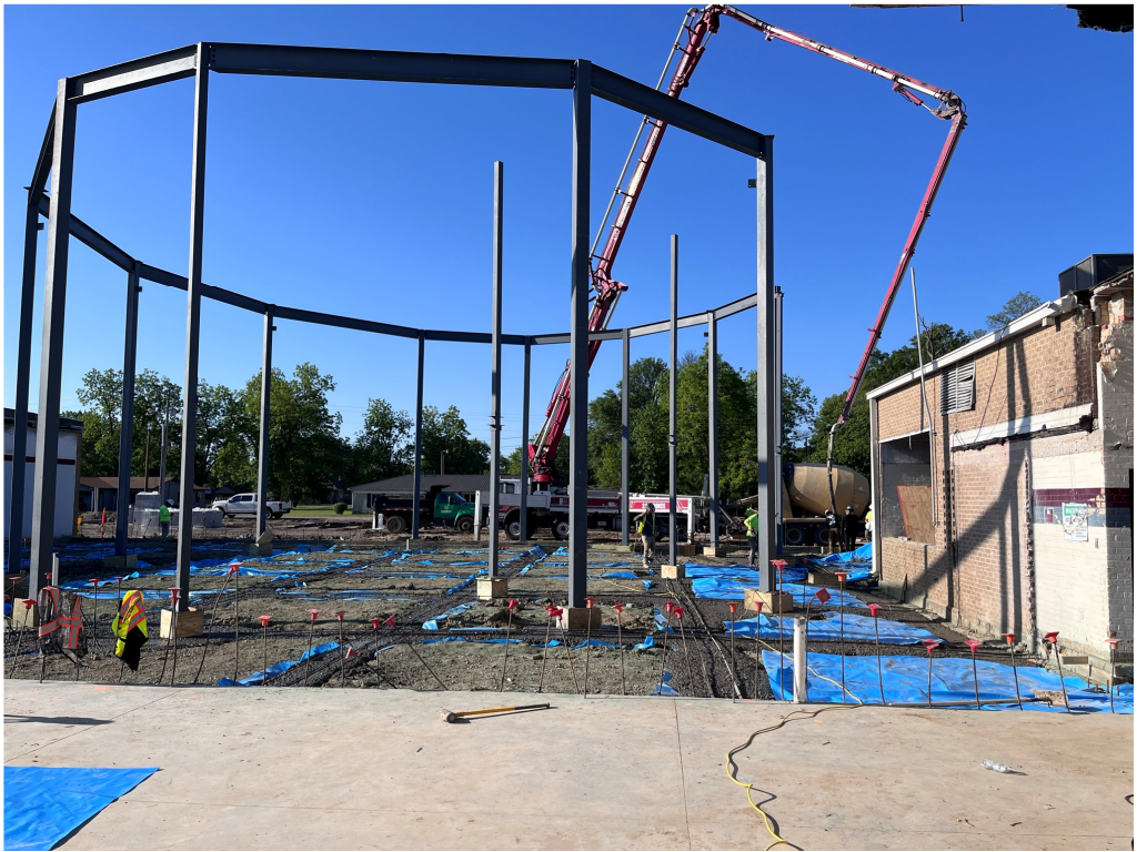
Figure 2 – GHS Concrete Install