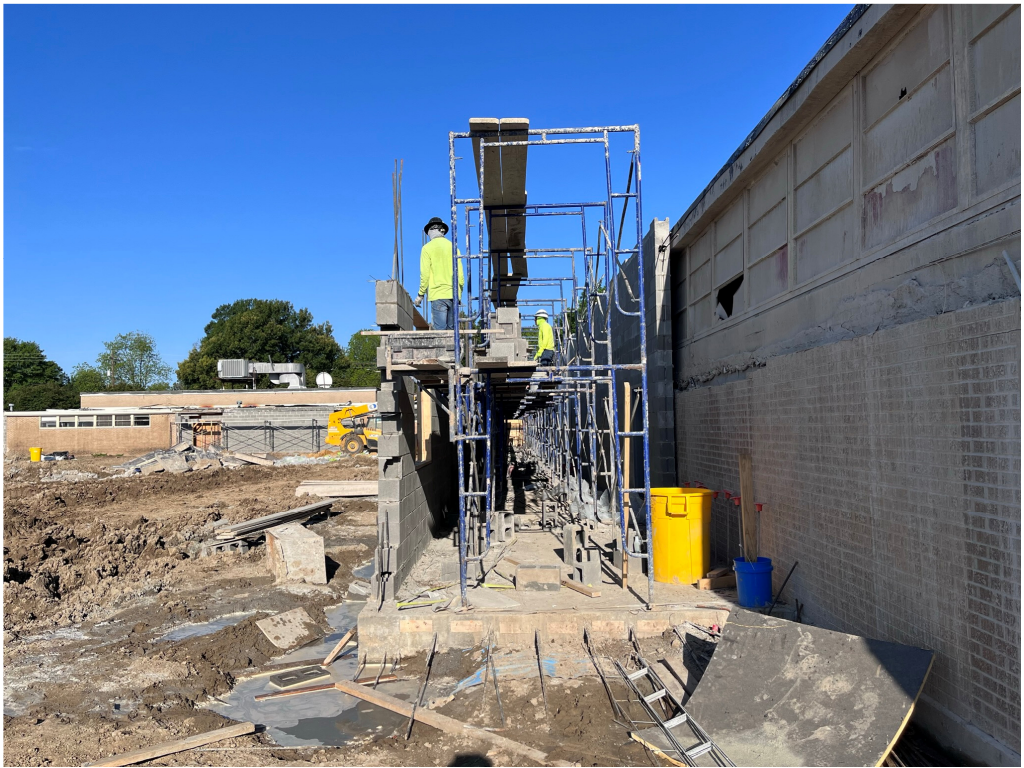
Figure 6 – GHS Masonry Work at North Corridor