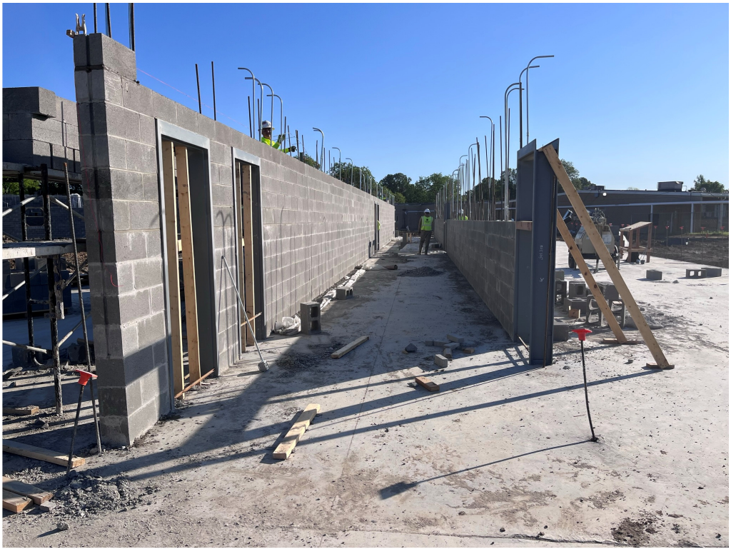
Figure 5 – GHS Masonry Work at Central Corridor