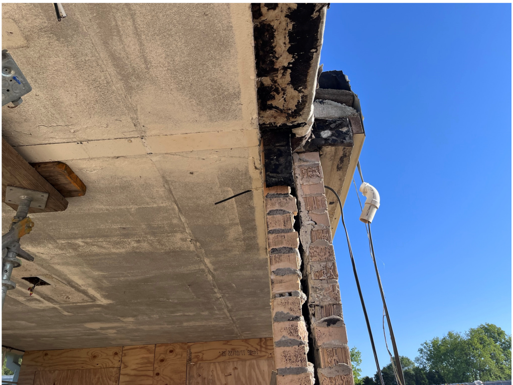
Figure 10 – GHS Exterior Wall where proposed bump out will be seen at interior