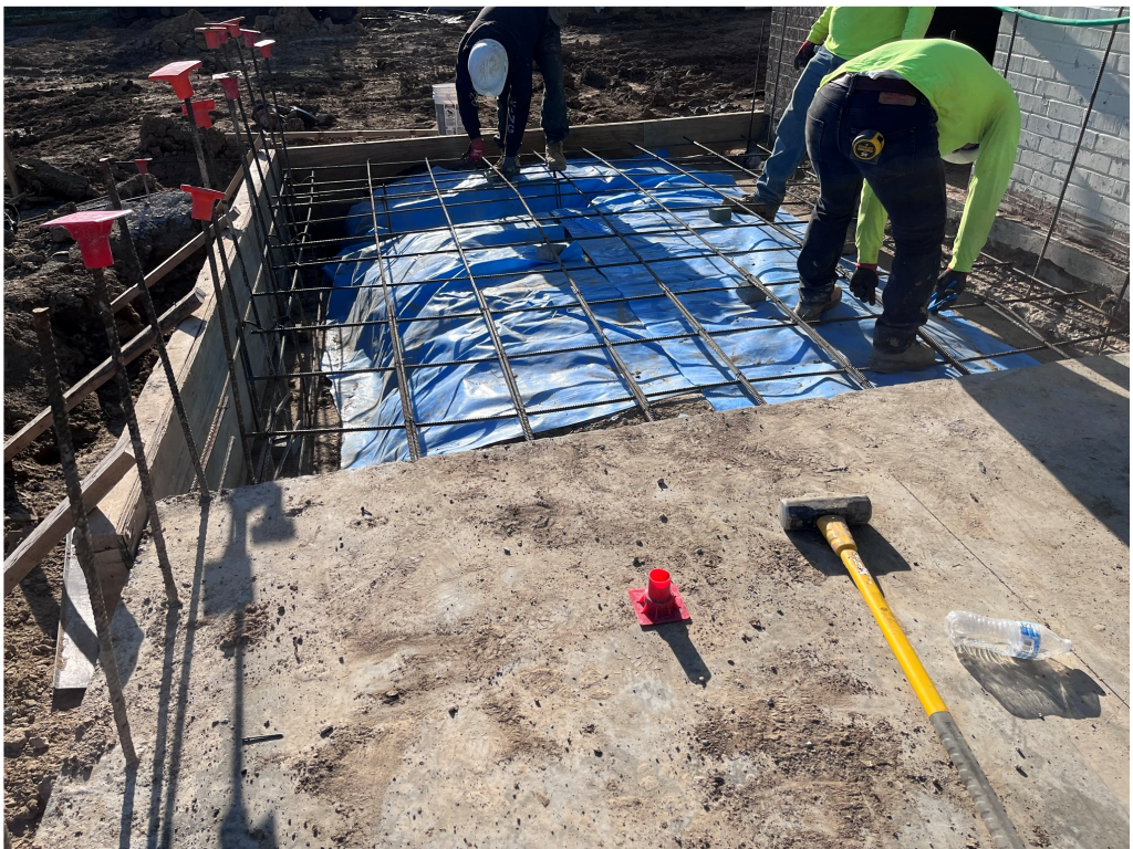
Figure 4 – GHS concrete new cafeteria