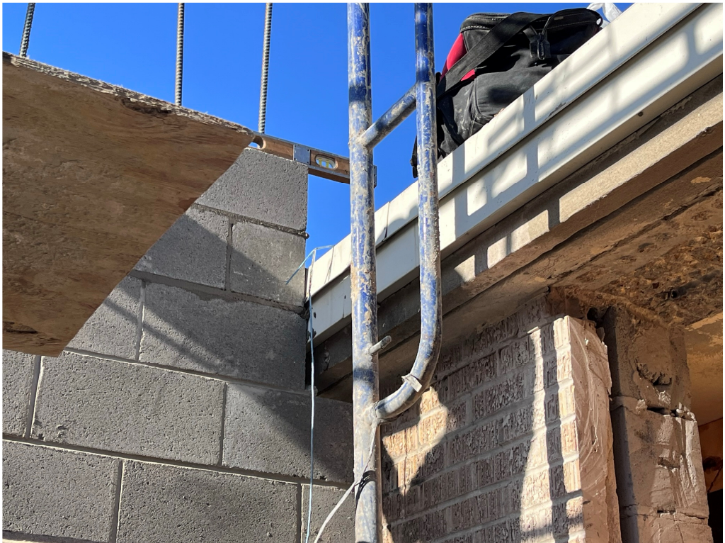
Figure 8 – GHS; will flashing be pinned between new construction & old?