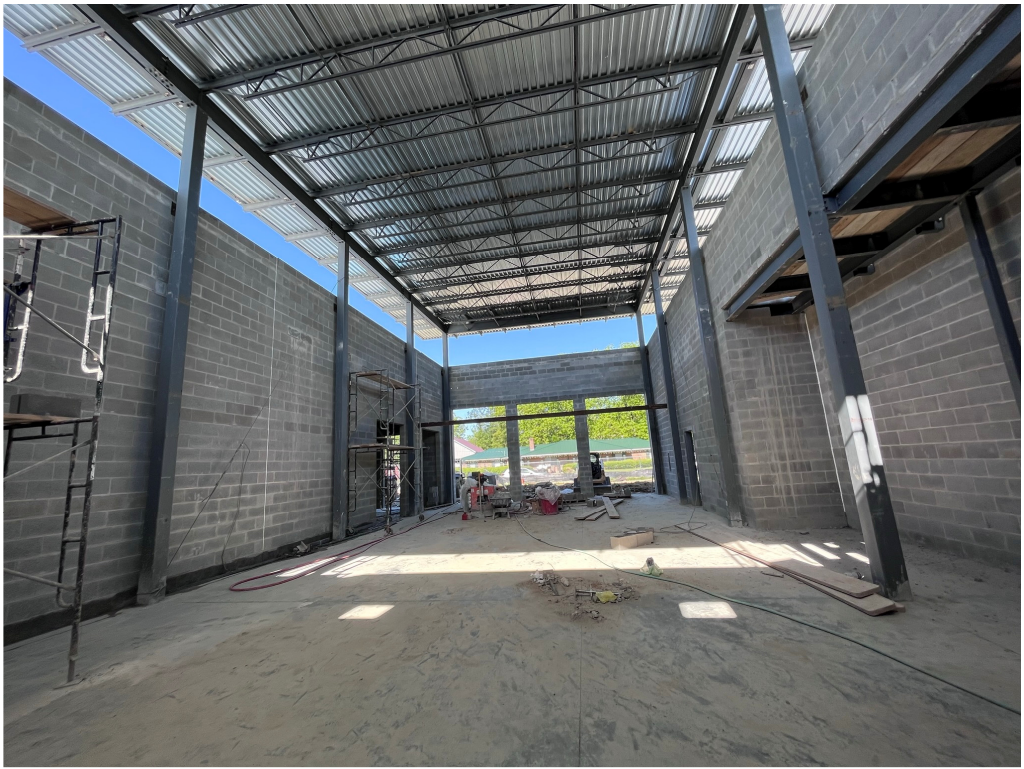
Figure 15 – TEHS Lobby