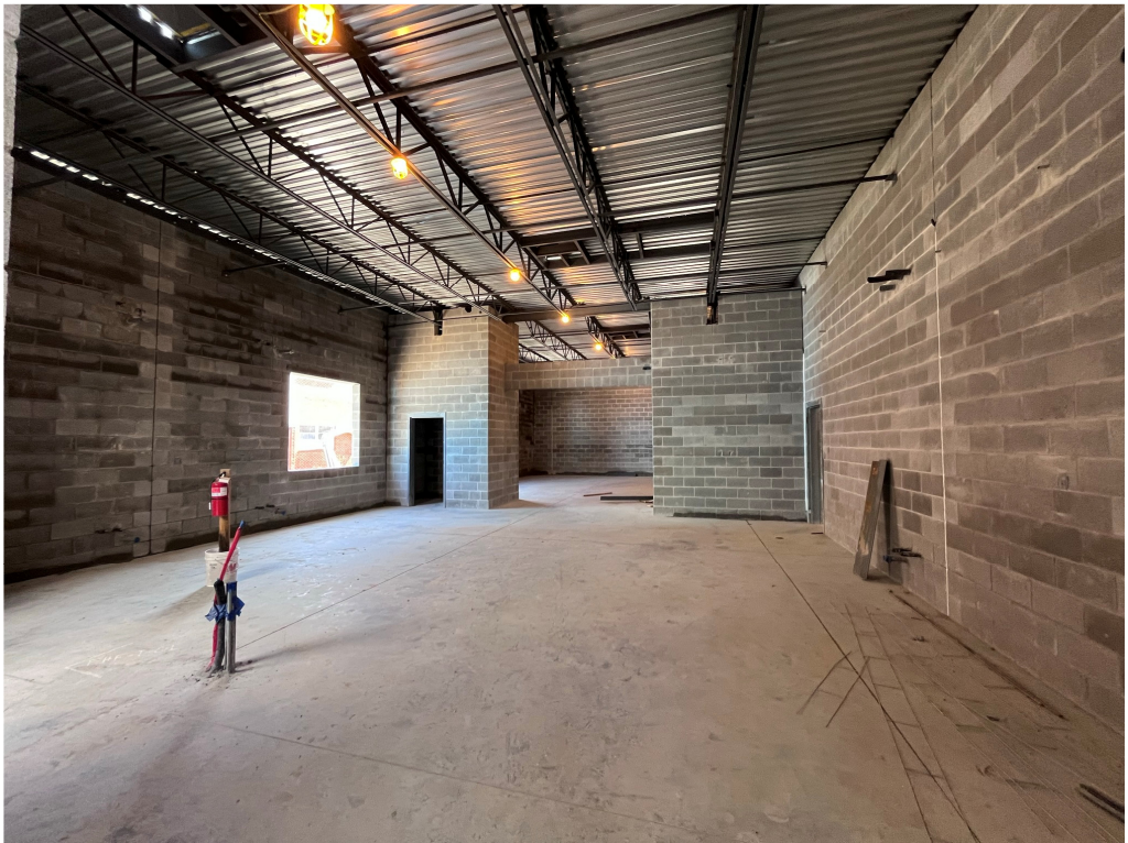
Figure 16 – TEHS Classroom