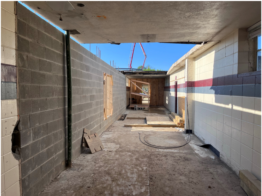
Figure 9 – GHS; please advise on deformation in column