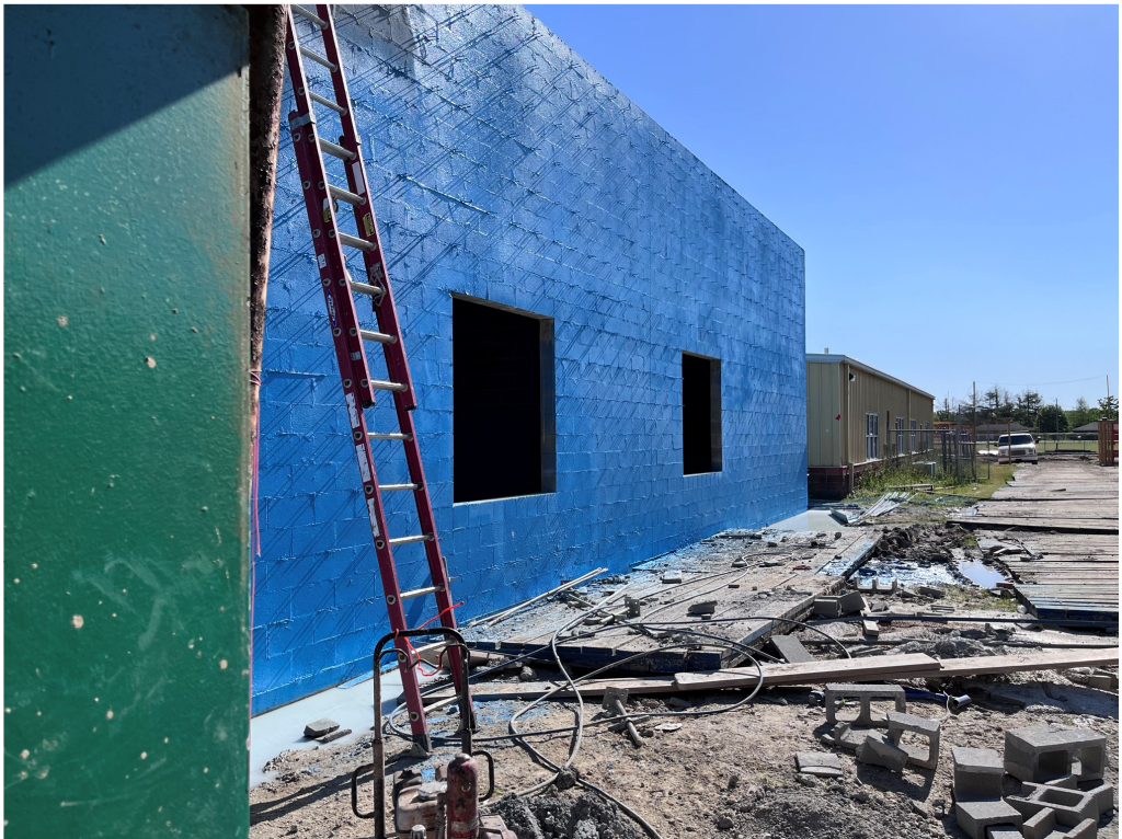
Figure 14 – TEHS Waterproofing