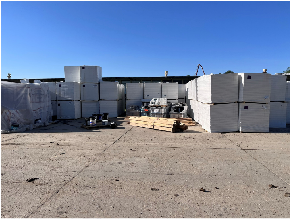
Figure 11 – GHS Roofing Stored on Site