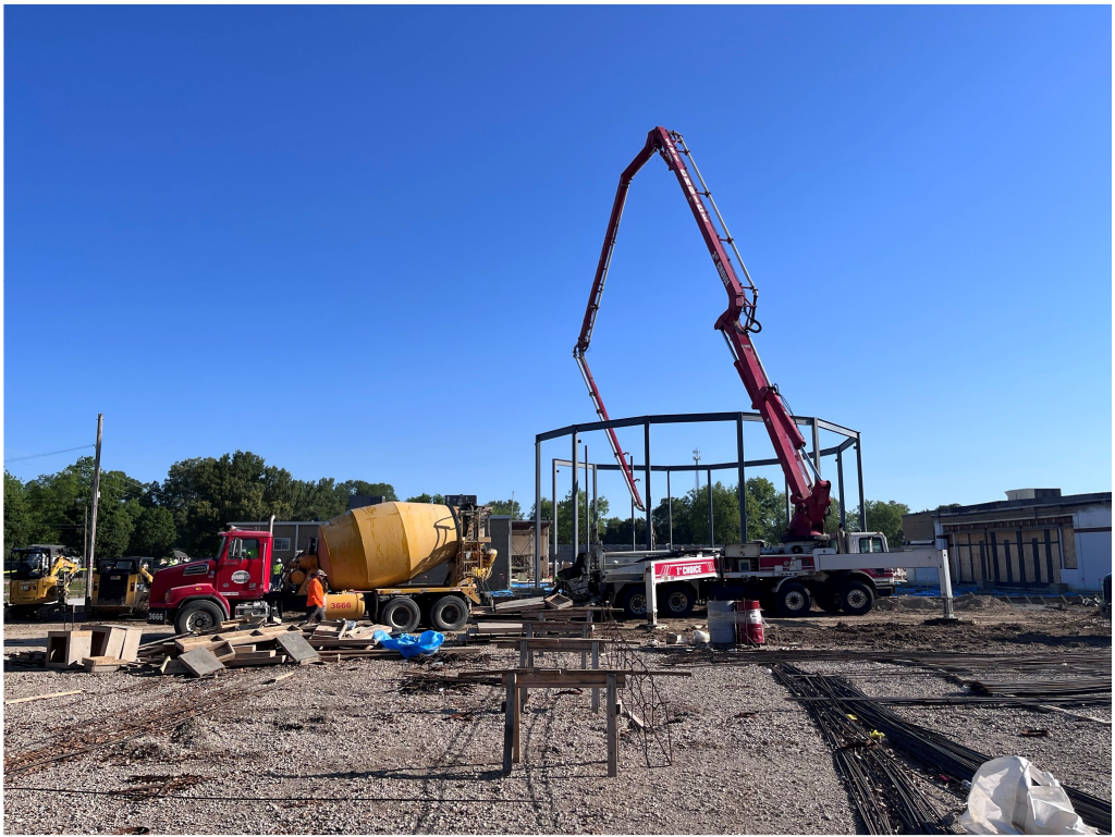
Figure 1 – GHS Concrete Install