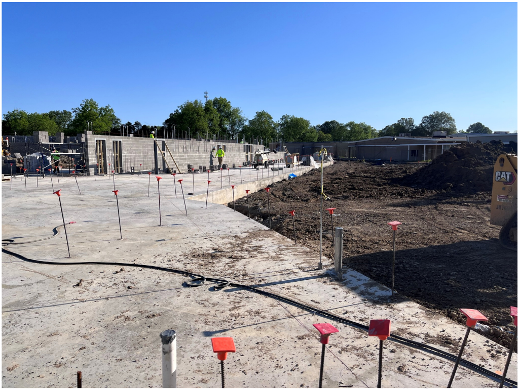
Figure 3 – GHS State of Central Corridor