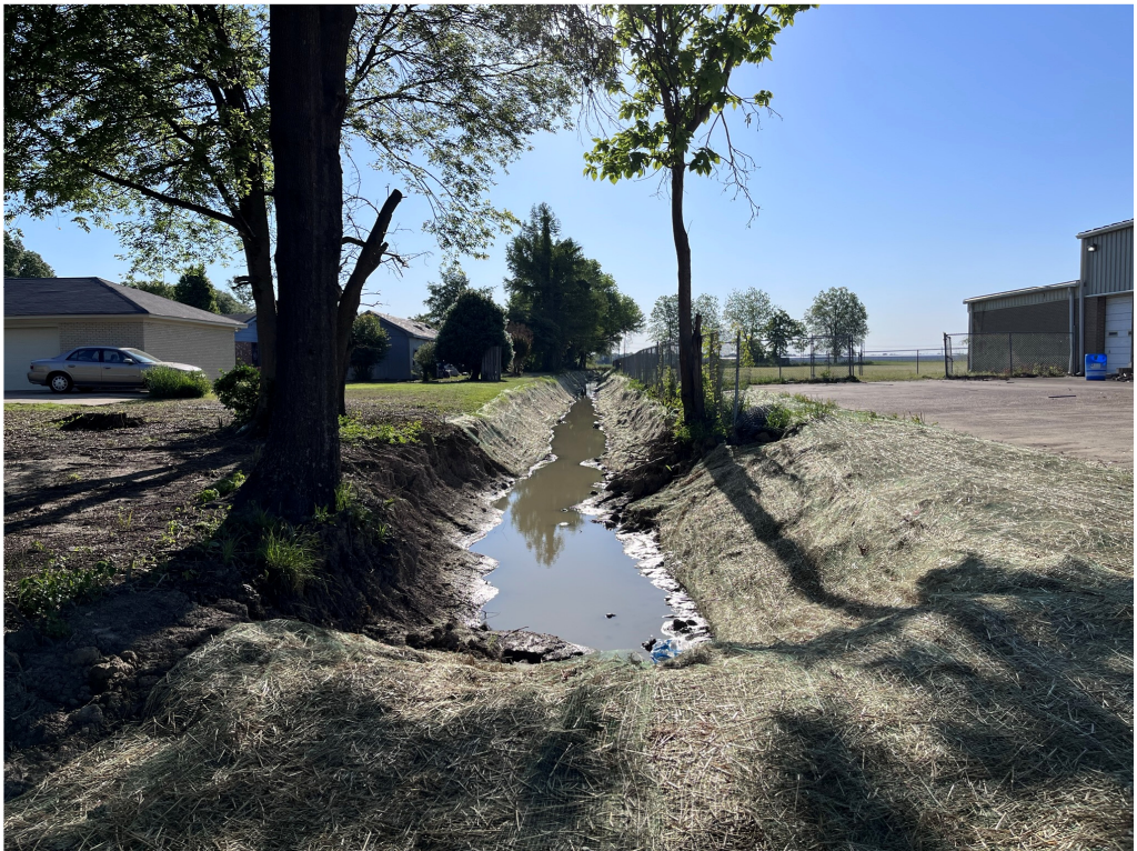
Figure 12 – GHS State of NE Ditch