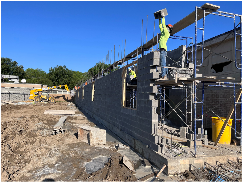
Figure 7 – GHS Masonry Work at North Corridor