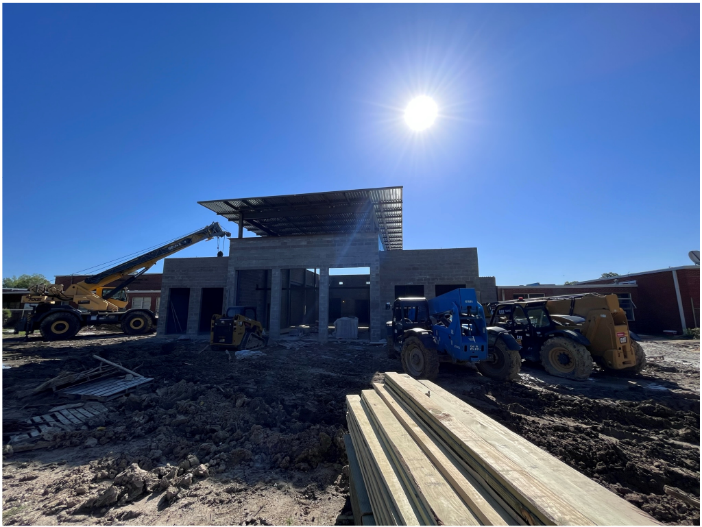
Figure 13 – TEHS Front of Site