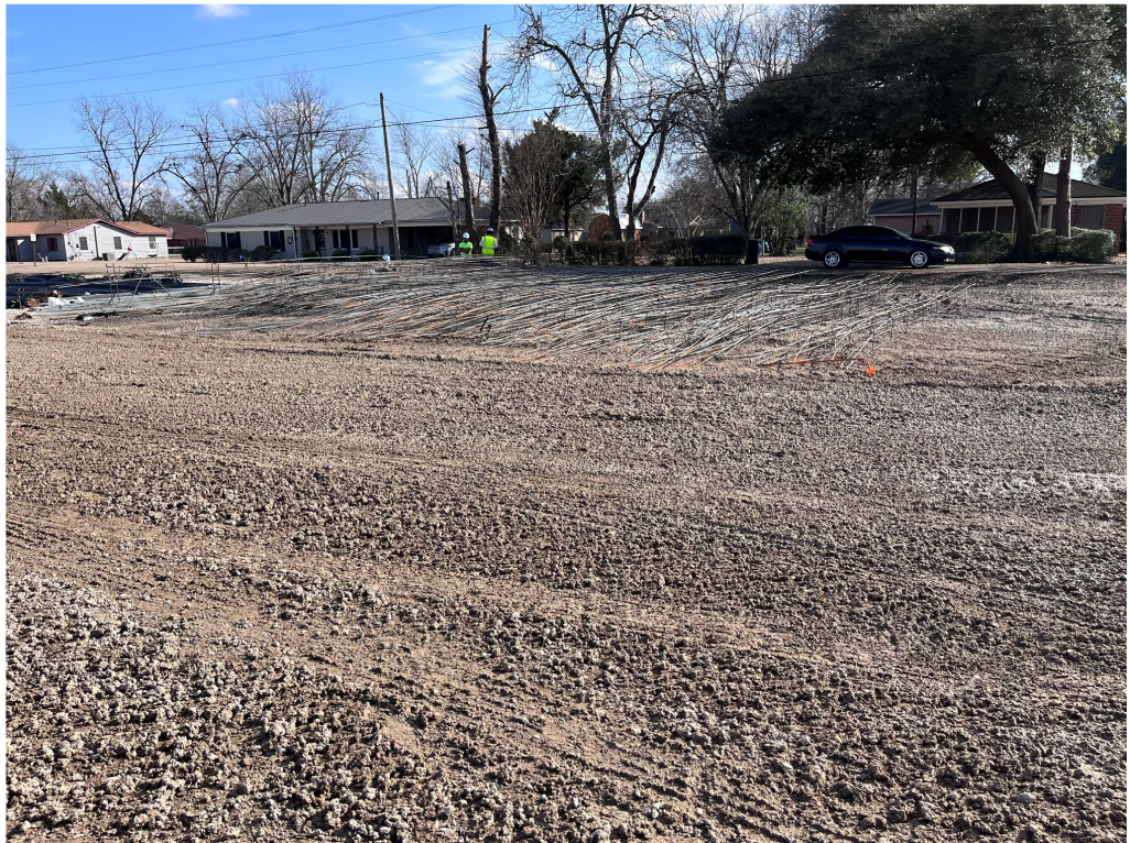
Figure 24 – Parking Lot to be used as yard until near end of work