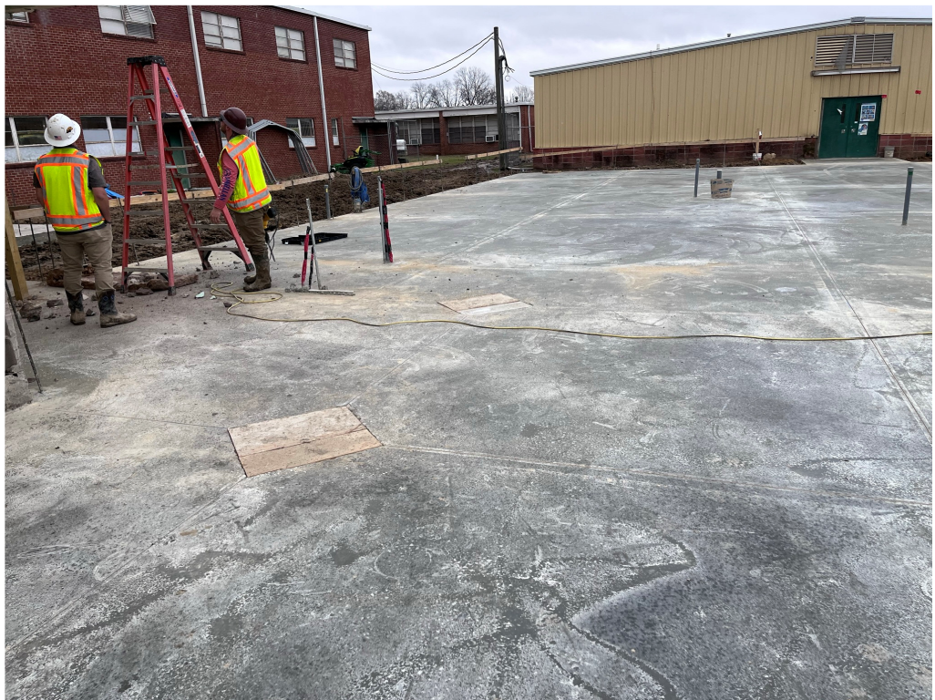
Figure 8 – Slab at Class rooms