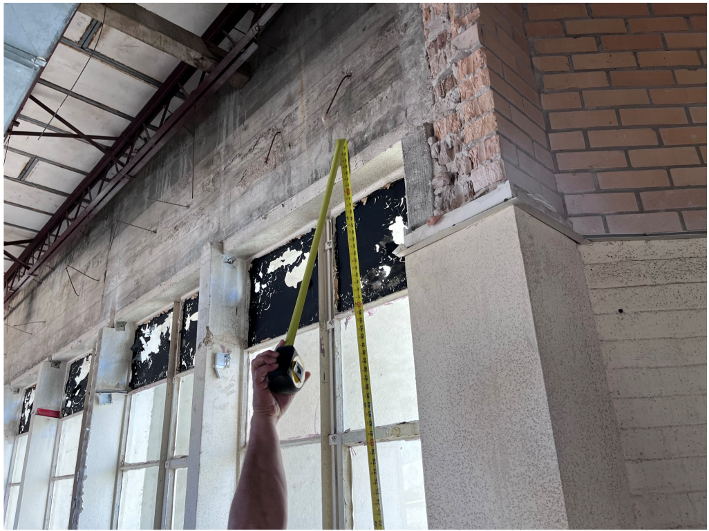
Figure 23 – Ceiling at existing to be above existing windows