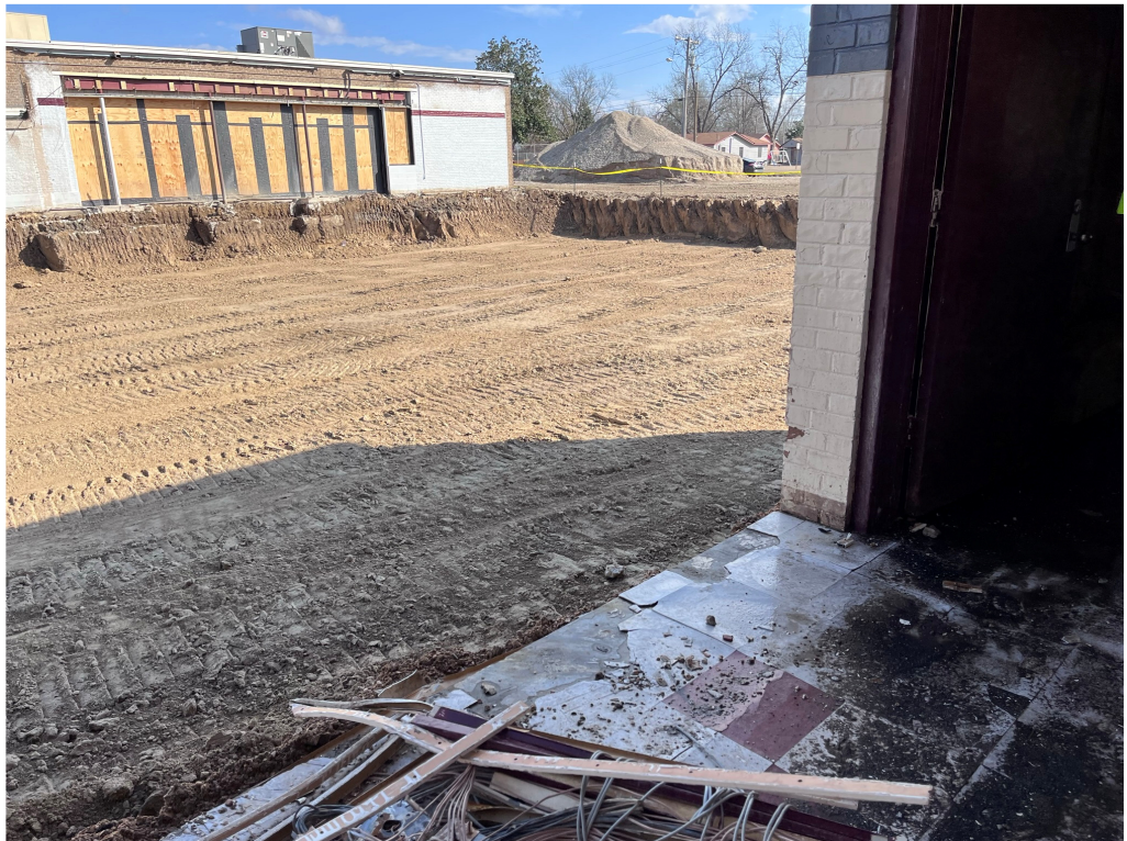
Figure 20 – Undercut for foundation dirt between cafeteria and existing admin