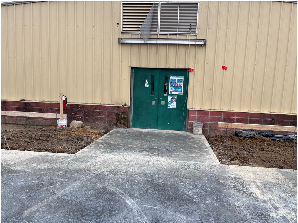
Figure 14 – New slab properly centered here on existing to remain