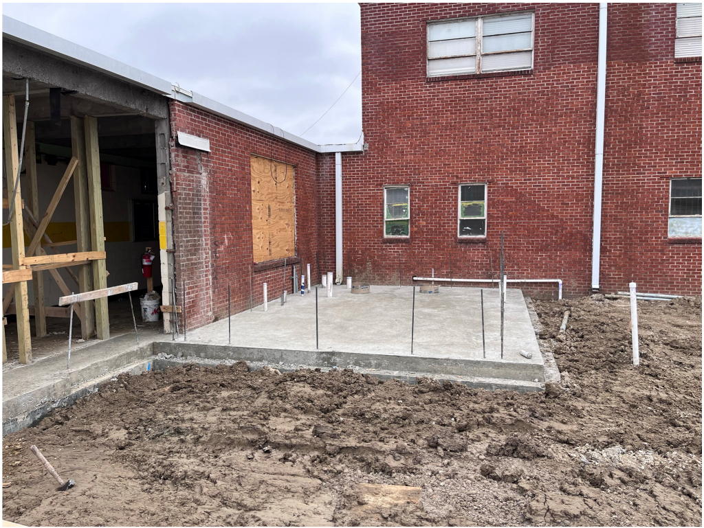
Figure 13 – foundation at new toilet room