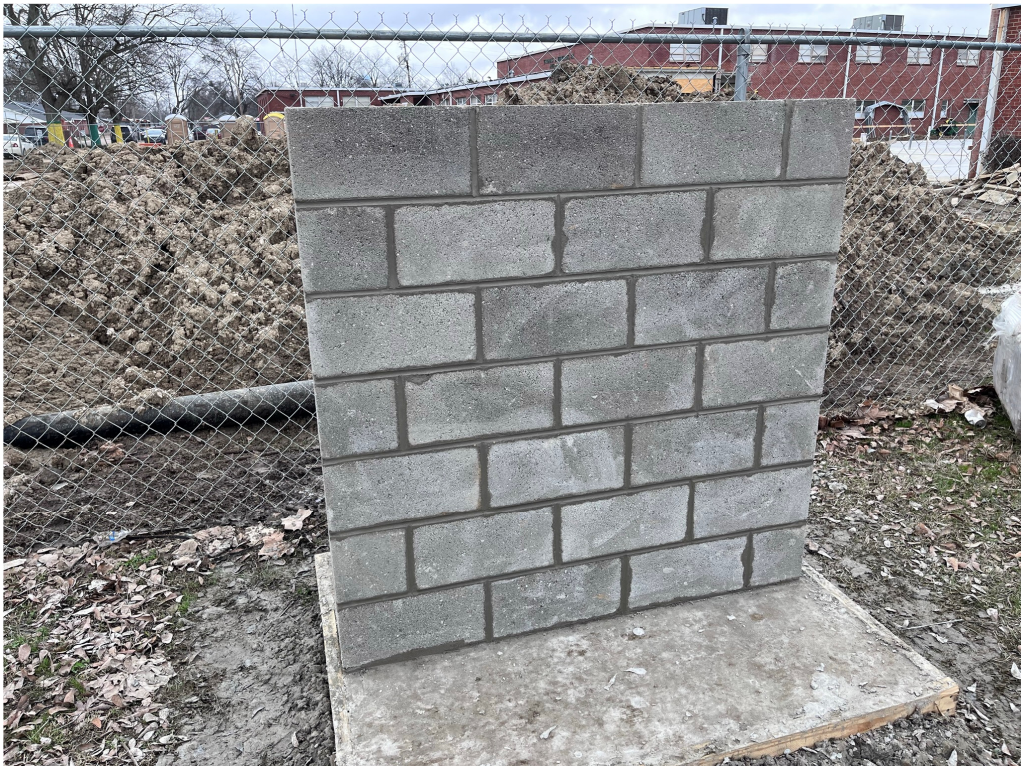
Figure 2 – Masonry Mock up