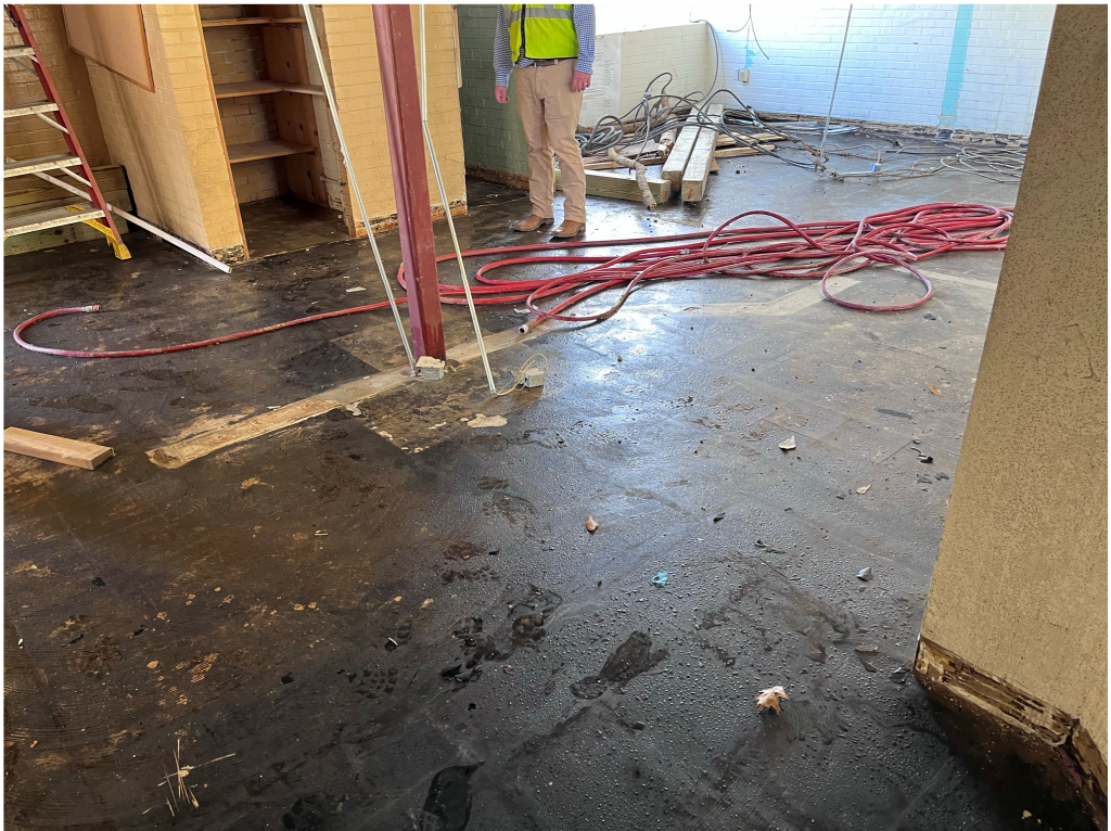
Figure 22 – Existing to remain