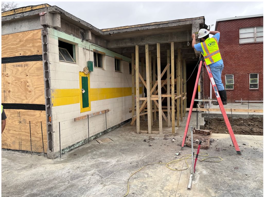
Figure 12 – Clean up work on existing to be tied in to