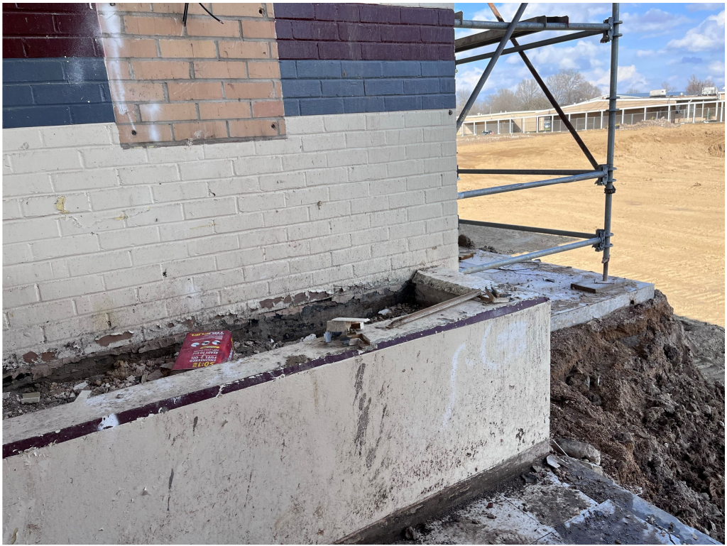
Figure 21 – Existing to remain