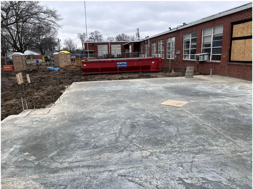
Figure 6 – lobby and conference slab