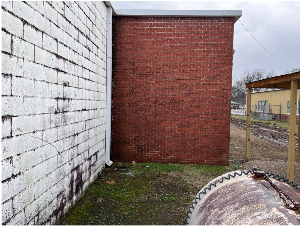
Figure 15 – Previous storage to be demolished and now to be kept on the left here