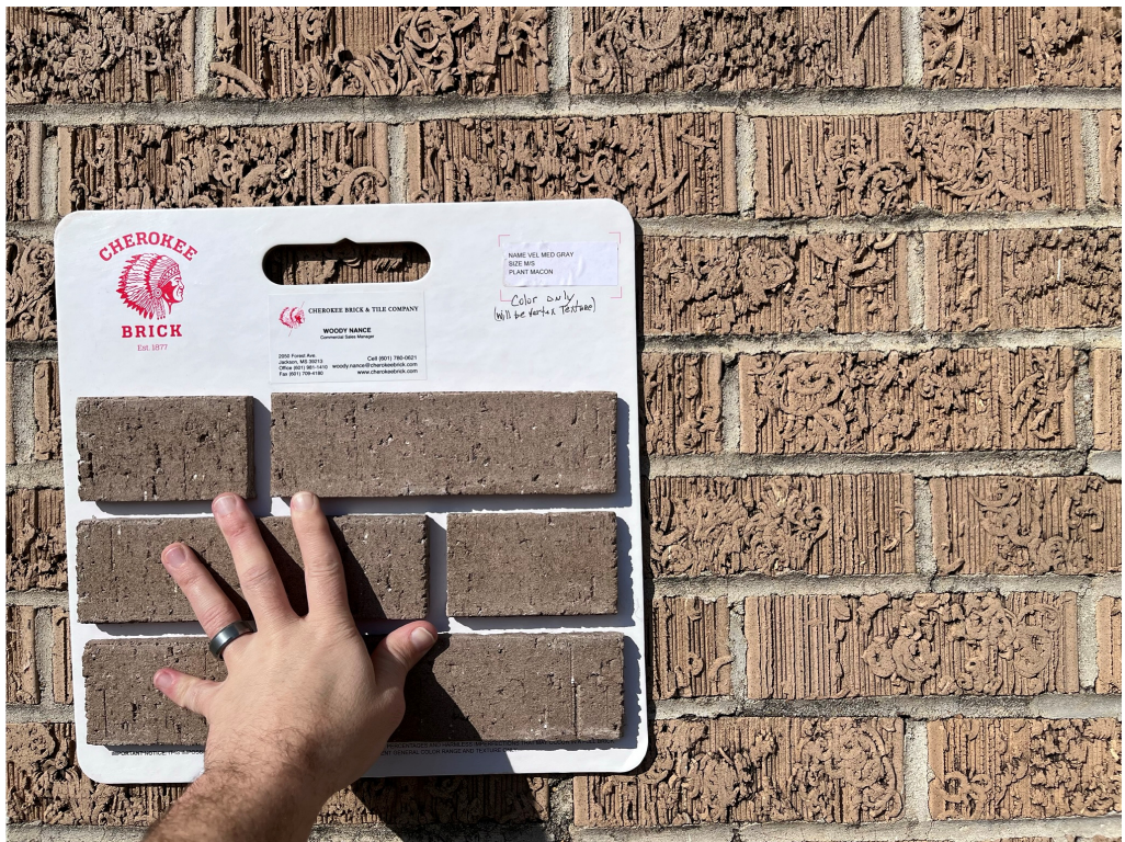
Figure 19 – Brick too dark and needs more yellow