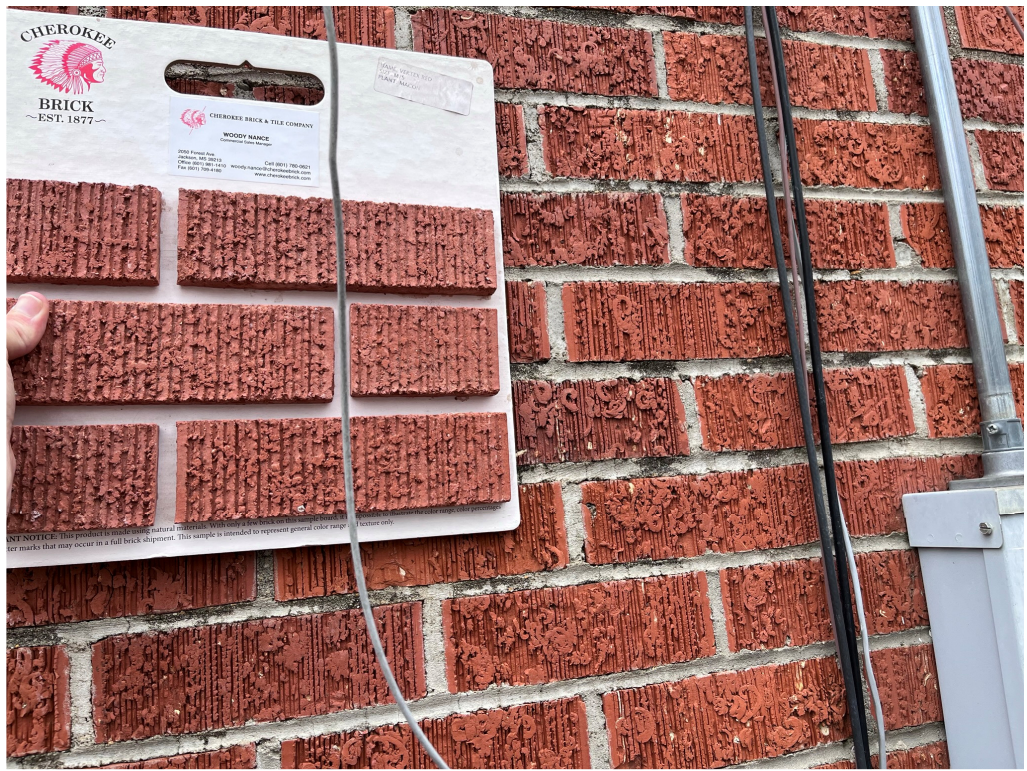
Figure 3 – Matching brick for Thomas edwards