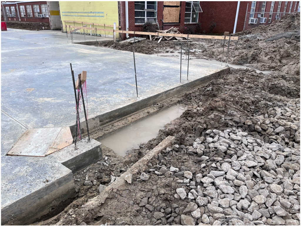
Figure 5 – Reinforcing needs protection at top