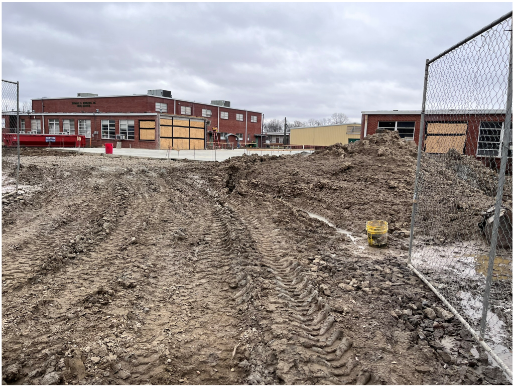
Figure 1 – Entry to Thomas Edwards Construction Site