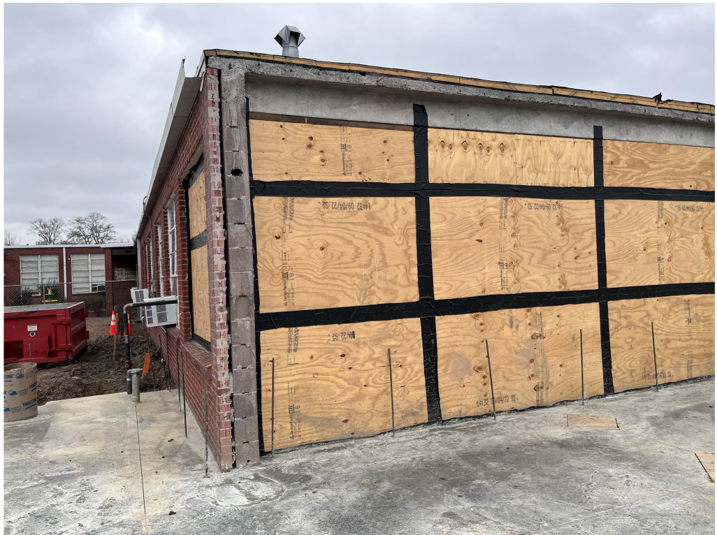
Figure 7 – North Wing connection to remain