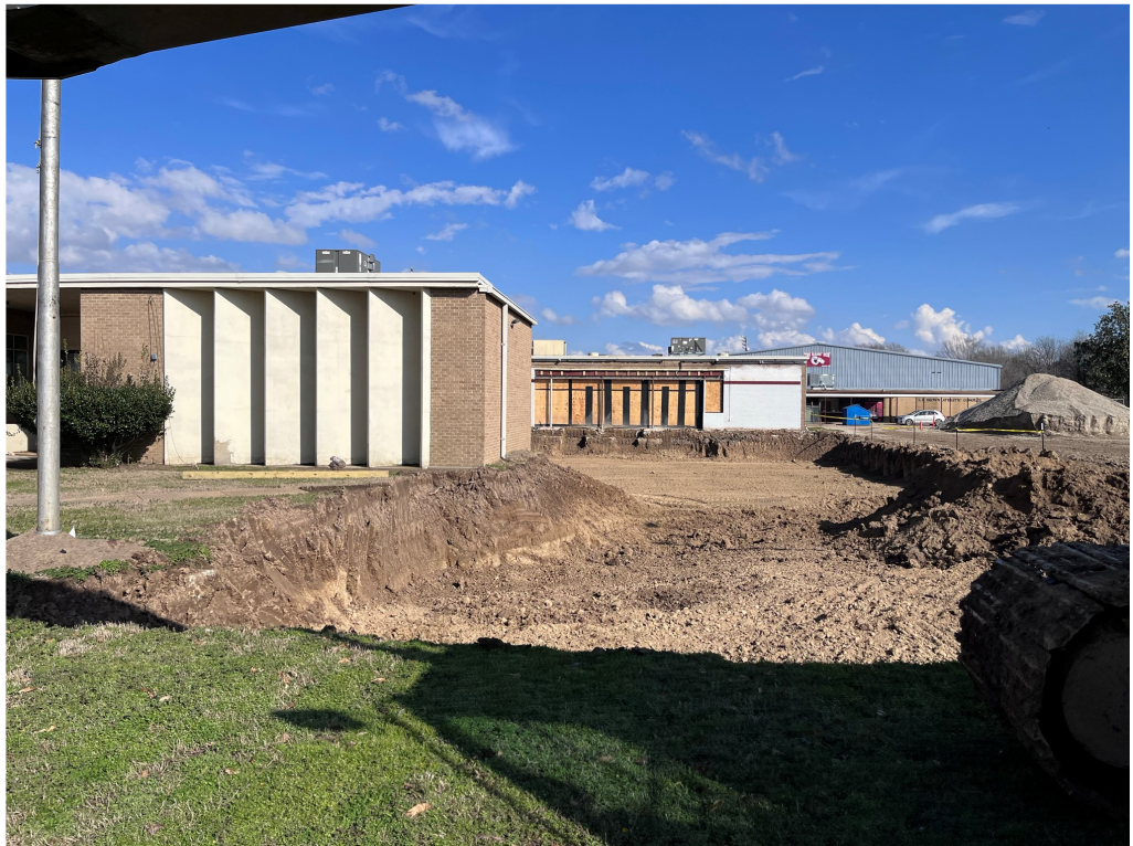
Figure 18 – Existing to Remain