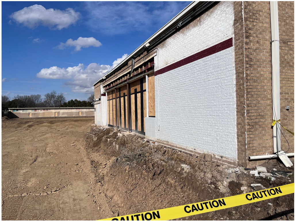
Figure 17 – Cafeteria connection existing to new