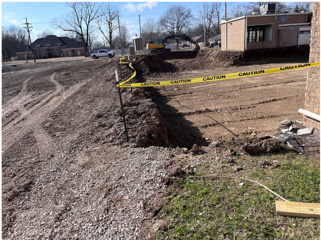
Figure 16 – Undercut for New Foundation