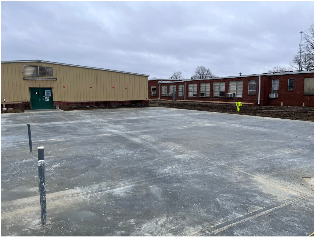
Figure 9 – Slab at Class rooms