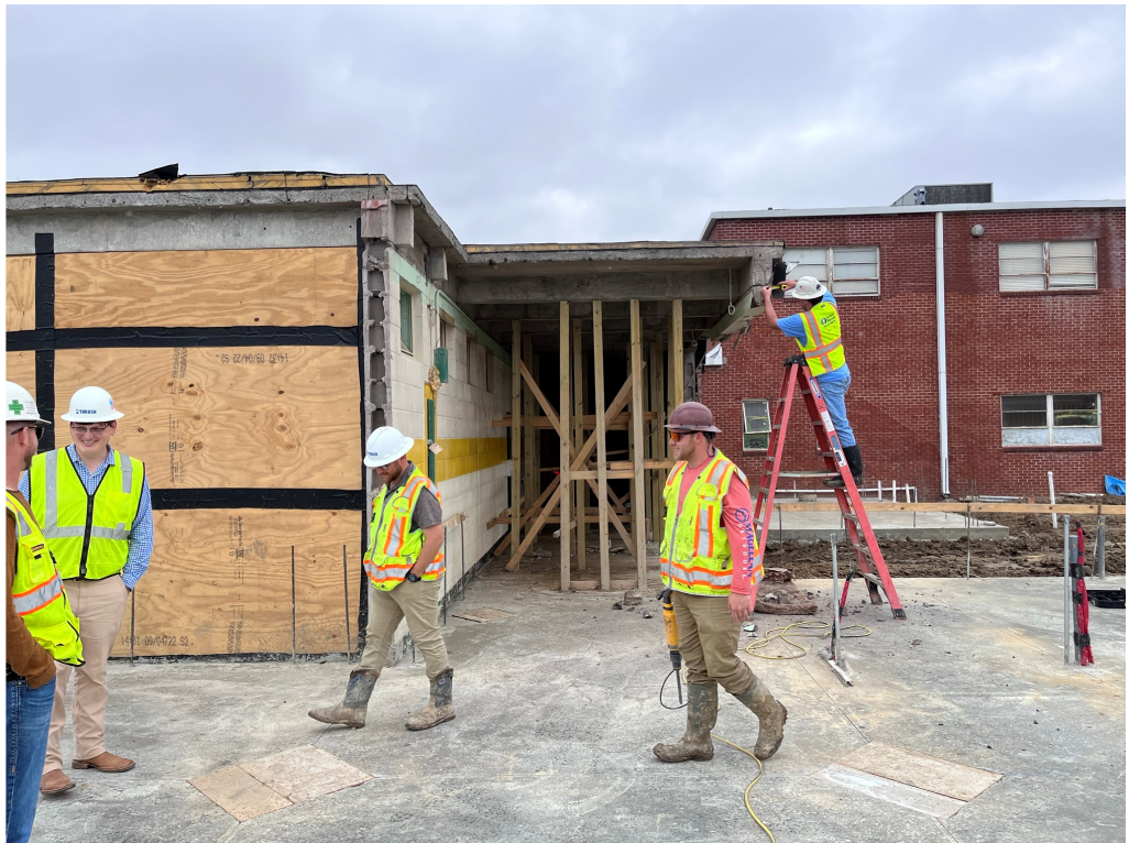
Figure 11 – north section to remain