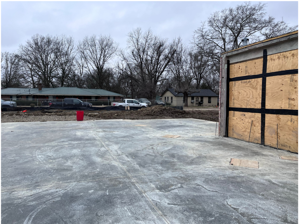
Figure 10 – Slab at new lobby and connection to north existing wing