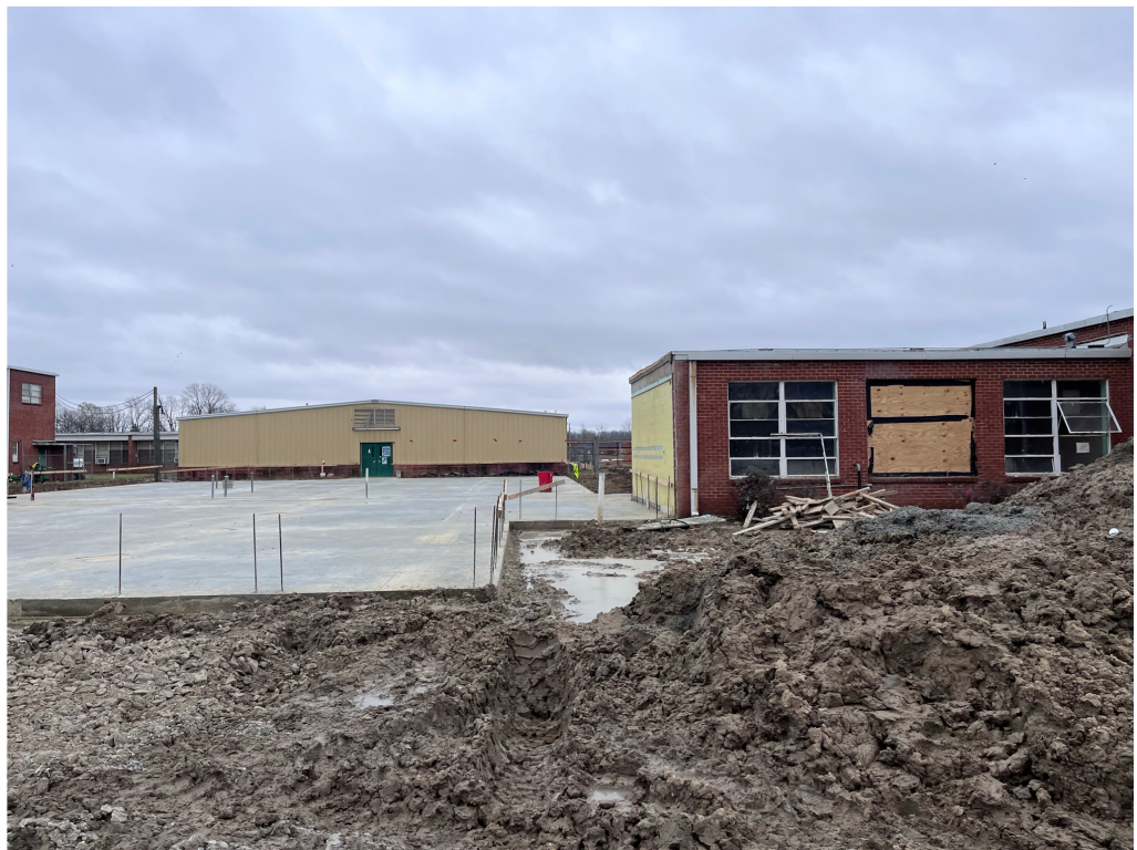
Figure 4 – South wing of existing to remain at new slab