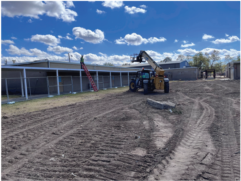
Figure 9 – Workers at Middle Yard