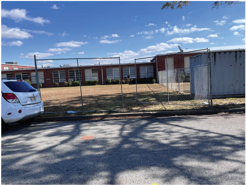
Figure 3 – Construction Fencing not Secured