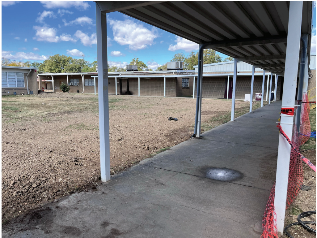
Figure 13 – East courtyard by Job Trailer