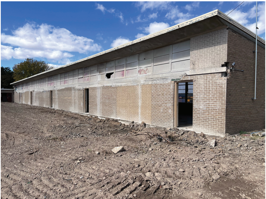
Figure 8 – Saw Cut Work at Building to remain