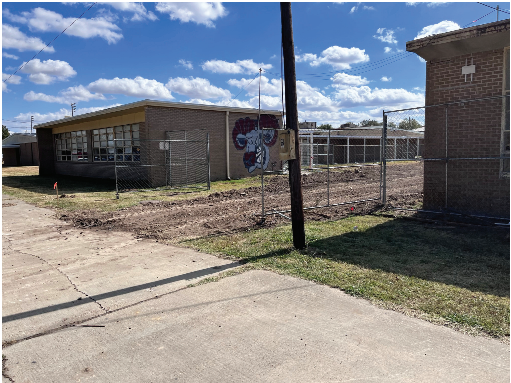
Figure 6 – Main Construction Entry to Yard