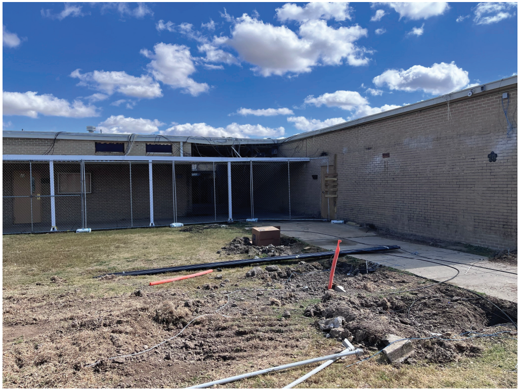
Figure 11 – Ongoing Service Work