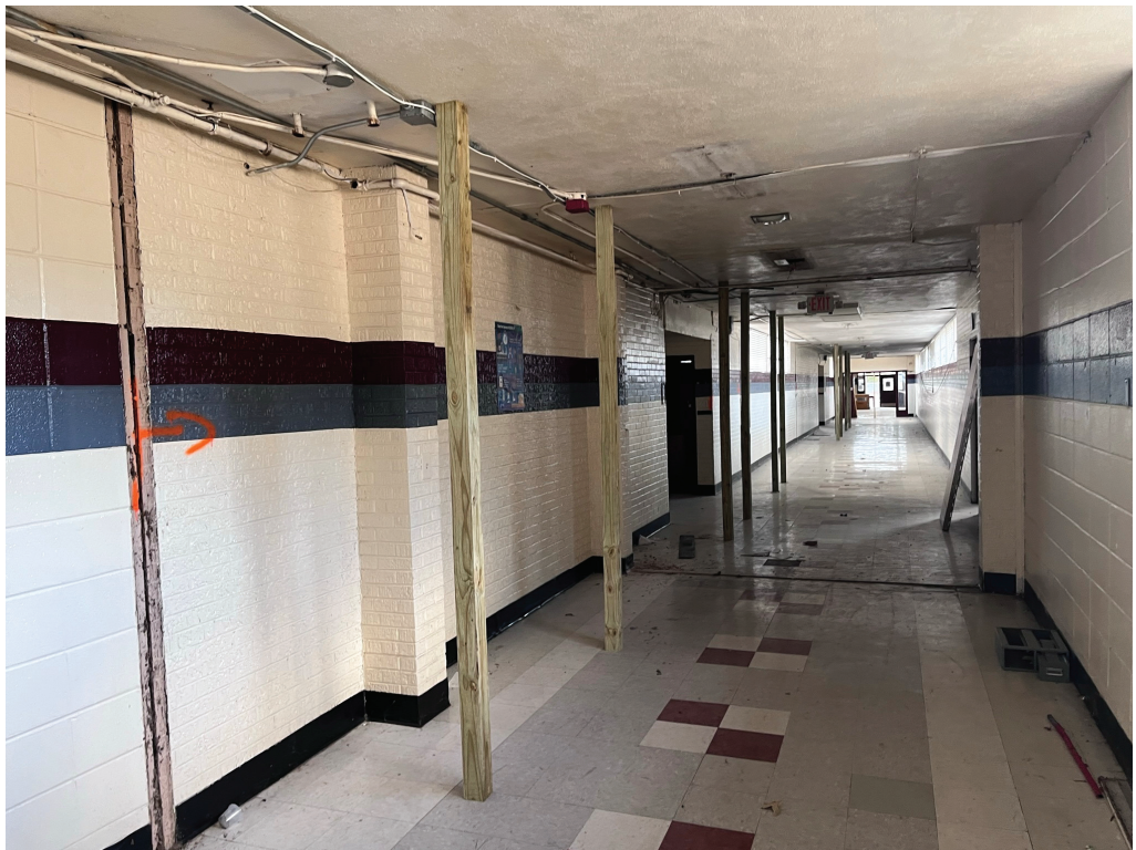
Figure 22 – Temporary posts Installed