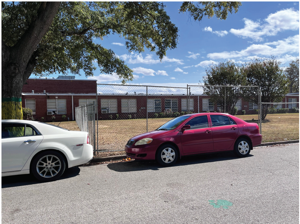
Figure 2 – Construction Fencing