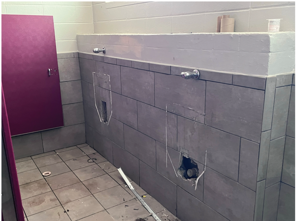
Figure 14 – Fixtures removed per Alternate 8