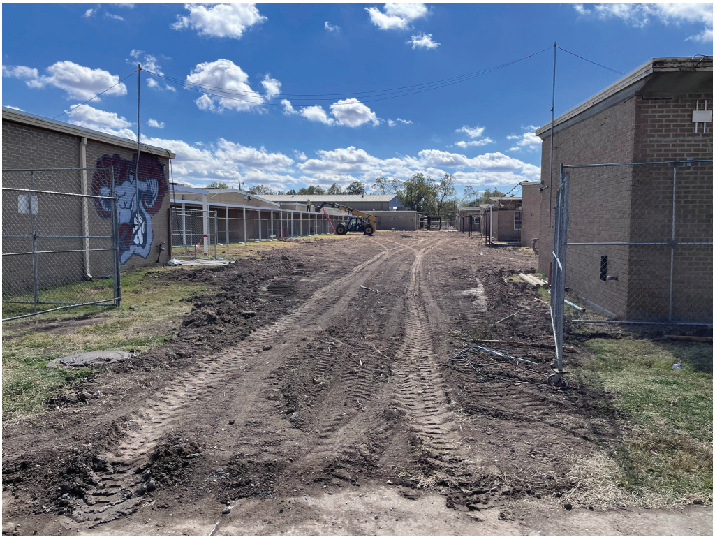
Figure 7 – Main Construction Entry to Yard