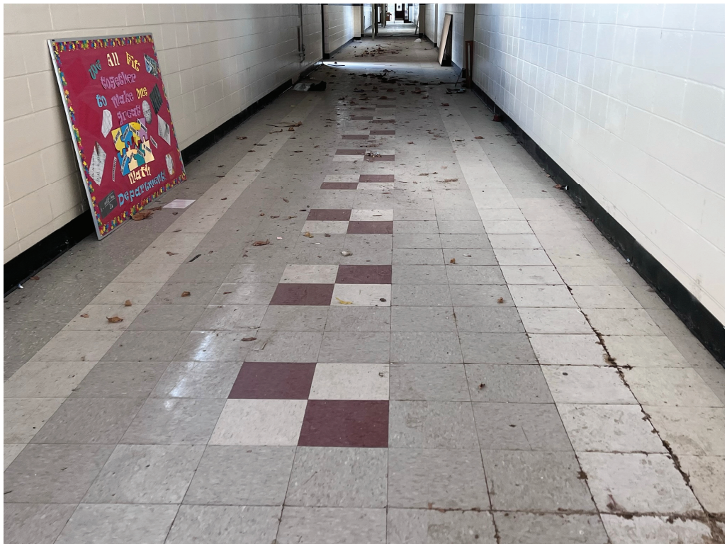
Figure 16 – Hall to remain