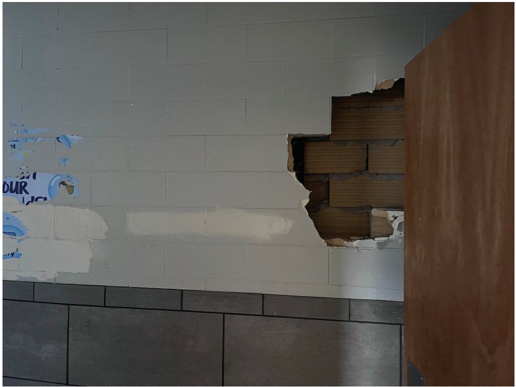
Figure 19 – Damage to unprotected Finishes to remain shall be repaired by contractor