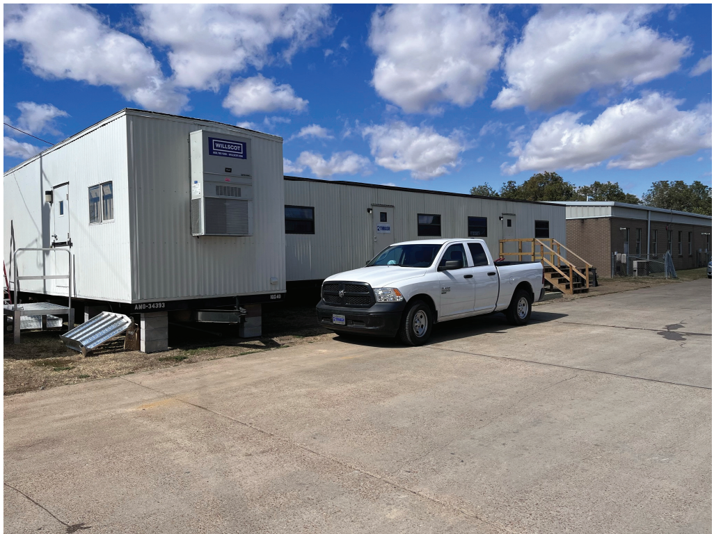
Figure 12 – Job Trailers