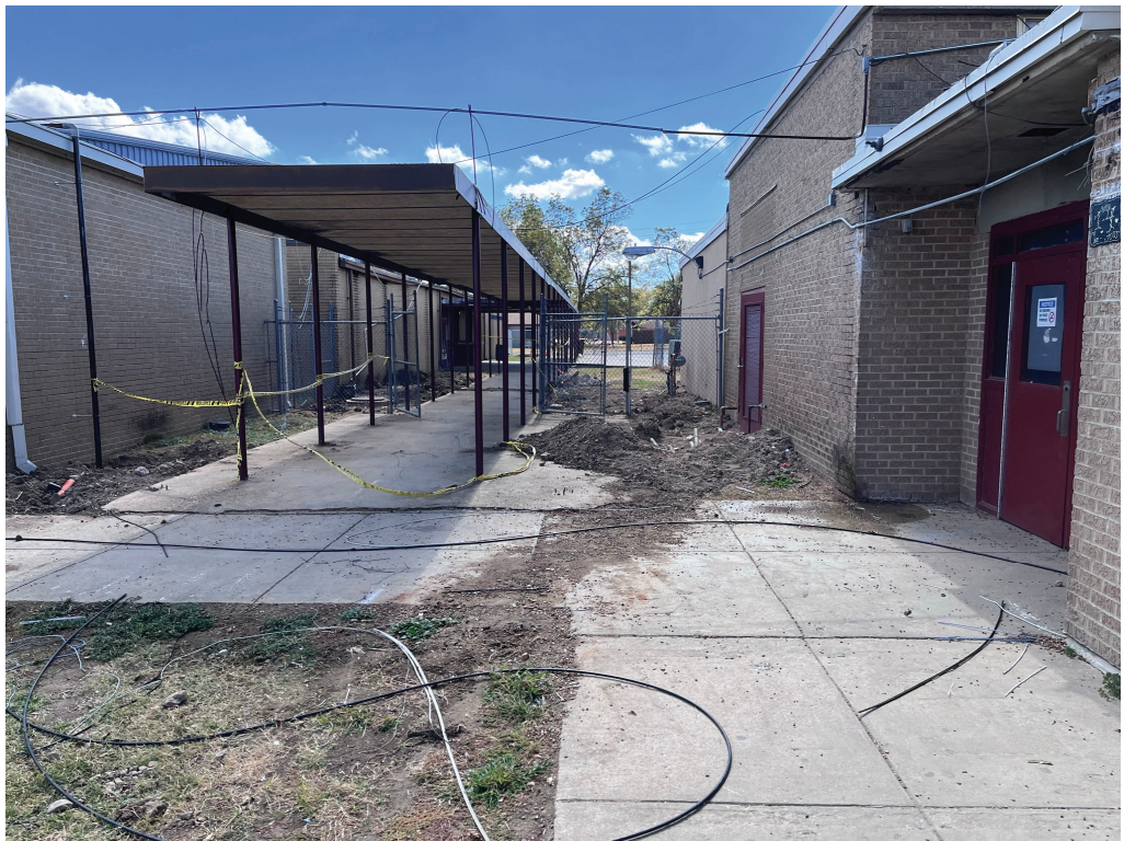
Figure 10 – Ongoing Service Work