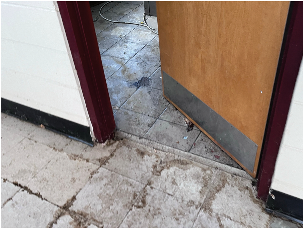
Figure 17 – Damage to unprotected Finishes to remain shall be repaired by contractor