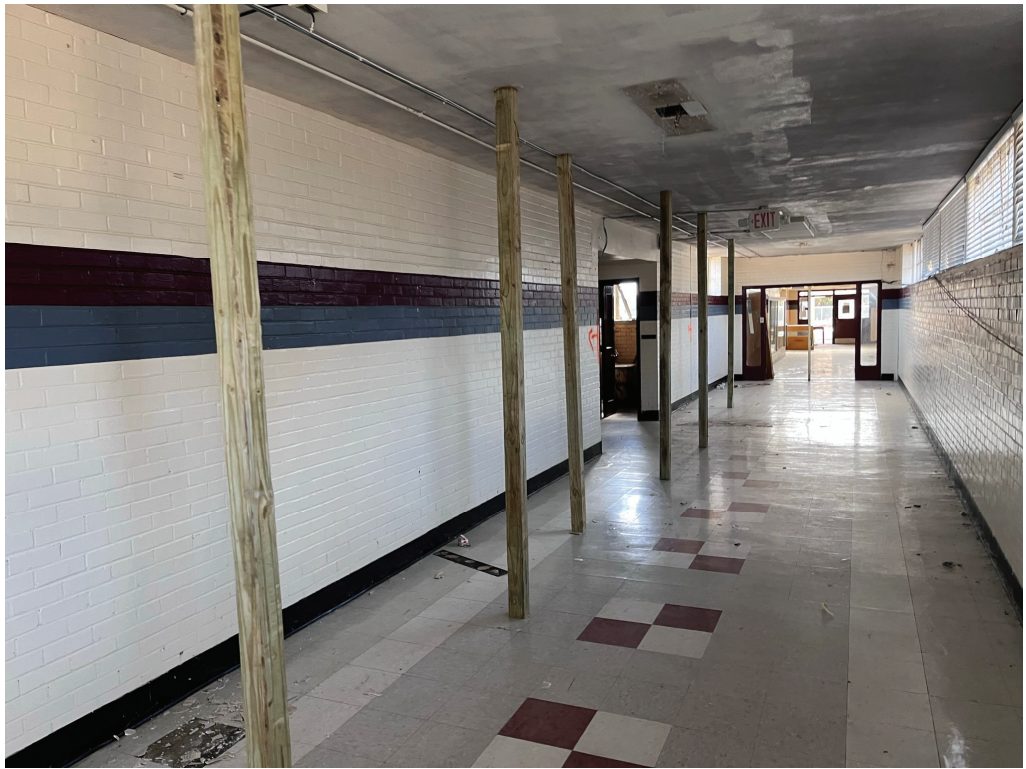
Figure 21 – Temporary posts Installed