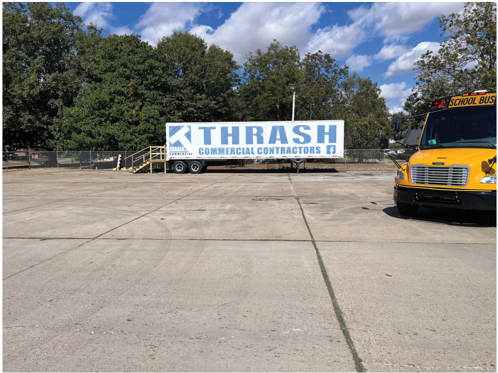
Figure 5 – Contractor Signage