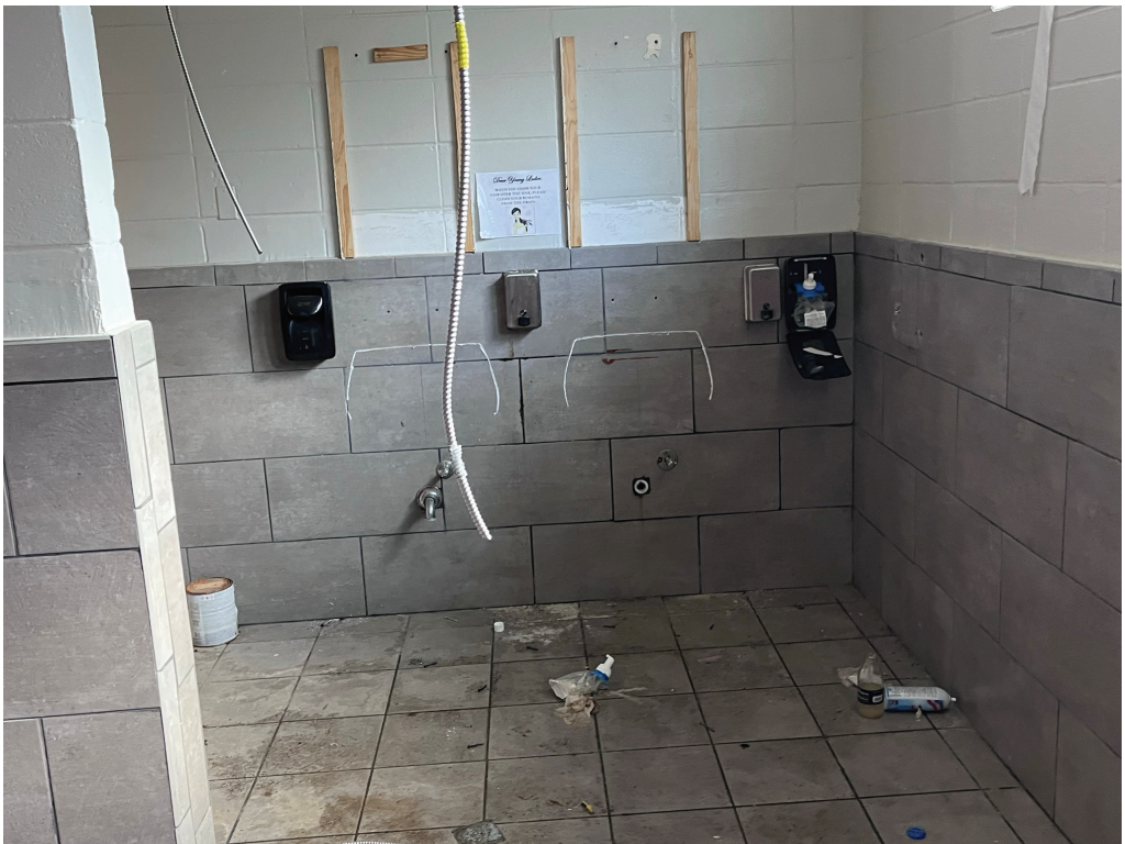
Figure 18 – Damage to unprotected Finishes to remain shall be repaired by contractor