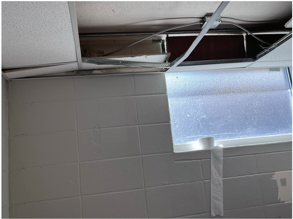
Figure 15 – Ceiling Grid Damage at Grid to remain