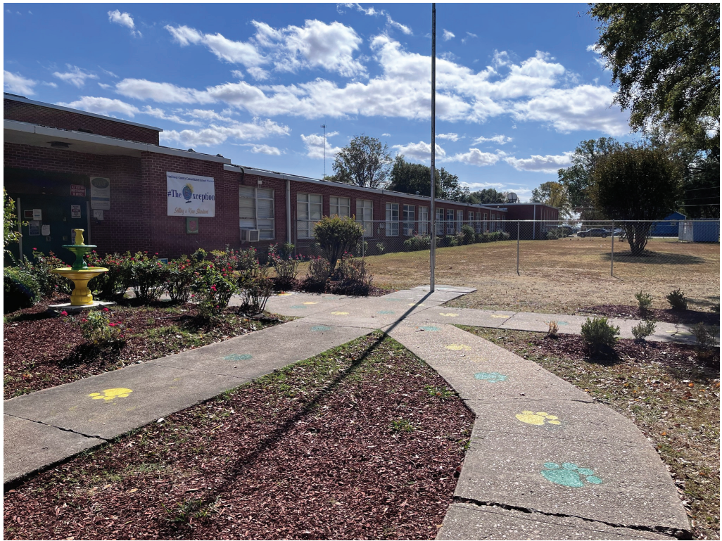
Figure 1 – Construction Fencing