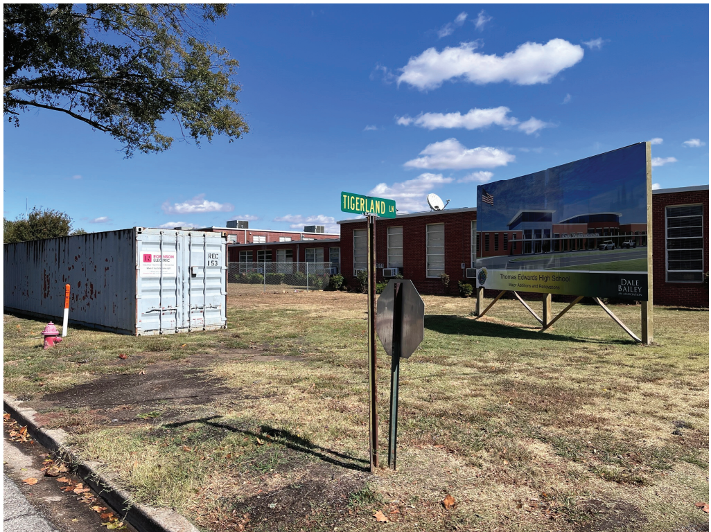
Figure 4 – Storage Container on Site at Edwards