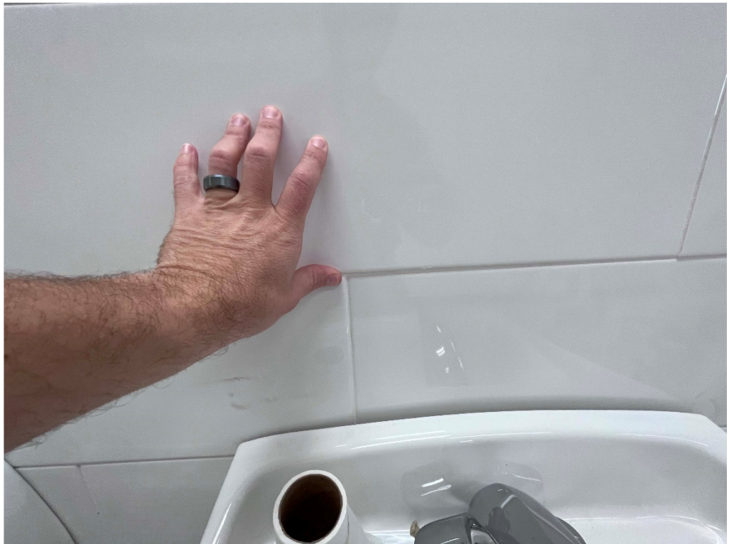
Figure 10 – Tiles throughout are not acceptable. They should be flush