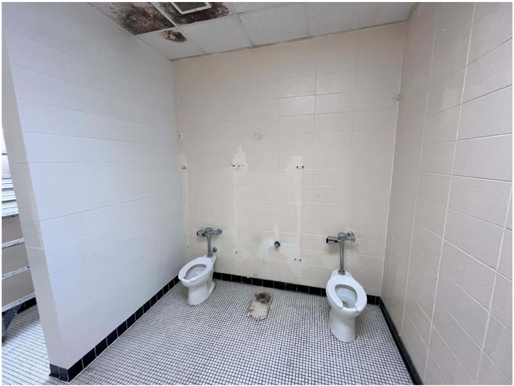
Figure 1 – grout lines should be aligned with horizontal cmu mortar lines