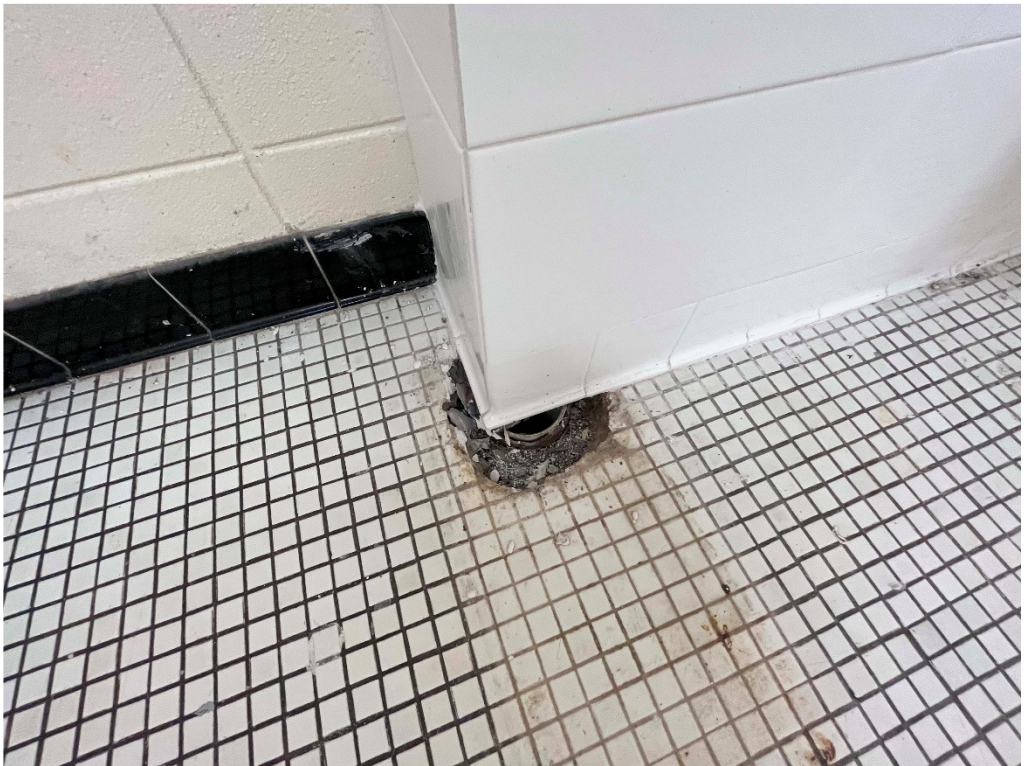
Figure 6 – Open sewer pipe should be capped below floor and sealed