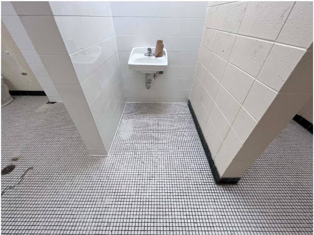
Figure 4 – lavatories should be centered in space; remove and install centered