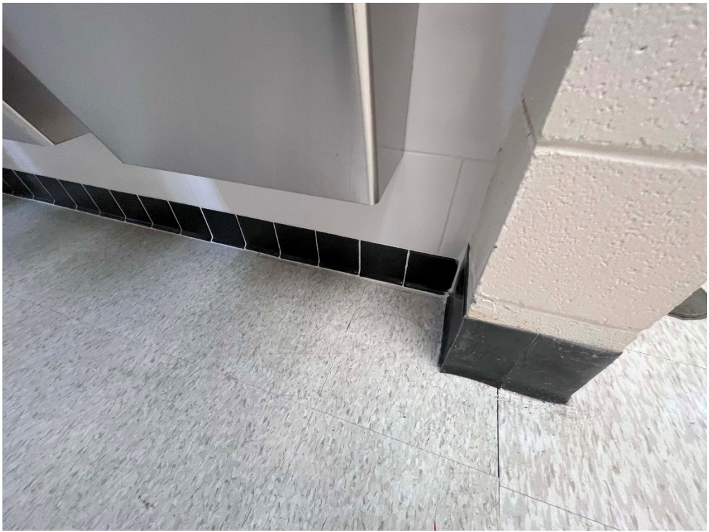
Figure 7 – specified grout for black tile is midnight black