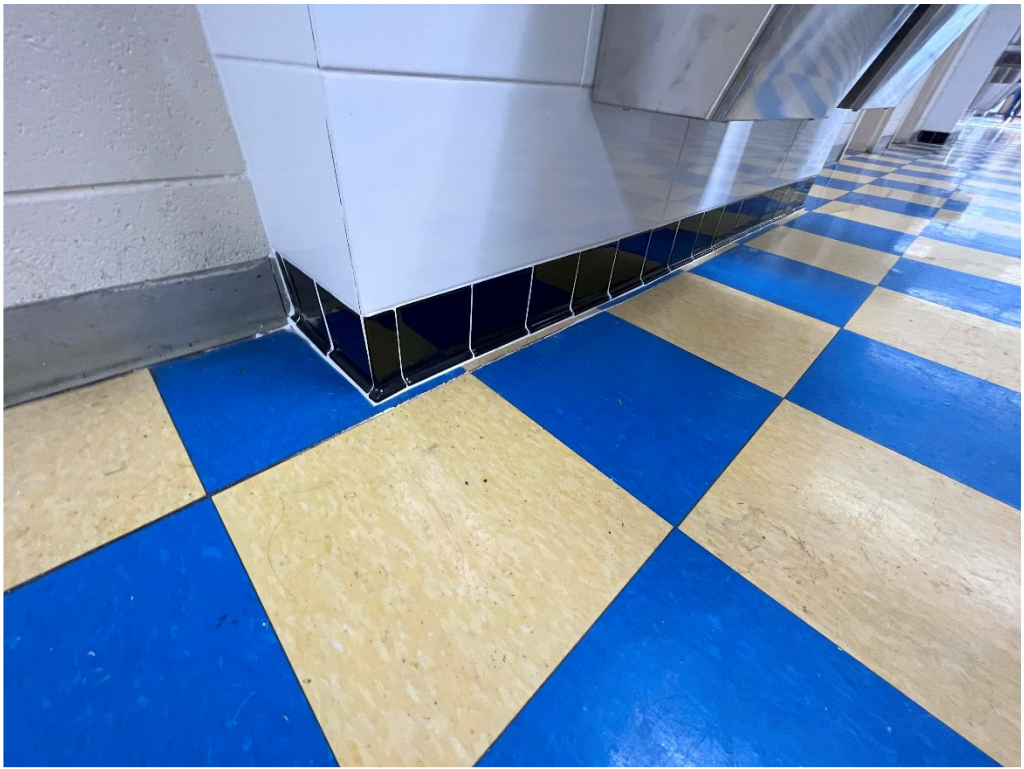
Figure 3 – specified grout is to be midnight black; replace