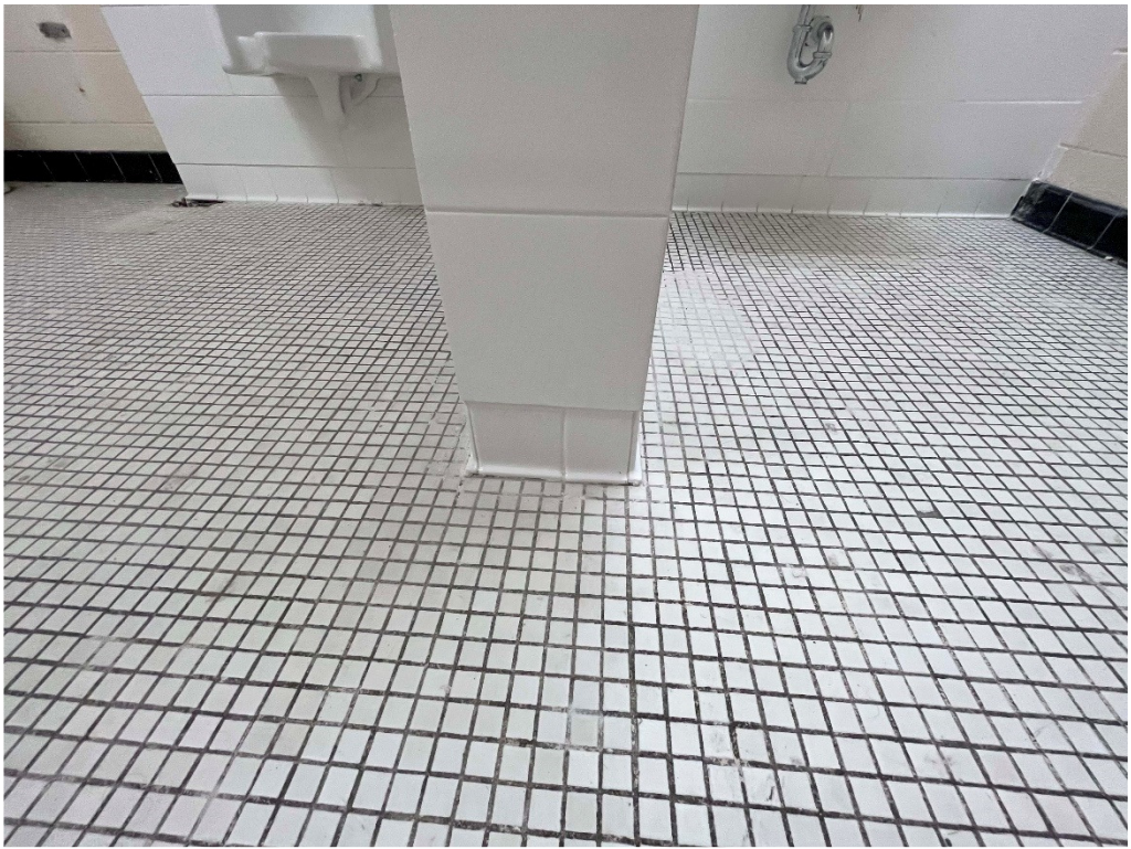
Figure 5 – Base Cove tile should be black and installed flush with wall tile