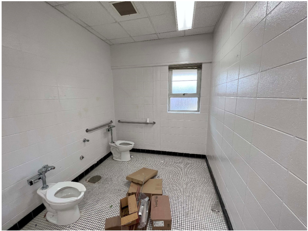
Figure 9 – Painted 1 coat only