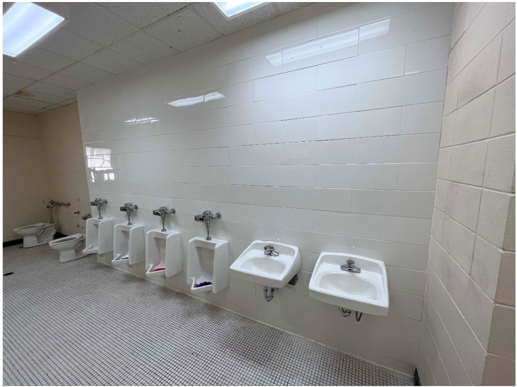
Figure 11 – This tile wall is not acceptable. Tiles should be flush and flat