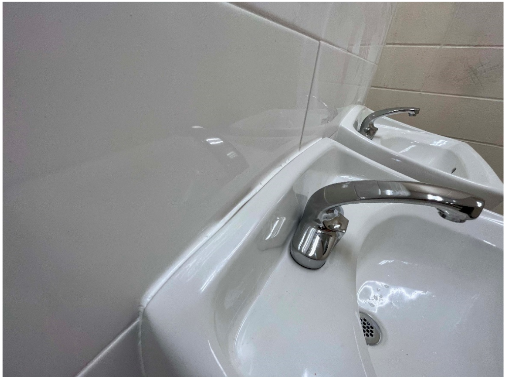
Figure 12 – Completely Fill gaps so that sealants has no recess