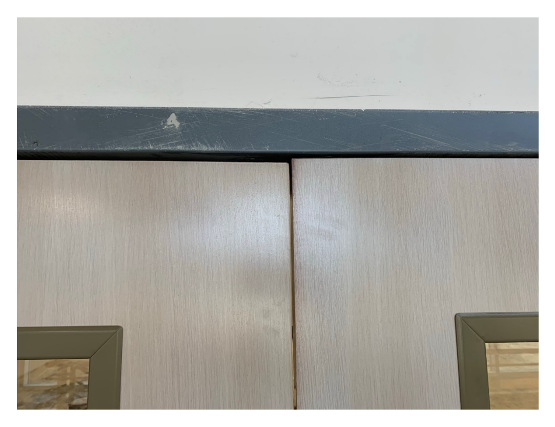
Figure 10 – Installed Double Doors (out of square and need adjustment for proper functionality and aesthetic)