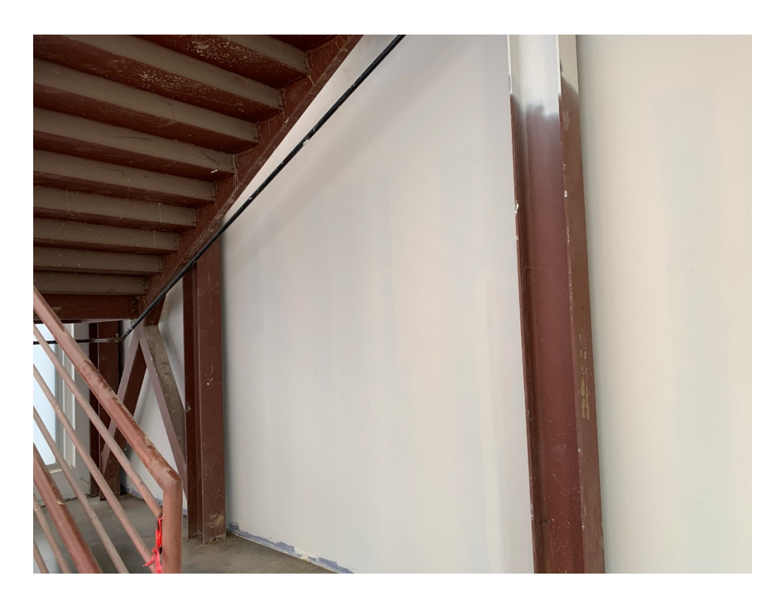
Figure 5 – Paint is Ongoing