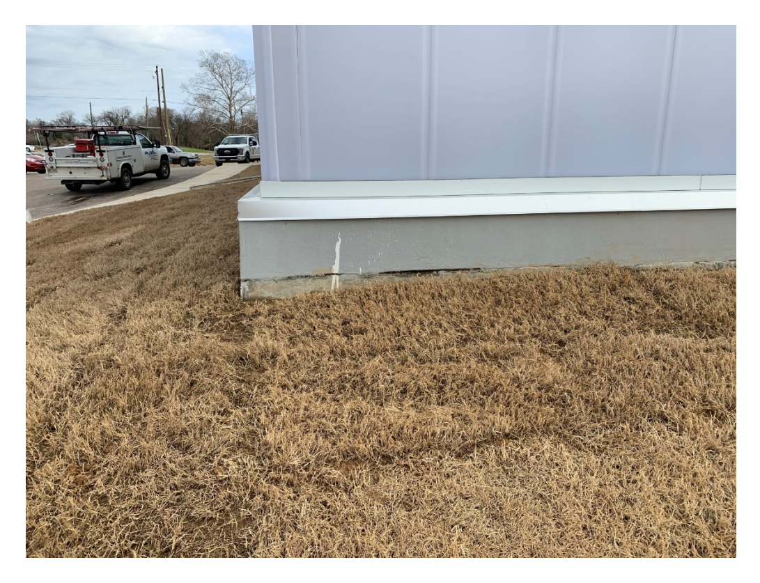
Figure 4 – Clean Up is Ongoing