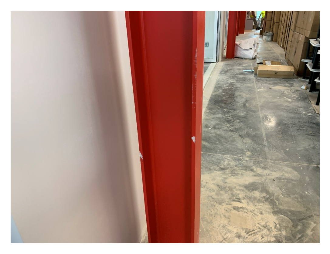
Figure 8 – Paint is Ongoing