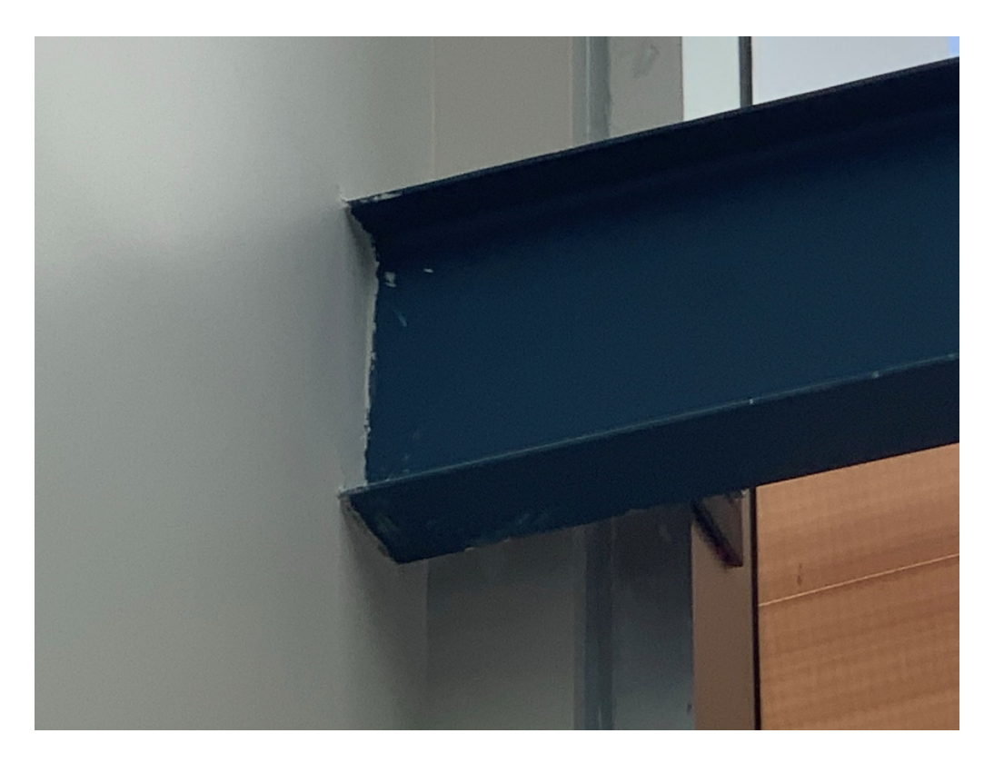
Figure 7 – Paint is Ongoing