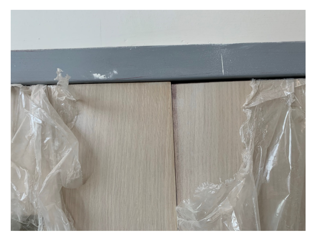
Figure 12 – Installed Double Doors (out of square and need adjustment for proper functionality and aesthetic)