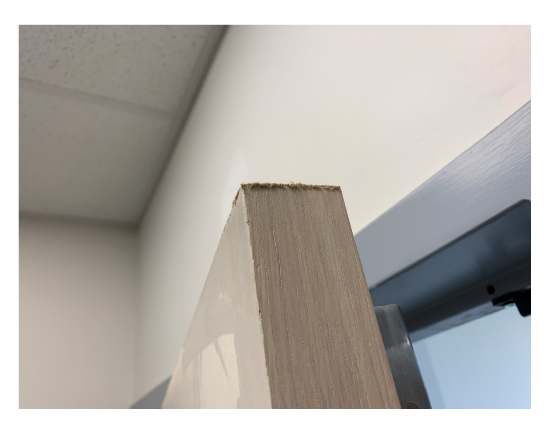
Figure 9 – Poor Carpentry at Door where cut due to Out of Square Installation