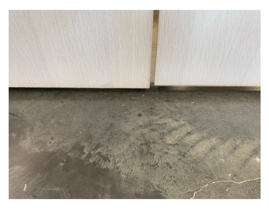
Figure 11 – Installed Double Doors (out of square and need adjustment for proper functionality and aesthetic)