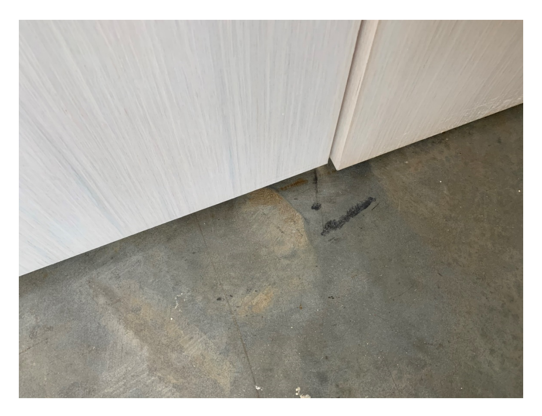
Figure 13 – Installed Double Doors (out of square and need adjustment for proper functionality and aesthetic)