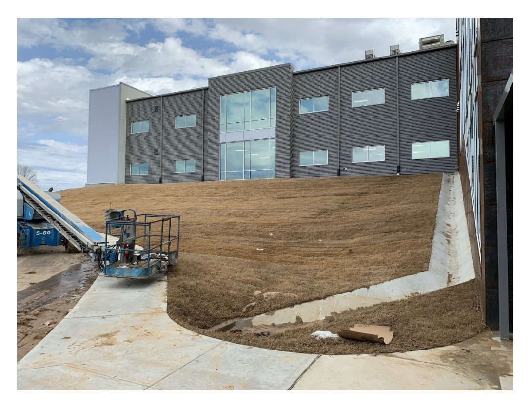
Figure 2 – Grass Installed at Site