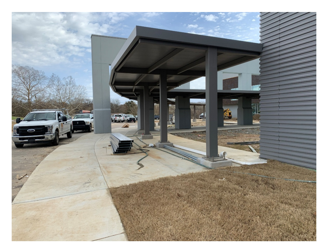
Figure 3 – Grass Installed at Site; Covered Awning Installation Appears Complete