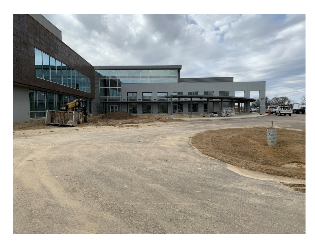
Figure 1 – Grass Installed at Site