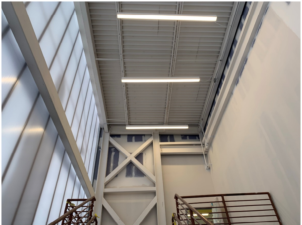
Figure 10 – Egress Stair Progress