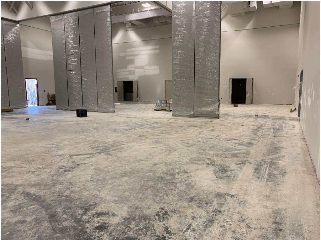
Figure 14 – Gym Progress