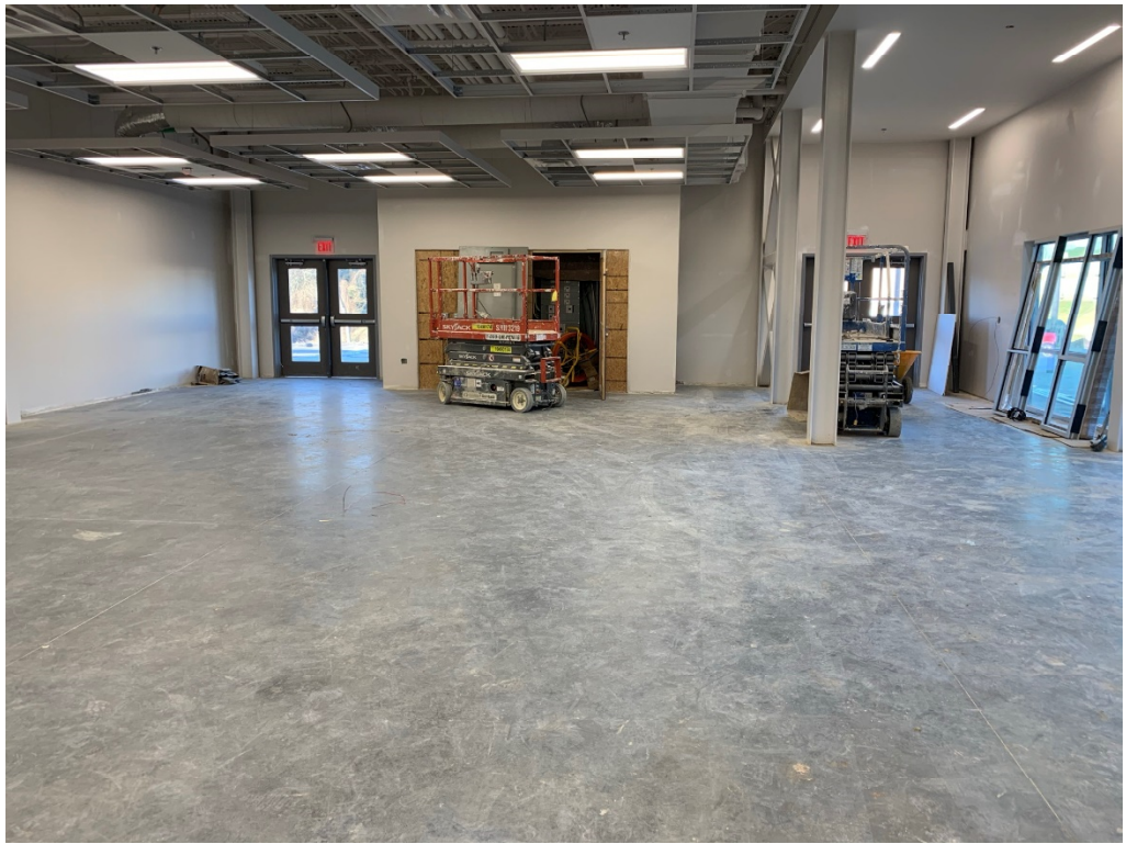
Figure 15 – Cafeteria Progress