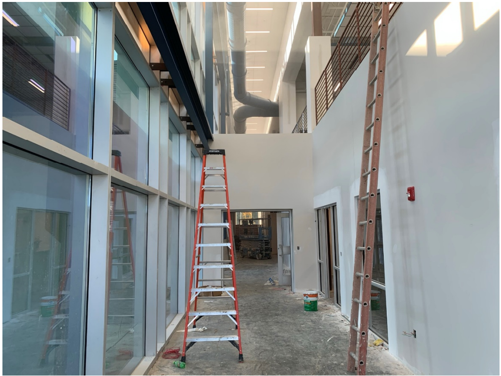
Figure 3 – North Entry