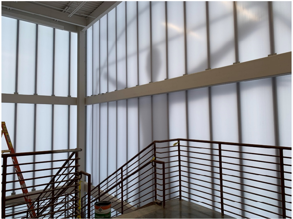
Figure 9 – Egress Stair Progress