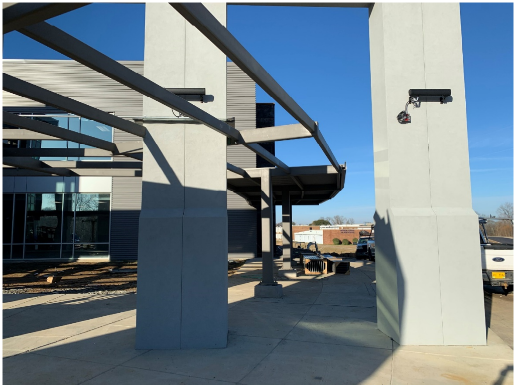
Figure 2 – Canopy Paneling is On-going (Contractor to delete light on right column)