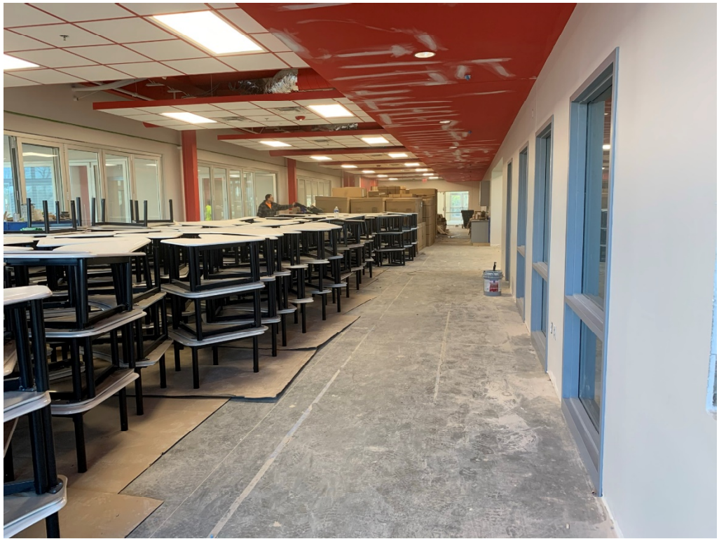
Figure 11 – Central Lower Floor Still Requires Work