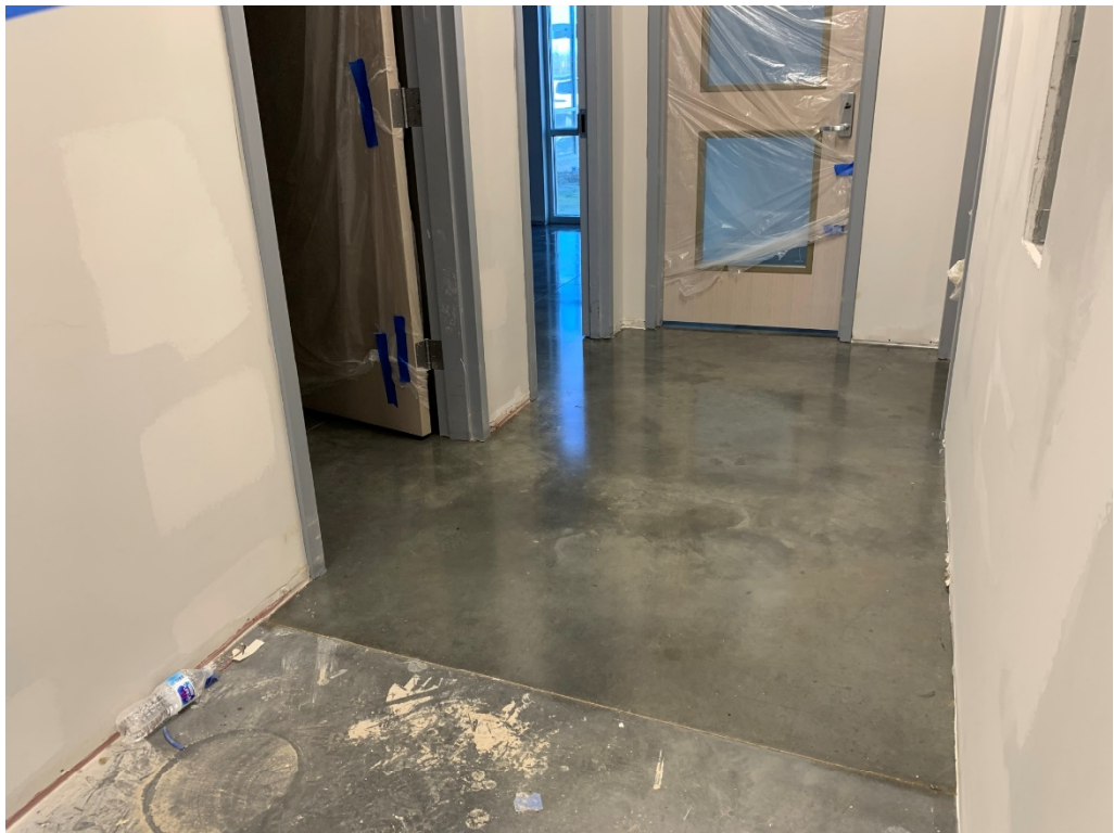
Figure 4 – Admin Area Floor Sealant