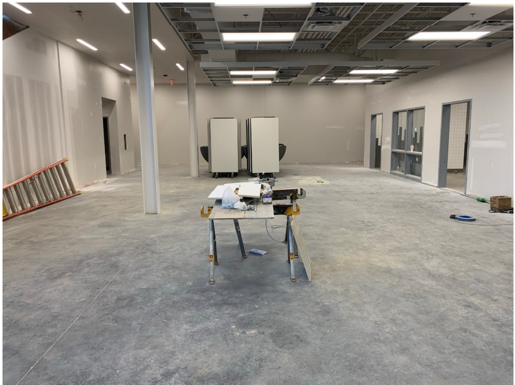
Figure 16 – Cafeteria Progress