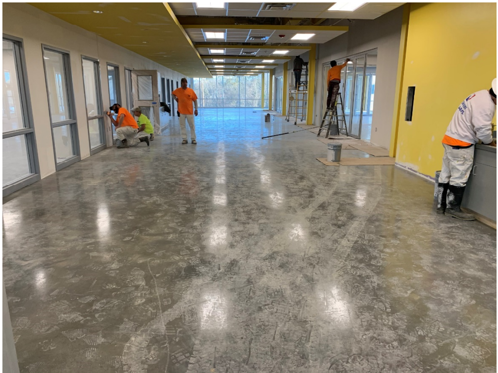
Figure 6 –Paint at Central Upper Floor