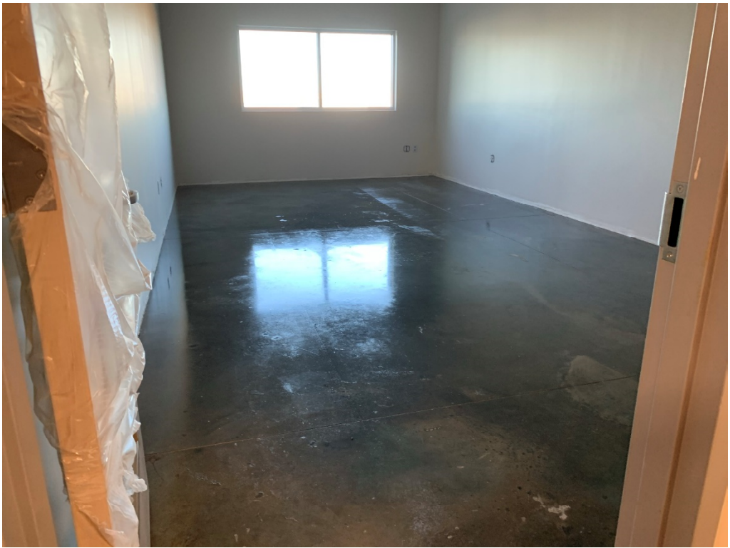
Figure 13 – Floor Sealant is Ongoing; This area has a lot of discoloration and possible debris trapped in sealant and will need further review as to it's acceptability when dry