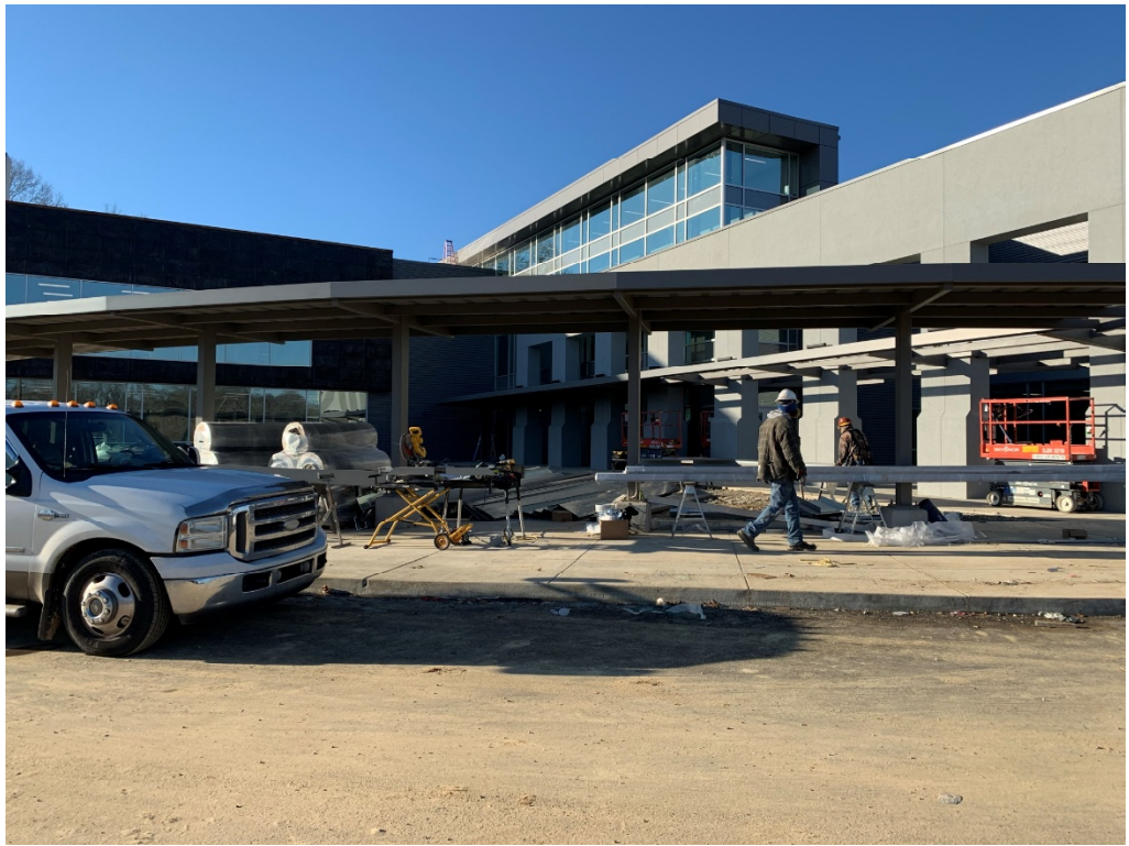
Figure 1 – Metal Trim Install at North Elevation