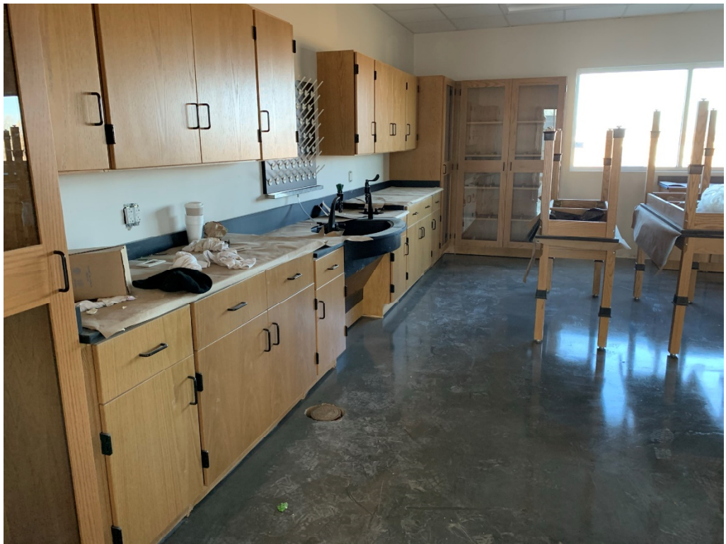
Figure 8 – Complete Lab at Upper Central Floor