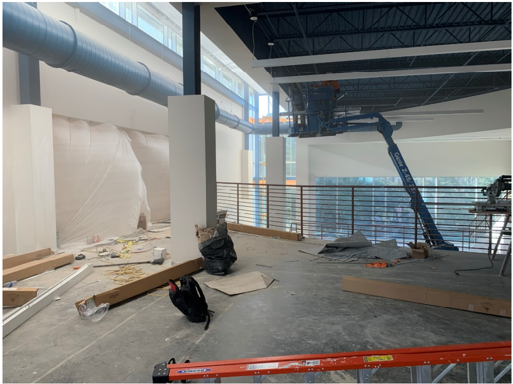
Figure 5 – East Building Work Creating Dust Even with Plastic Barrier