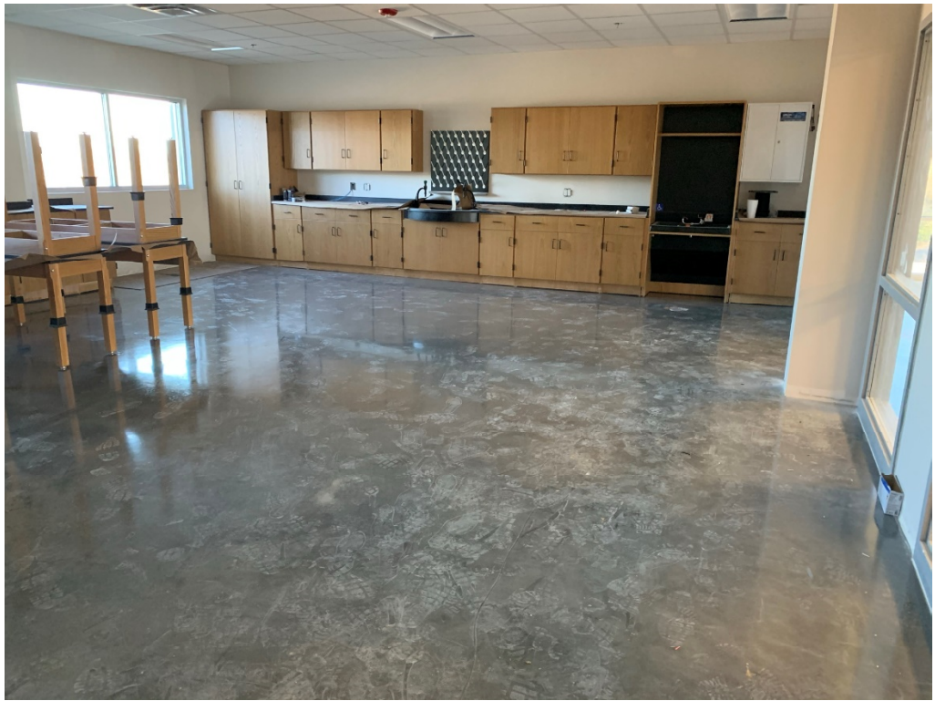
Figure 7 – Complete Lab at Upper Central Floor