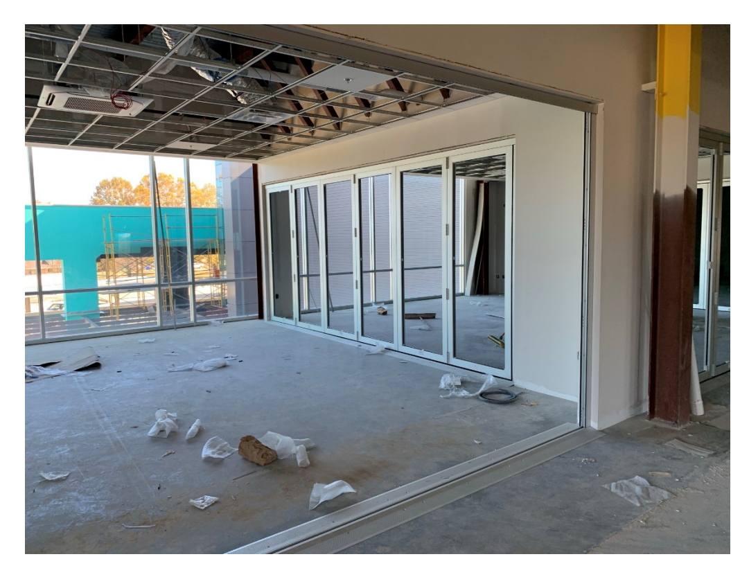
Figure 14 – Partition Wall Installation is Ongoing