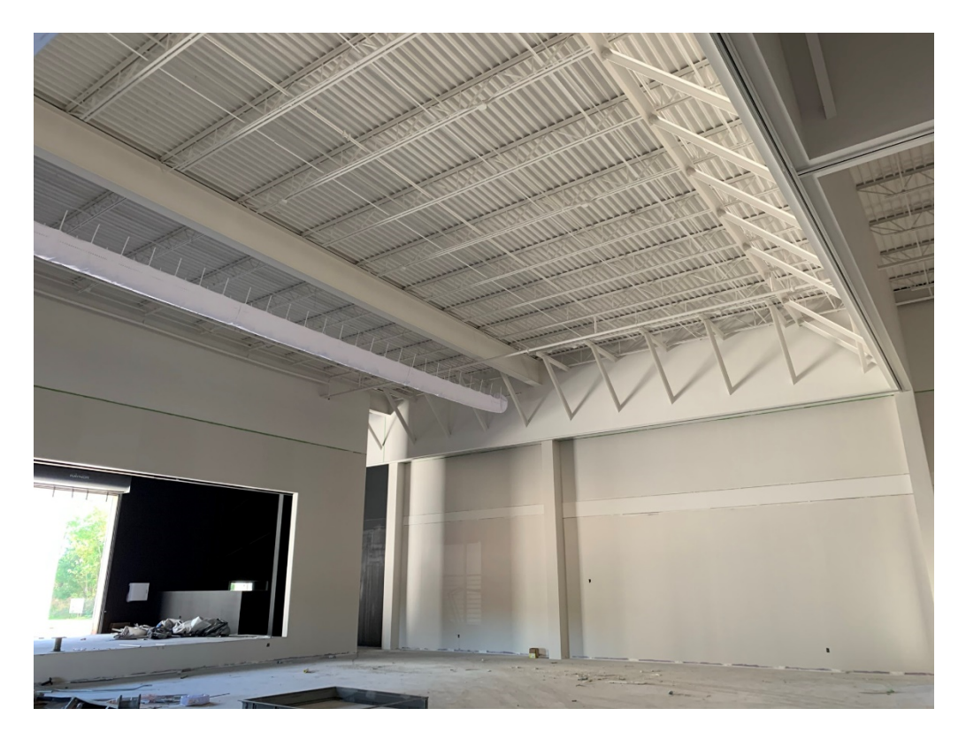
Figure 18 – Paint at Gym