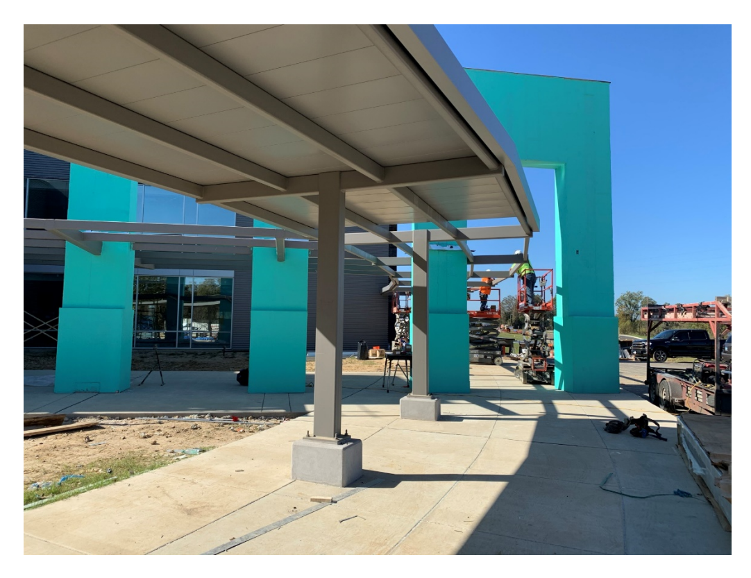
Figure 4 – Awning Covering Installation is Ongoing