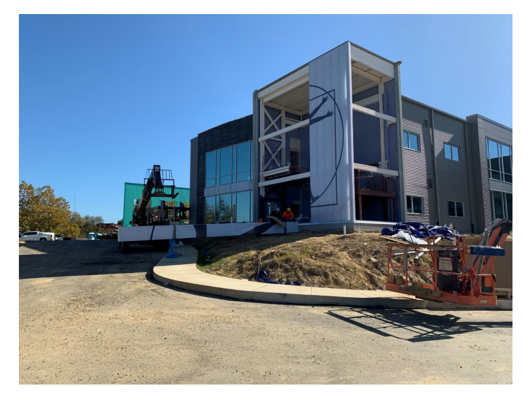
Figure 1 – The Vitruvian Man