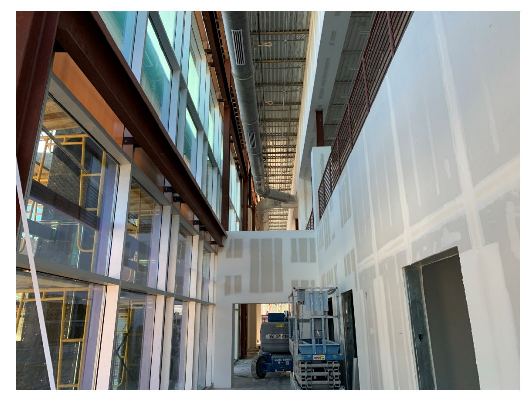
Figure 8 – Main Entry Foyer