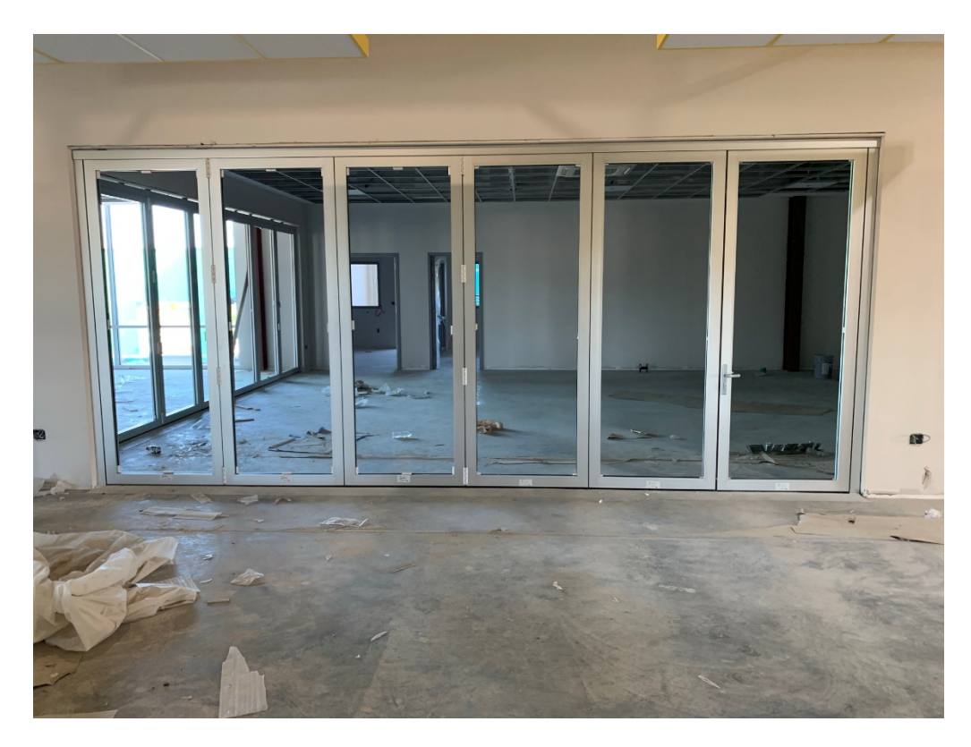
Figure 16 – Partition Wall Installation is Ongoing