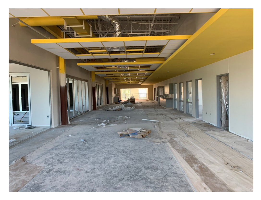
Figure 13 – Paint Work is Ongoing