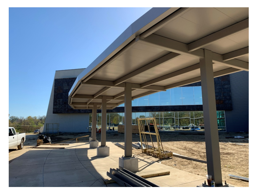
Figure 3 – Awning Covering Installation is Ongoing