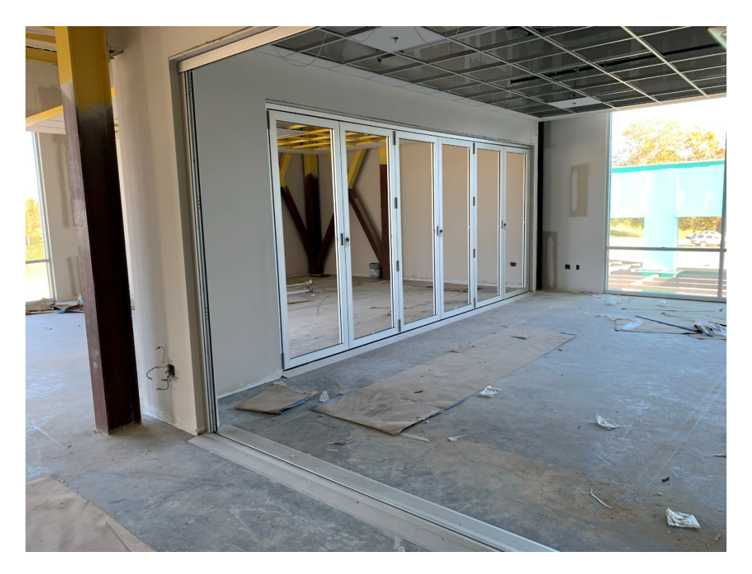
Figure 15 – Partition Wall Installation is Ongoing