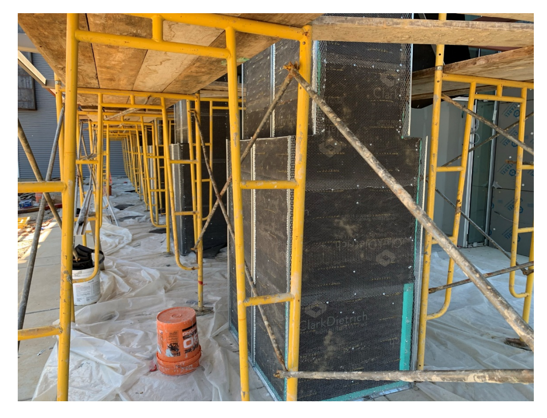
Figure 6 – Stucco work has begun at the main Entrance