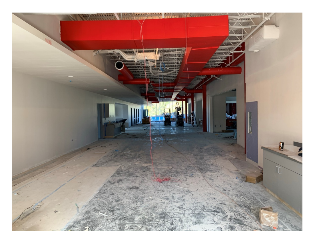
Figure 12 – Paint Work is Ongoing