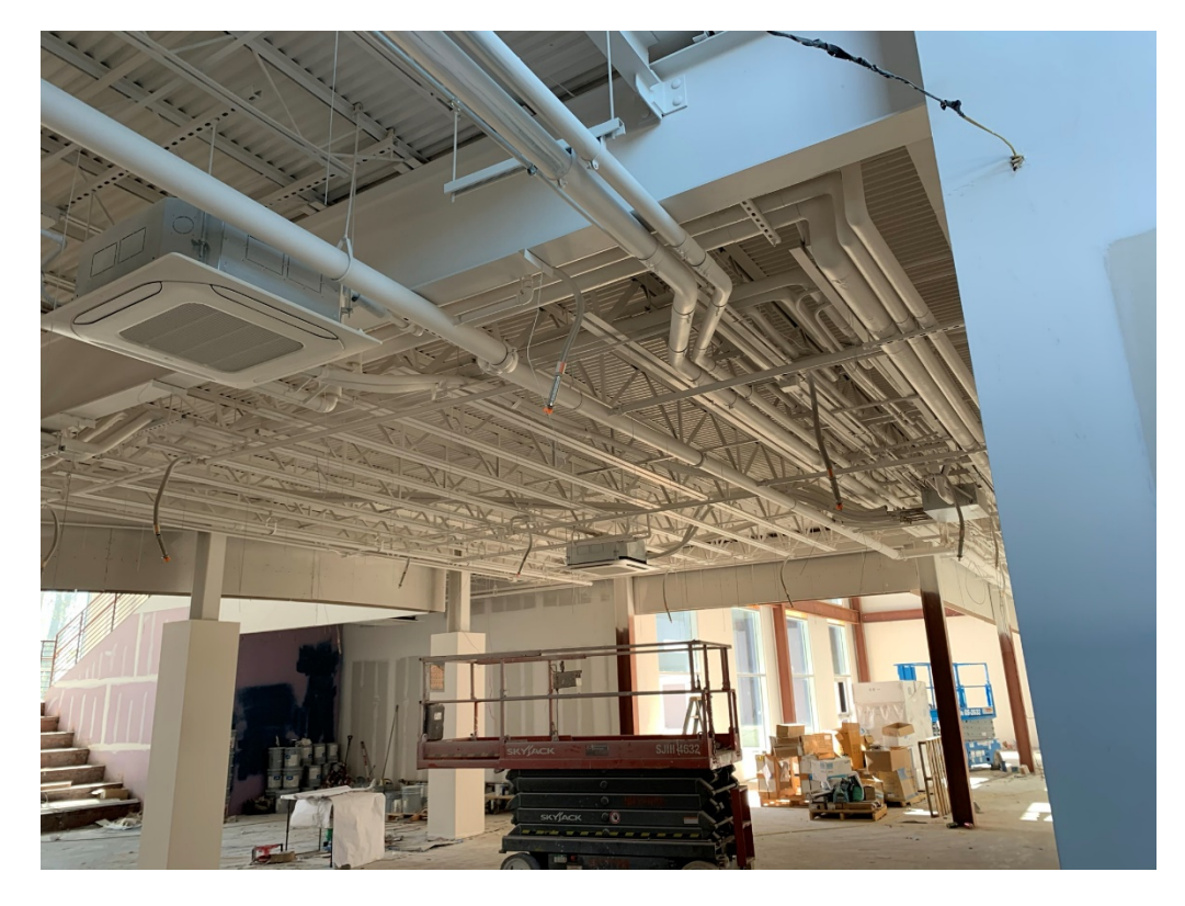
Figure 10 – Ceiling Paint Work