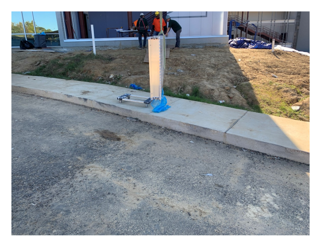
Figure 2 – Panel Installation is Ongoing