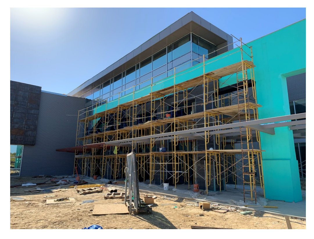
Figure 5 – Stucco work has begun at the main Entrance