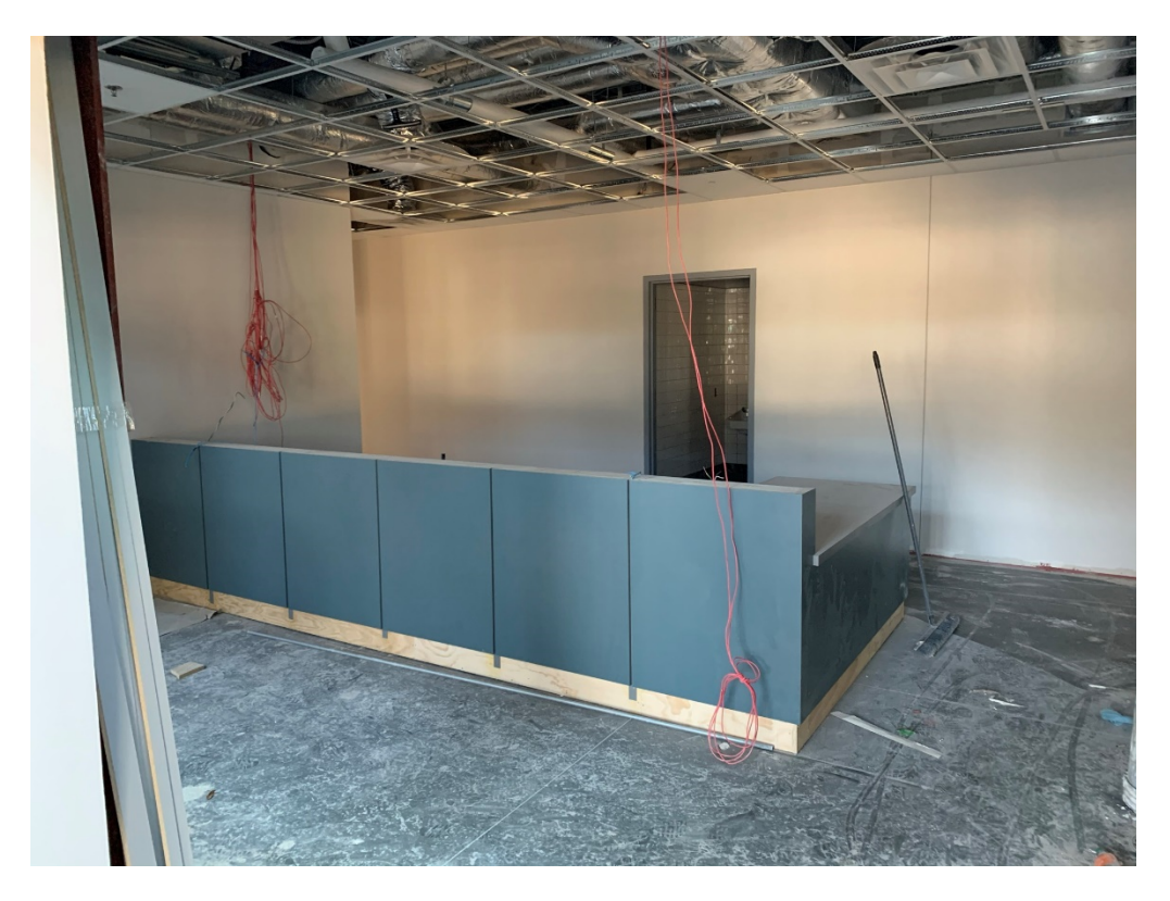
Figure 9 – Millwork at Main Entrance Check In