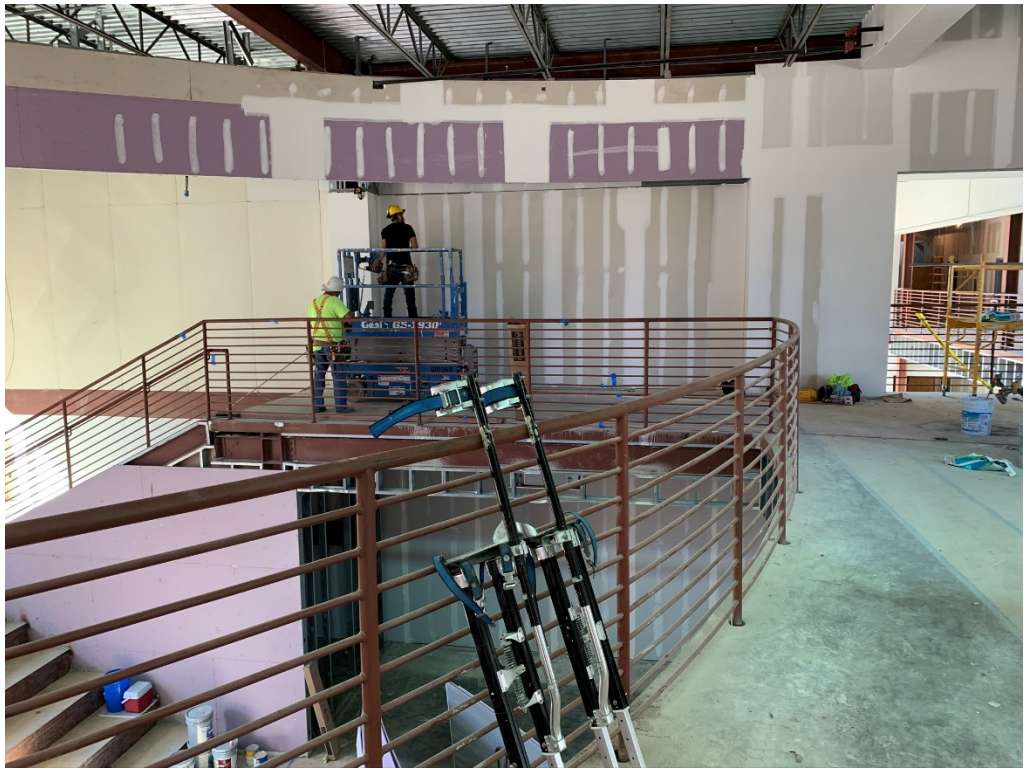
Figure 23 – Central Upper Lobby