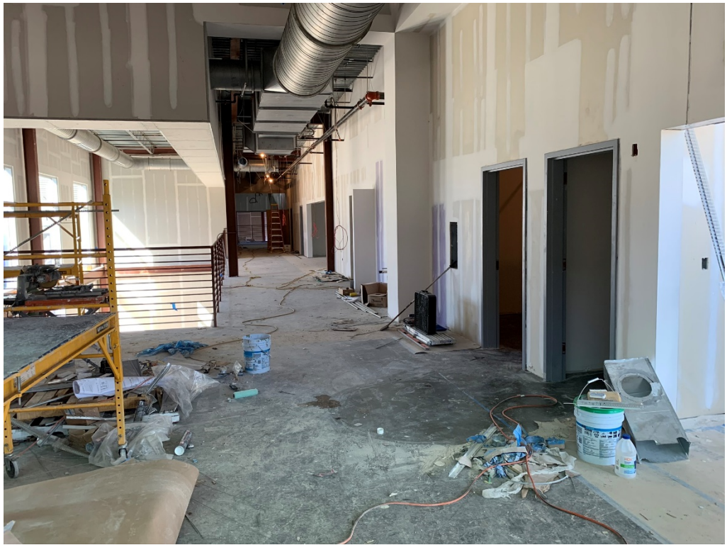
Figure 25 – Upstairs Lobby Looking West