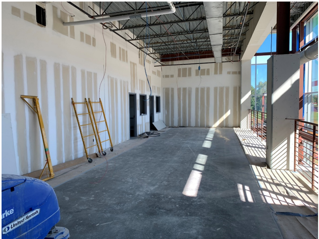
Figure 26 – Upstairs Lobby Looking North