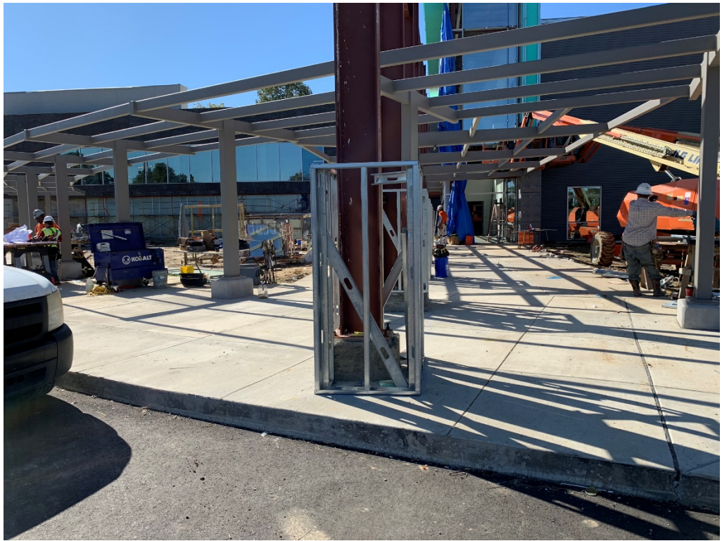
Figure 3 – Framed Plinths