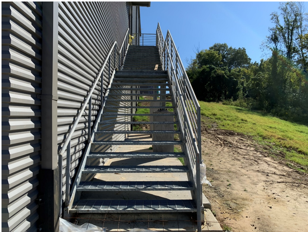
Figure 32 – Exterior Southwest Stair Installed