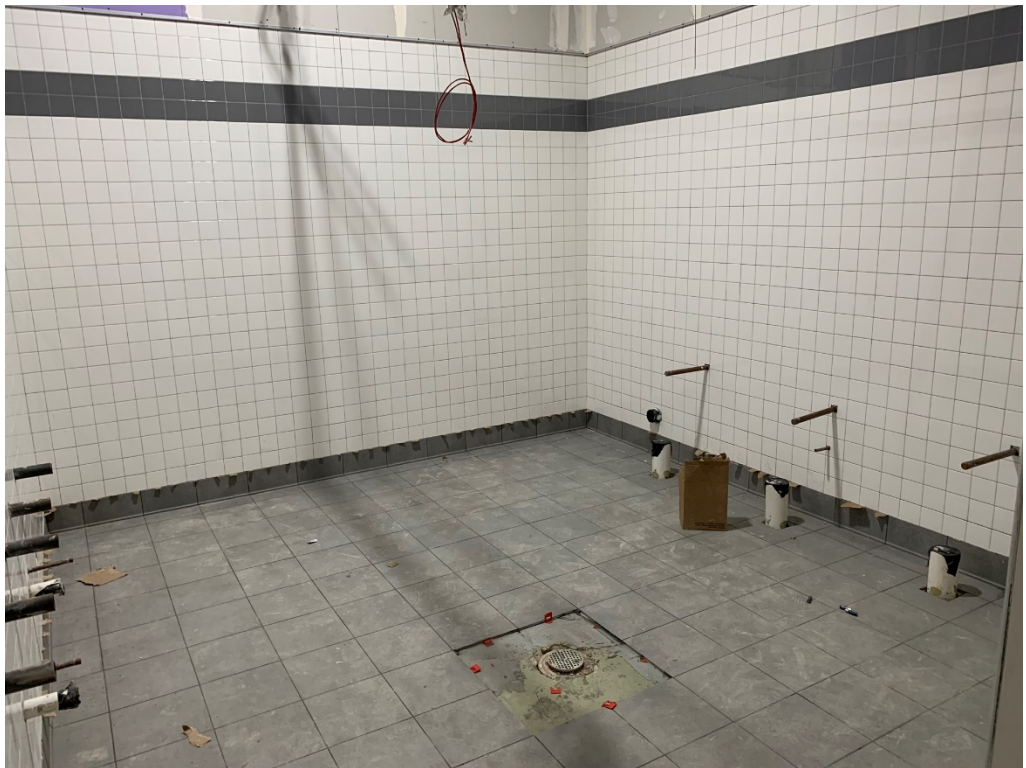
Figure 24 – Upstairs Bathroom Tile is nearing Completion