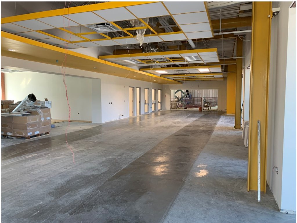
Figure 22 – East Building 3 rd Floor