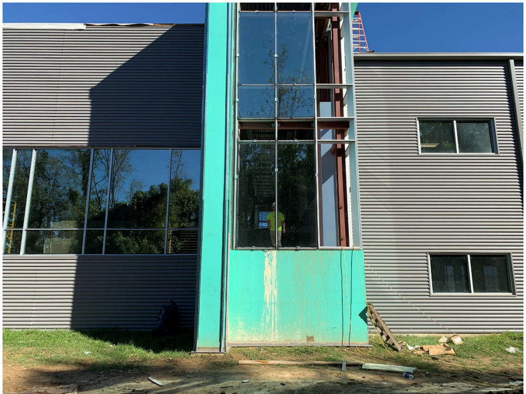
Figure 12 – South Façade