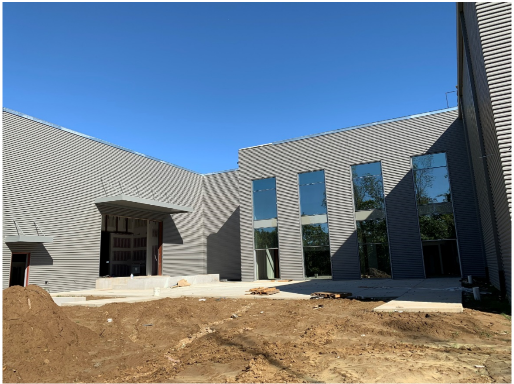
Figure 13 – Courtyard