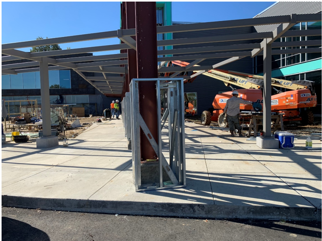
Figure 4 – Framed Plinths