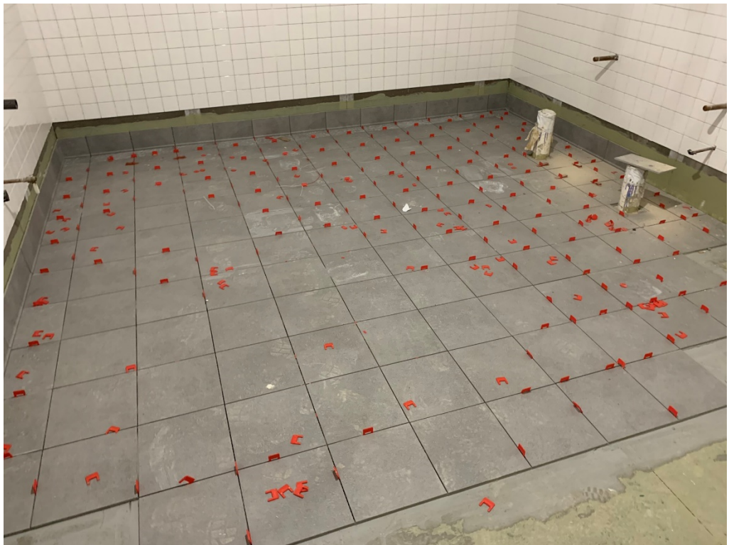
Figure 16 – Tile is Ongoing