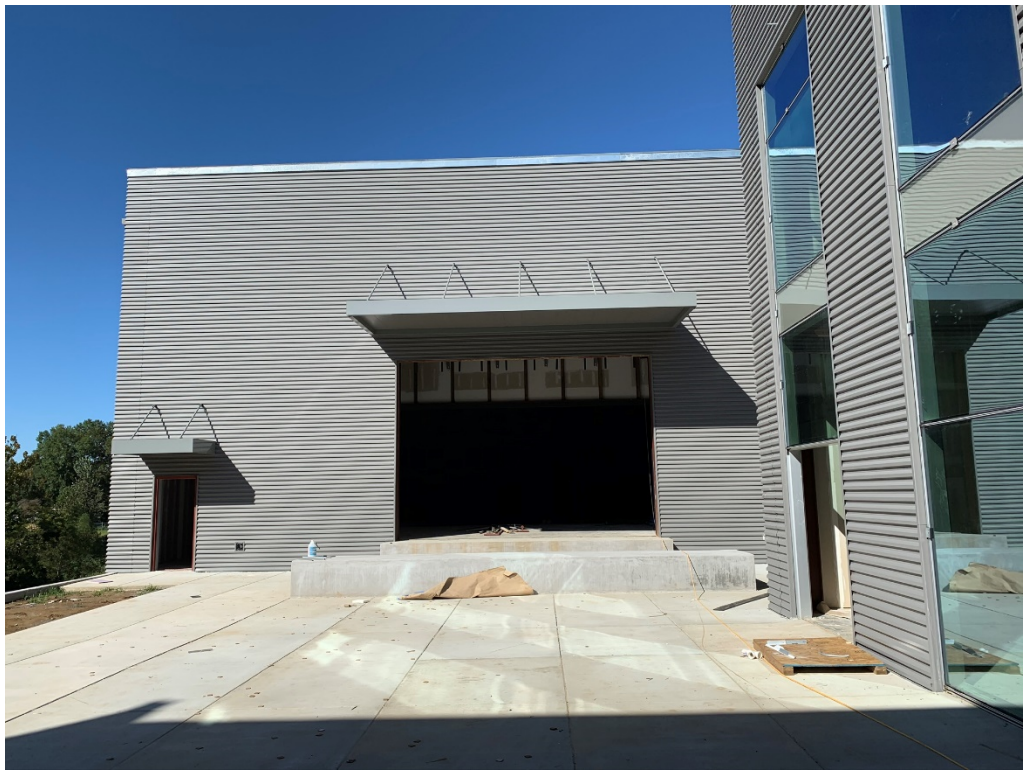
Figure 14 – Courtyard