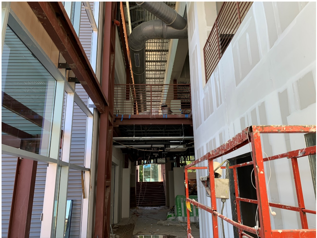
Figure 20 – Entry 2 Story Space