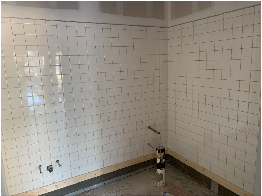
Figure 17 – Tile is Ongoing