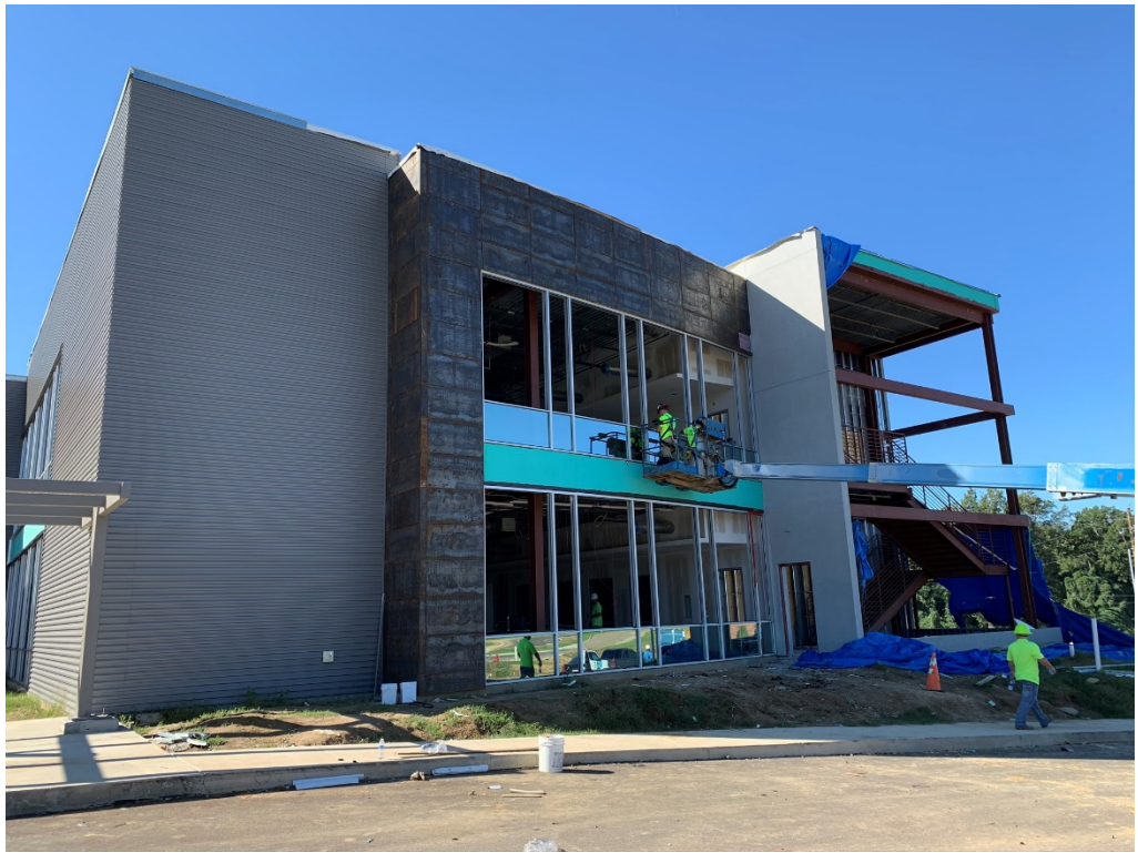
Figure 1 – North Central Façade of Structure (Glazing Install)