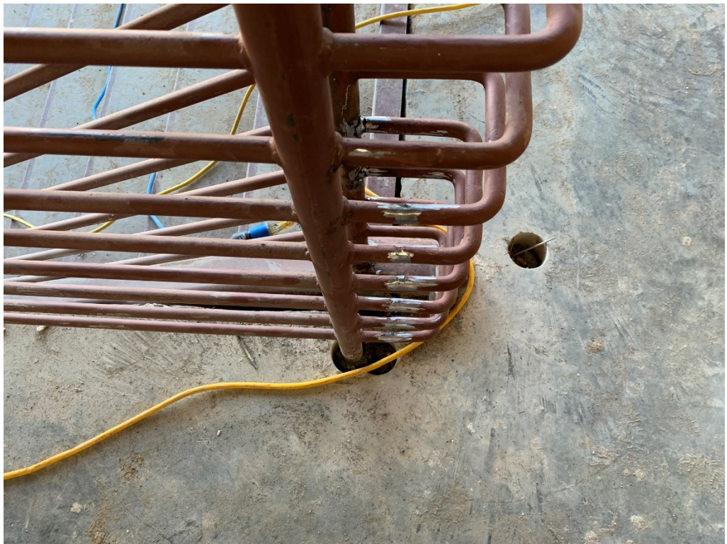
Figure 30 – Grinding Work at Steel Rail