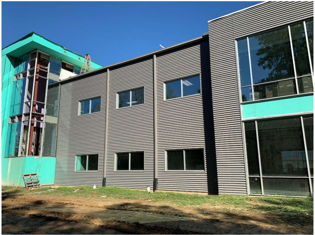
Figure 11 – South Façade