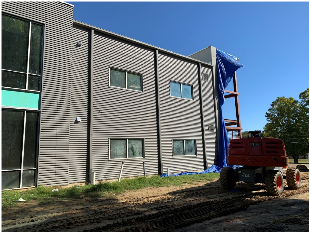
Figure 10 – South Façade