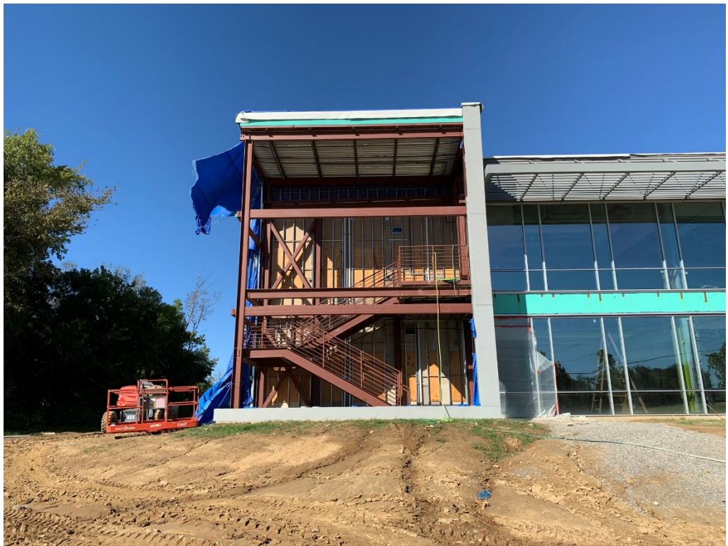
Figure 8 – East Façade