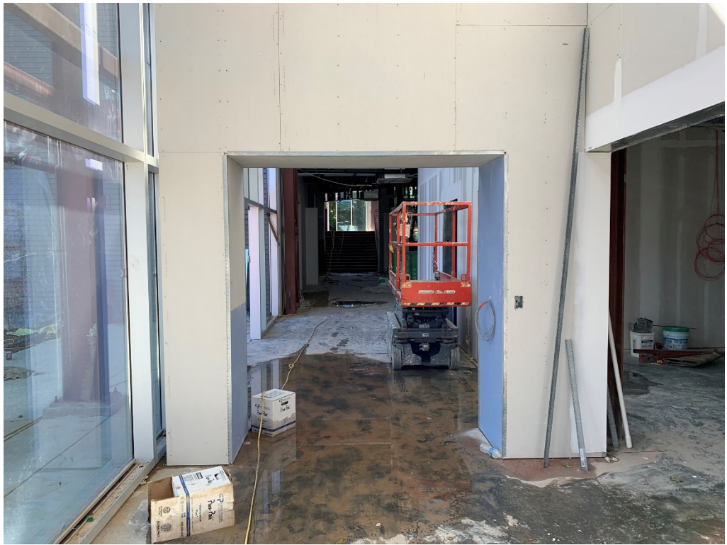
Figure 19 – Entry 2 Story Space