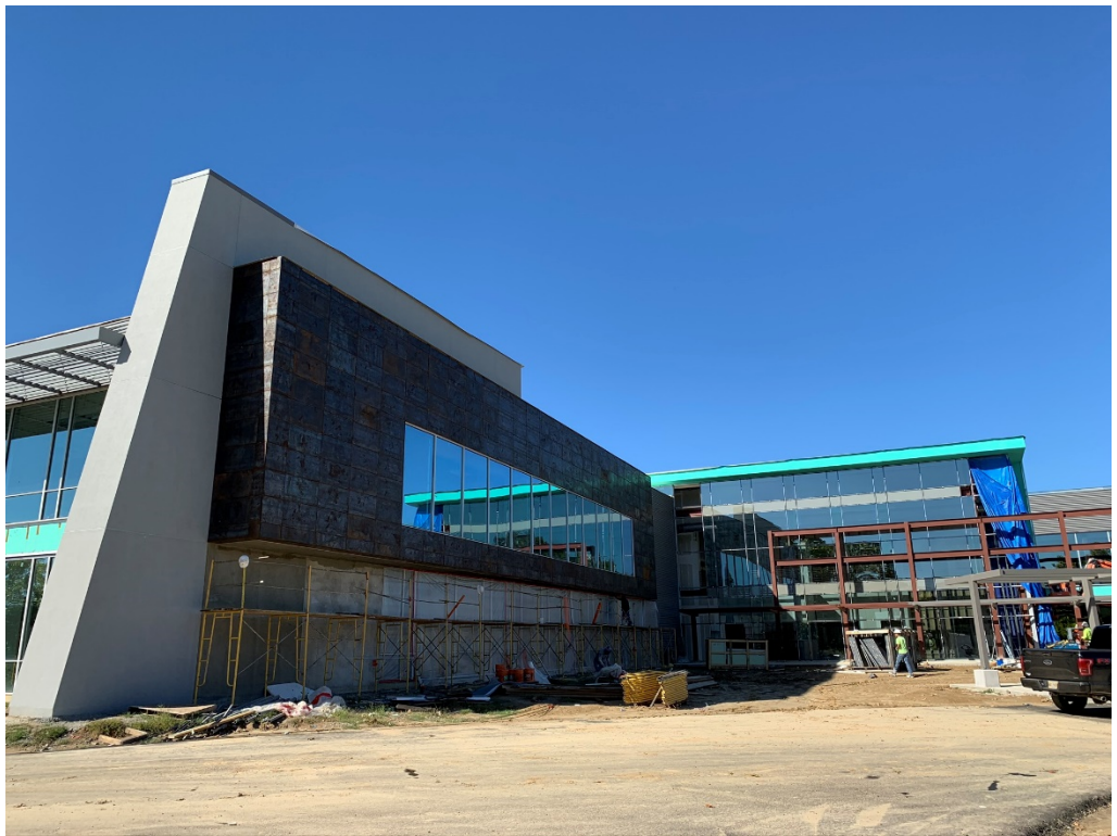
Figure 6 – East Section of Building Exterior