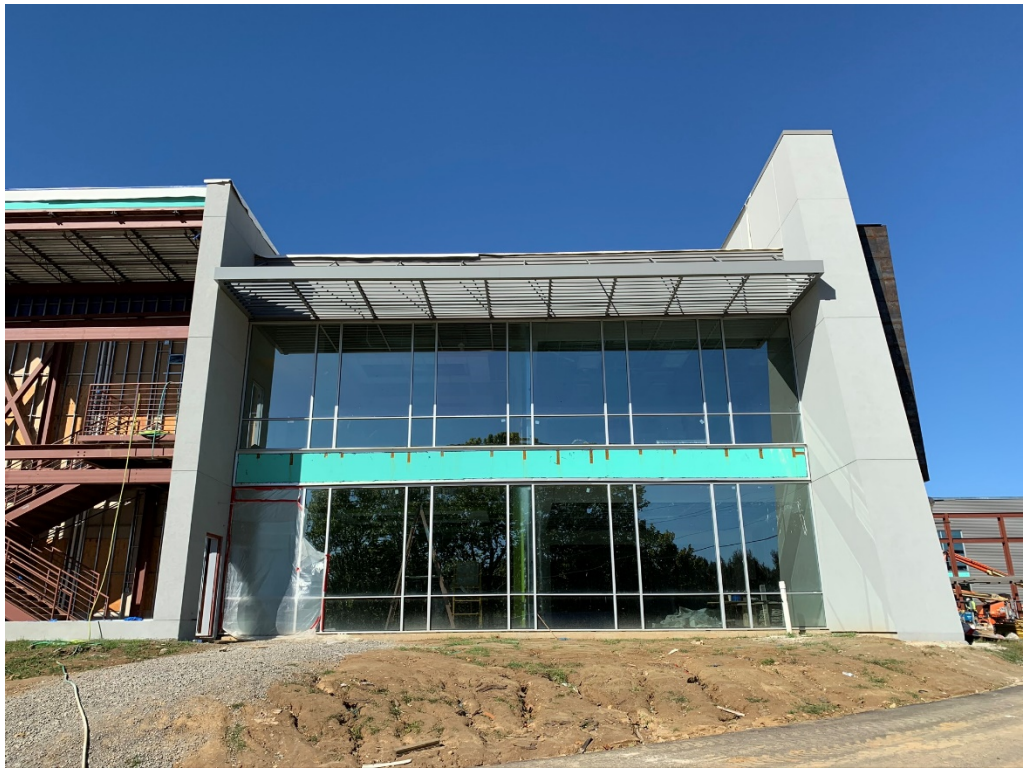
Figure 7 – East Façade