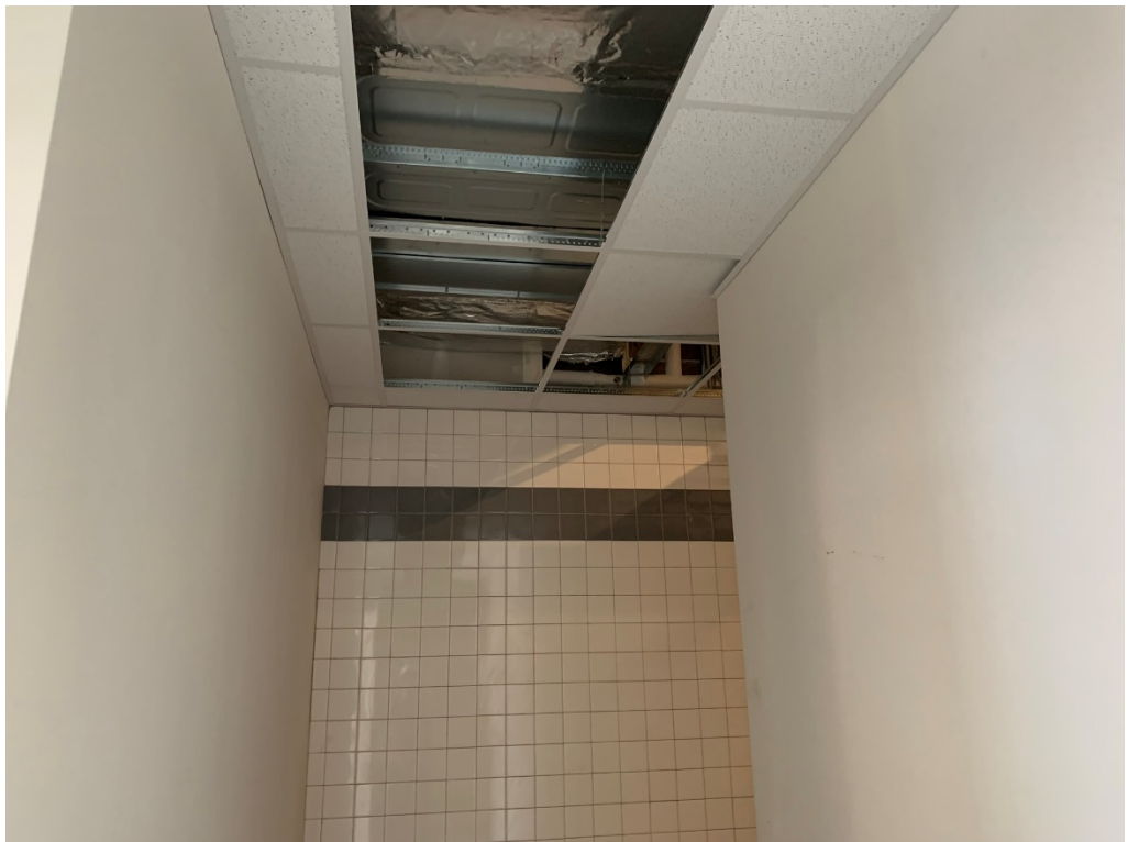
Figure 28 – Ceiling Grid is Installed where Wall Finishes are Complete