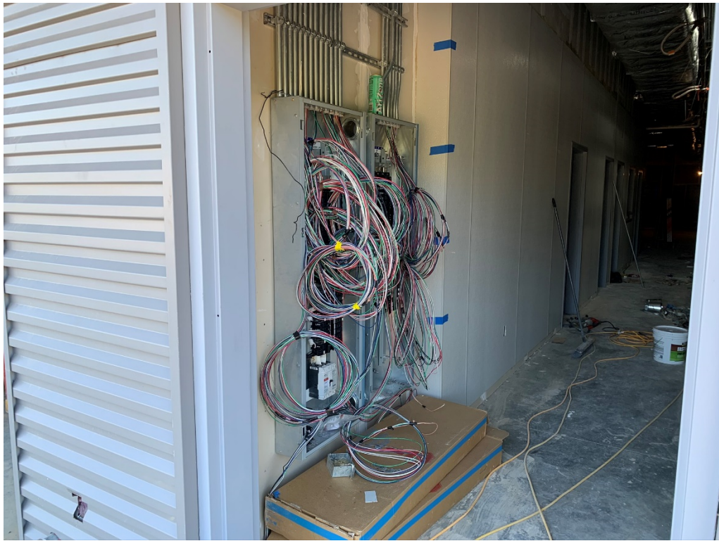
Figure 31 – Electrical Wire Pull