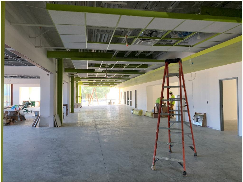
Figure 21 – East Building 2 nd Floor