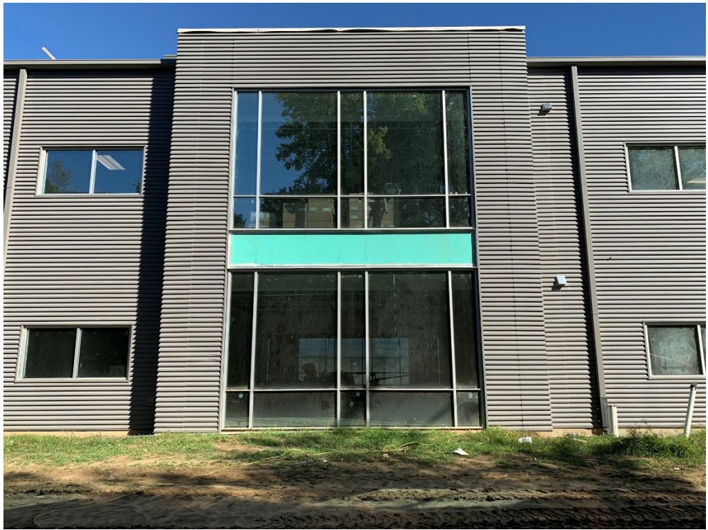
Figure 9 – South Façade