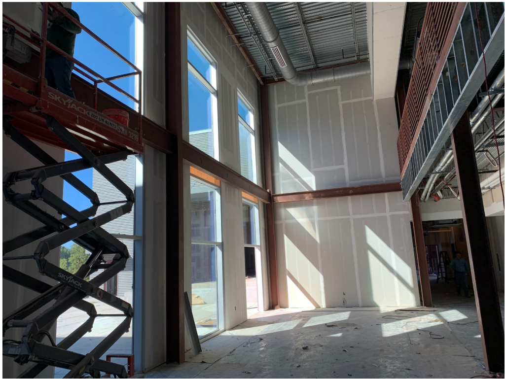
Figure 15 – Drywall Finishing is Ongoing