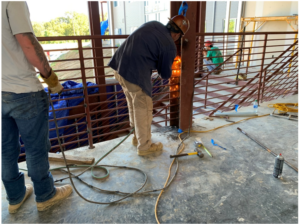
Figure 29 – Steel Handrail Progress