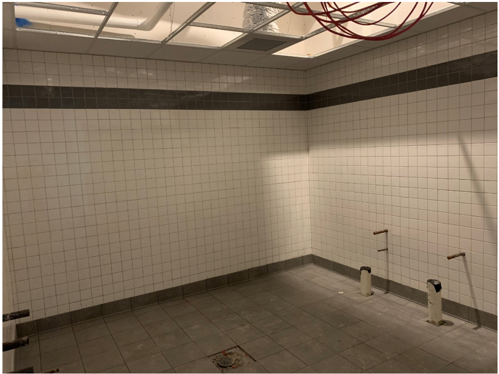
Figure 27 – Upstairs Bathroom Tile is nearing Completion; Ceiling Grid is Installed where Wall Finishes are Complete