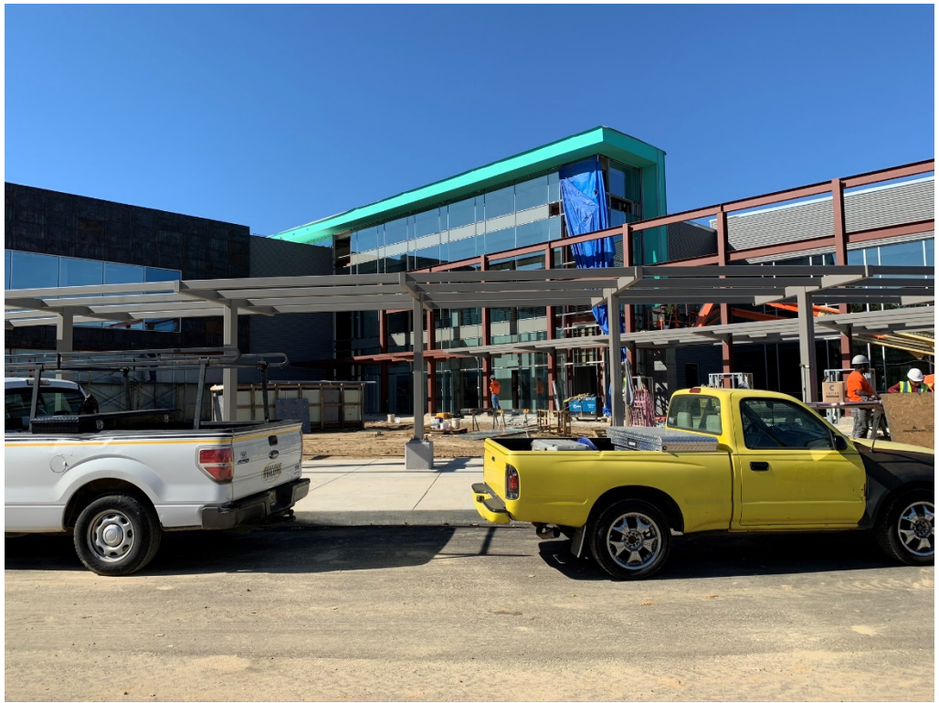
Figure 5 – NE Looking SW