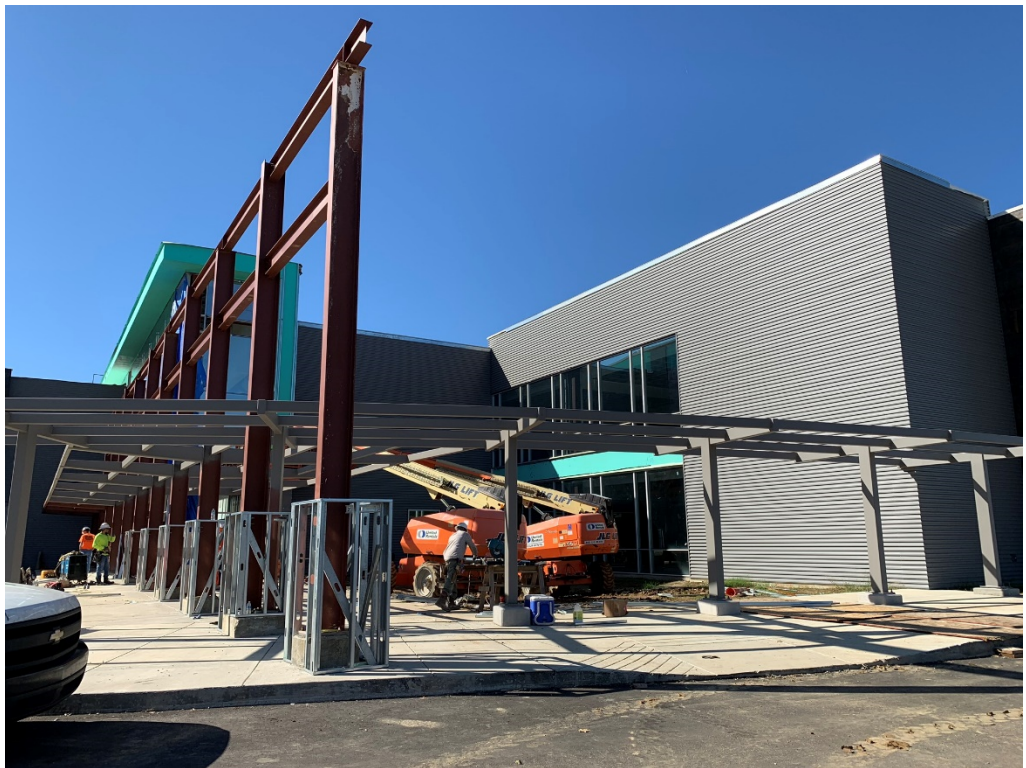
Figure 2 – Progress at Car Drop Off