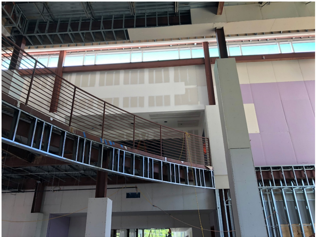
Figure 10 – Drywall Installation is Ongoing