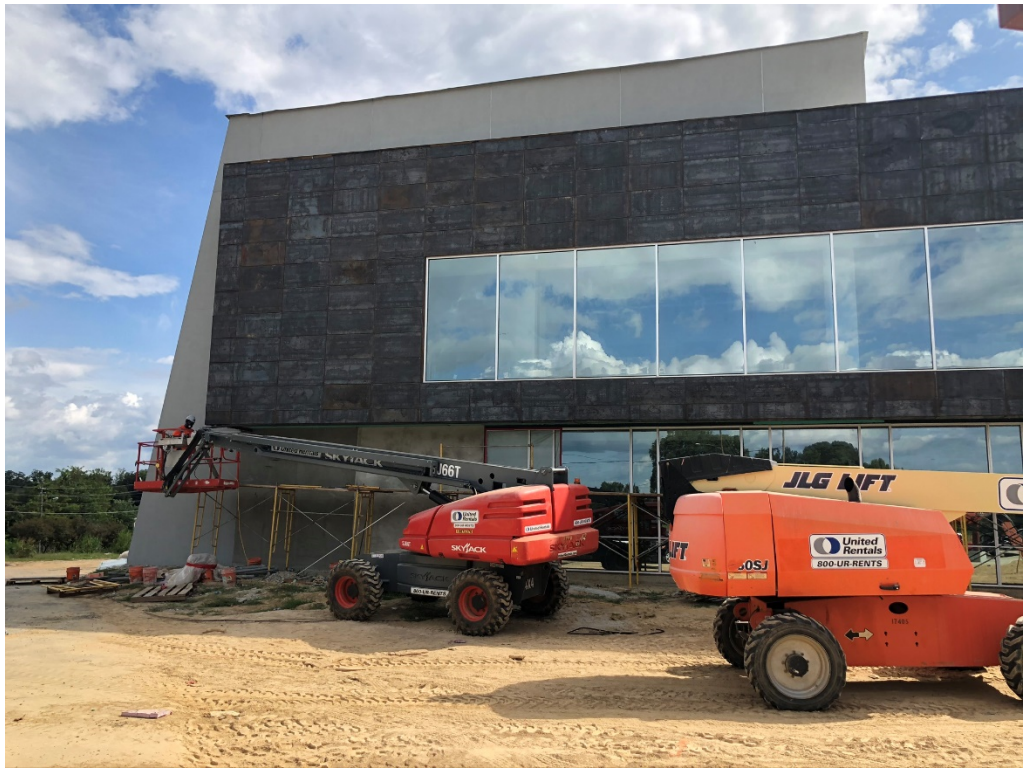
Figure 1 – Metal Siding Installed