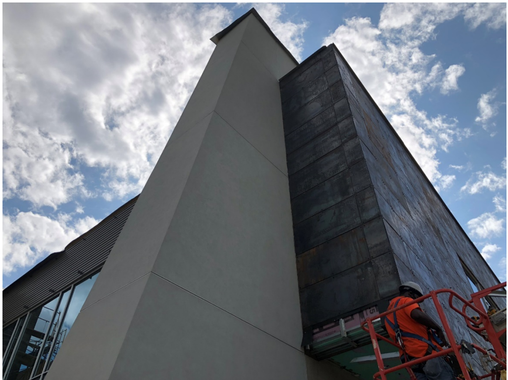
Figure 2 – Stucco Complete at Corner