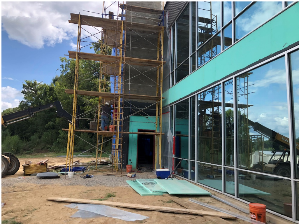
Figure 4 –Stucco at South Corner Ongoing