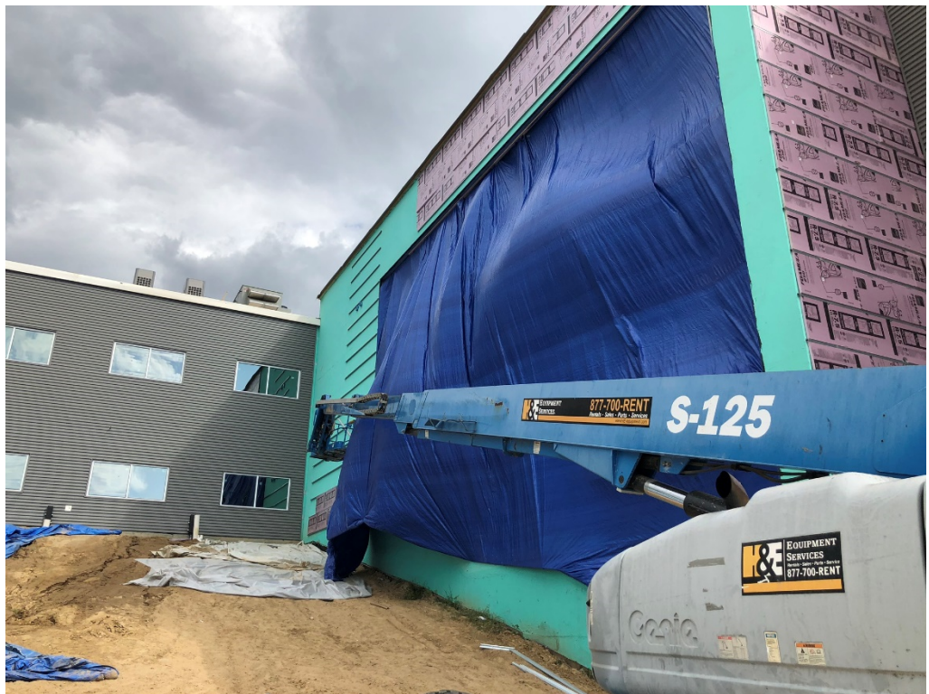
Figure 17 – Tarp has Been Installed to Protect Large Multi-Story Stair Space