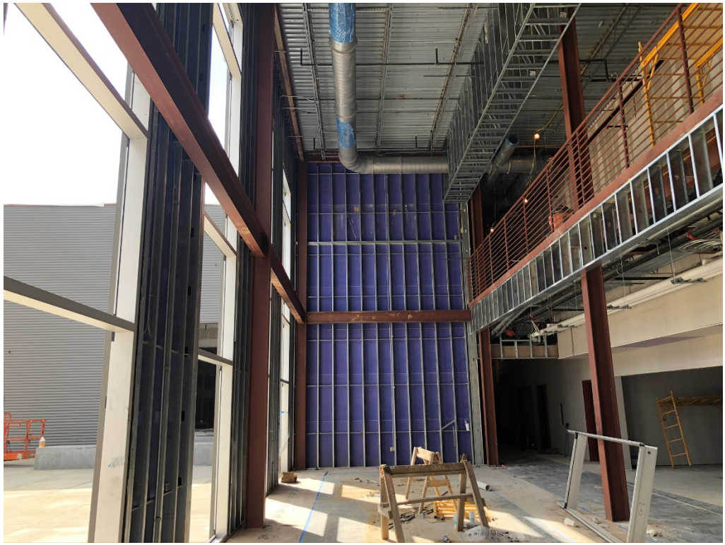
Figure 11 – South Central Building Lobby Interior