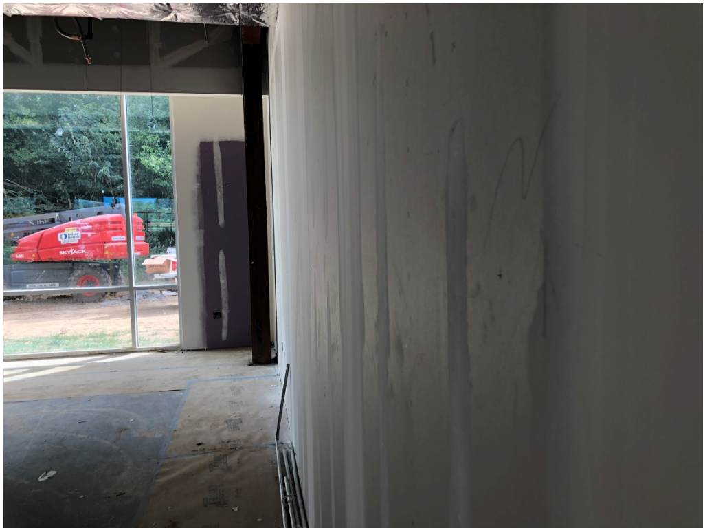
Figure 6 – Drywall Finishing is Ongoing