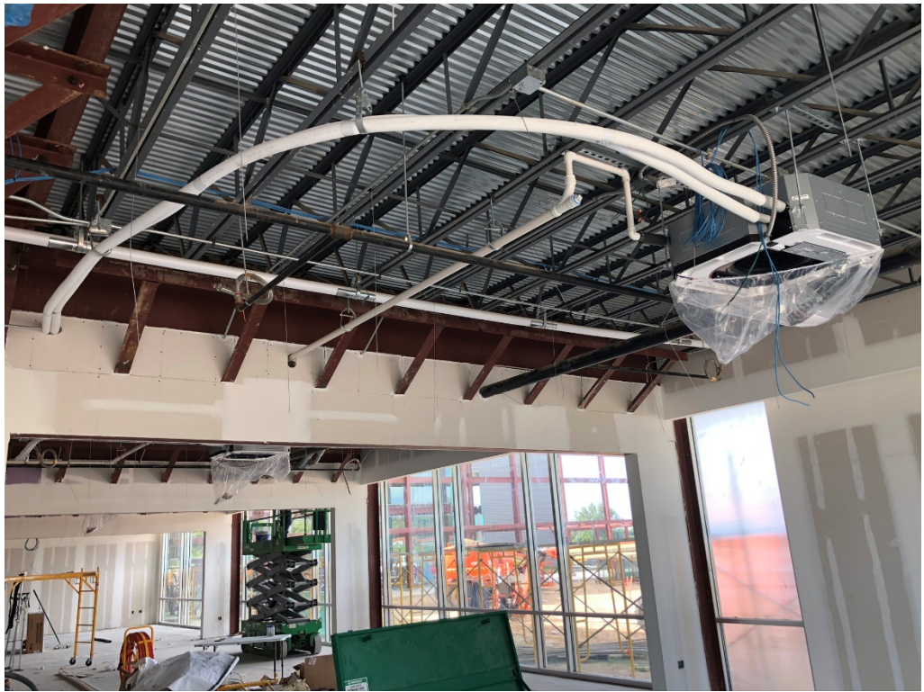
Figure 5 – HVAC Lines Installed