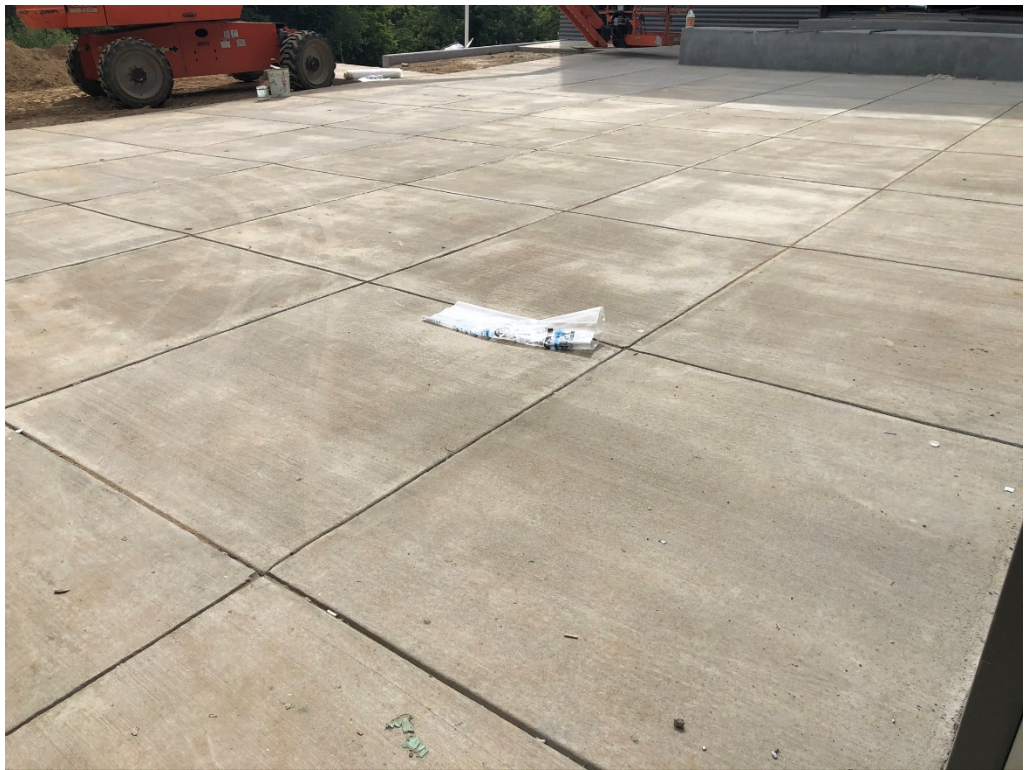
Figure 12 – Exterior Courtyard Concrete Work