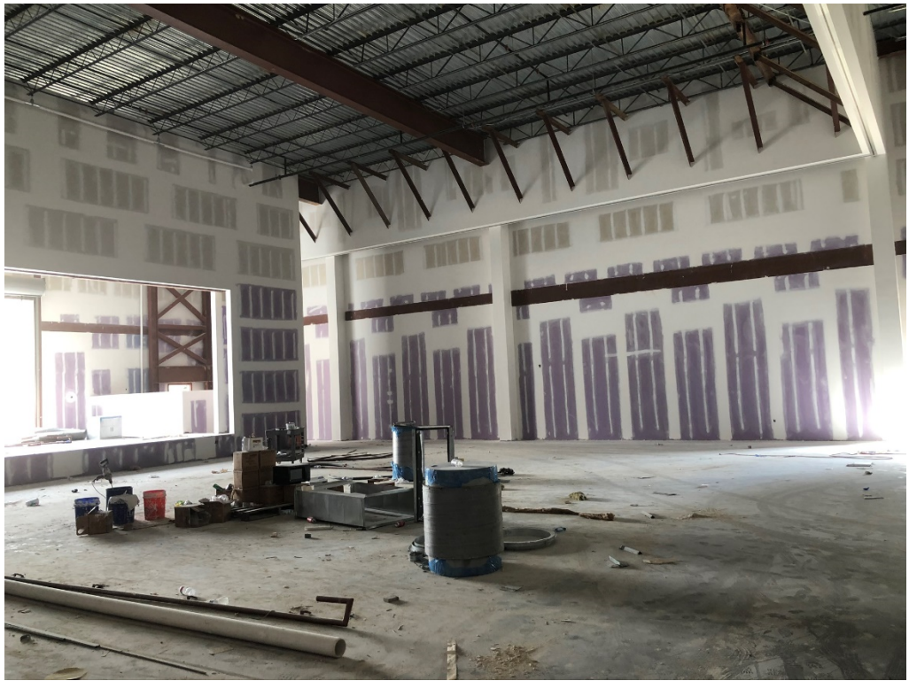
Figure 19 – Auditorium Drywall Finishing is Ongoing