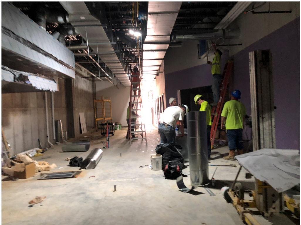
Figure 20 – Mechanical Work at Cafeteria Kitchen