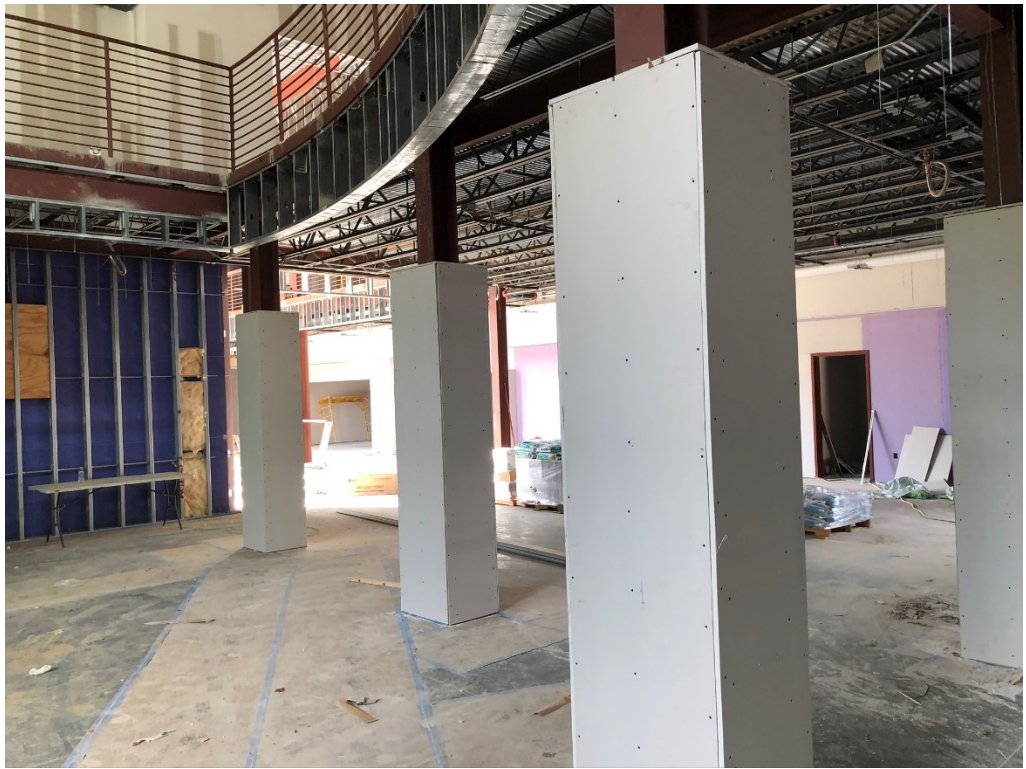
Figure 9 – Drywall Installation is Ongoing