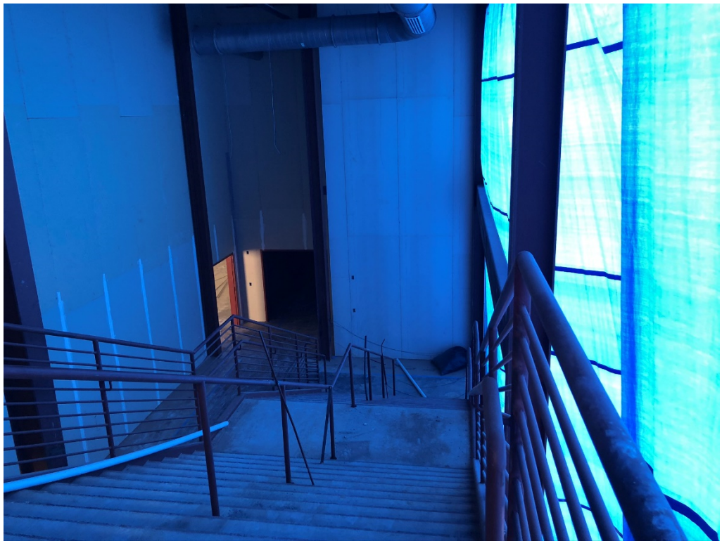
Figure 16 – Tarp has Been Installed to Protect Large Multi-Story Stair Space