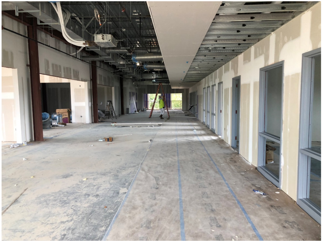
Figure 15 – Versatile Teaching Space