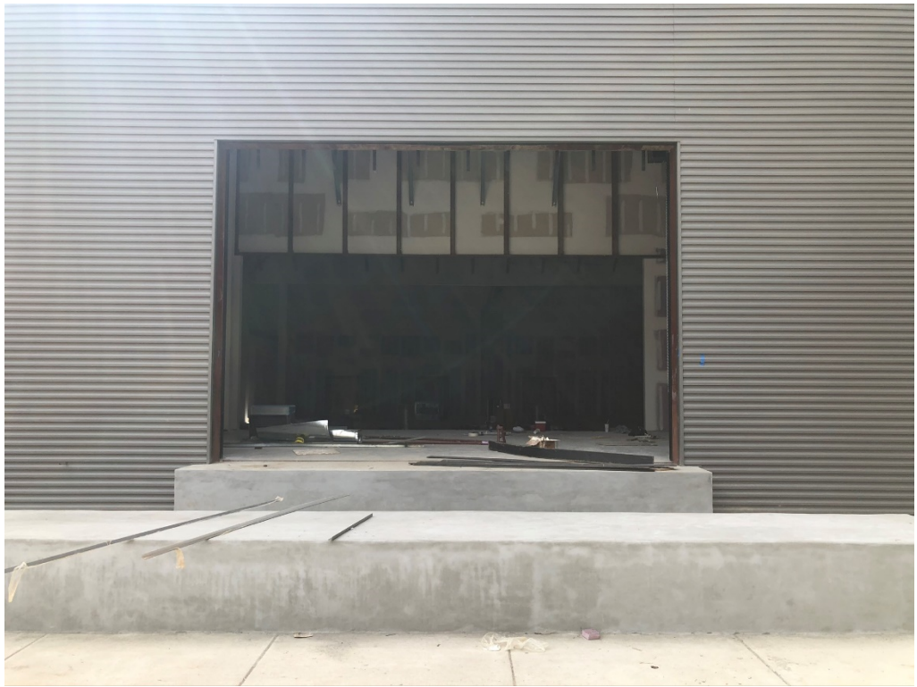
Figure 13 – Stage View from Exterior Courtyard