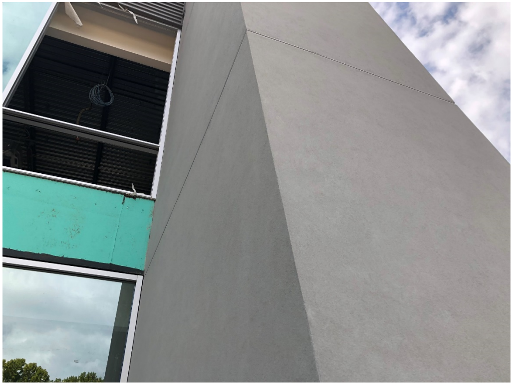
Figure 3 – Corners appear Straight and of good workmanship