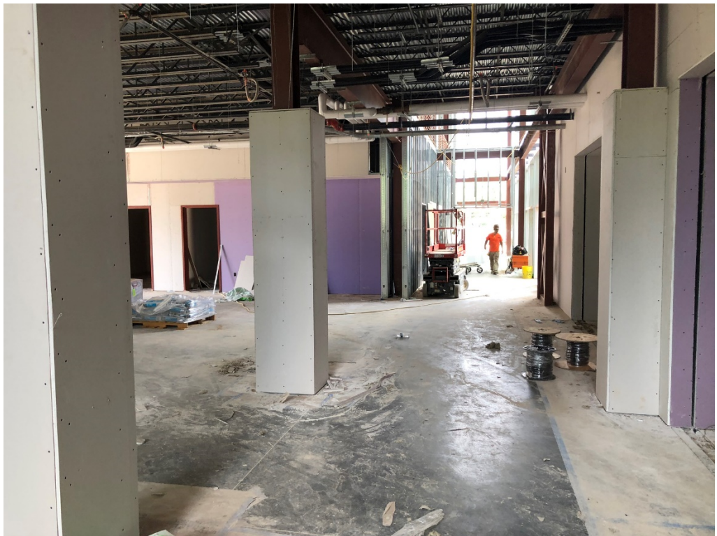
Figure 8 – Drywall Installation is Ongoing