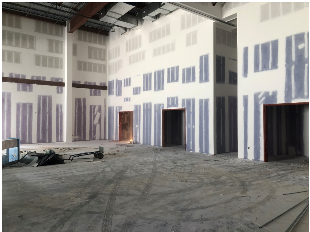
Figure 18 –Auditorium Drywall Finishing is Ongoing