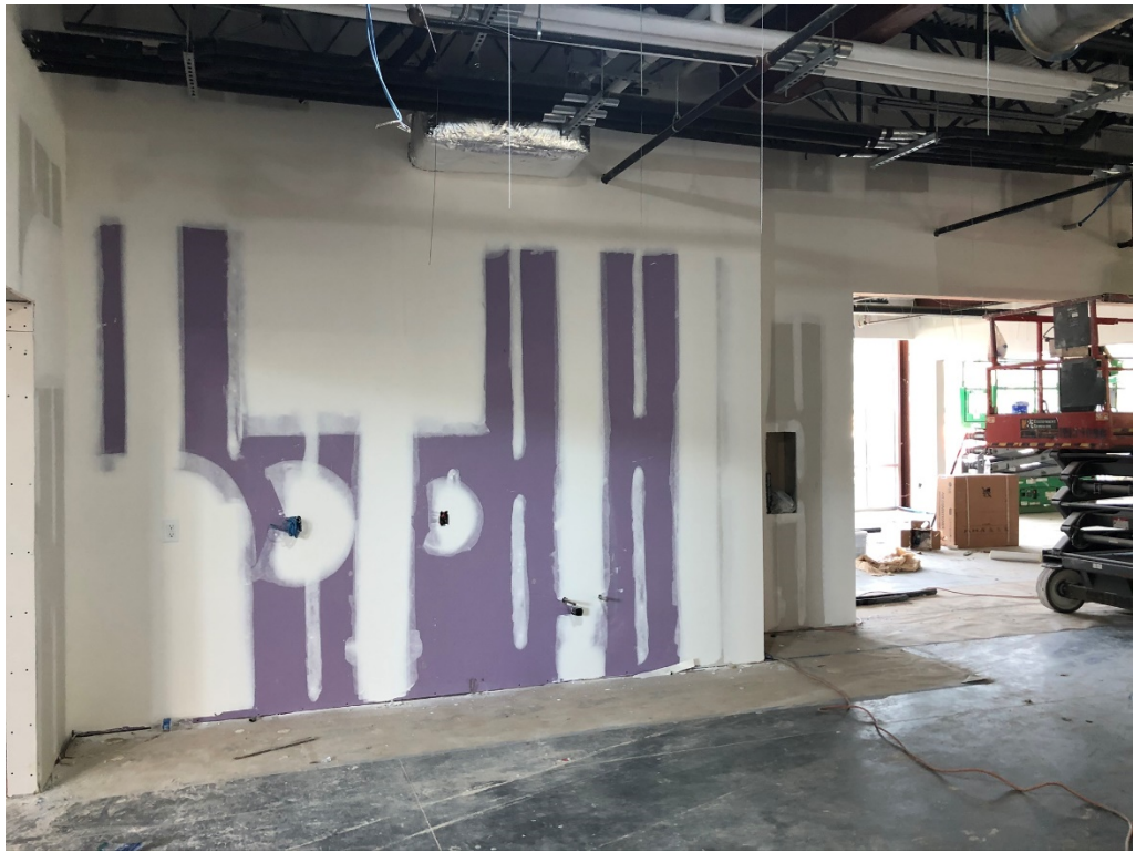
Figure 7 – Drywall Finishing is Ongoing