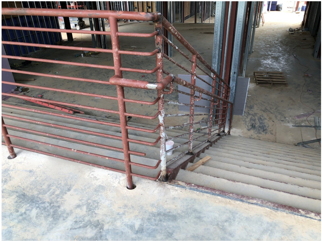
Figure 15 – Welded Handrail Corner at Main Lobby