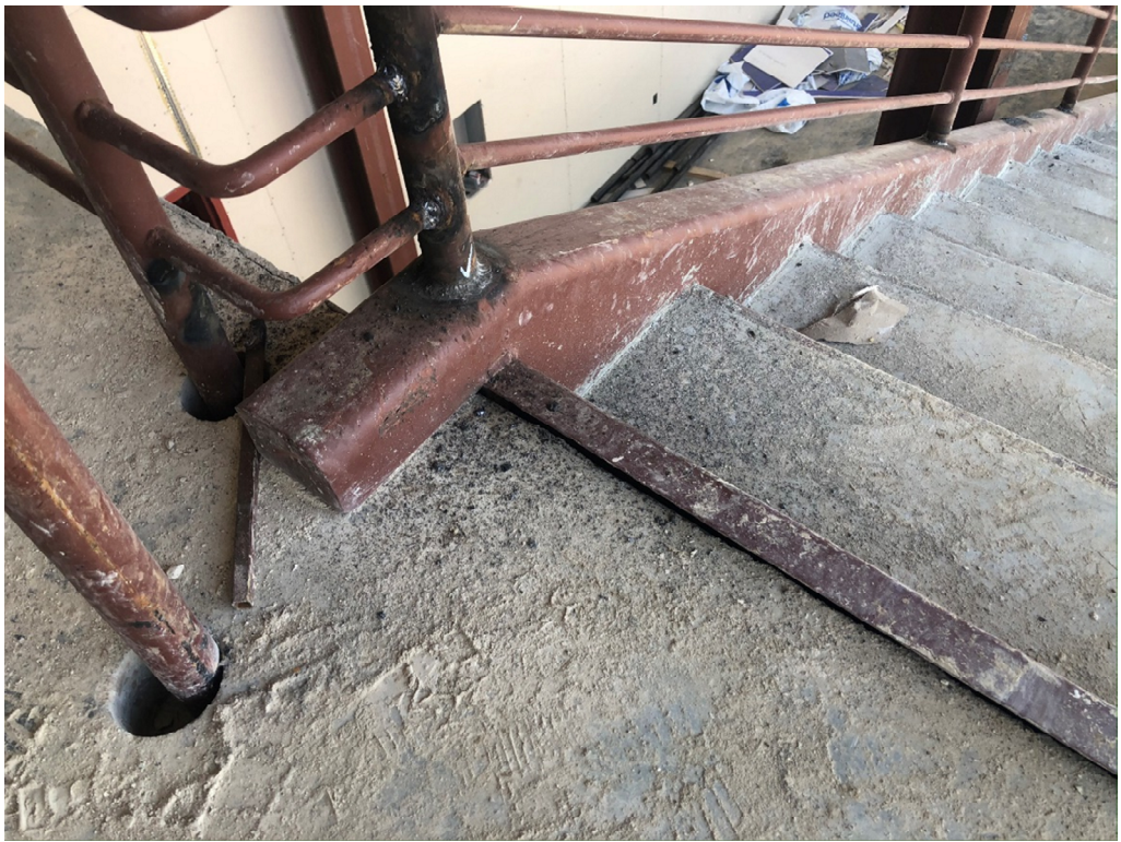
Figure 9 – Lip at Main Stair and 3 rd Floor (Recommendations to correct?)