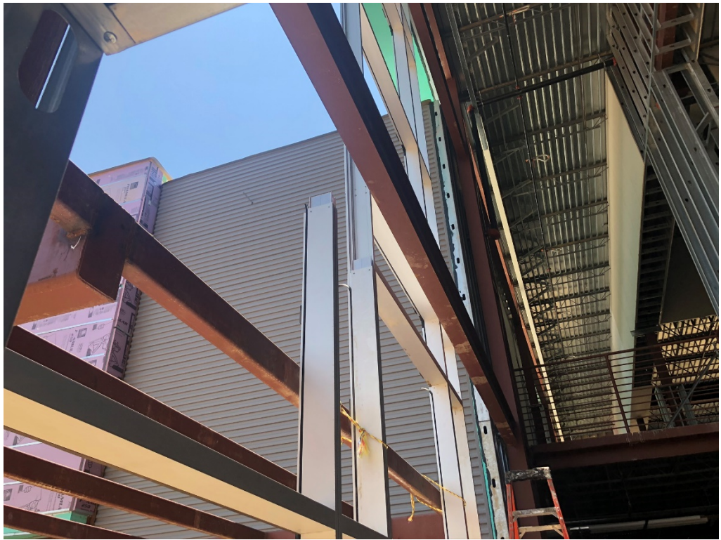
Figure 3 – Aluminum Storefront in Progress