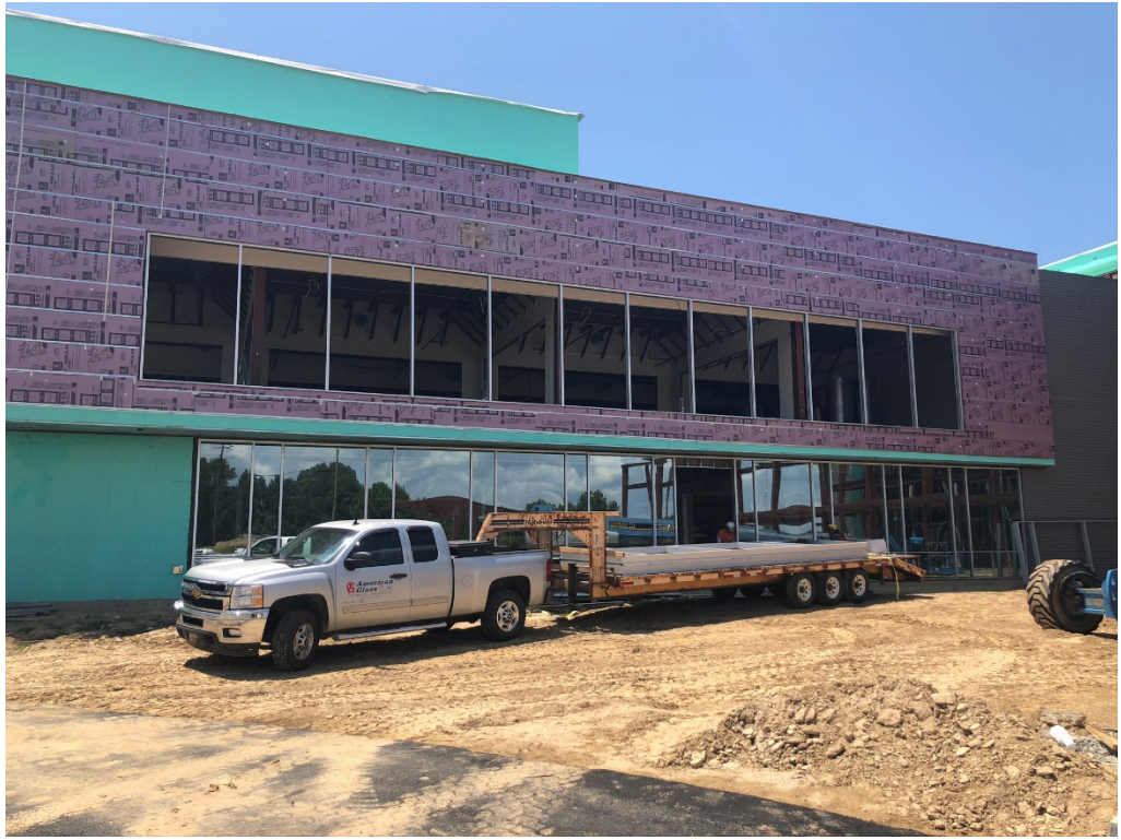
Figure 1 – Metal Siding Substrates Installed