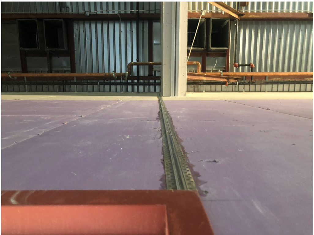
Figure 7 – Drywall Reveal Installed at Gym