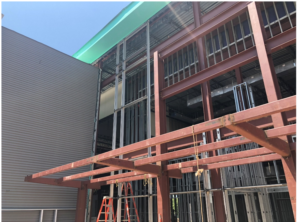
Figure 2 – Aluminum Storefront at Entry Vestibule