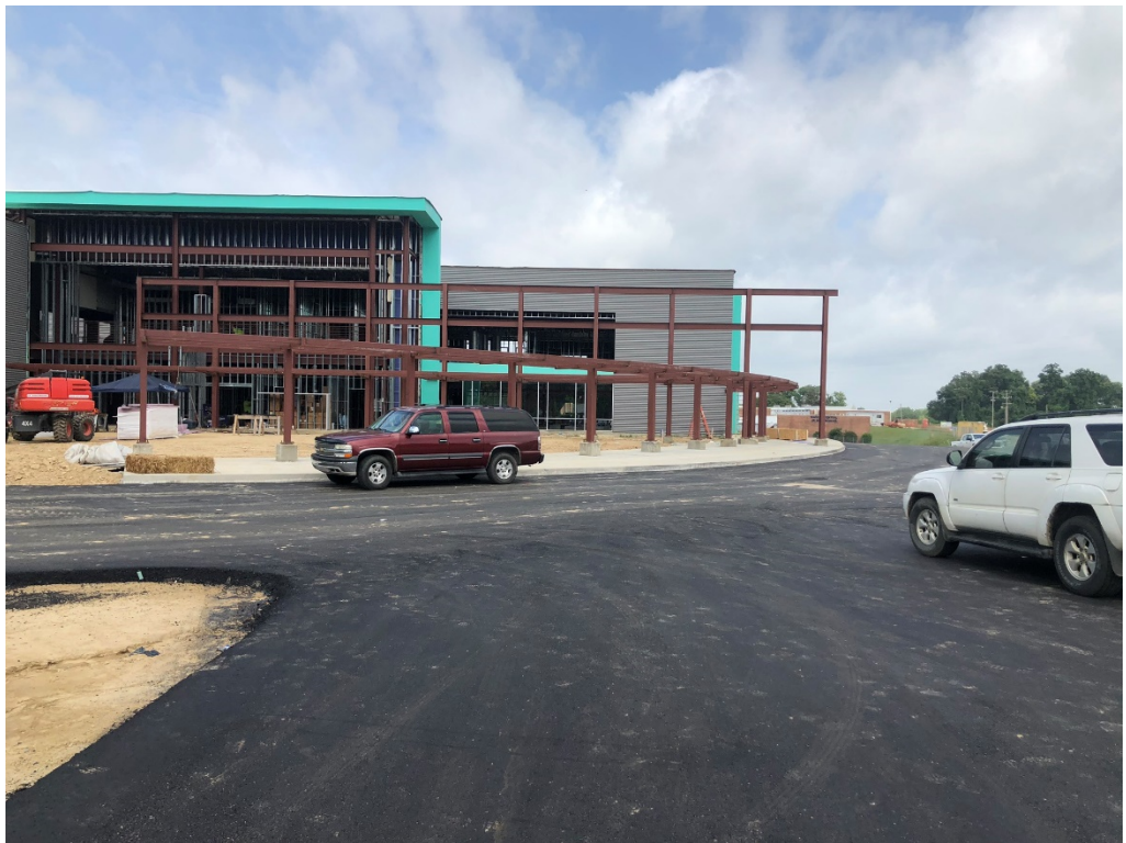
Figure 12 – Asphalt Installed at Drive