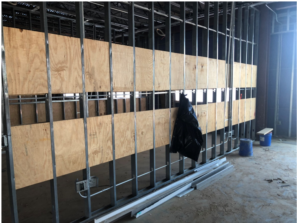
Figure 4 –Blocking Installed at Versatile Teaching Spaces