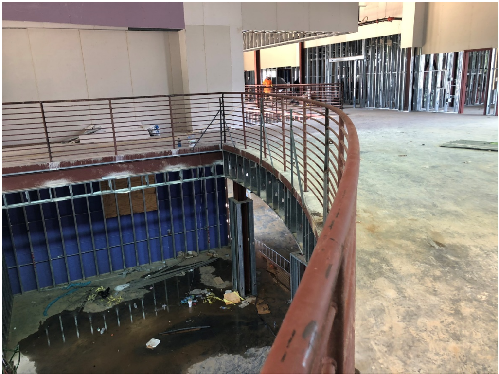
Figure 11 – Installed Curved Handrail