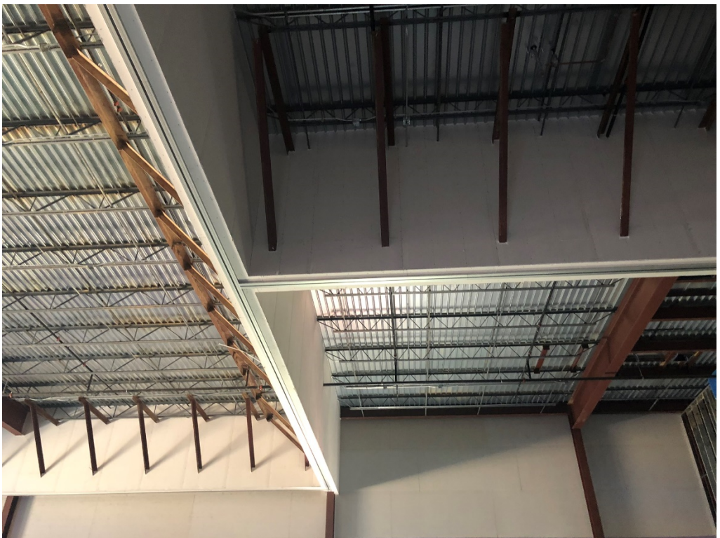
Figure 8 – Moveable Partitions Track Installed