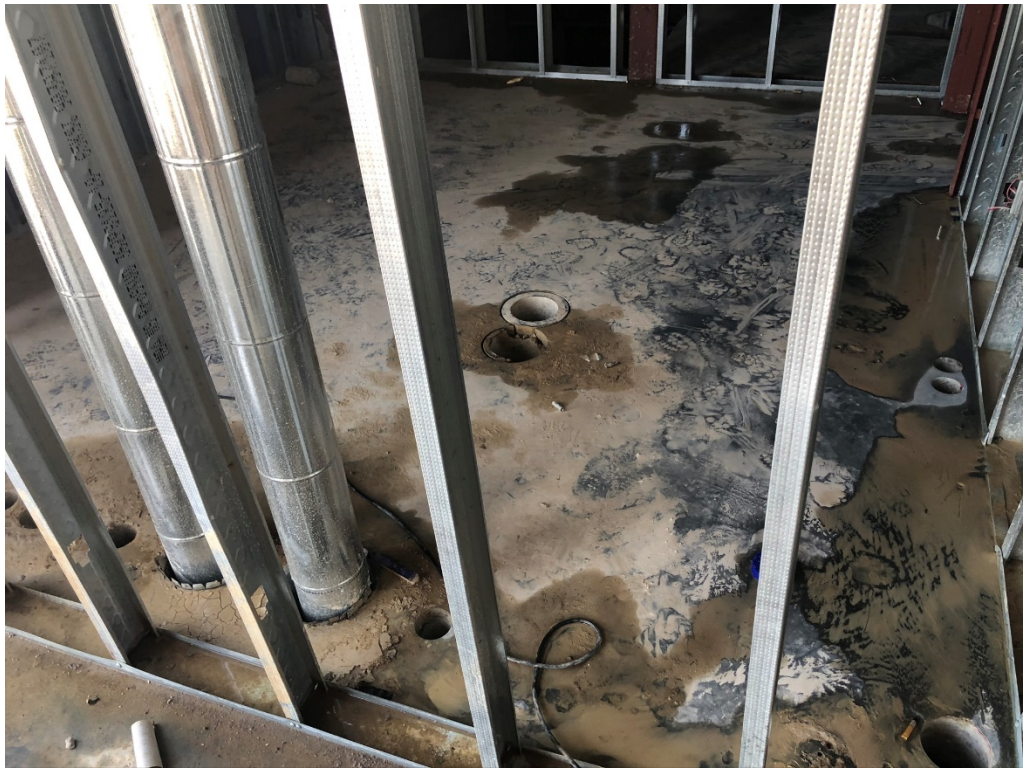
Figure 5 – Core Drills at 2 nd Floor Bathroom