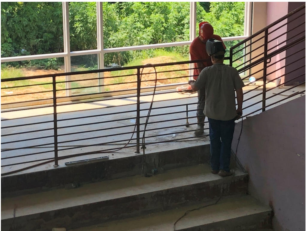
Figure 10 – Handrail Work is Ongoing