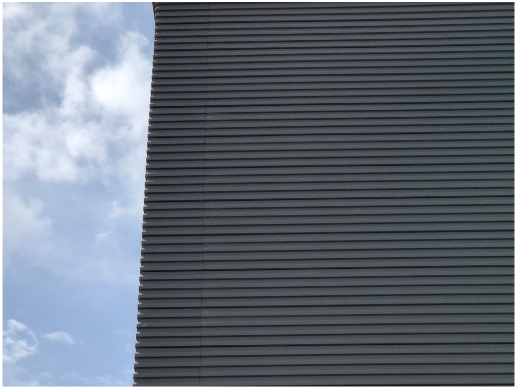
Figure 13 – Mitered Corners at Metal Siding