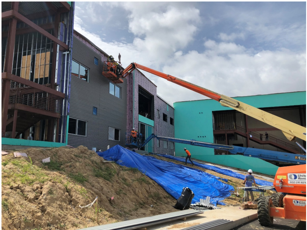
Figure 14 – Metal Siding Install is Ongoing