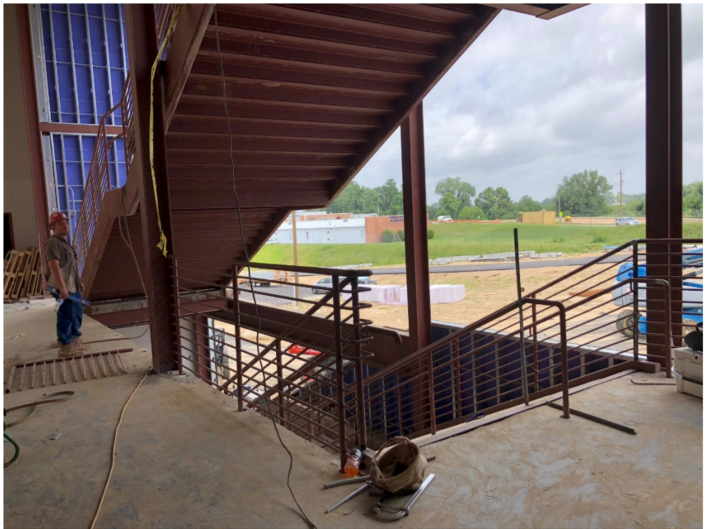
Figure 16 – Handrail Installation at Main Stair