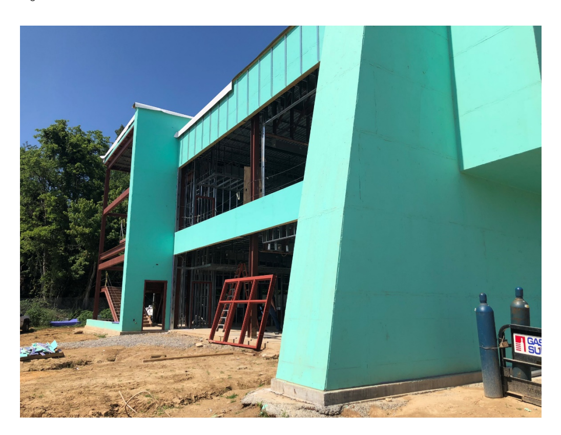
Figure 2 – Northeast Corner of Structure