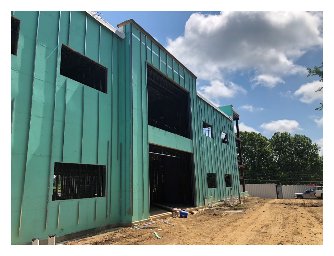
Figure 8 – East Section of Building