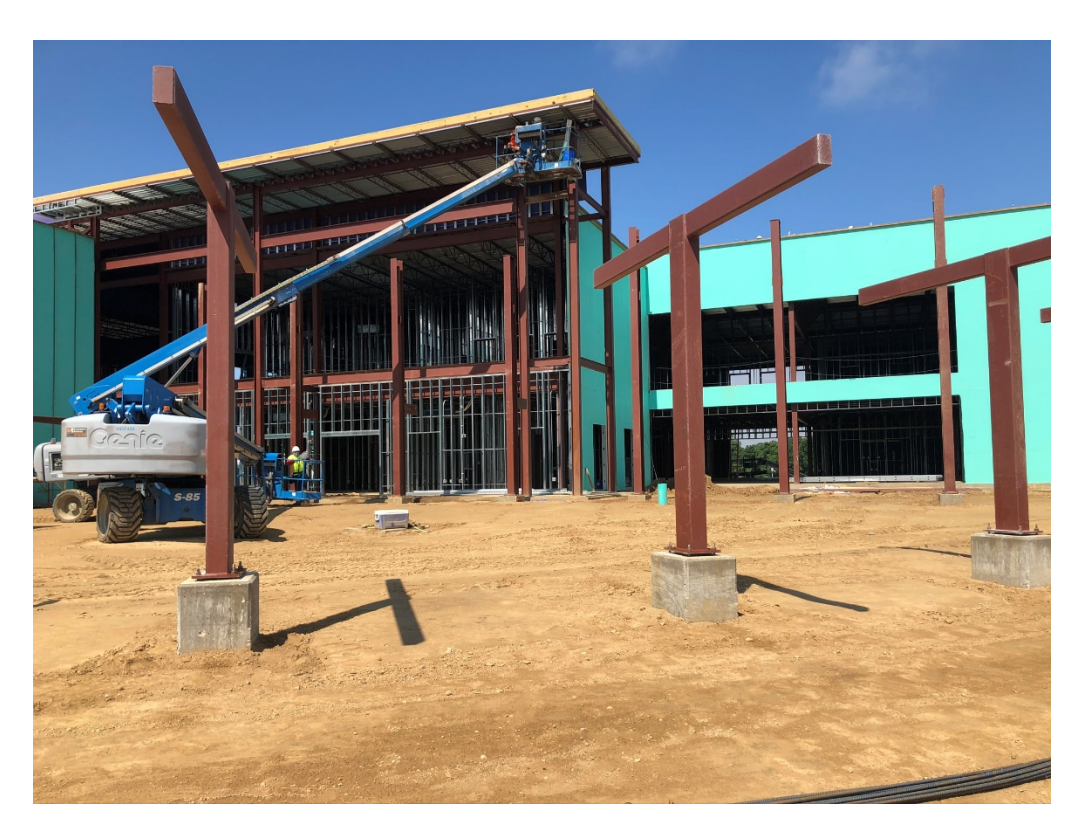
Figure 3 – Soffit Framing Hearing Completion