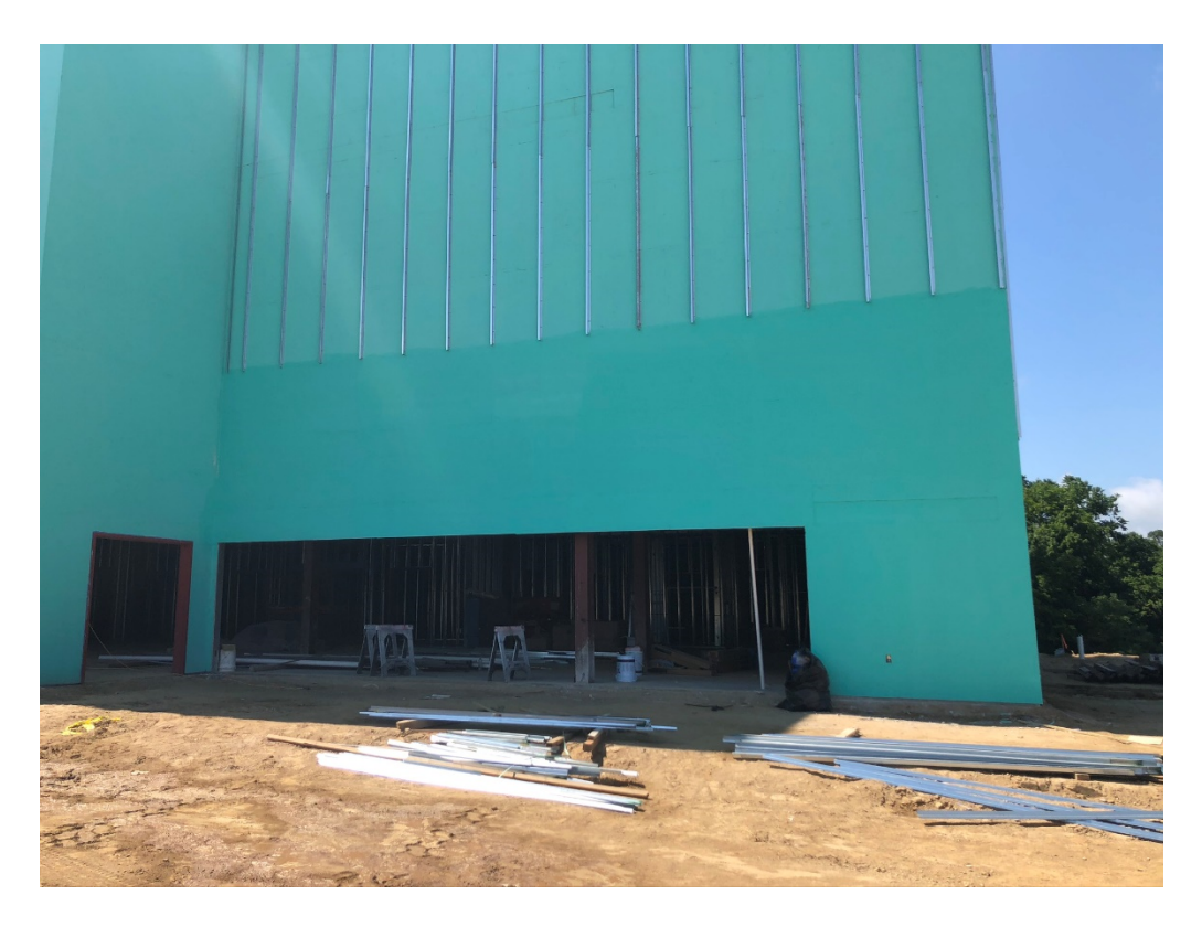
Figure 5 – West Building Seathing