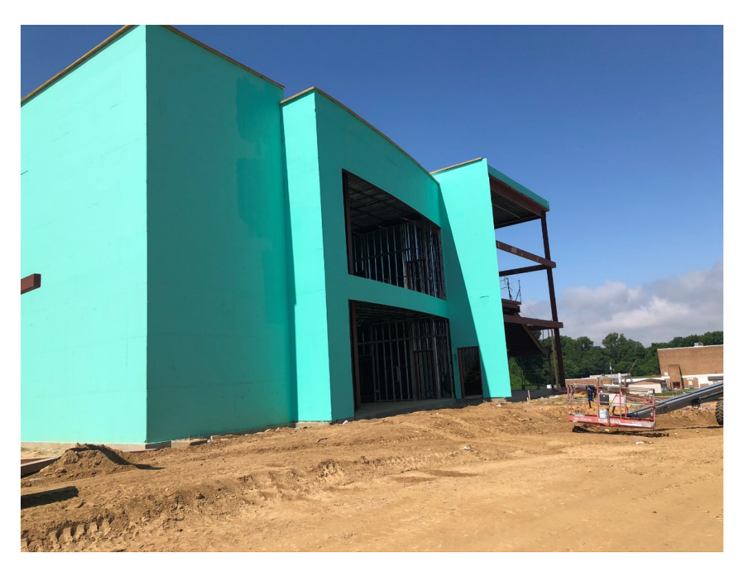
Figure 4 –Exterior Sheathing Nearing Completion; North Section of Building