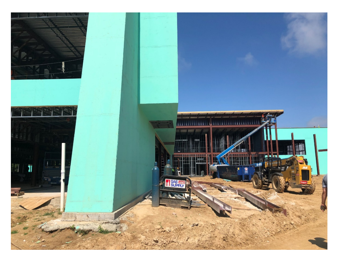
Figure 1 – Northeast Corner of Structure