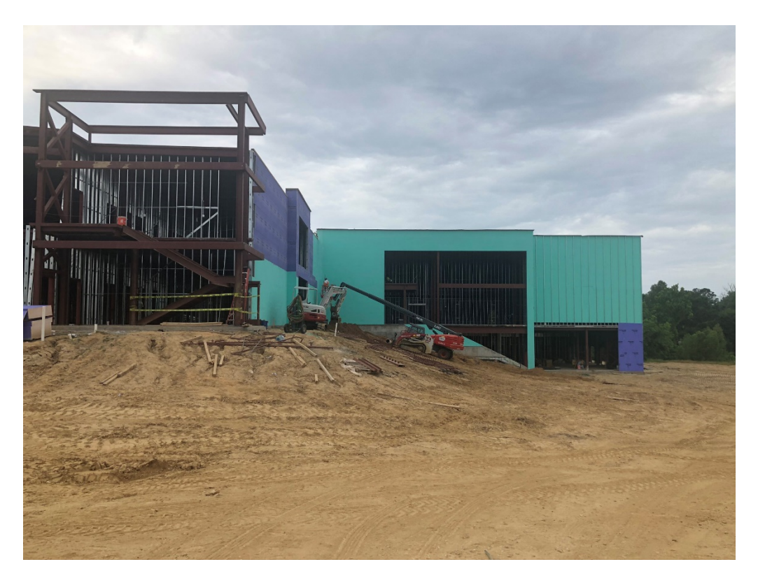
Figure 8 – North Façade at West Wing