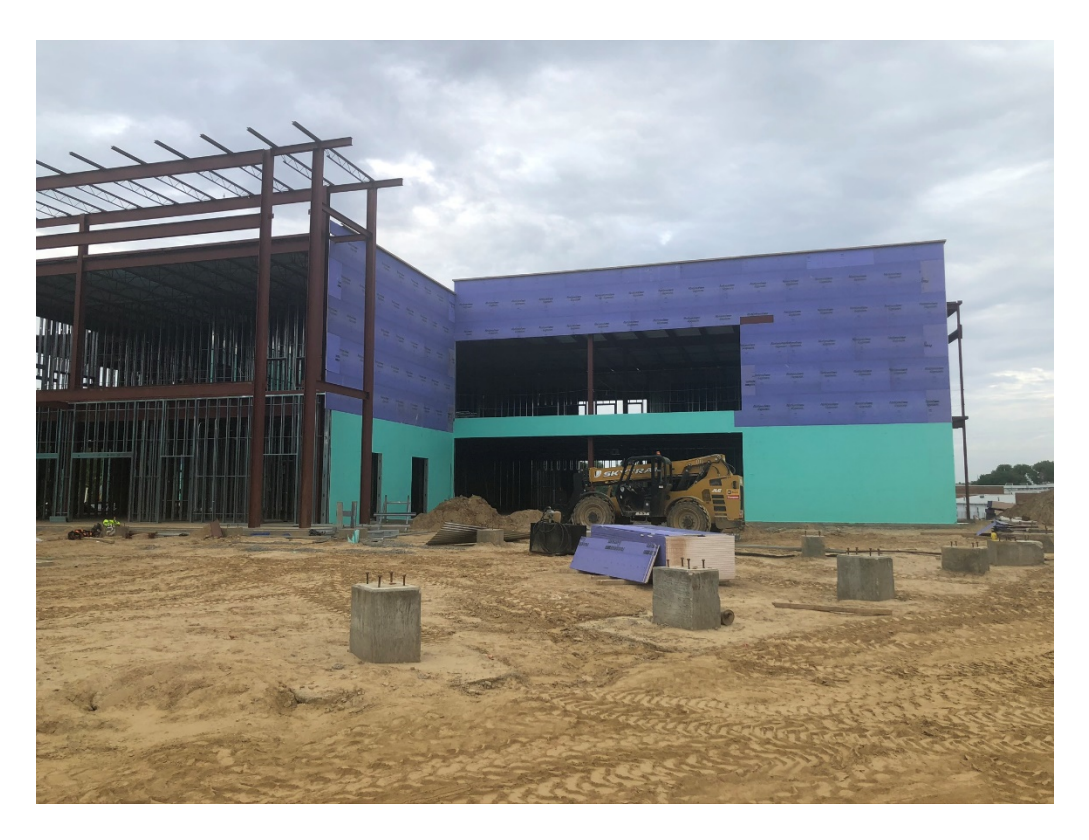
Figure 3 – North Structure Section, East Façade