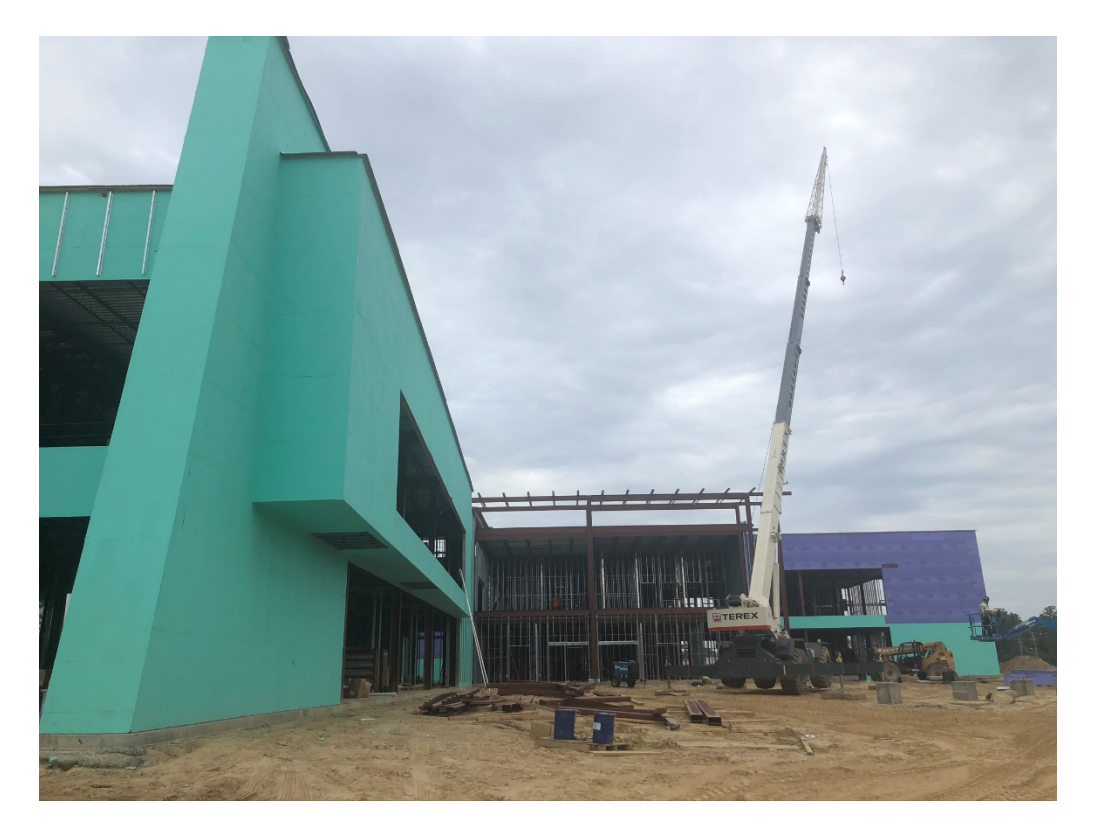
Figure 2 – East Structure North Elevation