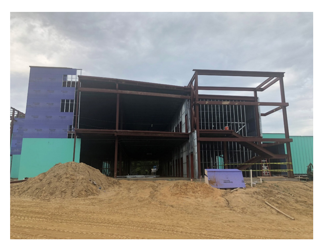
Figure 7 – North Façade at Center Section of Building