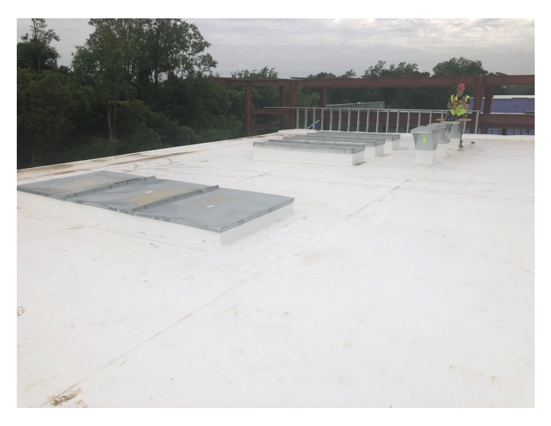
Figure 18 – East Wing Roof membrane and Curbs