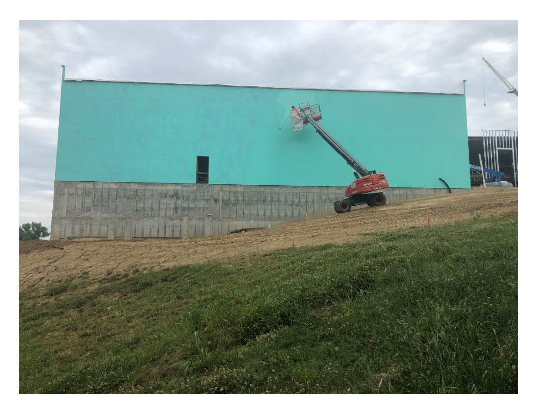
Figure 11 – South Façade at West Wing