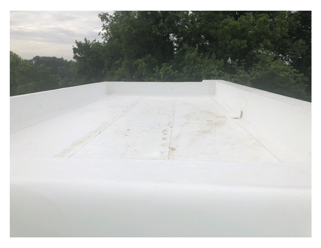
Figure 26 – Stair Well Roof Section