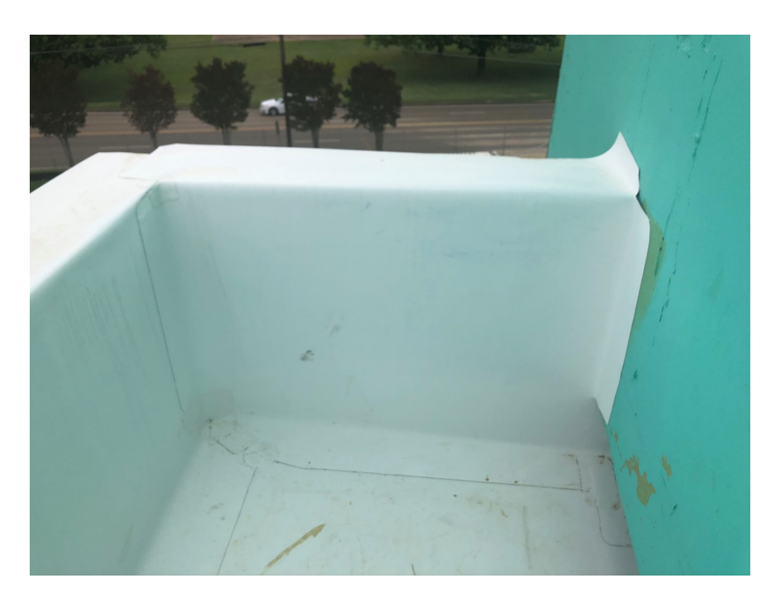
Figure 21 – Parapet Wall Detail to Sidewall Junction