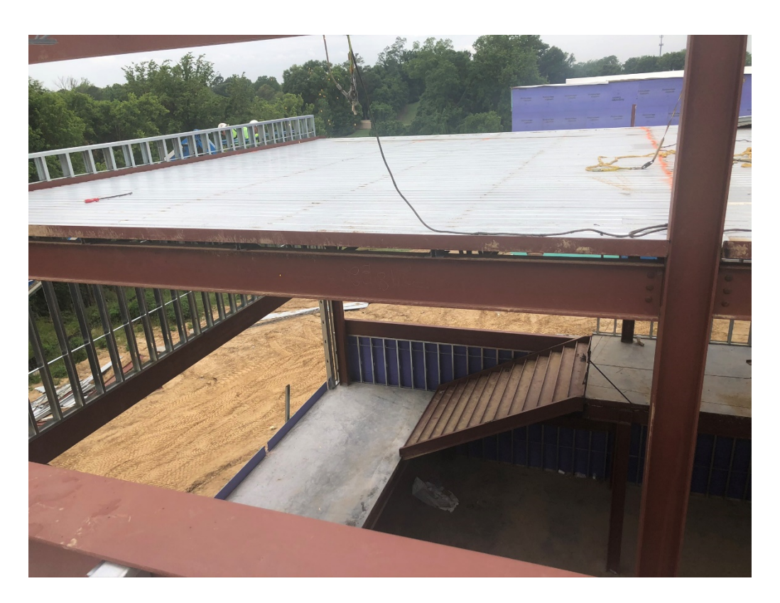
Figure 27 – Metal Decking is Ongoing at Center Section of Building