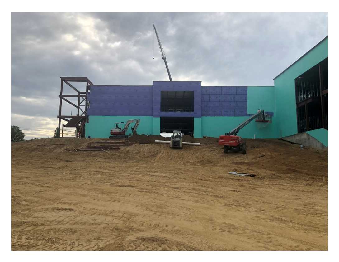
Figure 9 – West Façade at North Wing