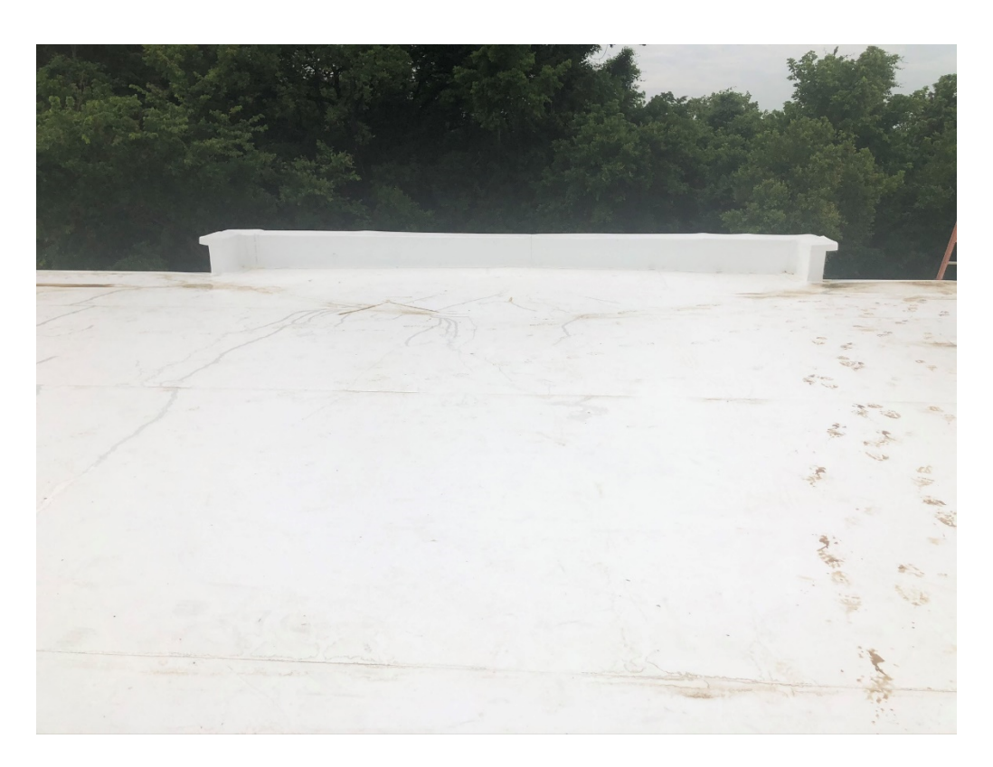
Figure 17 – East Wing Roof membrane Installed