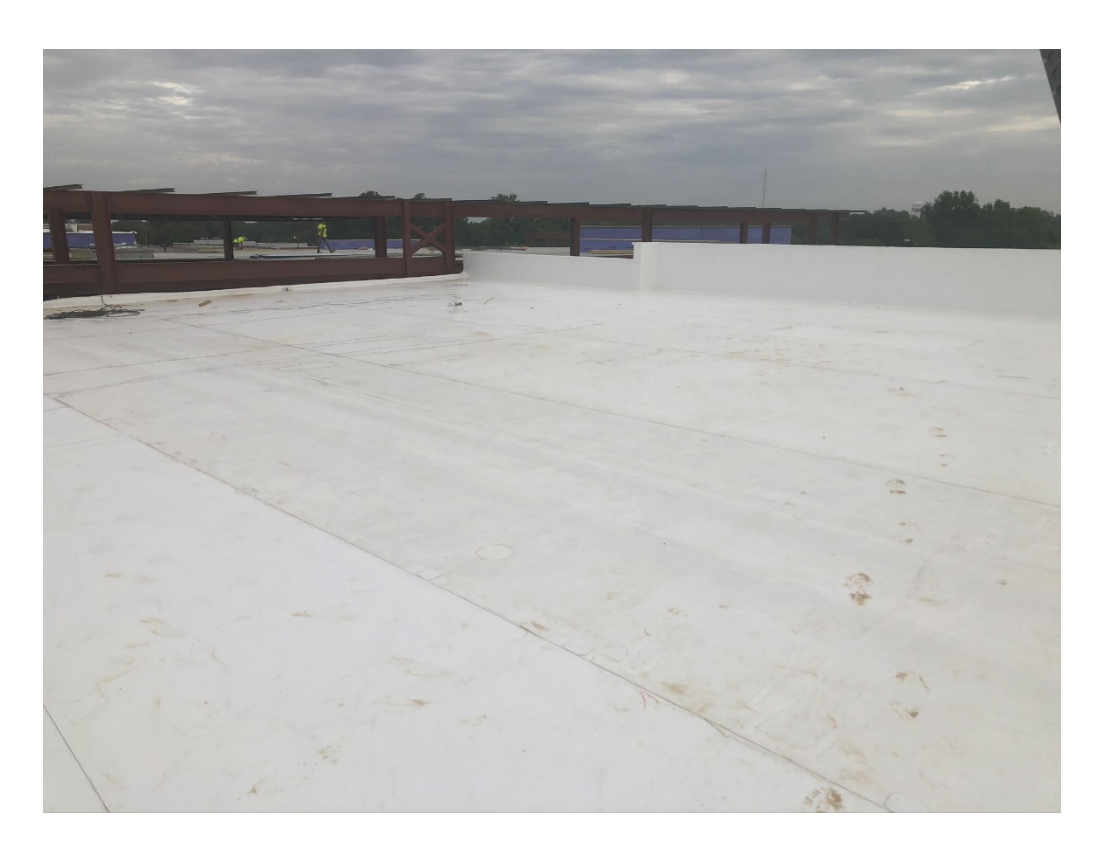
Figure 19 – East Wing Roof membrane Installed