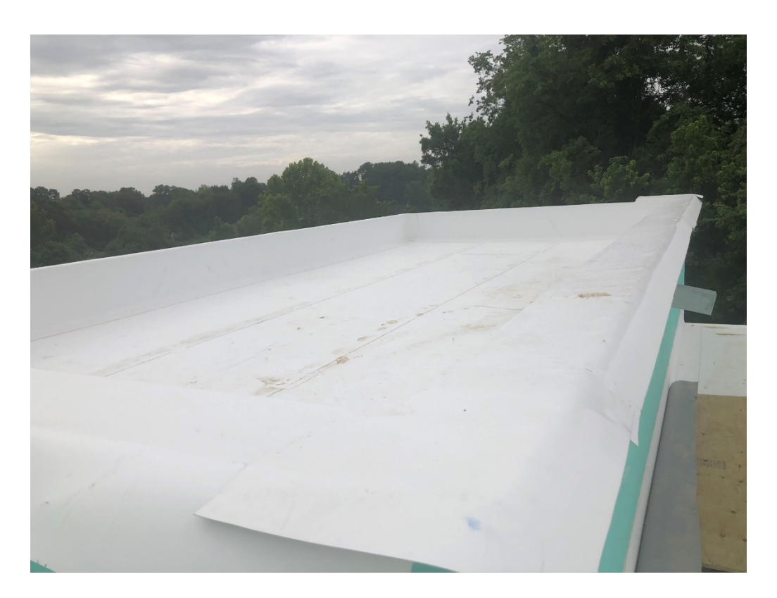
Figure 25 – Stair Well Roof Section