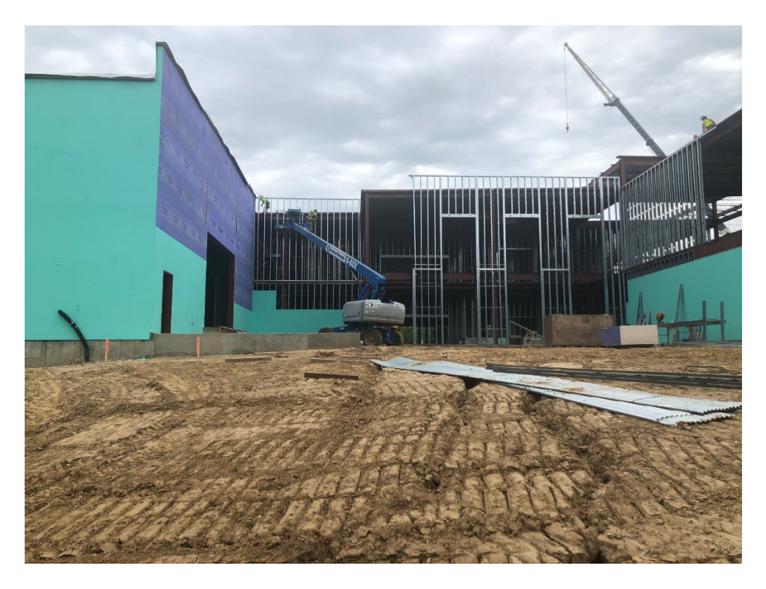
Figure 12 – South Façade at Center Building Section