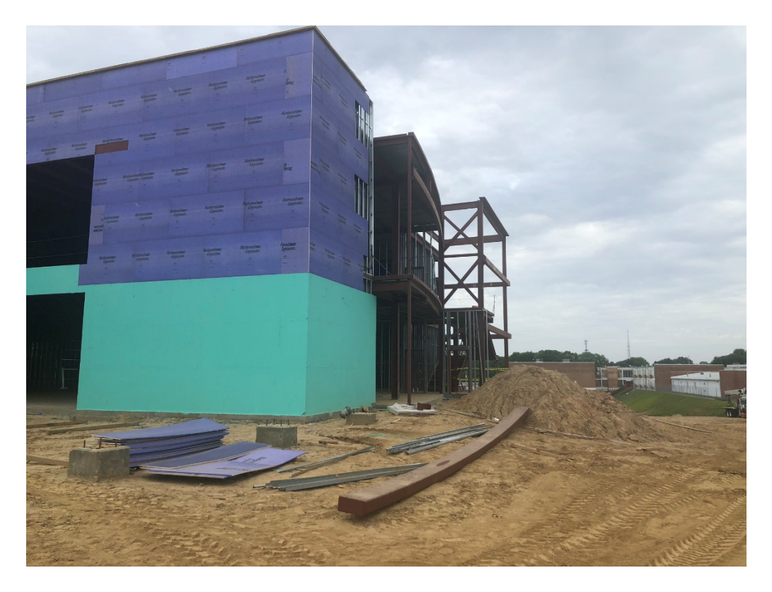
Figure 6 – North Section of Structure