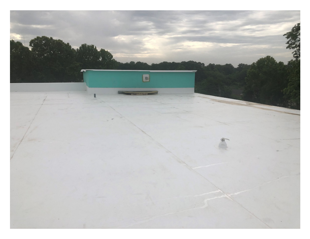
Figure 16 – East Wing Roof membrane Installed