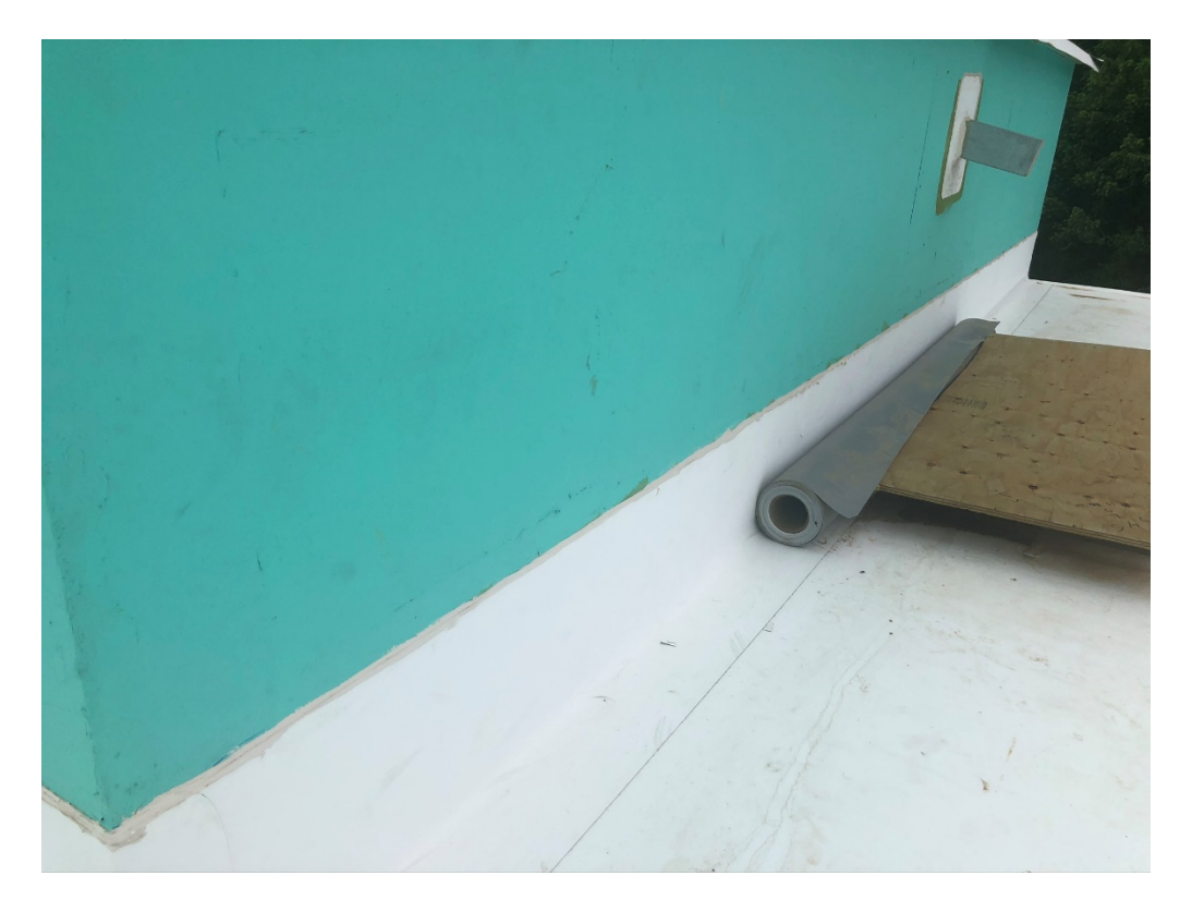
Figure 24 – Stair Well Roof Section Scupper Detail