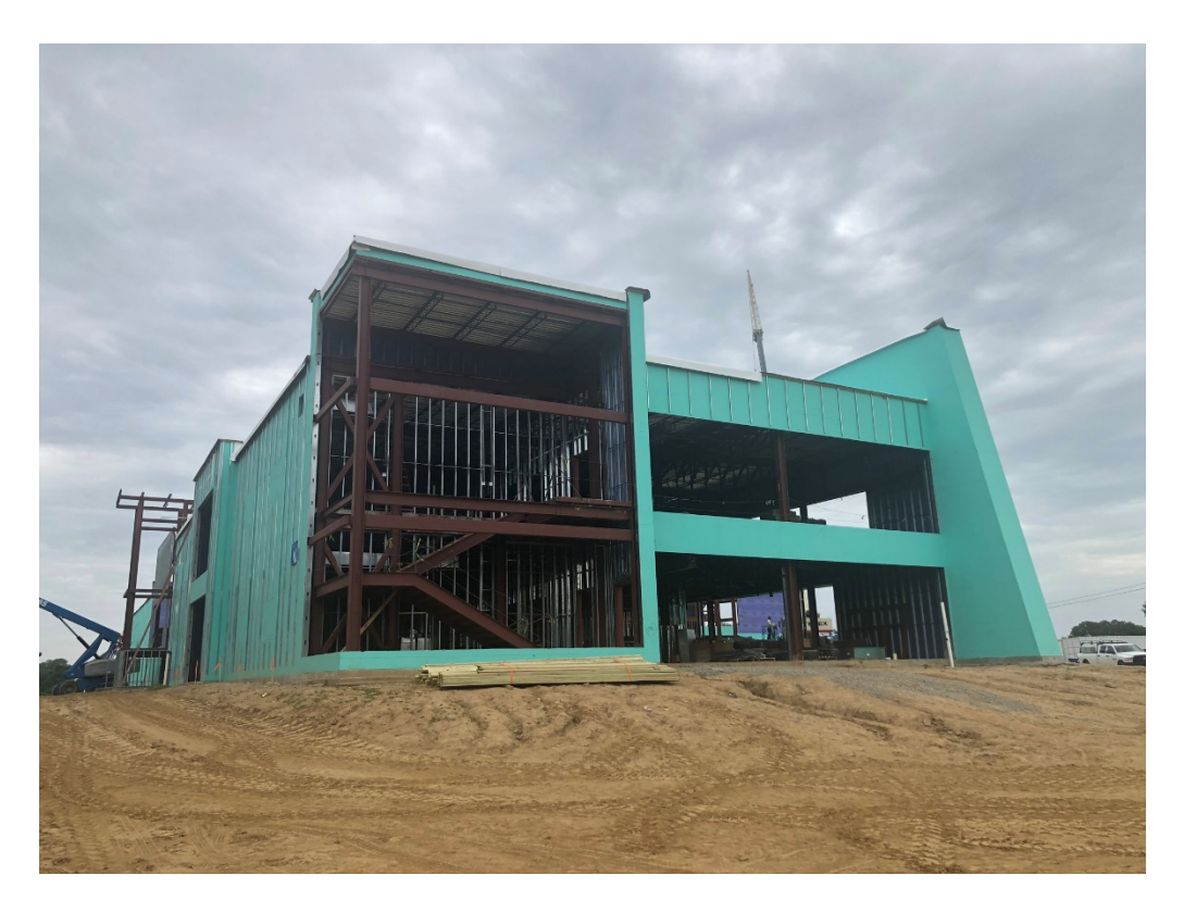
Figure 1 – East Structure