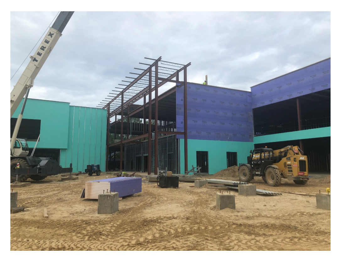
Figure 4 – Main Entry at North Drop Off