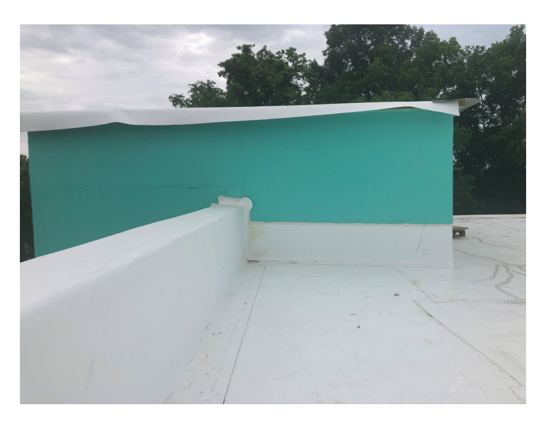
Figure 23 – Stair Well Roof Section