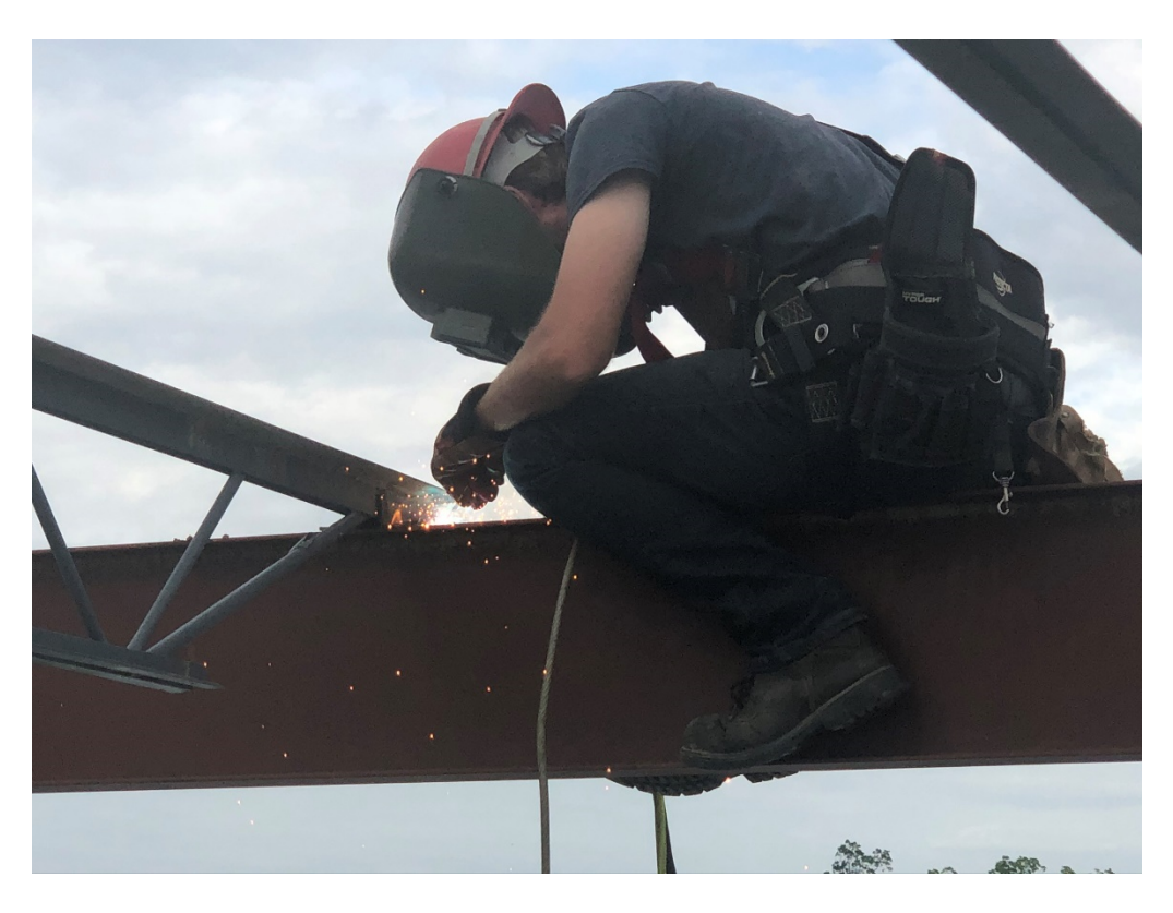
Figure 28 – Roof Joists Rafter Welding