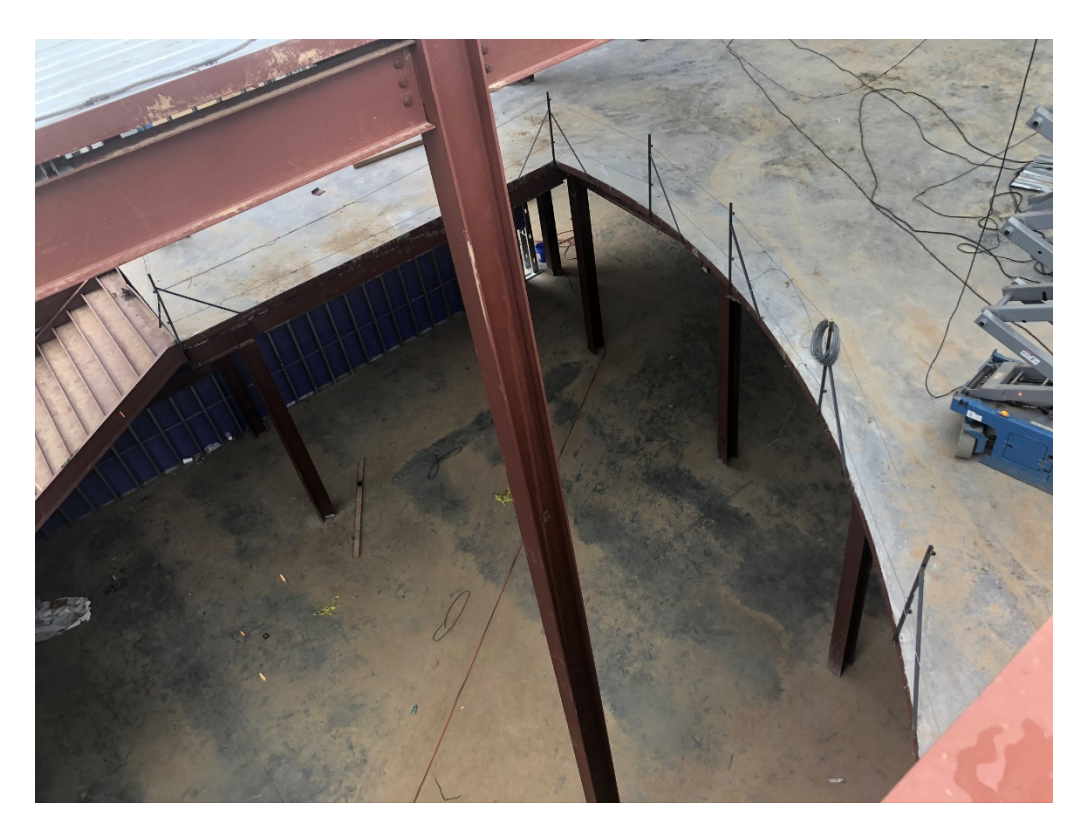
Figure 29 – Main Gathering Space: Curve Looks Good from Above