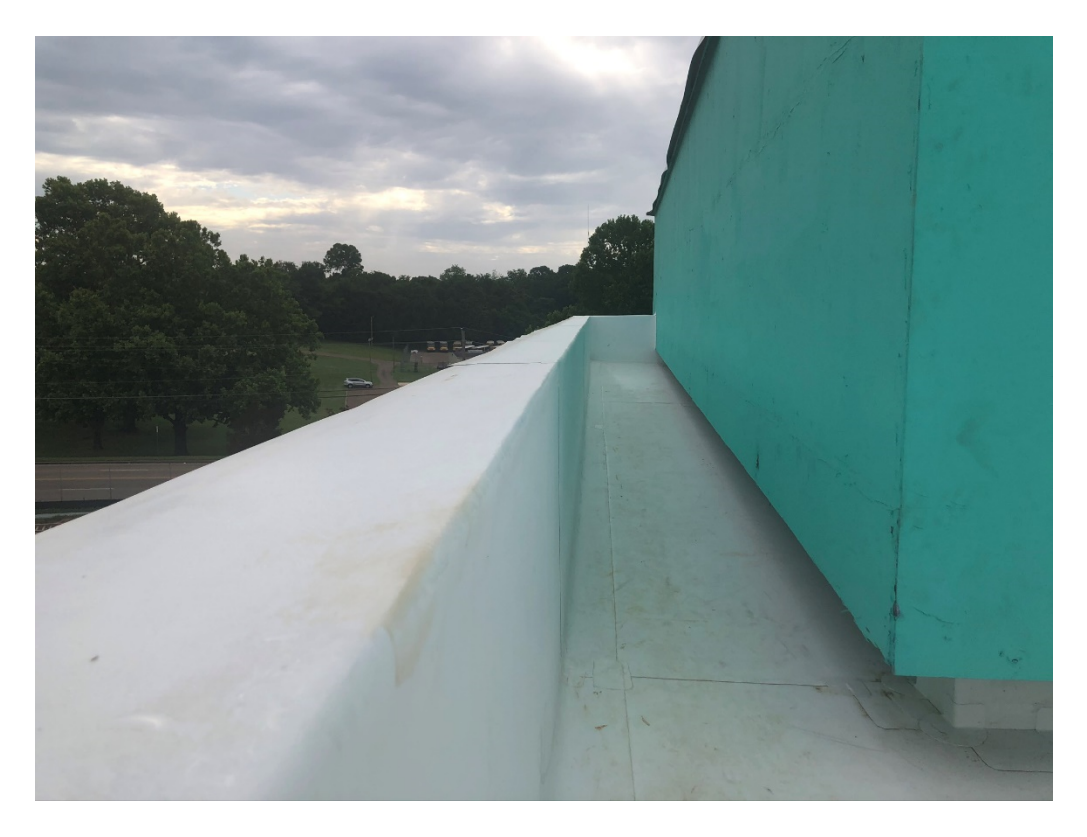
Figure 20 – North Parapet Wall at East Wing