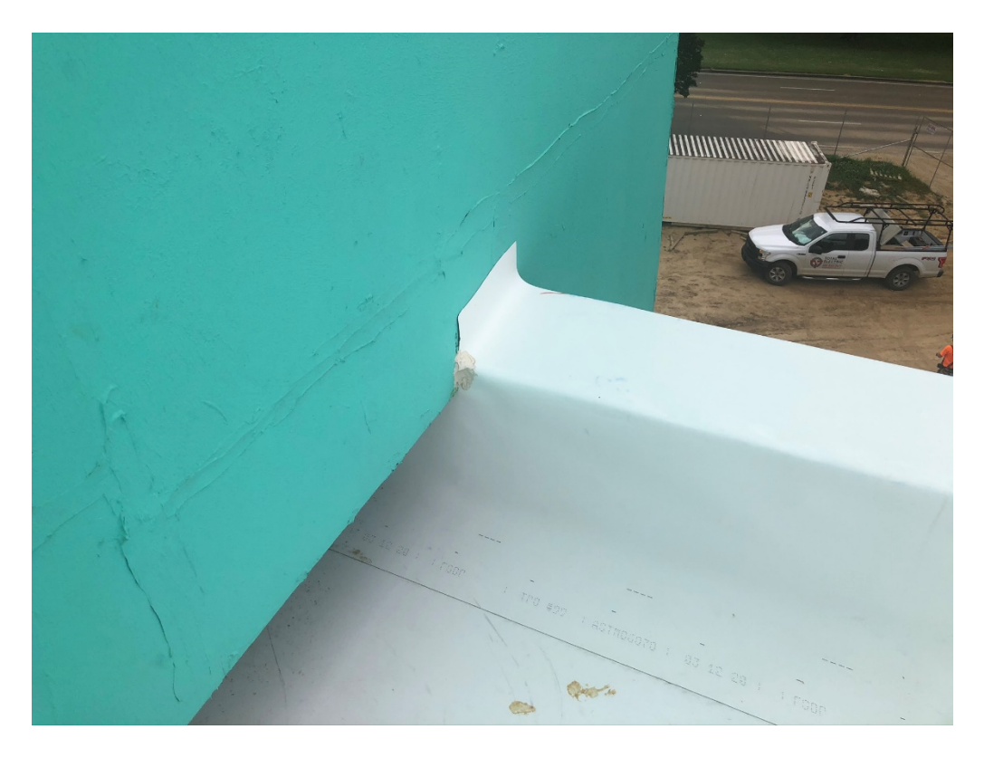
Figure 22 – Parapet Wall Detail to Sidewall Junction at East Side