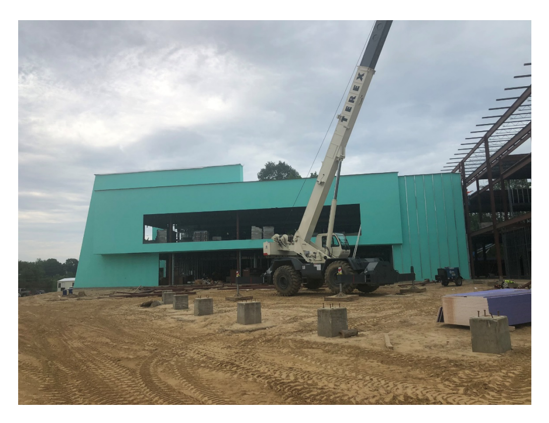
Figure 5 – North Façade, East Wing