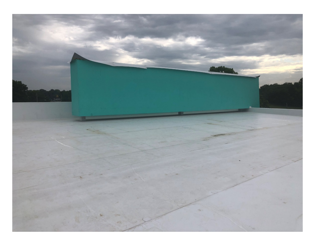
Figure 15 – East Wing Roof membrane Installed