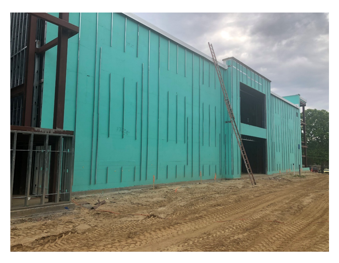
Figure 13 – South Façade at East Wing