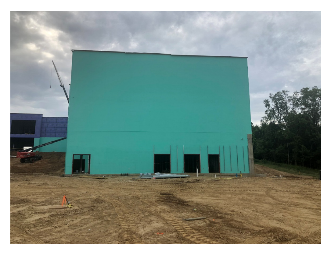
Figure 10 – West Façade at West Wing