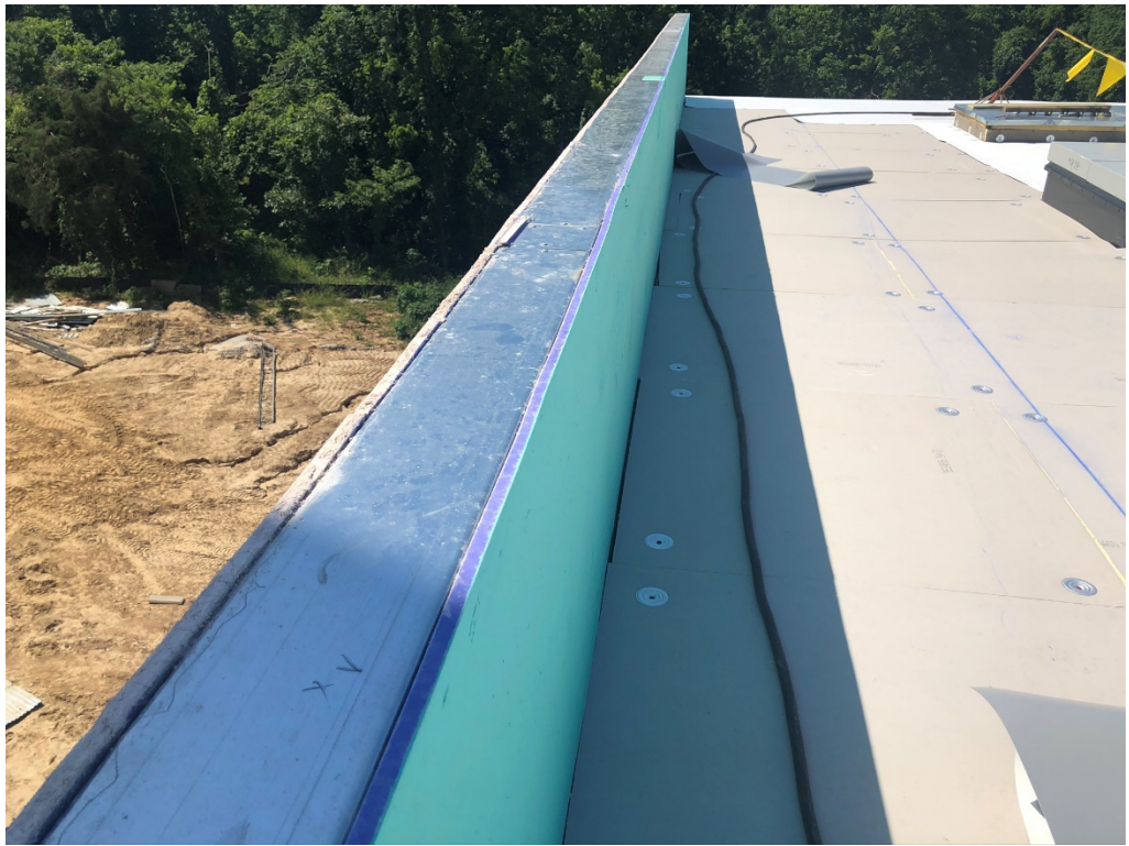
Figure 11 – West Section of Roof Parapet