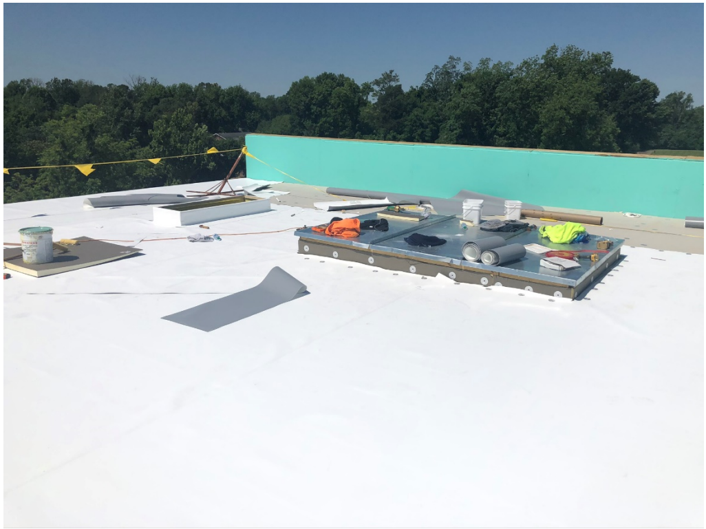
Figure 13 – Roofing is Ongoing