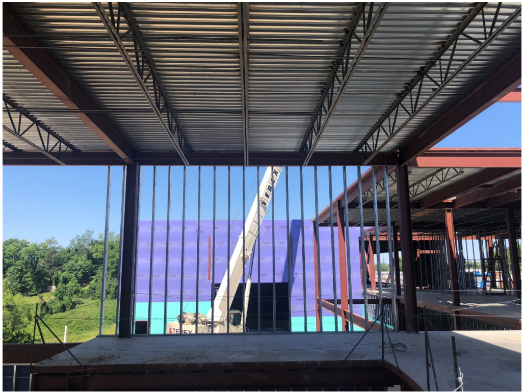
Figure 3 – Exterior Wall Light Gauge Framing Ongoing