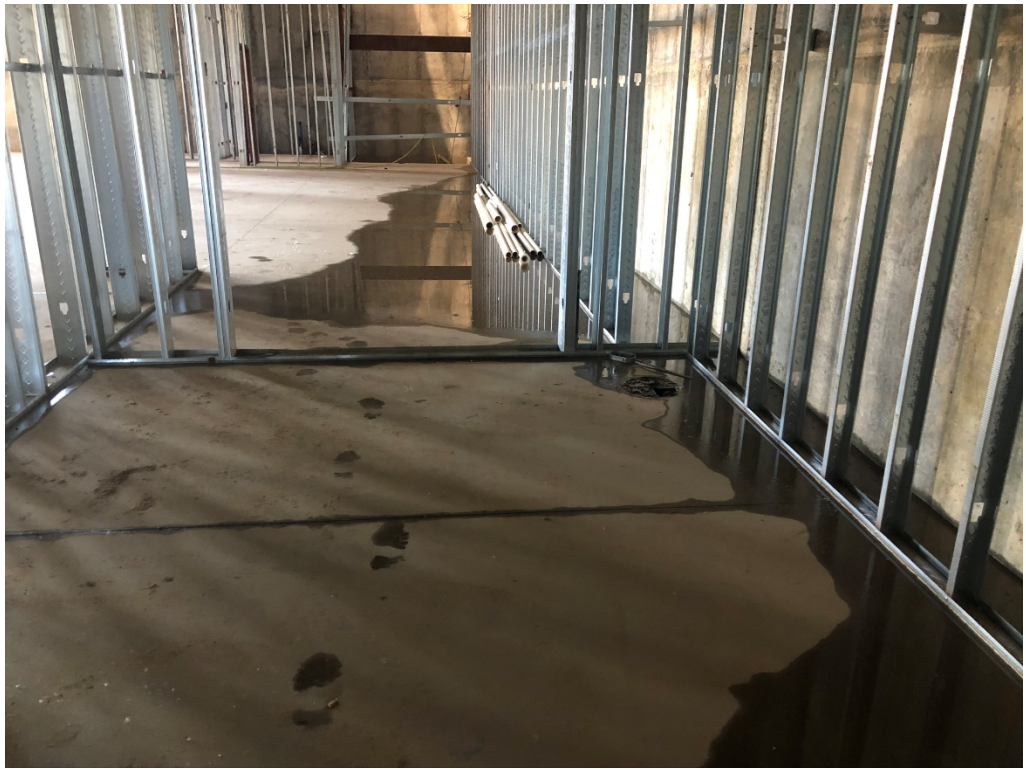
Figure 19 –Lower Level Foundation Wall; Water is most likely from rain intrusion