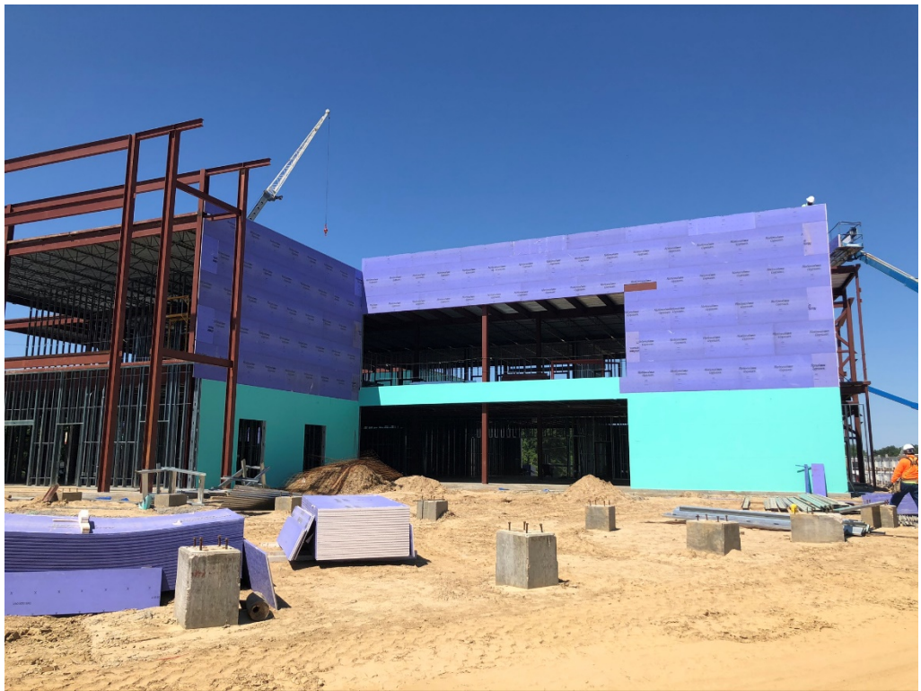
Figure 20 – North Elevation on West End of Structure