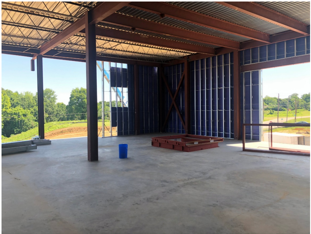
Figure 6 – North Upper Versatile Teaching Space