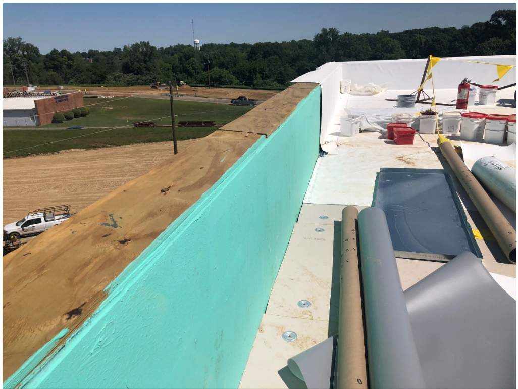
Figure 14 –West Parapet