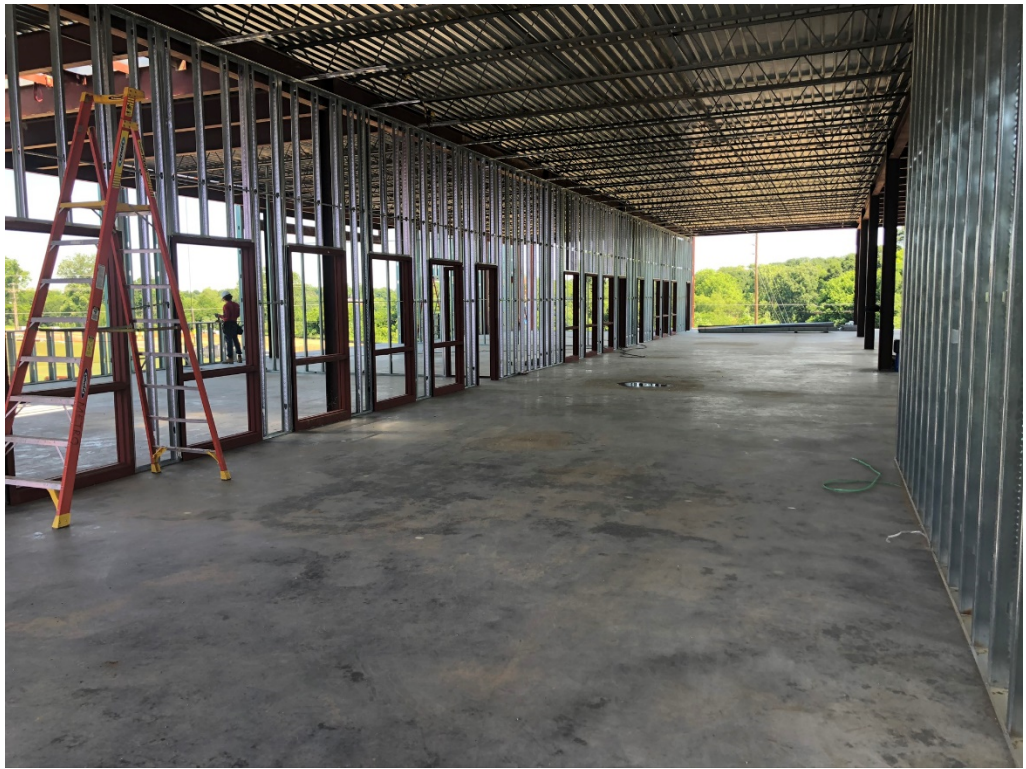
Figure 5 – Upper Level Interior Framing