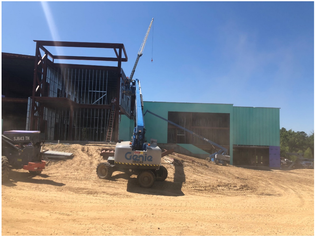
Figure 23 – North Entry Look S