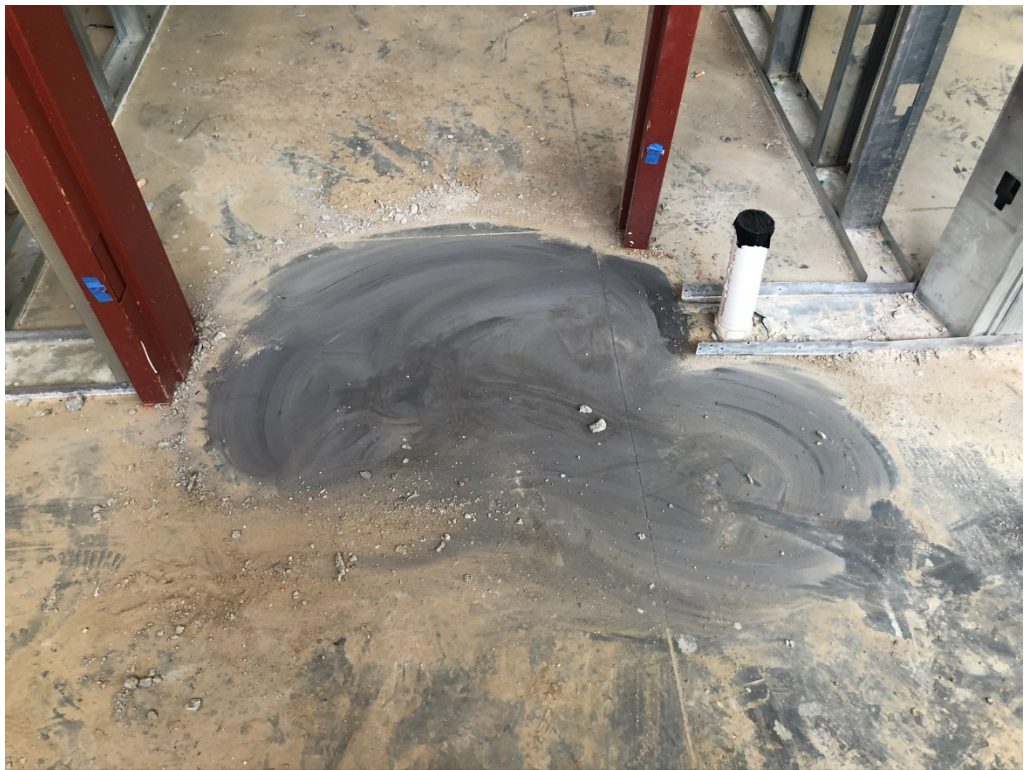
Figure 16 – A rough Patch has been made here (Data 126); Will this be Repaired Further?