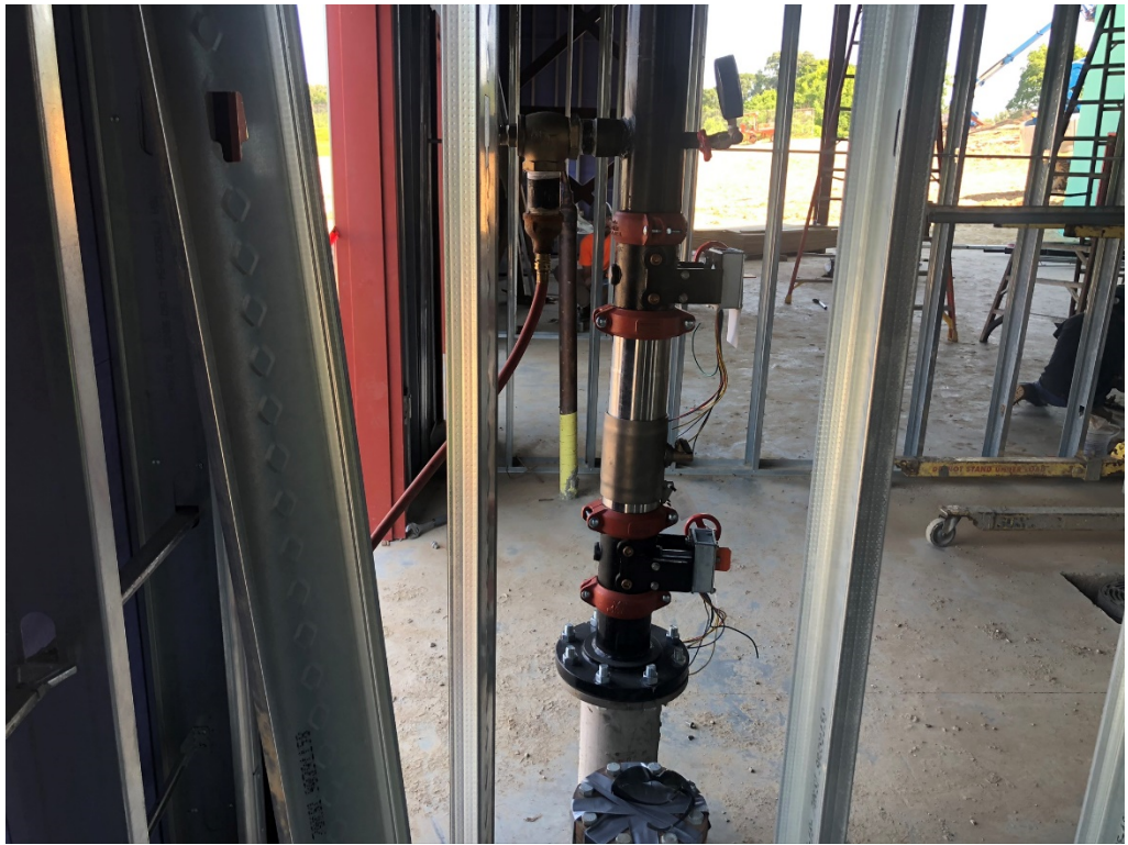
Figure 17 – Sprinkler System Work in Ongoing