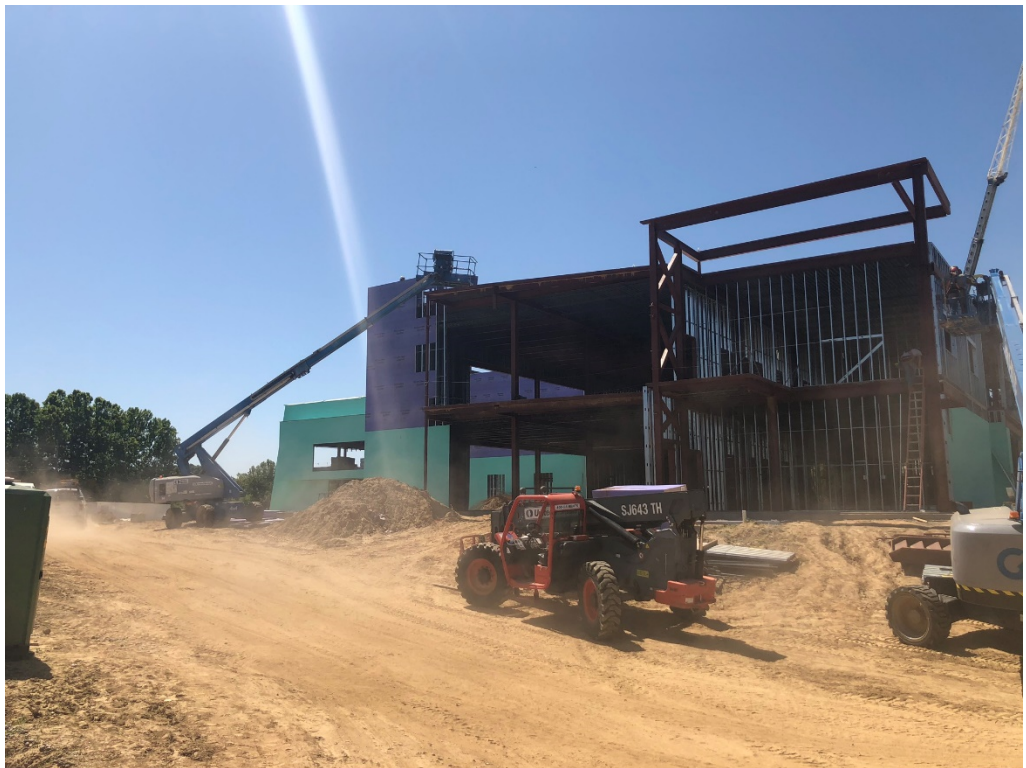
Figure 22 – North Entry Look SE