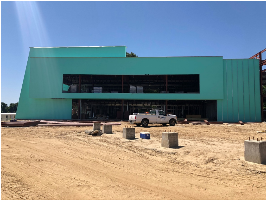
Figure 21 – North Elevation on East End of Structure