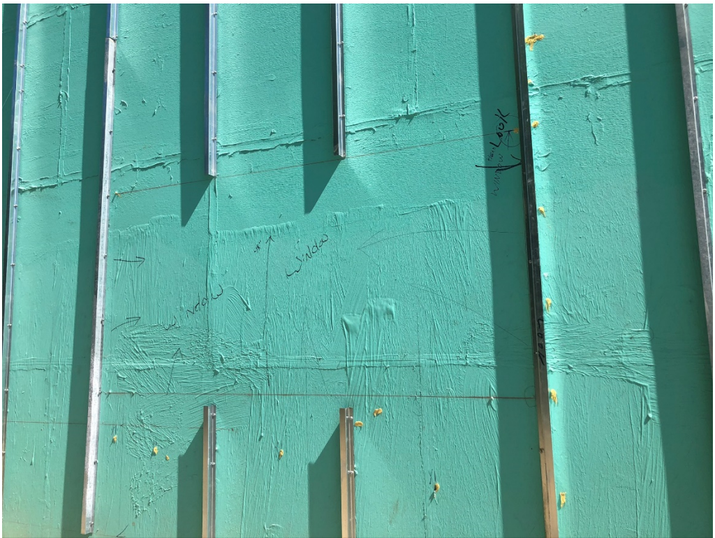
Figure 2 – Furring Installed at Waterproofed Exterior