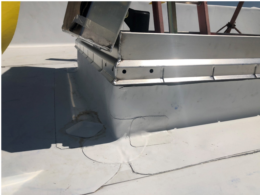
Figure 8 – West Section of structure roof Hatch Detail