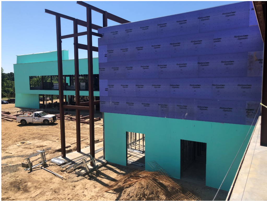
Figure 7 – Upper Level Looking SE; exterior sheathing is ongoing