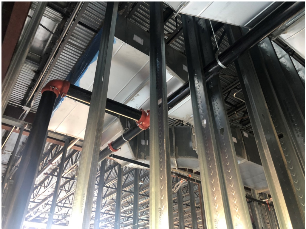
Figure 18 – Sprinkler System Work in Ongoing