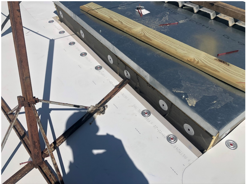
Figure 12 –Roof Curb Detail