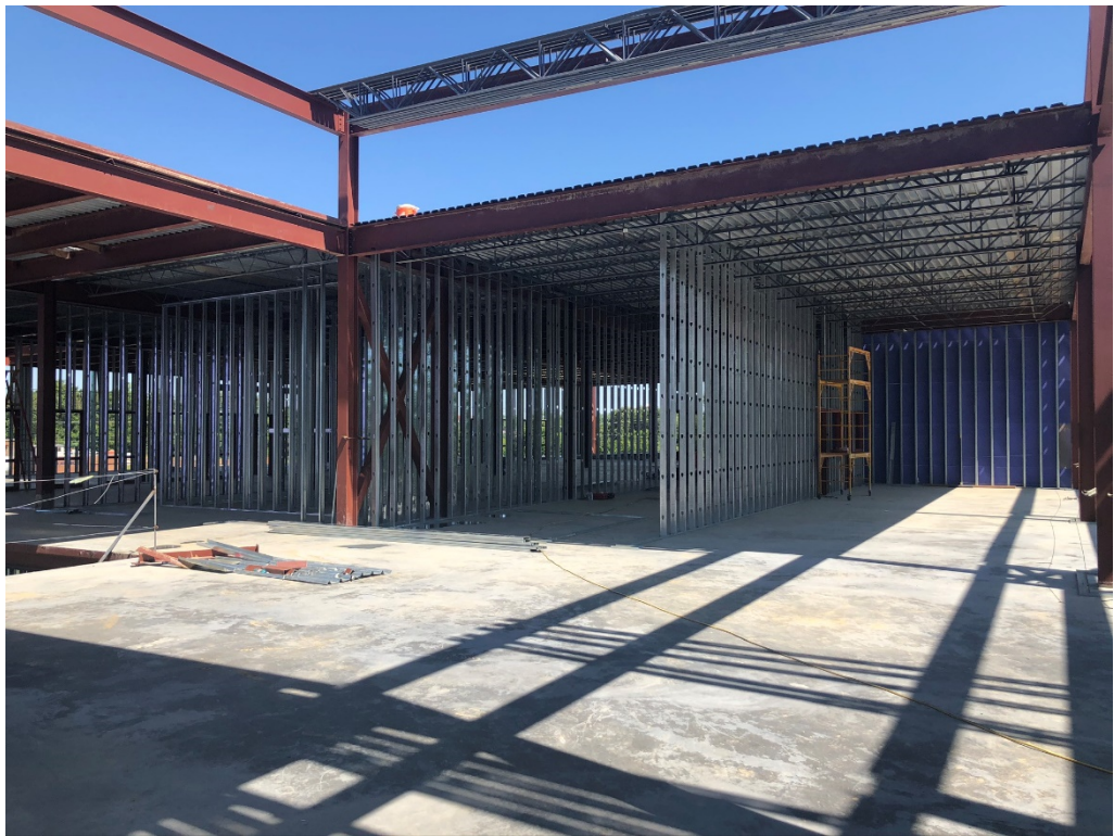
Figure 4 – Interior Framing at Upper Level in ongoing