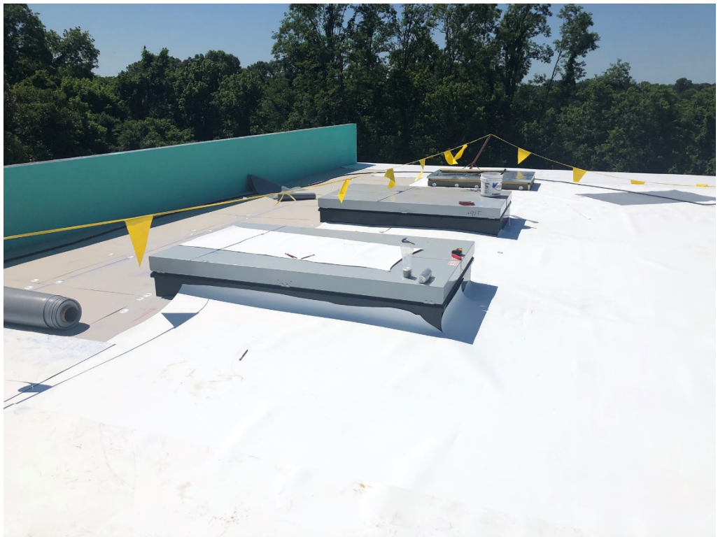
Figure 10 – Furr Down @ Stairwell