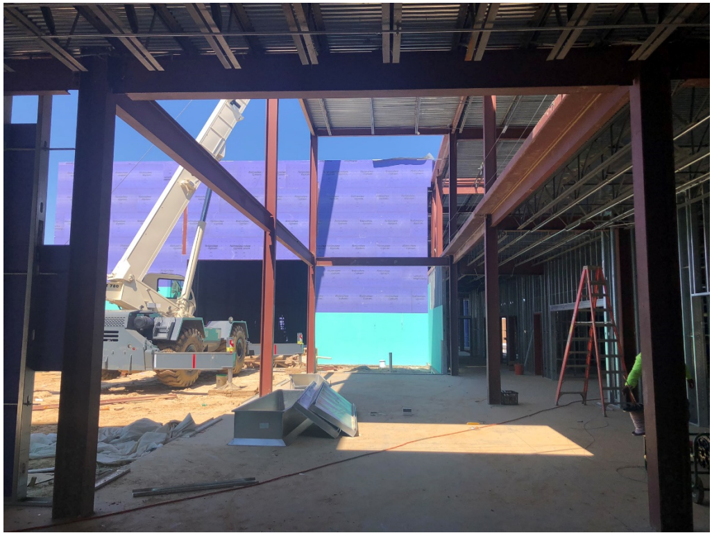
Figure 15 – First Level Lobby 151