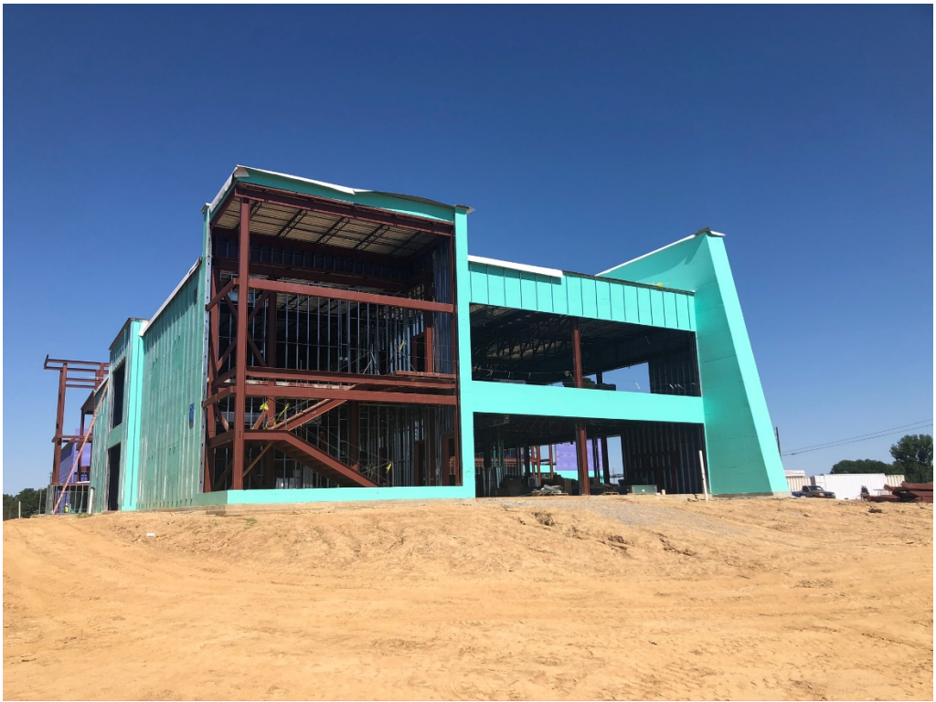
Figure 1 – East Structure