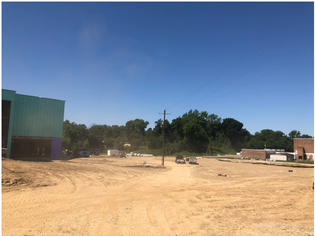
Figure 24 – North Entry Look SW