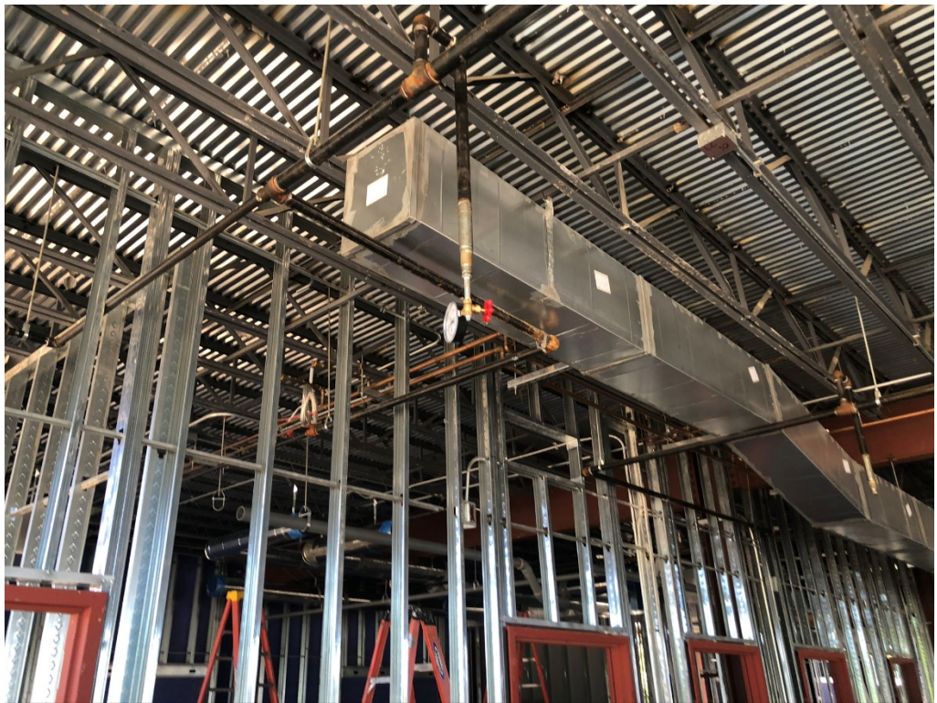
Figure 2 – Pressure Test on Sprinklers Ongoing in east section