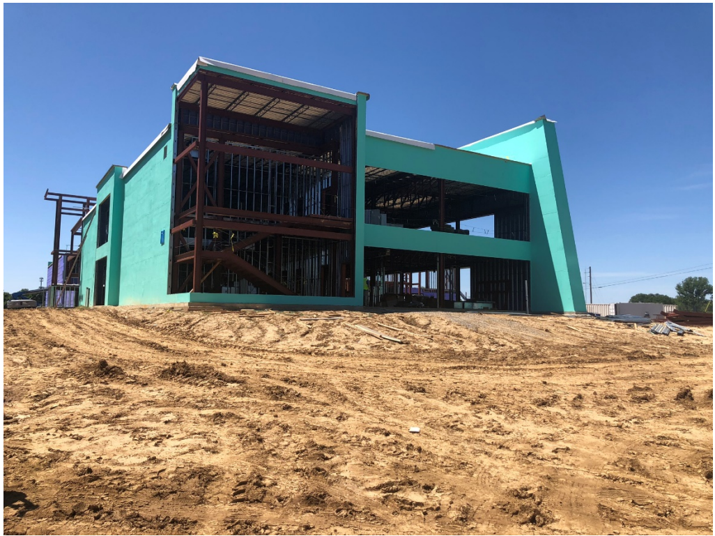
Figure 1 – East Structure