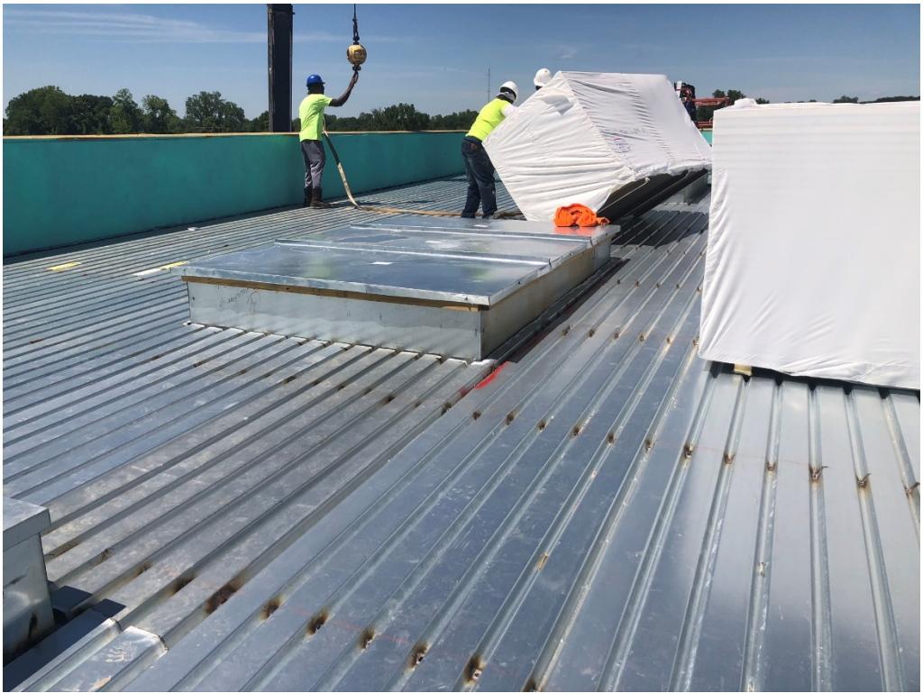
Figure 15 – Roofing Material Lifted