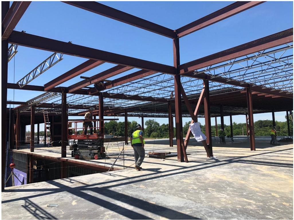
Figure 7 – Central Building Section Roof Framing