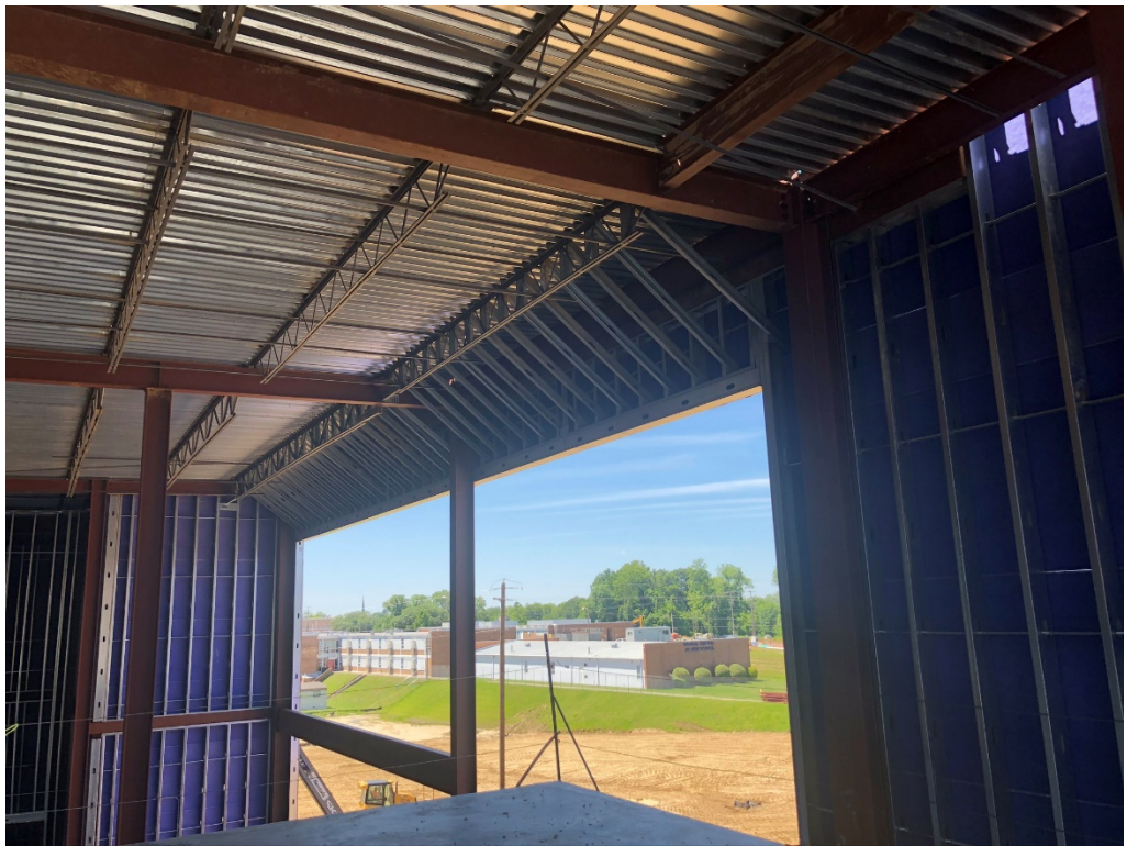
Figure 10 – Furr Down @ Stairwell