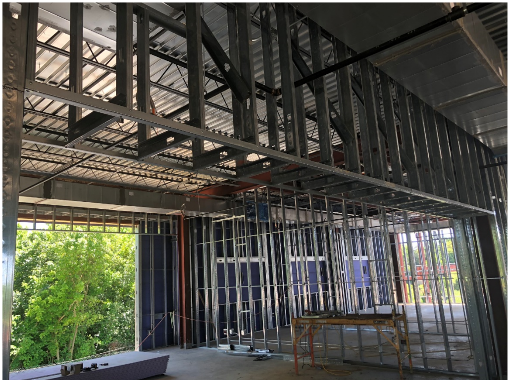
Figure 4 – Furr Downs Installed Throughout East Building Section