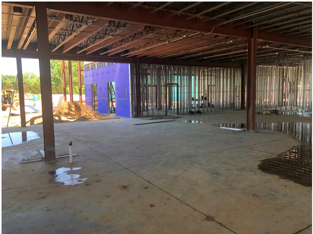
Figure 28 – Interior Framing @ Middle Floor: Teaching Space 120