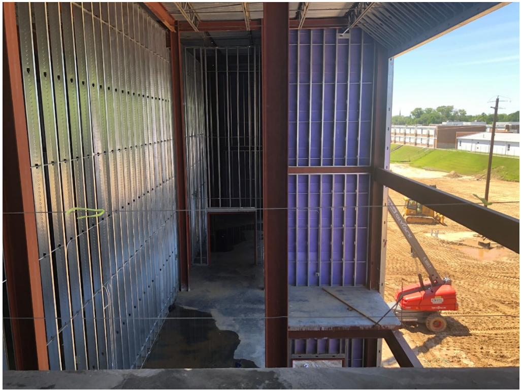
Figure 11 – Main Stairwell