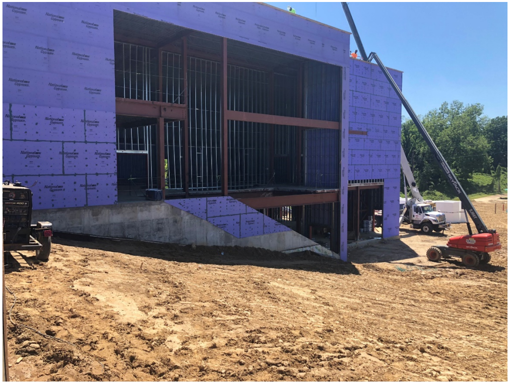
Figure 29 – Exterior Sheathing Is Ongoing