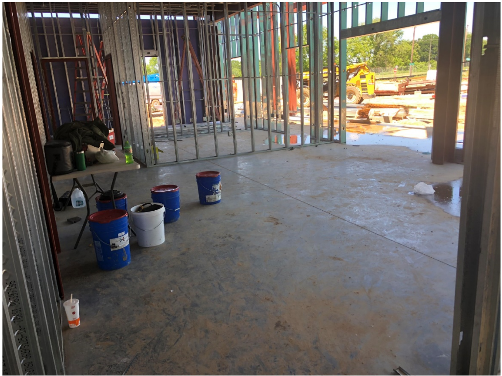
Figure 21 – Interior Framing @ Middle Floor: Reception 101