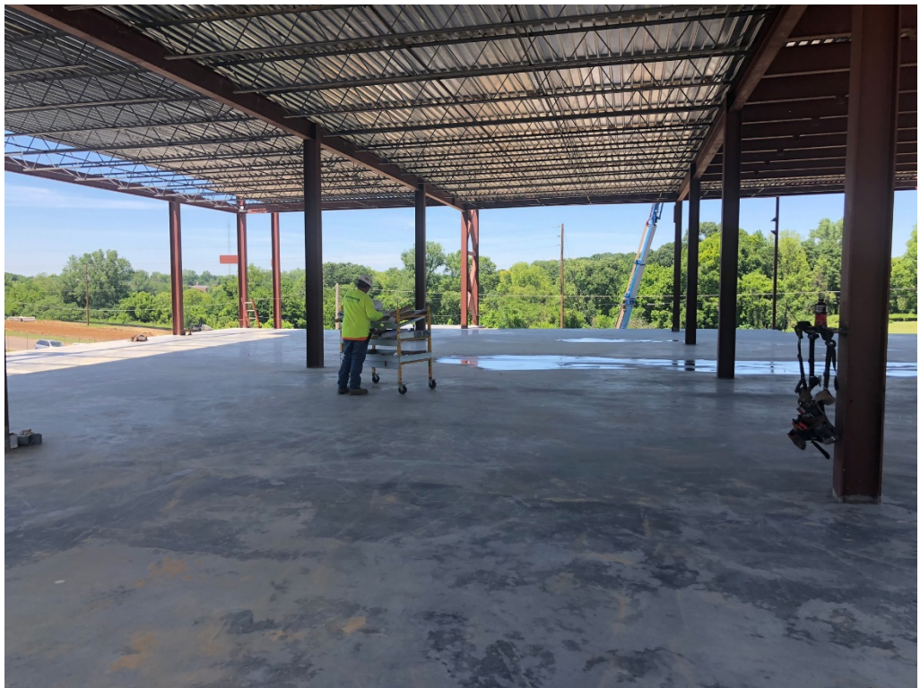
Figure 8 – Decking Installed at Central Roof Section