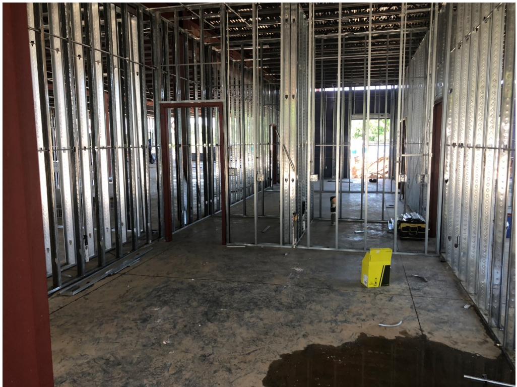
Figure 22 – Interior Framing @ Middle Floor: TWR 106