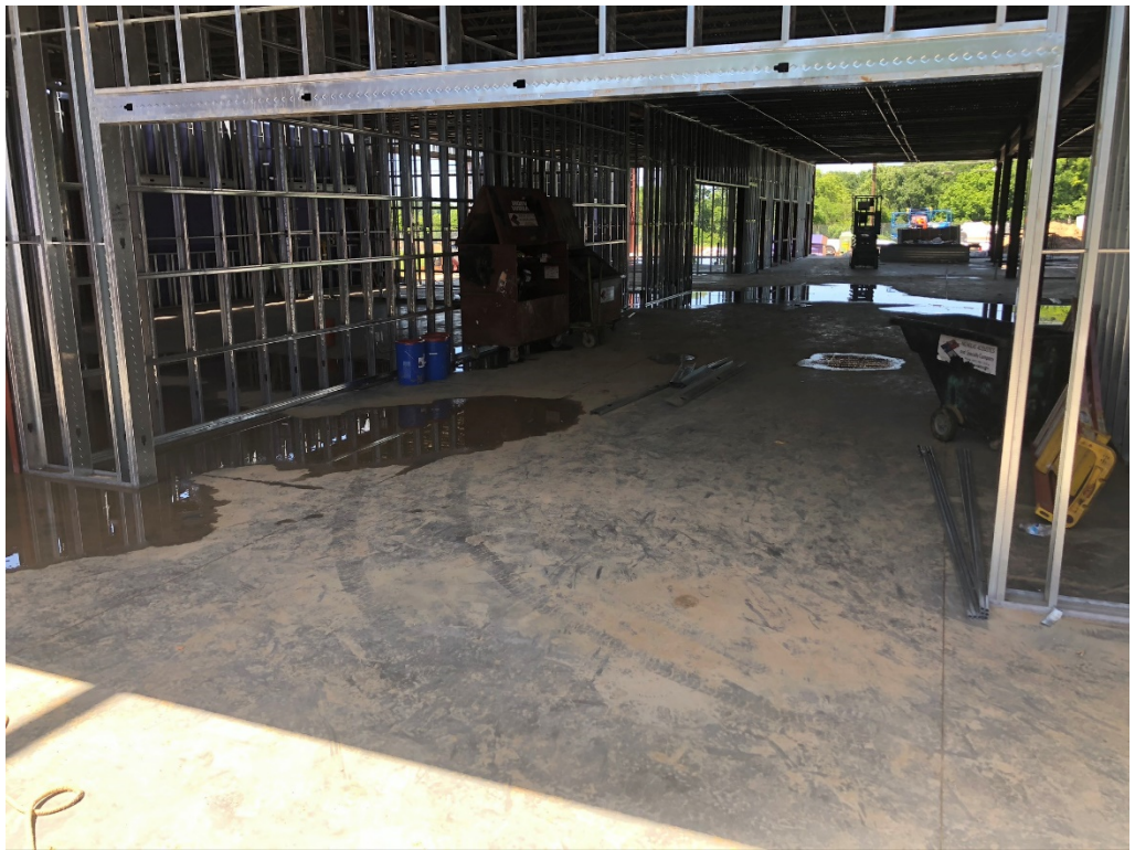
Figure 24 – Interior Framing @ Middle Floor: Entry to Teaching Space 120