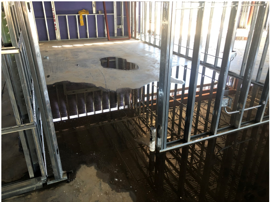
Figure 26 – Interior Framing @ Middle Floor: Sped 122