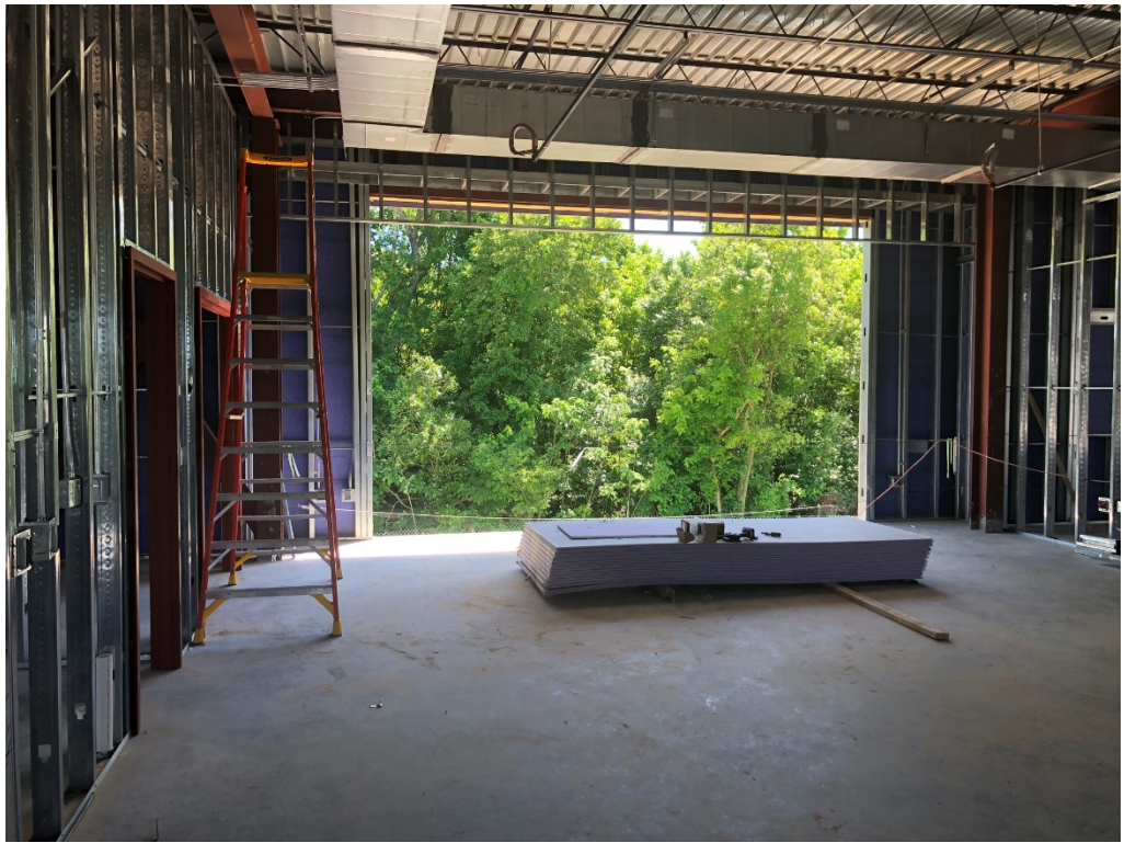
Figure 5 – Furr Downs also Installed at Windows