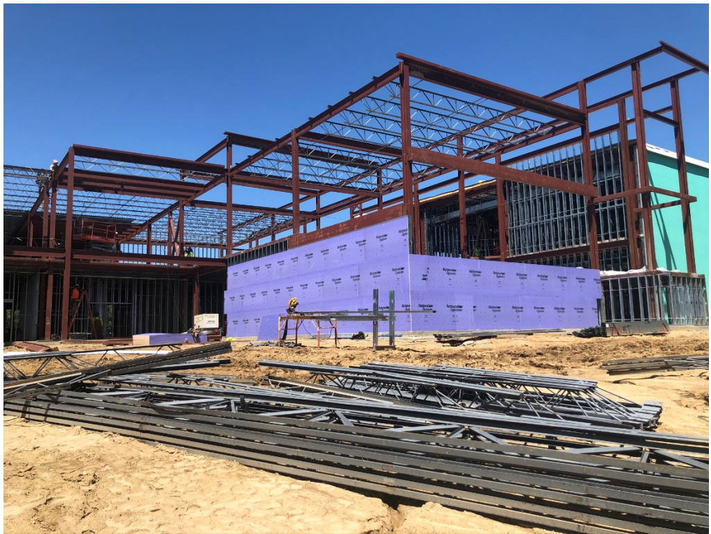
Figure 32 – South Elevation of Central Building Portion