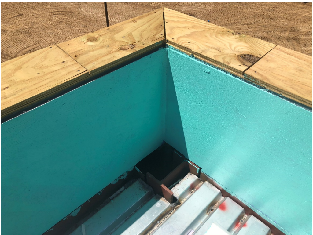
Figure 16 –Corner of Parapet Walls