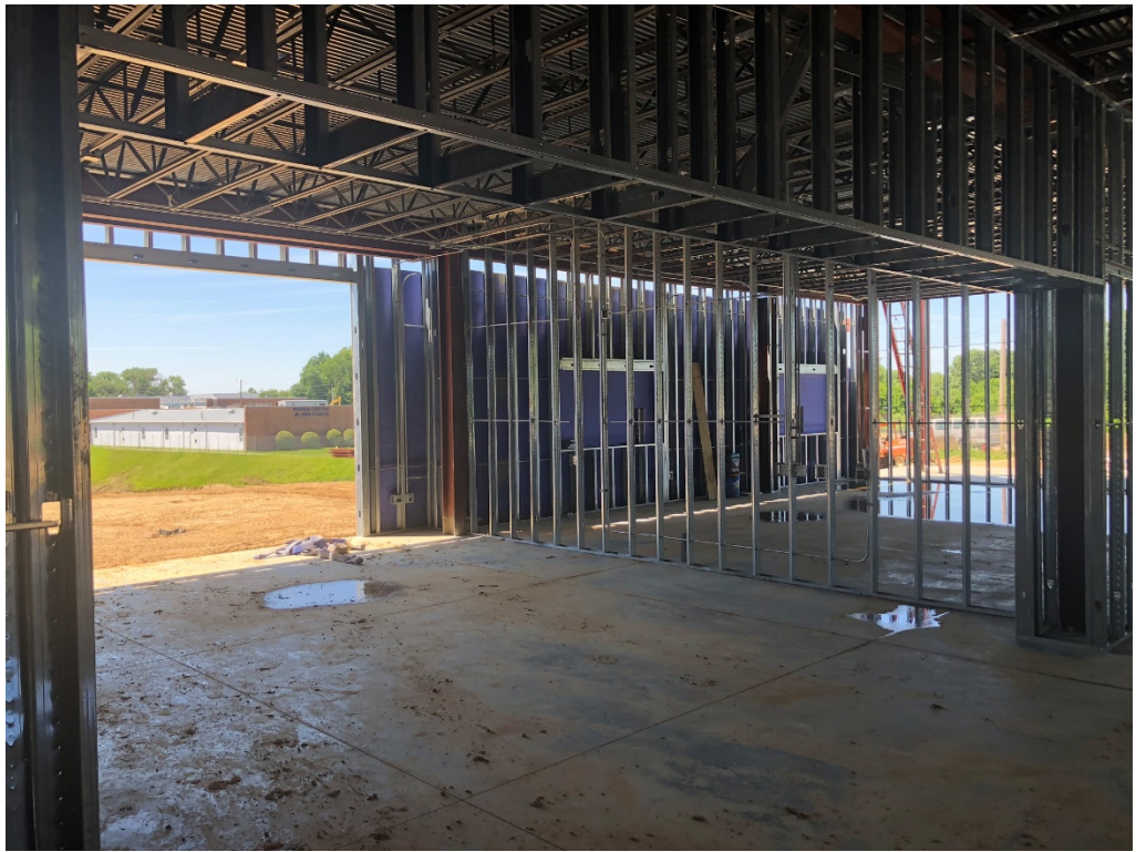
Figure 27 – Interior Framing @ Middle Floor: Teaching Space 120