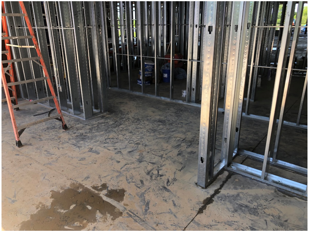
Figure 23 – Interior Framing @ Middle Floor: Bathrooms 128 & 129