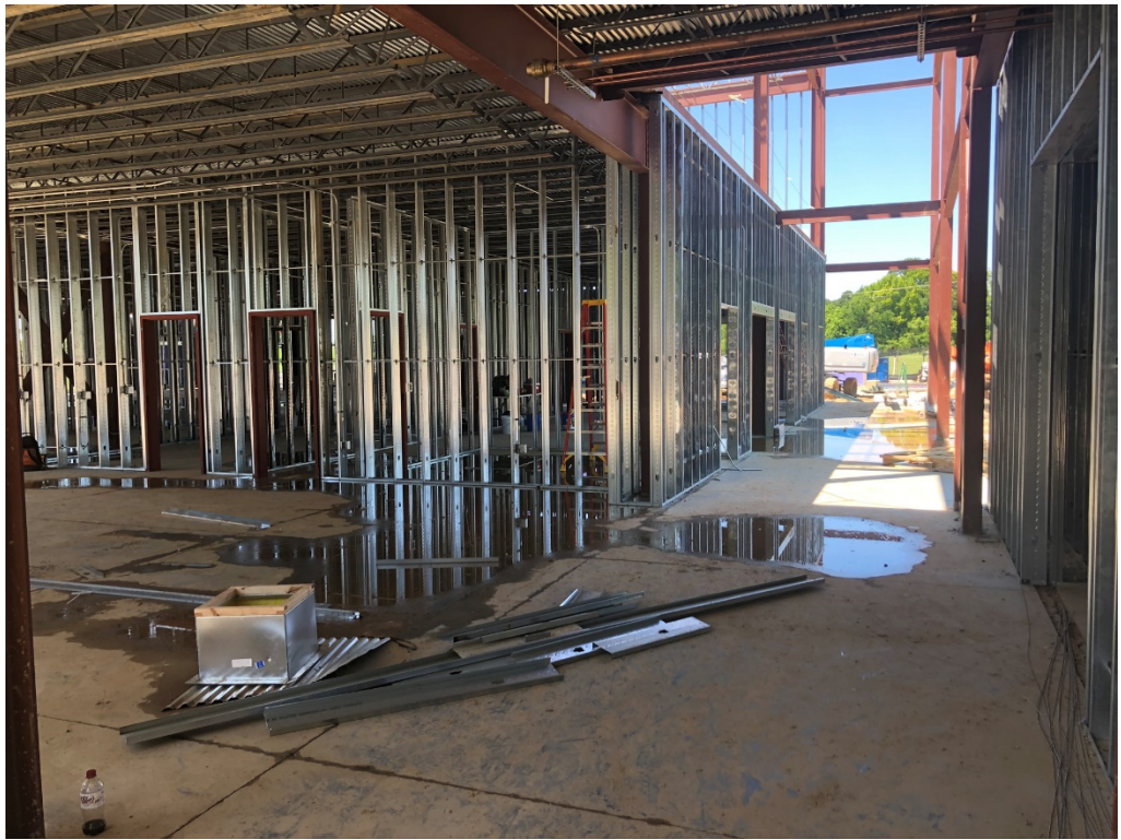
Figure 19 –Interior Framing @ Middle Floor: Corridor 153