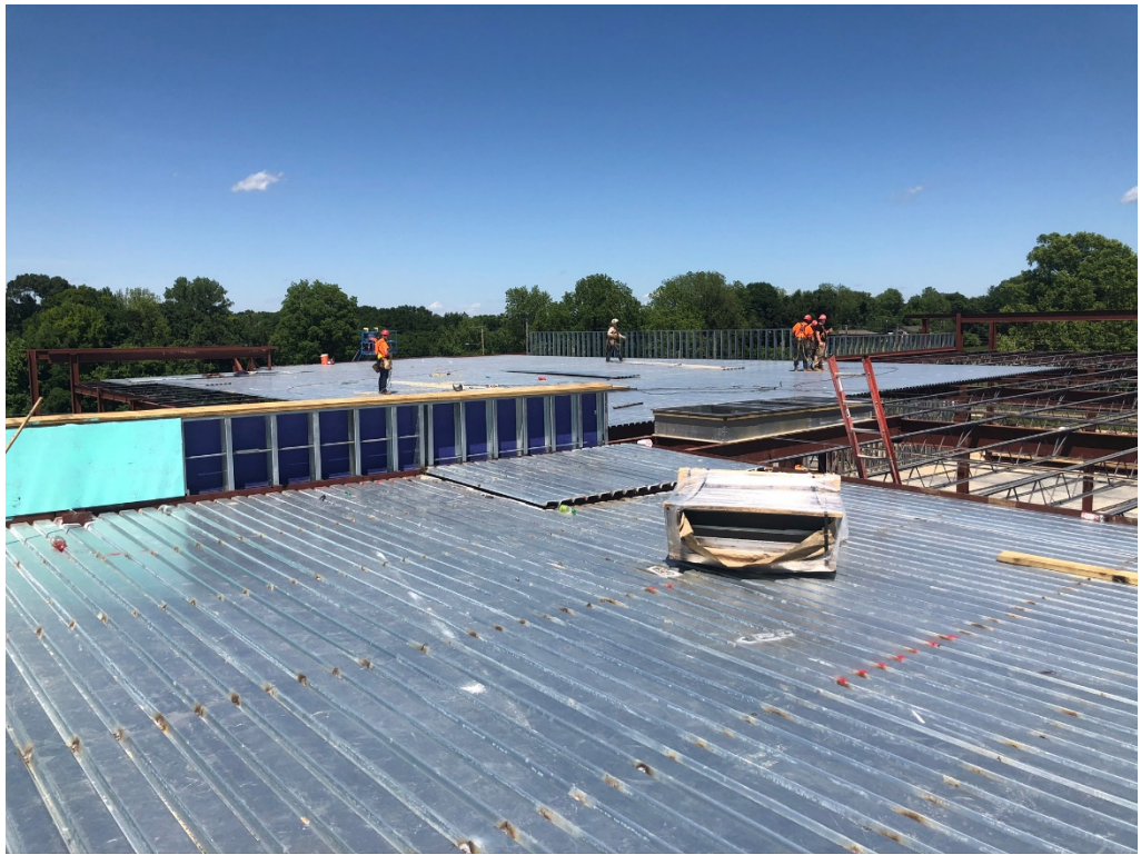
Figure 13 – Parapet Sheathing is Ongoing