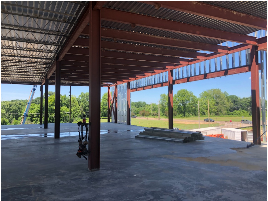
Figure 9 – Roof Decking Installed