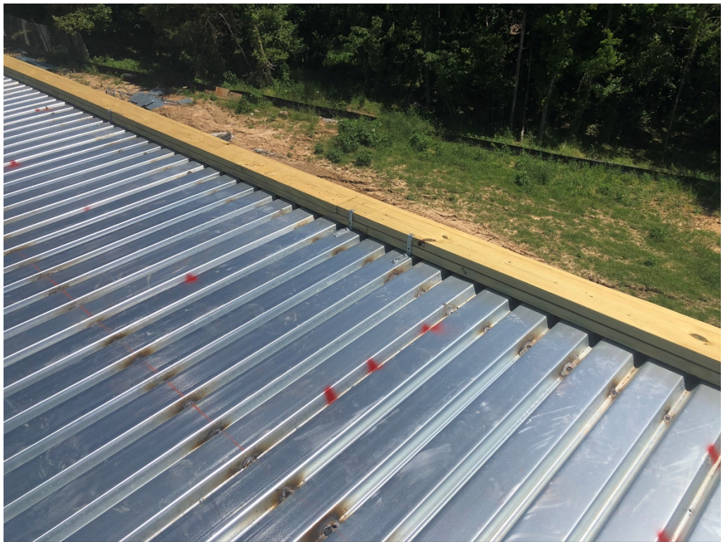
Figure 14 –Back Section of Roof @ West Building Section