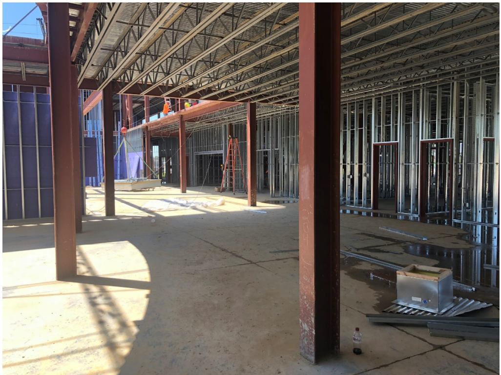
Figure 20 – Interior Framing @ Middle Floor: Lobby 150