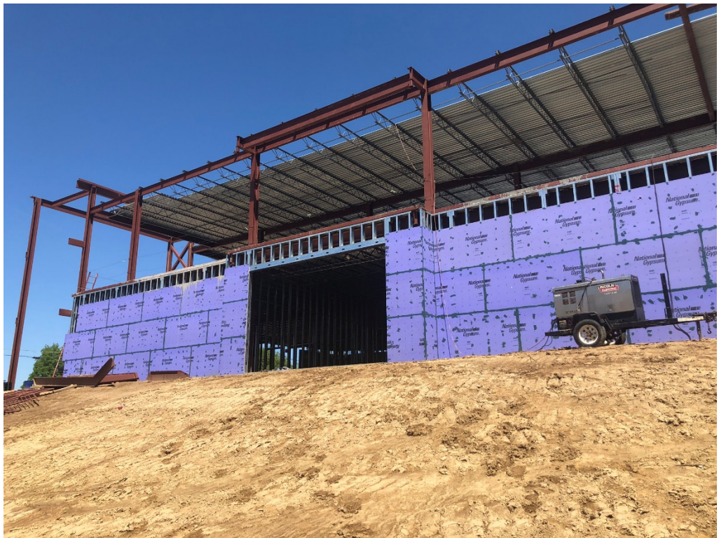
Figure 30 – Exterior Sheathing Is Ongoing