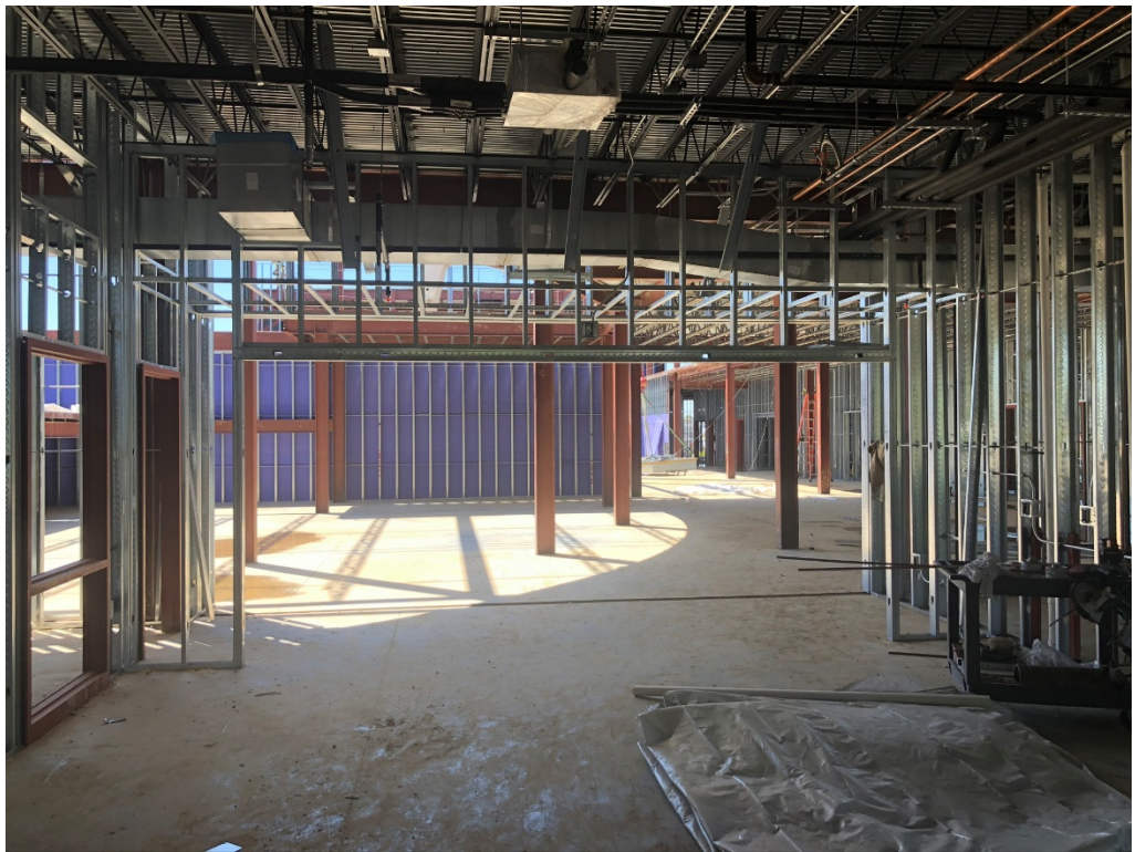
Figure 18 –Furr Downs and Interior Framing @ Middle Floor