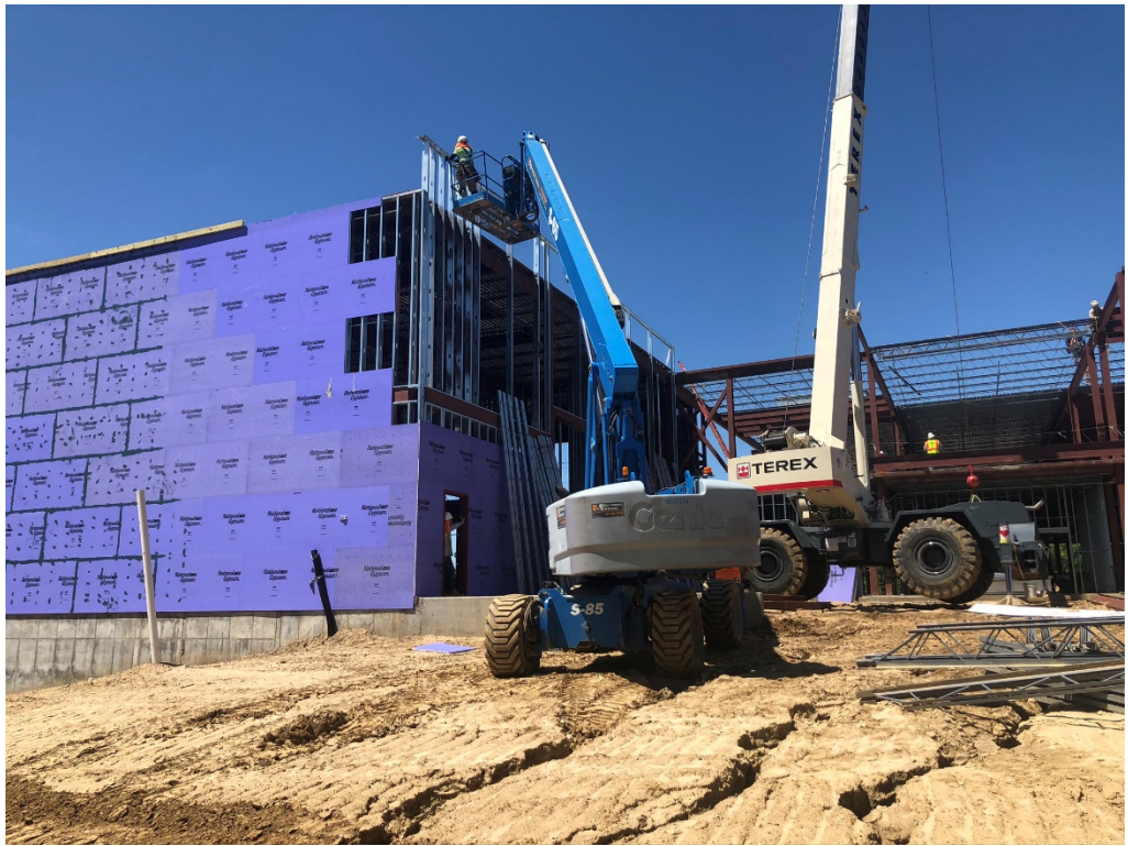
Figure 31 – South Elevation of Central Building Portion