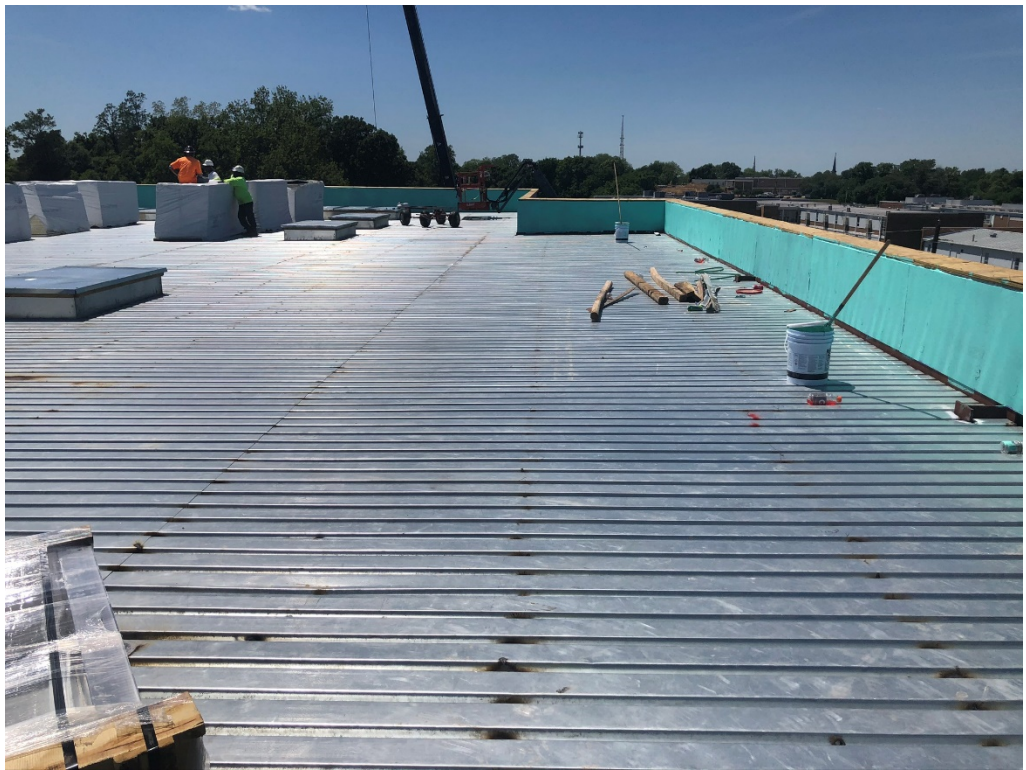
Figure 12 –Roof Work in West Section of Structure