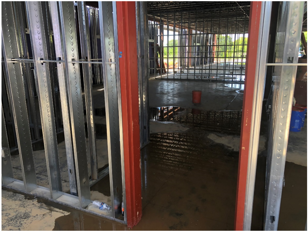
Figure 25 – Interior Framing @ Middle Floor: CorChorus 121