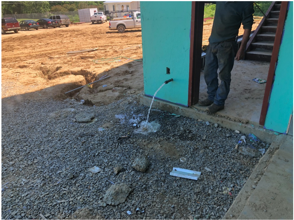
Figure 3 – Drain Outlet for Sprinklers