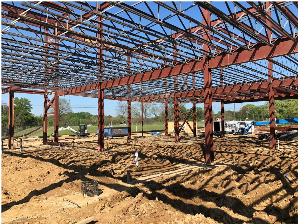
Figure 10 – Floor Joists in Central Section of Building