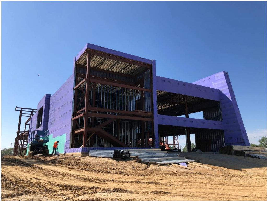
Figure 1 – East Structure