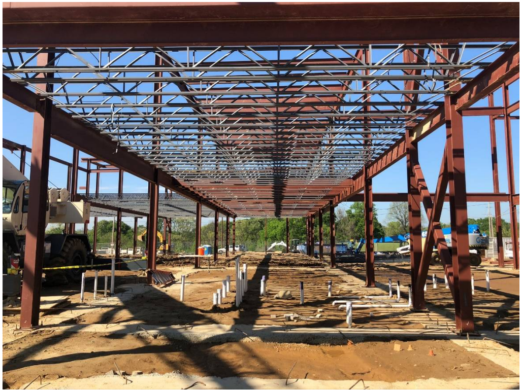
Figure 9 – Floor Joists in Central Section of Building