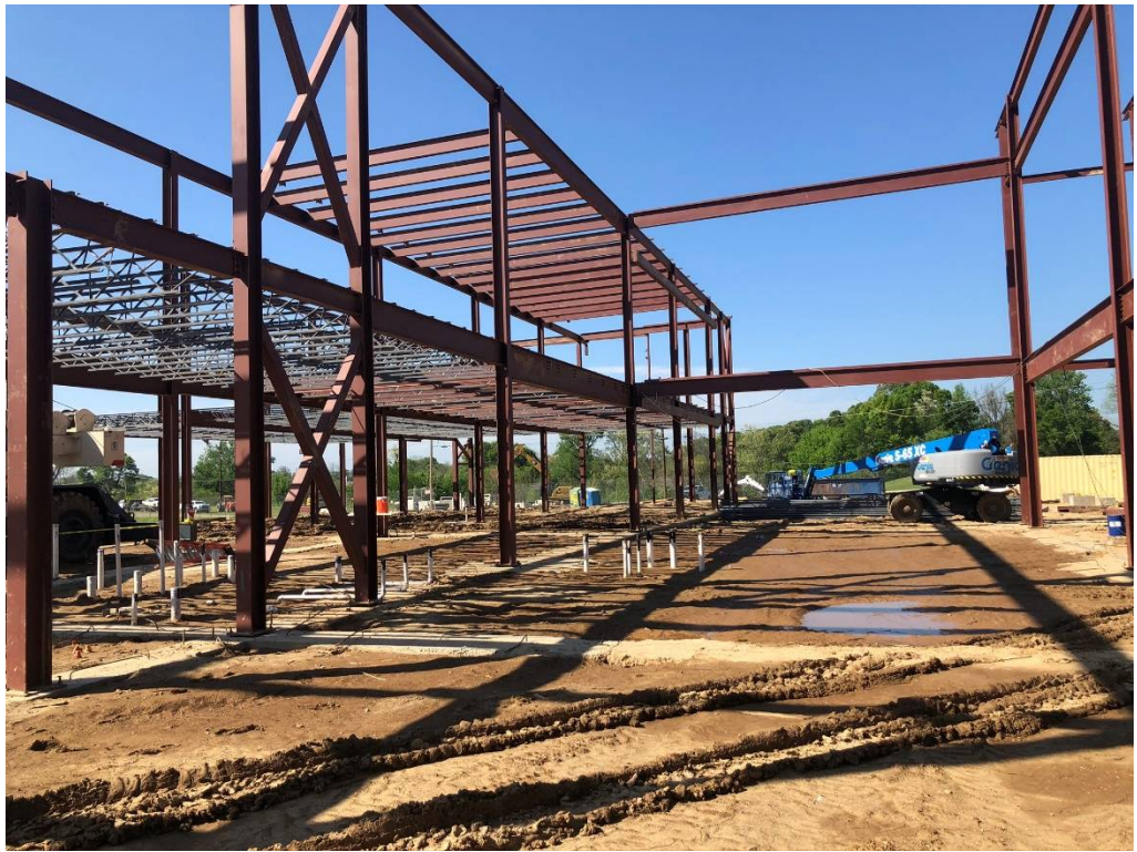
Figure 11 – Continued Steel Erection