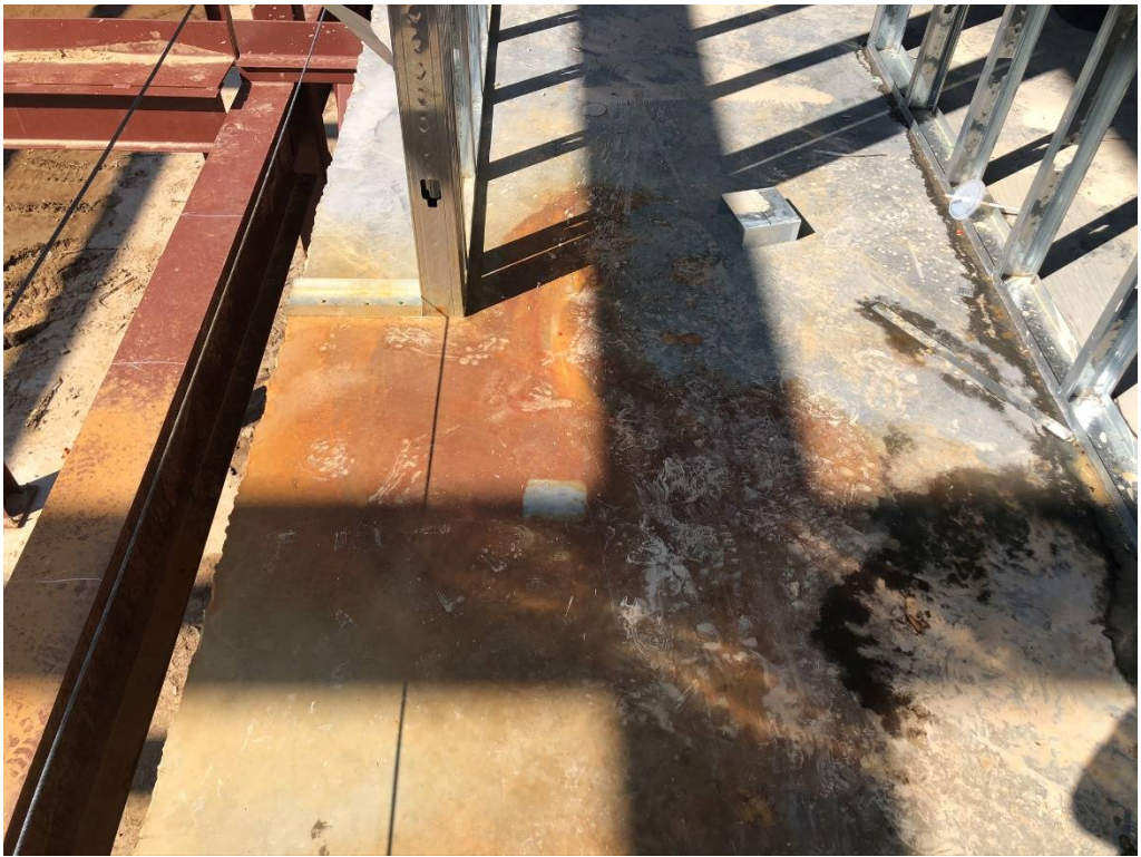
Figure 5 – Rust From Equipment Left in Weather (tiled is to be installed here)