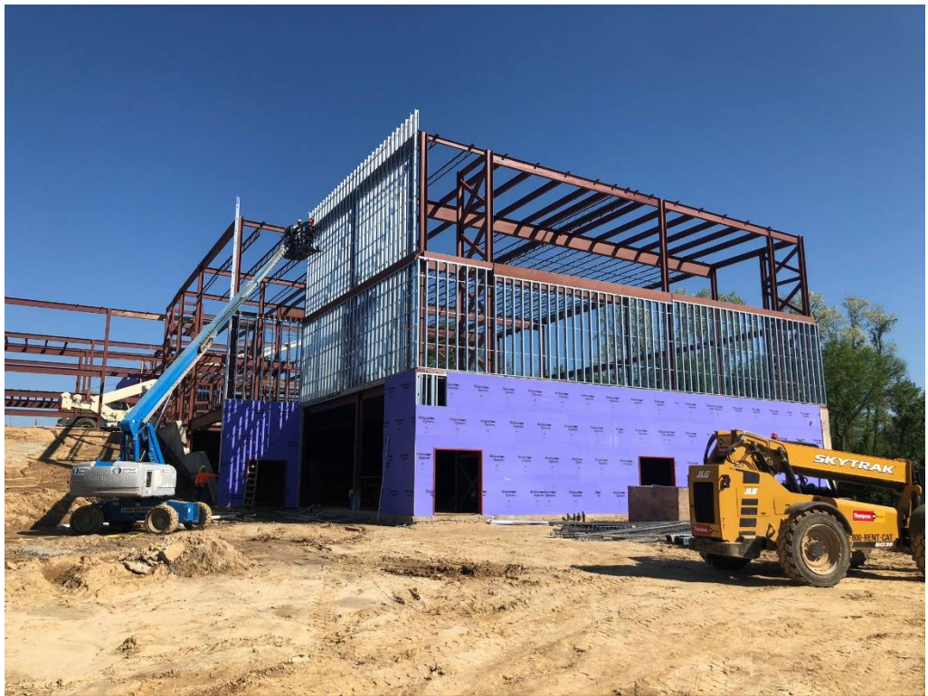
Figure 12 – Light Gauge Framing @ West Building Section