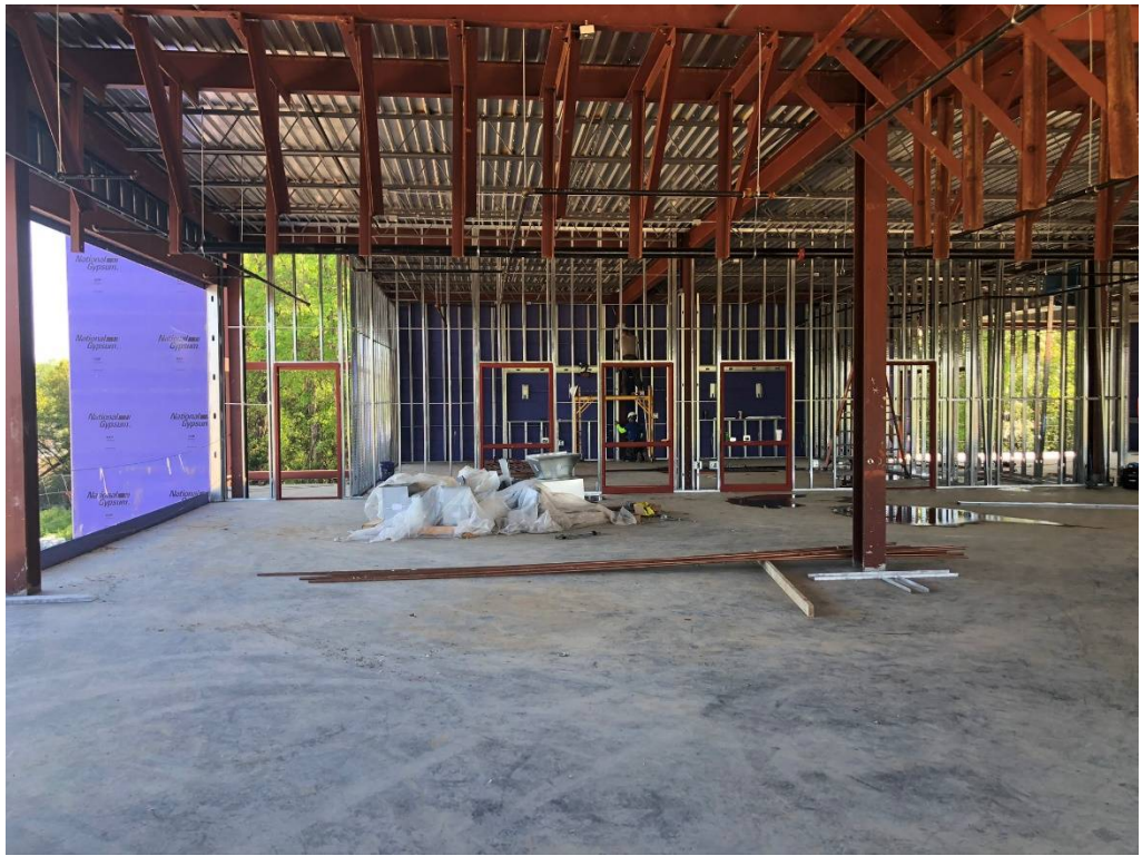
Figure 7 – Light Gauge Framing at Second Floor