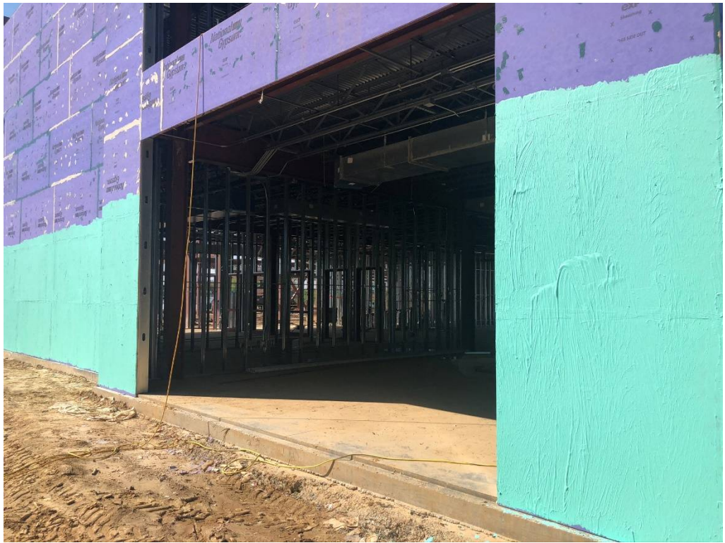
Figure 3 – Notes Joints Sealed and Liquid VB Applied