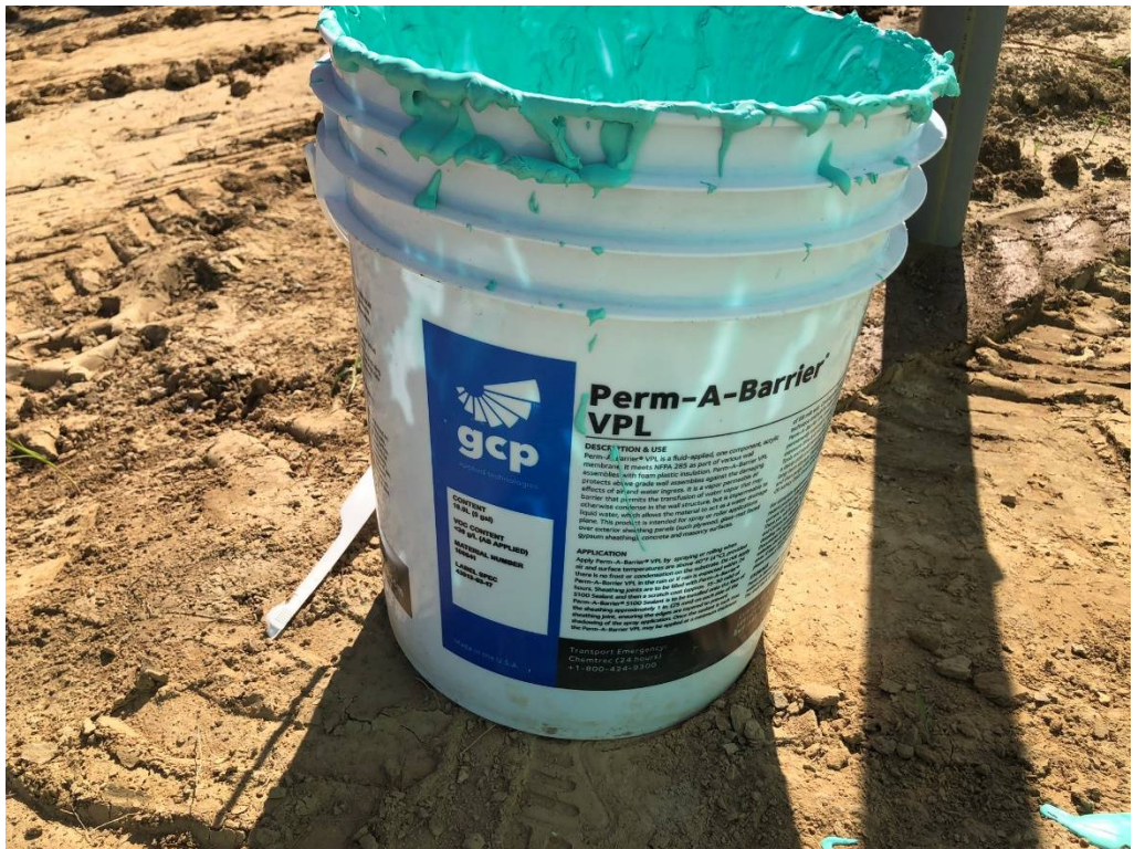
Figure 2 – Correct Vapor Barrier In Use