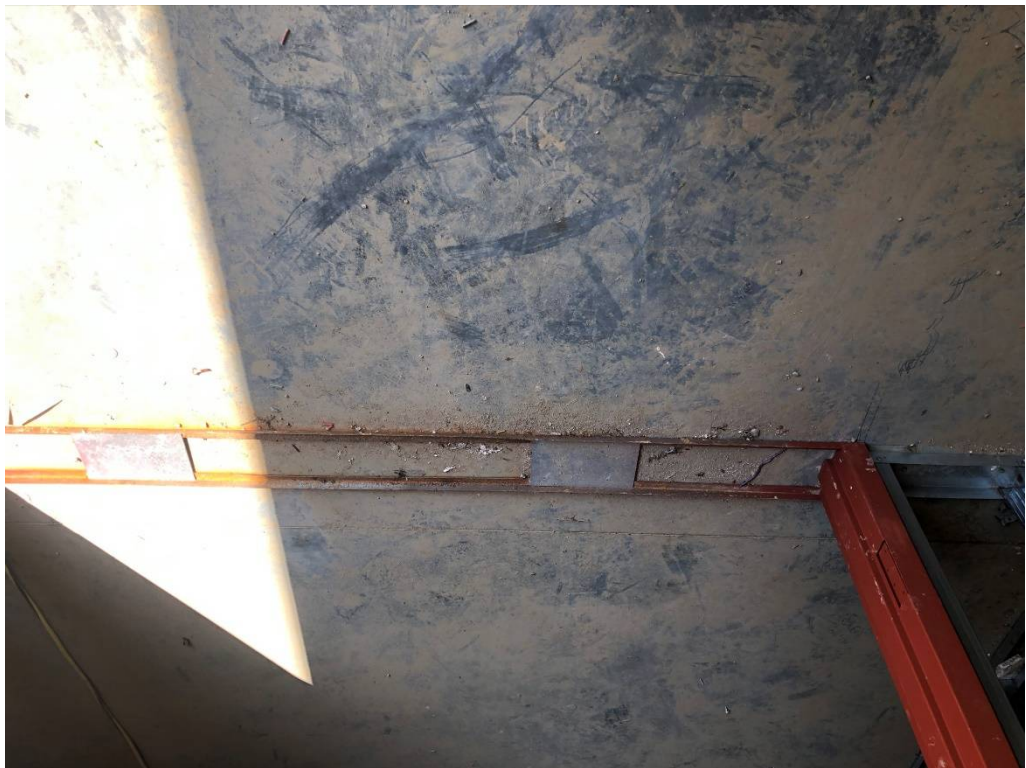
Figure 4 – Rust at Temporary Bracing Could Affect Concrete Finish if Not Cleaned Immediately