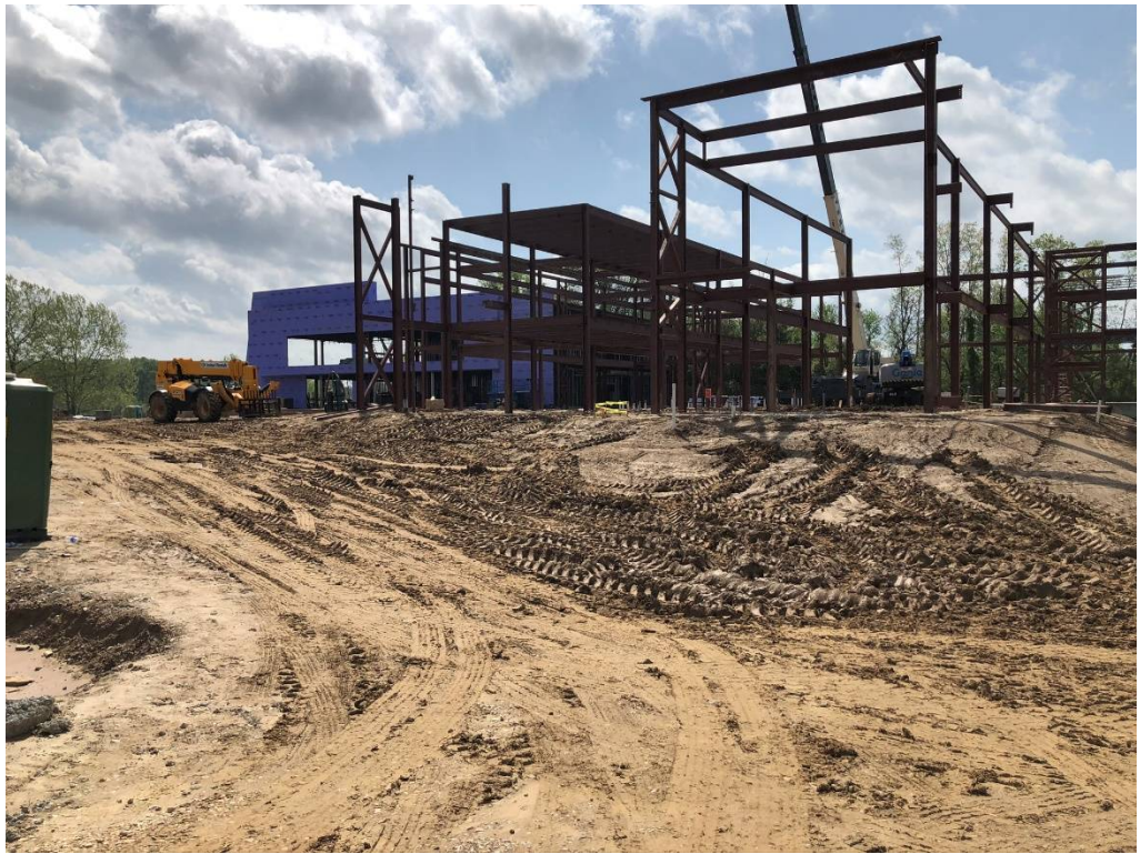
Figure 1 – North Entry Looking SE