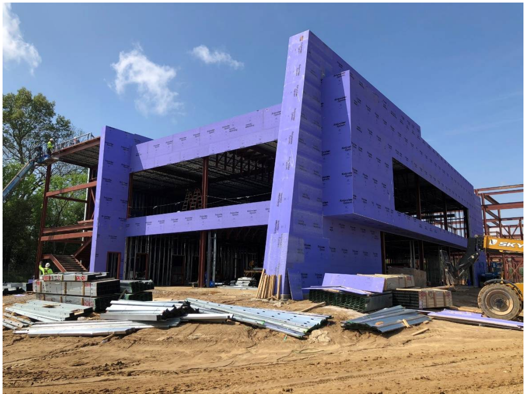
Figure 6 – Exterior Gypsum OnGoing