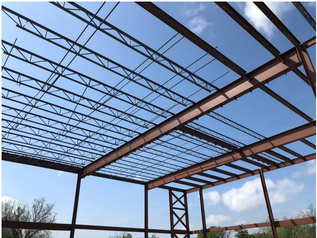
Figure 8 – Ceiling Joists work at West Building