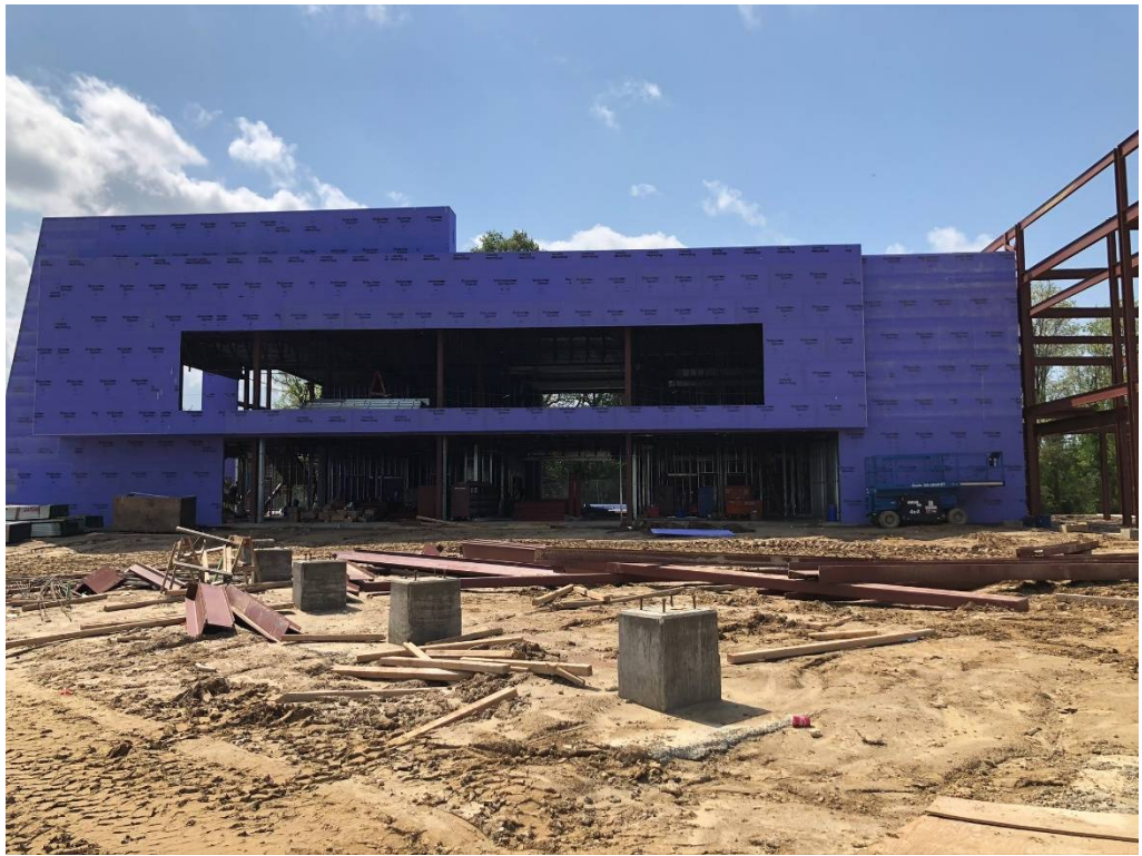
Figure 5 – North Elevation of East Building