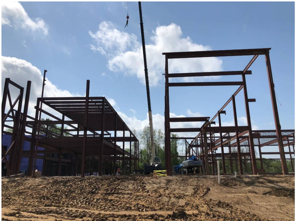
Figure 4 – New Steel Installed at Versatile Teaching Space