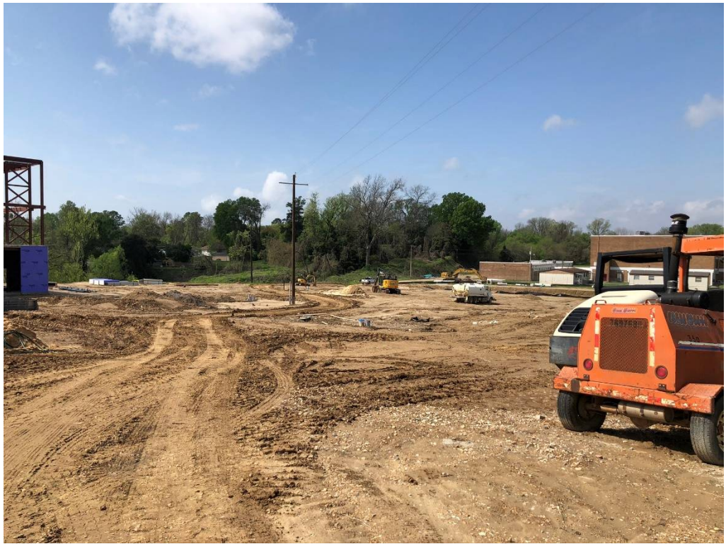
Figure 3 – North Entry Looking SW