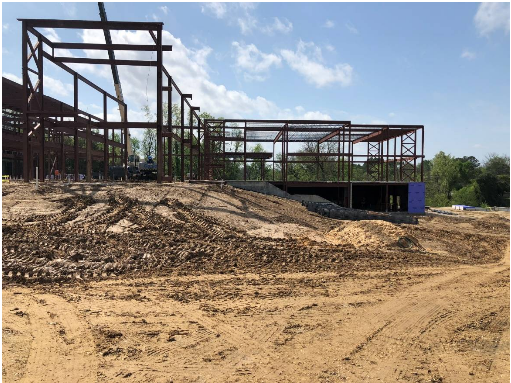
Figure 2 – North Entry Looking S