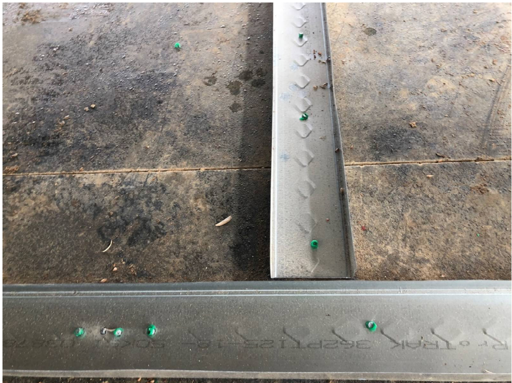
Figure 4 – Some Interior Wall Plates have been set