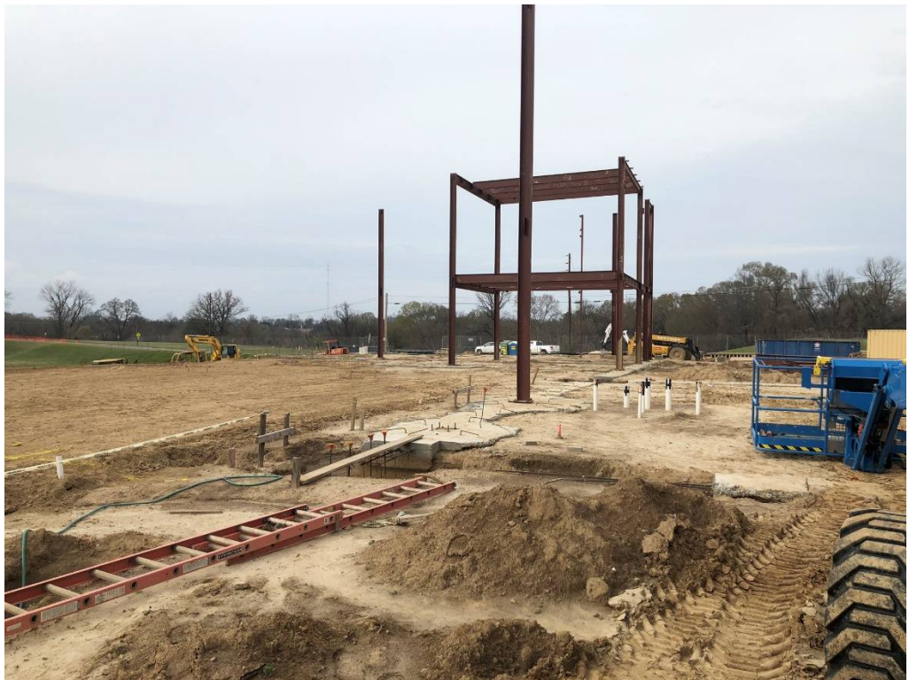
Figure 8 – North/Central Structure Erection has Begun