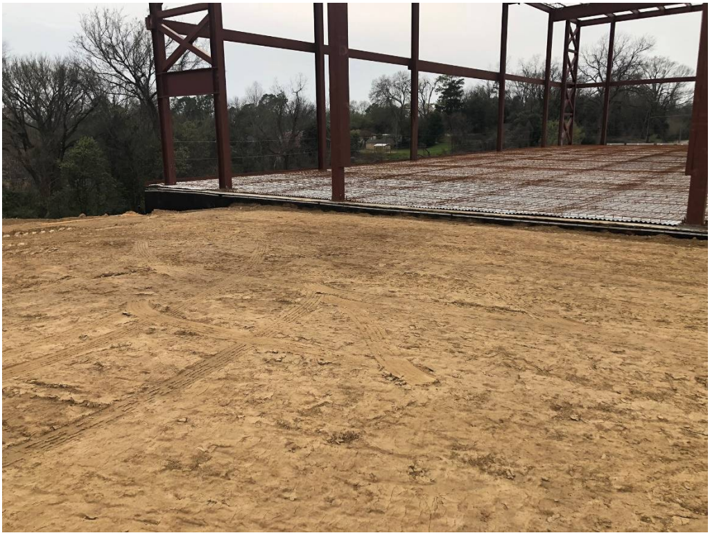
Figure 9 – Backfilled Central Portion of Building