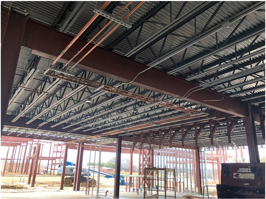
Figure 5 – Electrical & Plumbing Rough-in Ongoing in East Structure