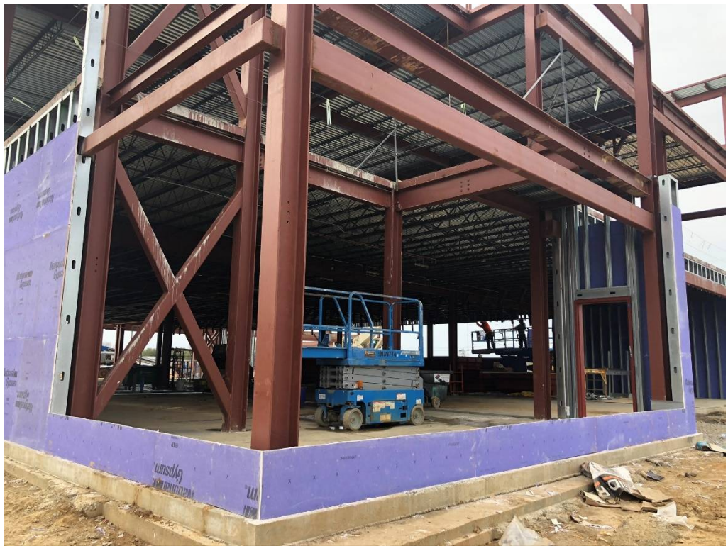
Figure 2 – Sheathing Started at installed Light Gauge Framing