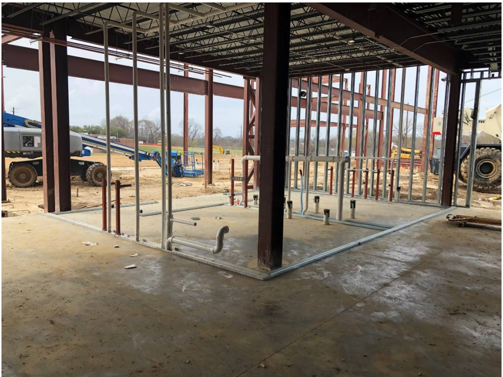
Figure 6 – Electrical & Plumbing Rough-in Ongoing in East Structure