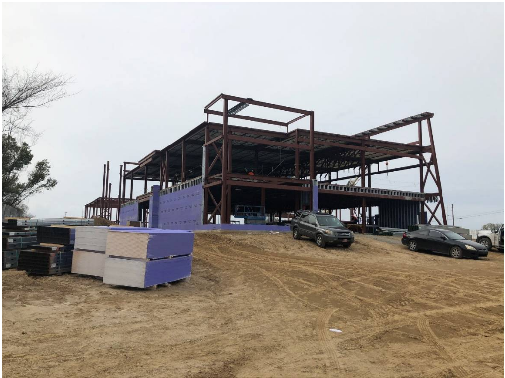
Figure 1 – East Building Erected