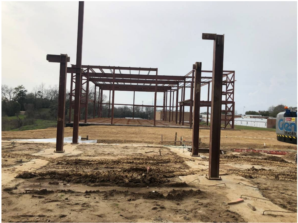
Figure 7 – West Structure