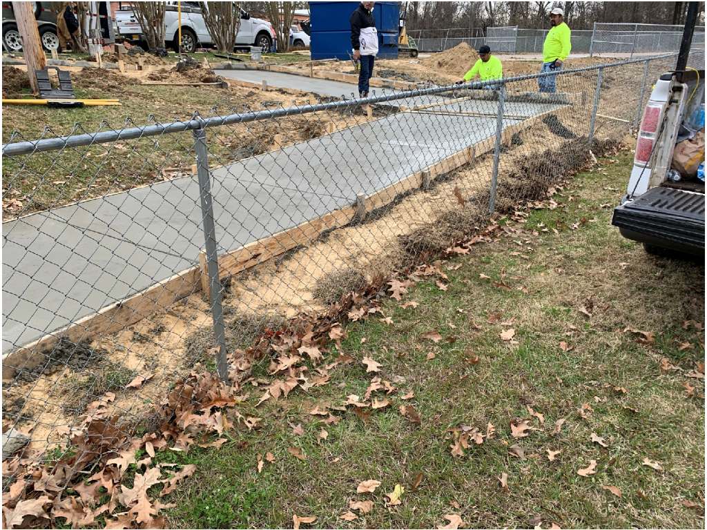
Figure 3 – ADA Ramp