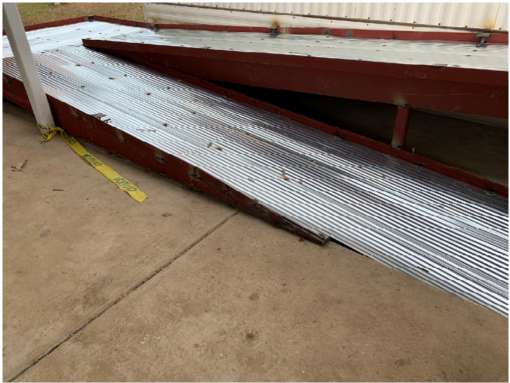
Figure 5 – ADA Ramp Steel Work