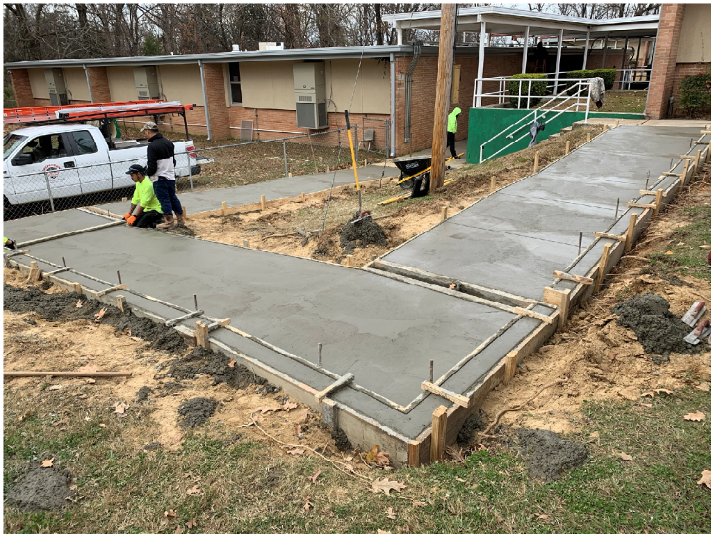
Figure 2 – Concrete Pour for ADA Ramp Install