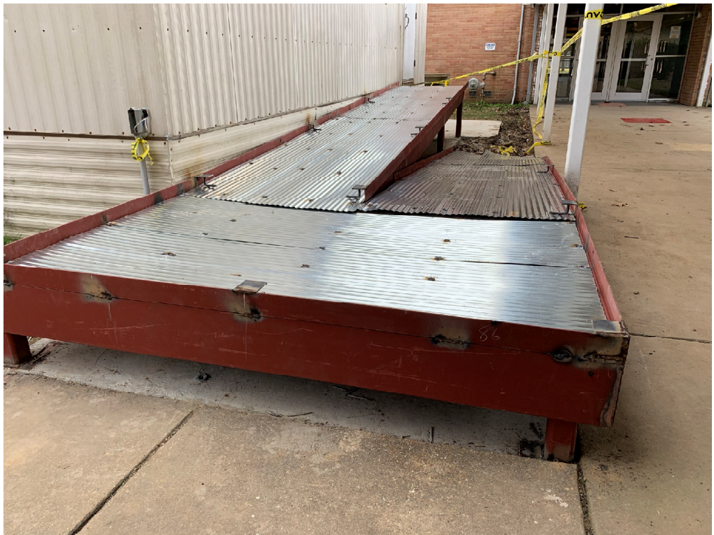
Figure 6 – ADA Ramp Steel Work