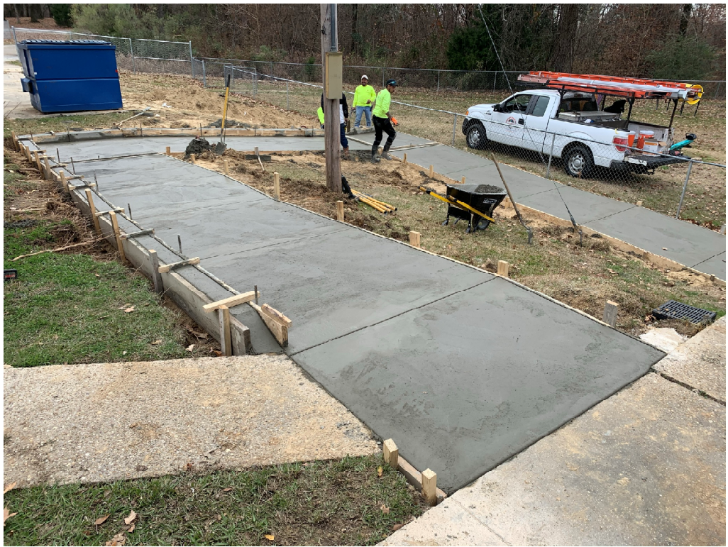
Figure 1 – Concrete Pour for ADA Ramp Install