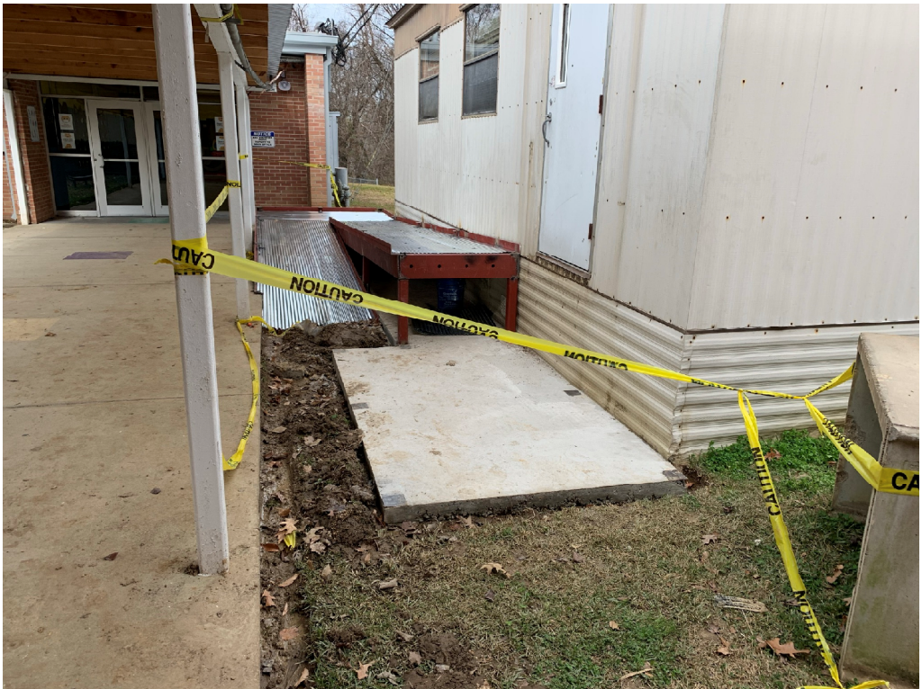
Figure 4 – ADA Ramp Steel Work