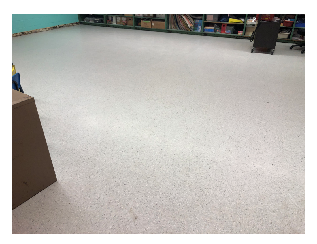
Figure 5 – West Section of Building A New Floor