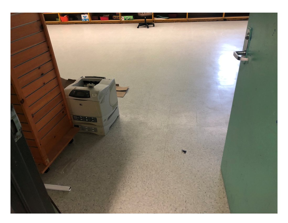
Figure 1 – West Section of Building A New Floor