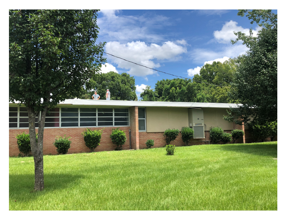
Figure 8 – Roof Work Complete; Edge Trim Still Ongoing