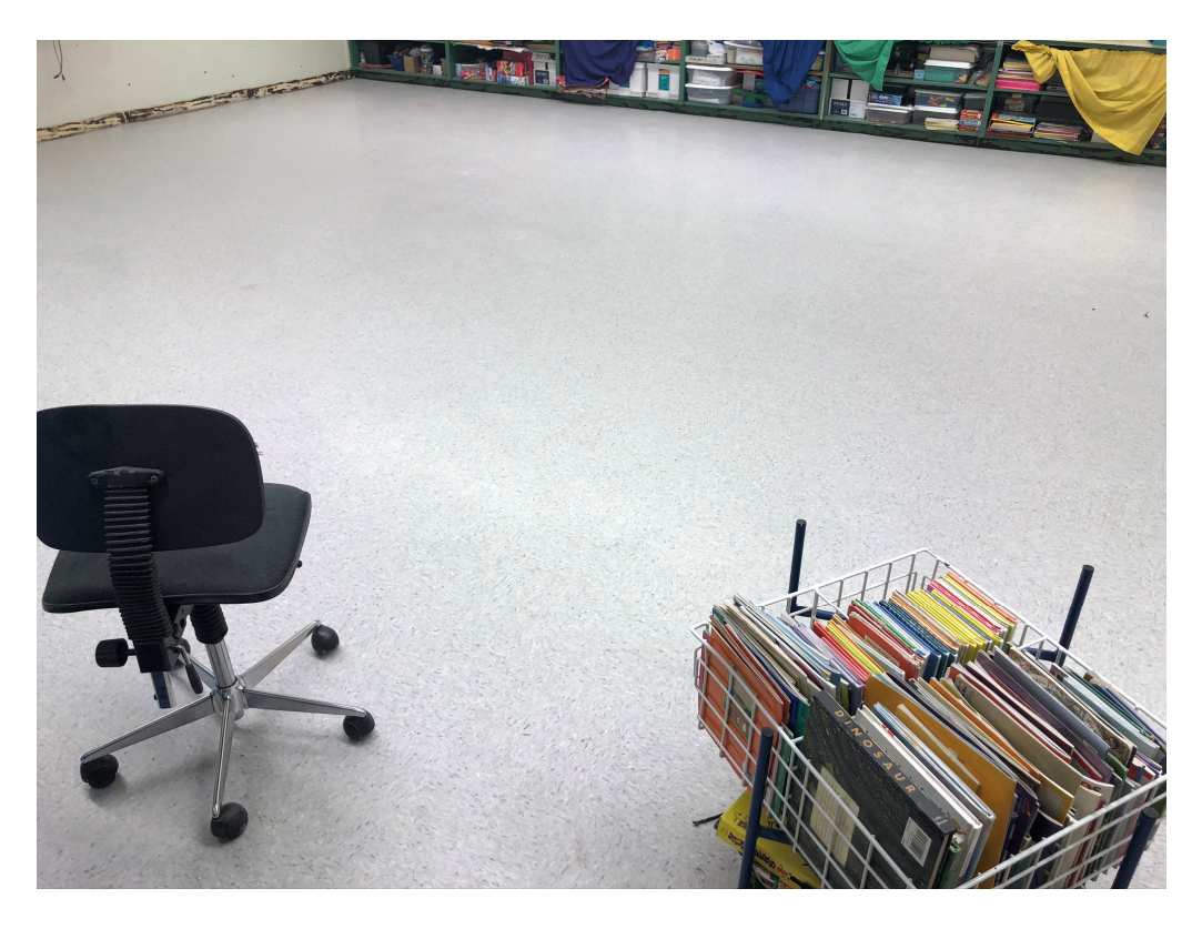
Figure 6 – West Section of Building A New Floor