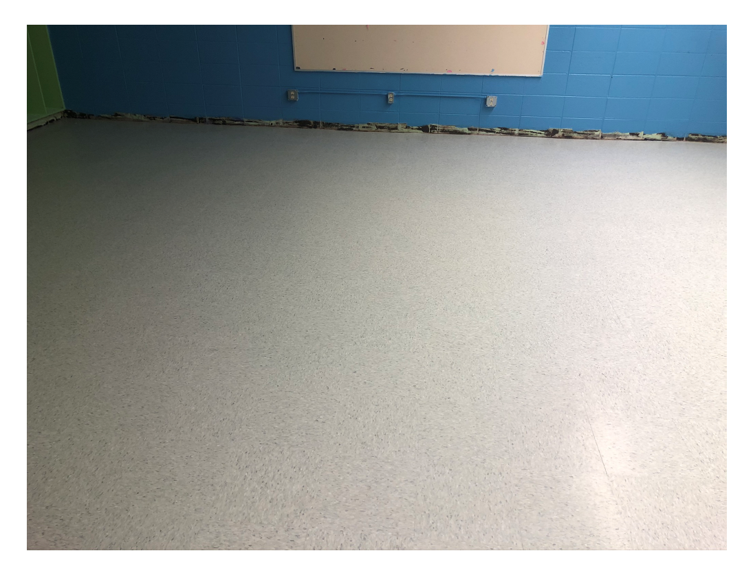
Figure 2 – West Section of Building A New Floor