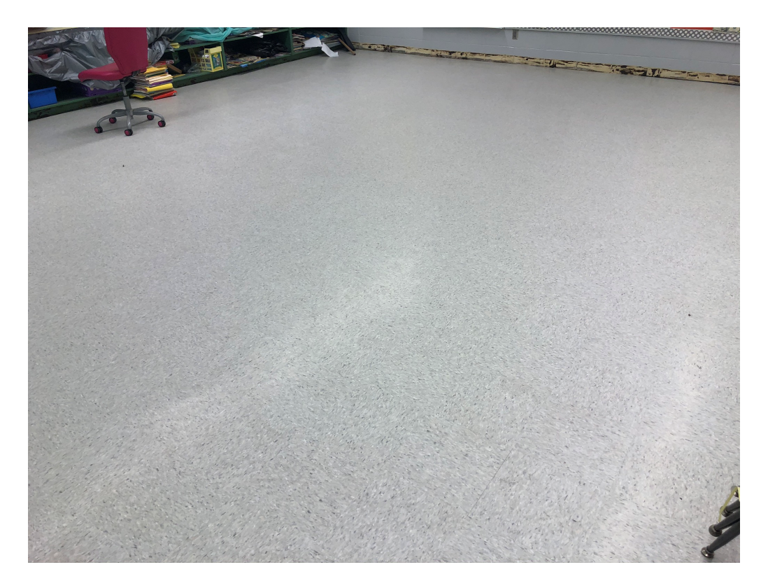
Figure 7 – West Section of Building A New Floor