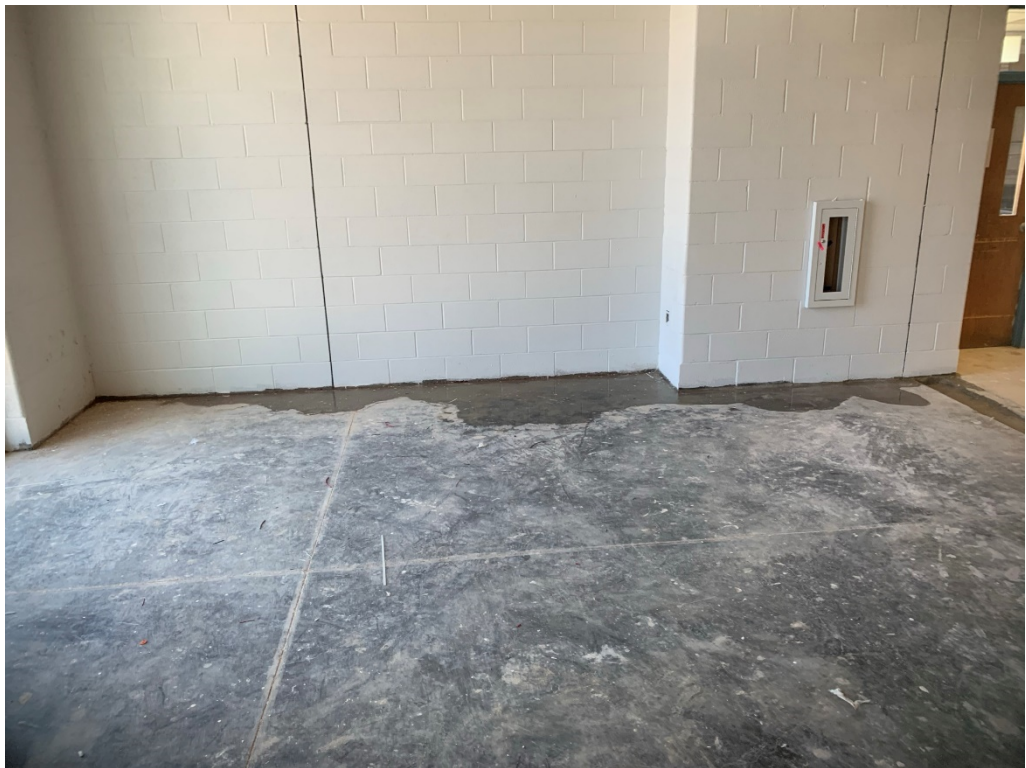
Figure 4 – A leak is apparent here; is there a solution yet?