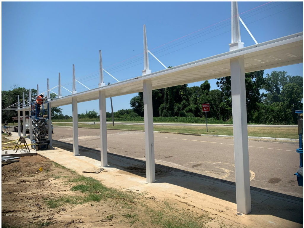
Figure 2 – Awning Installation