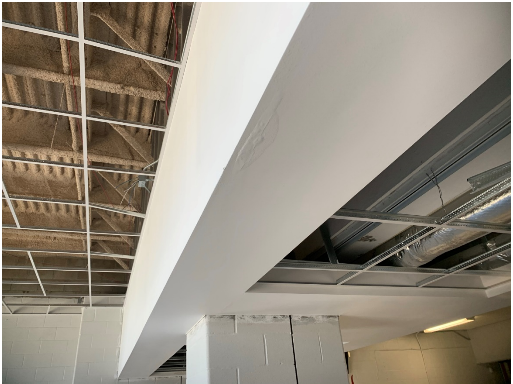
Figure 3 – damaged mud-work due to moisture