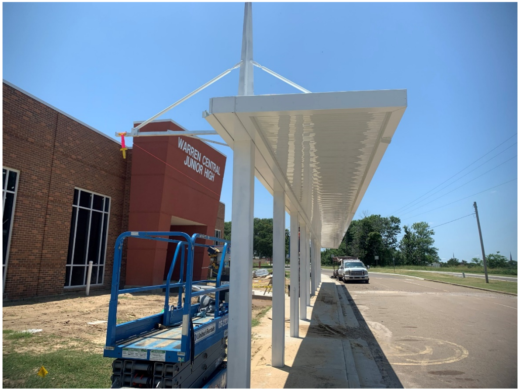
Figure 1 – Awning Installation