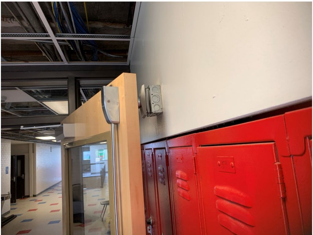
Figure 6 – Electronic Holds Installed and Operational