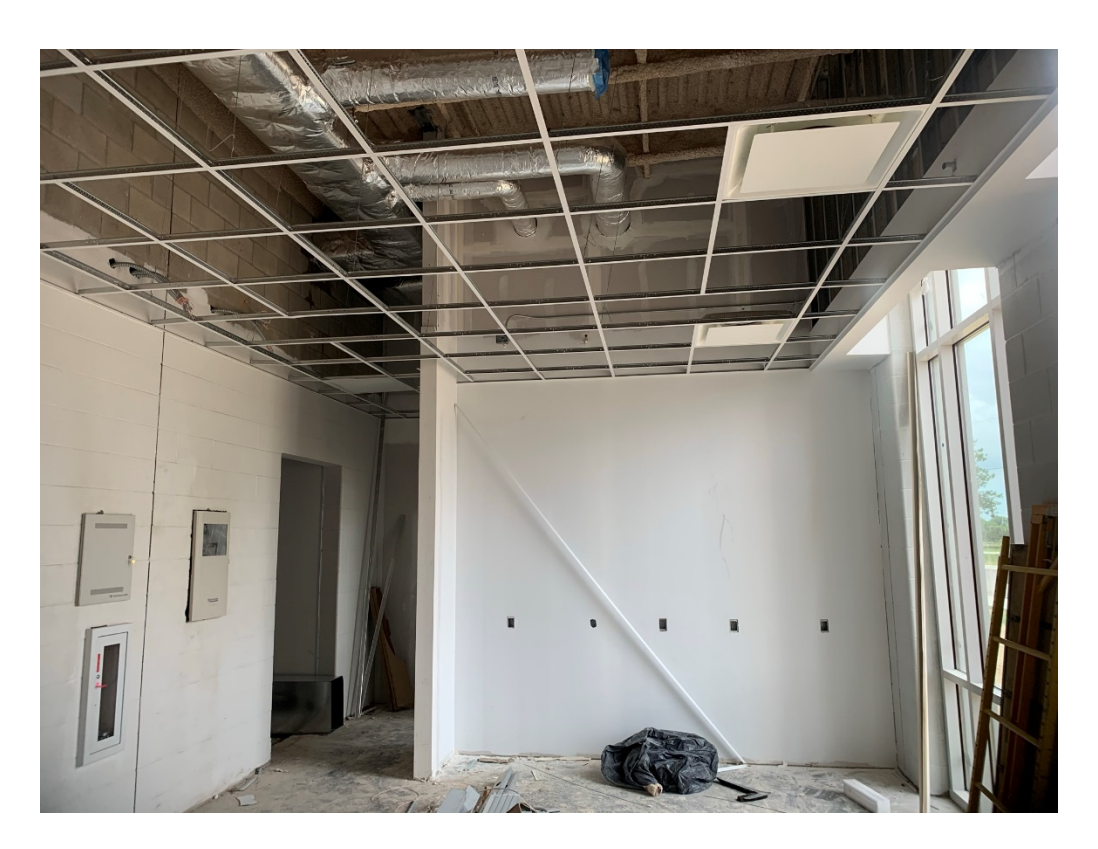
Figure 3 – Admin Area with Grid Installed