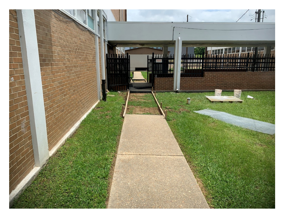
Figure 6 – Sidewalk Formed (vegetation should be removed before concrete installed)