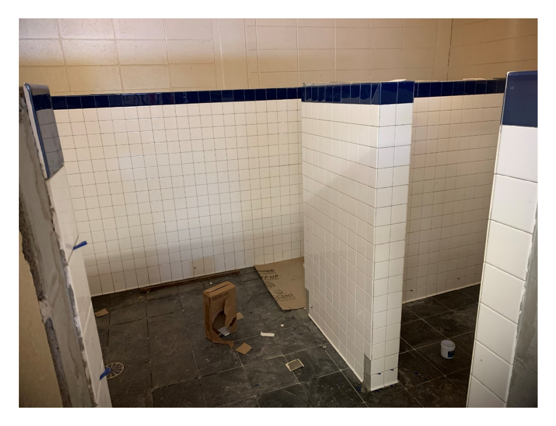
Figure 8 – Tile at Field House