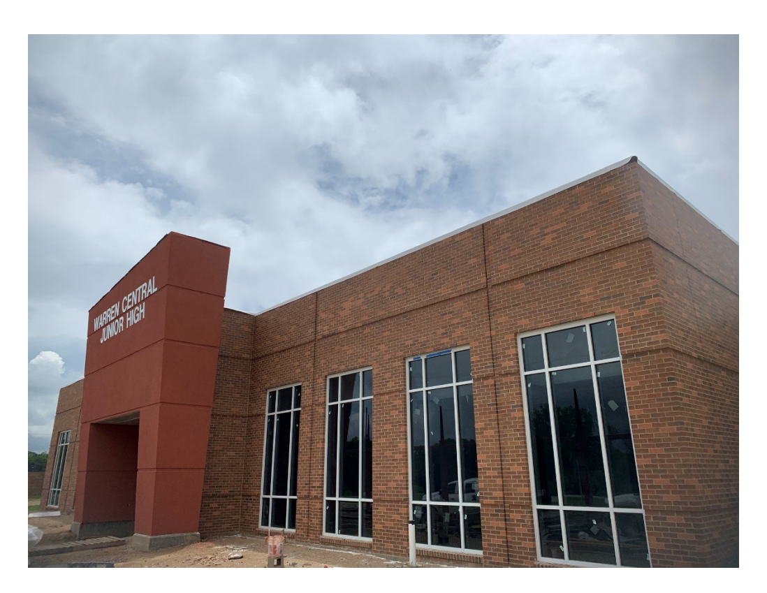
Figure 1 – Progress at Entry