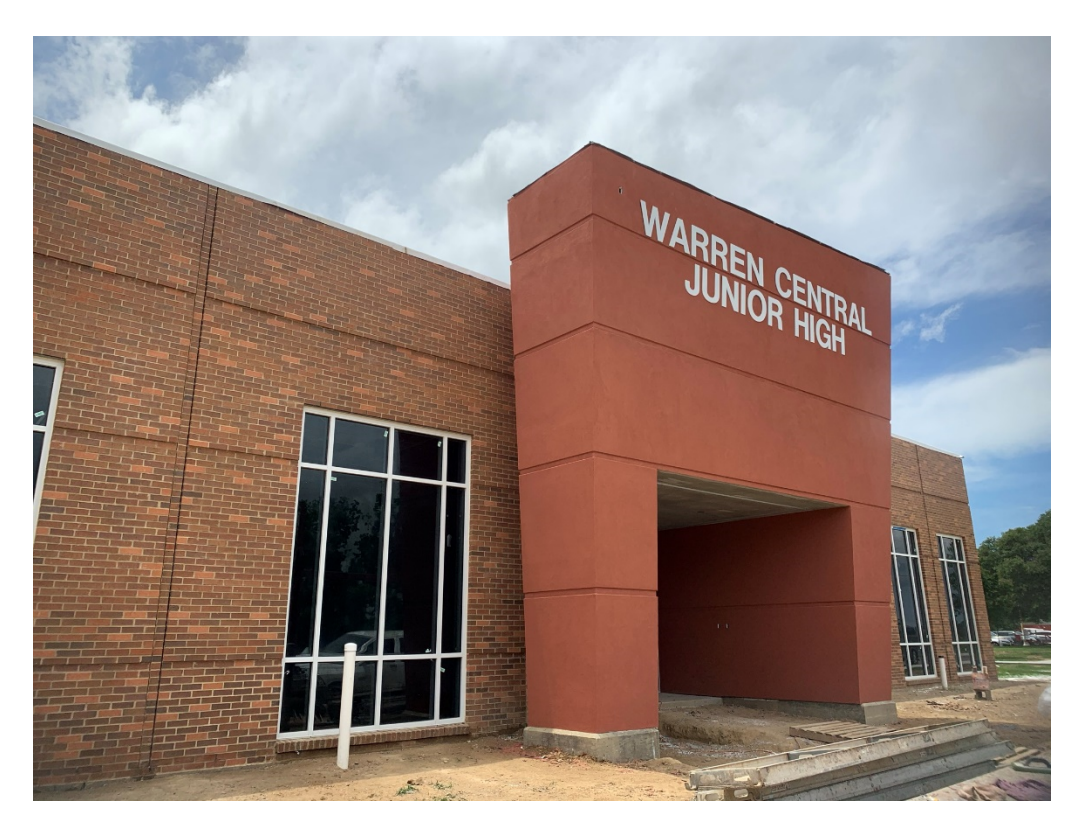
Figure 2 – Progress at Entry