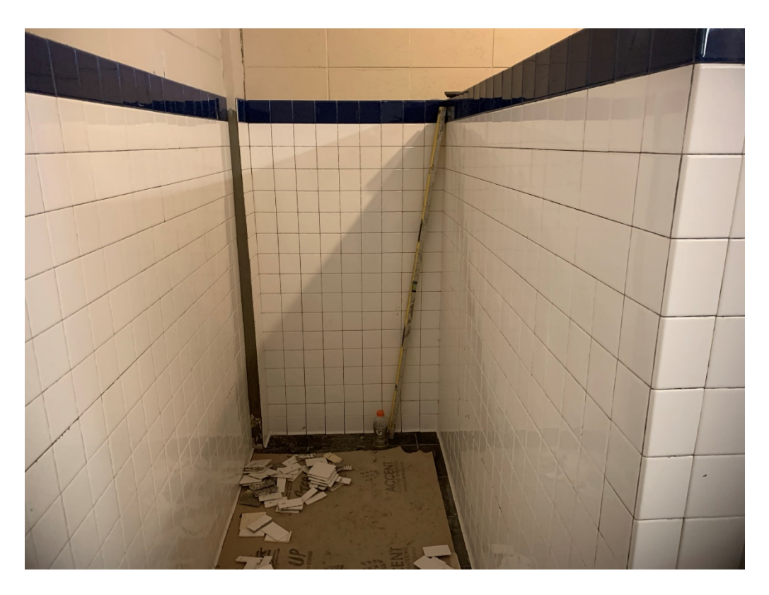
Figure 9 – Tile at Field House