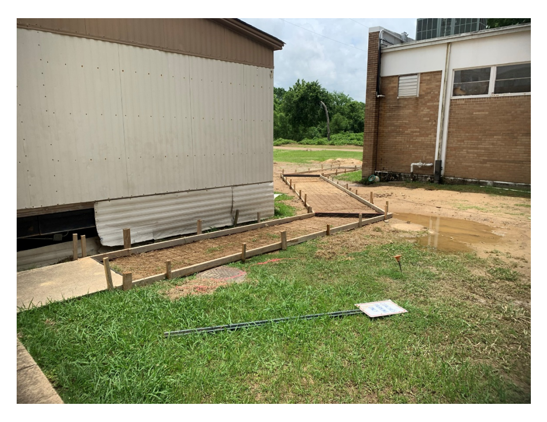
Figure 10 – Sidewalk Formed