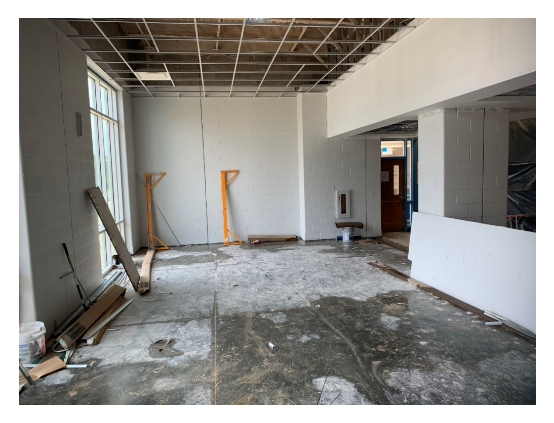
Figure 4 – Cafeteria Extension