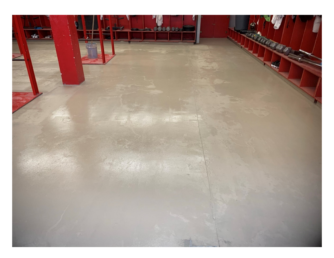
Figure 7 – Floor Paint at Field House