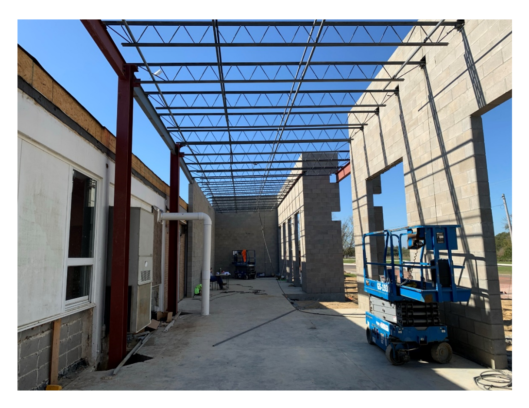
Figure 3 – Steel Work Partially Installed