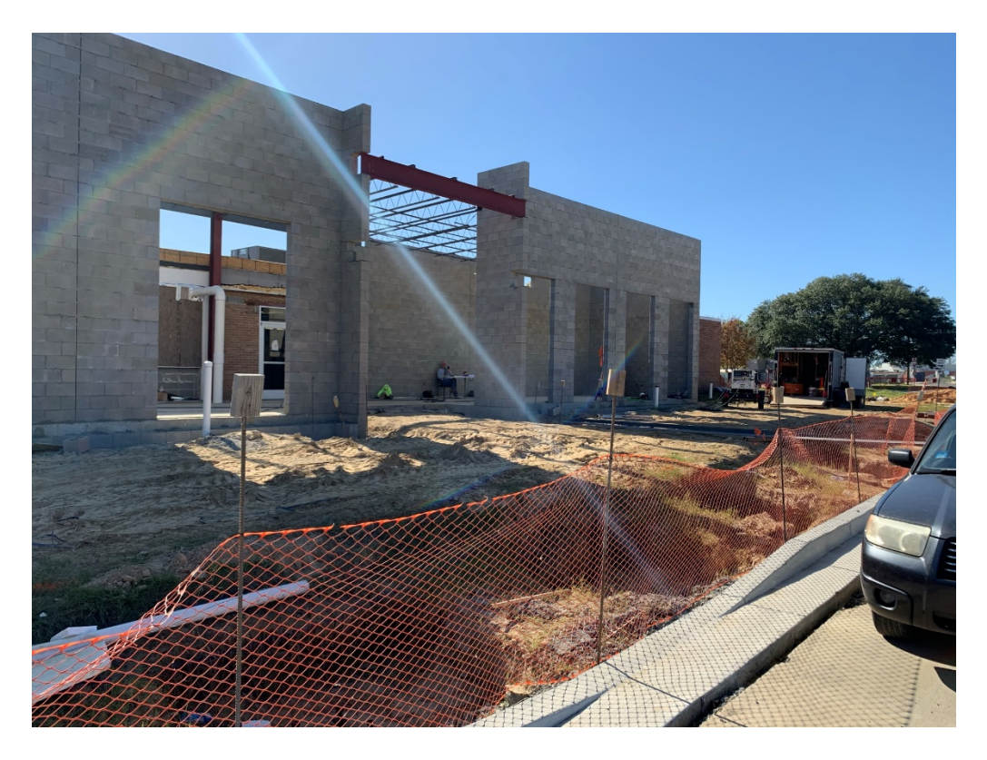
Figure 2 – Steel Work Partially Installed