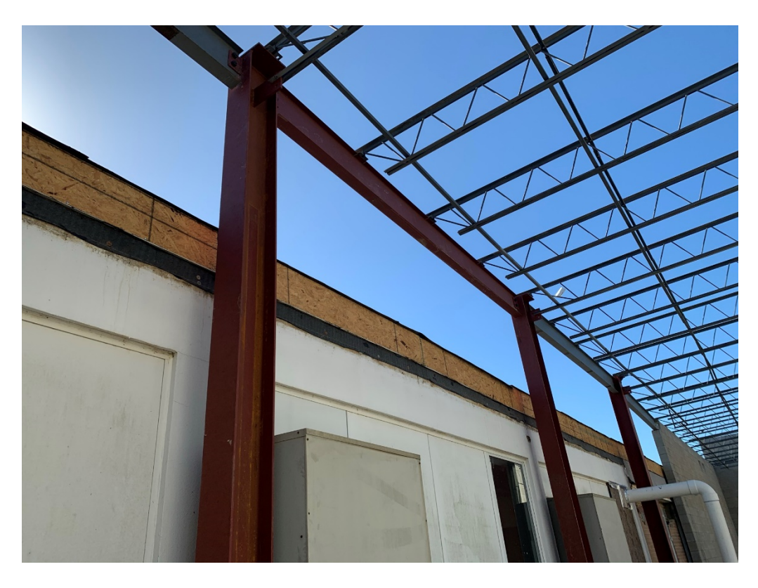
Figure 4 – Steel Work Partially Installed