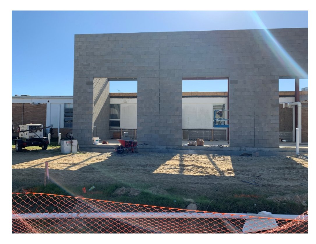
Figure 1 – CMU Blocked Installed