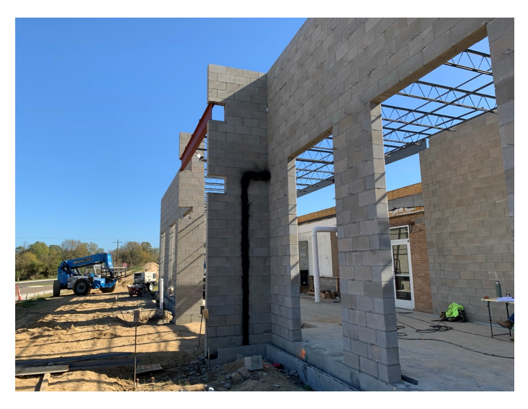
Figure 6 – Steel Work Partially Installed