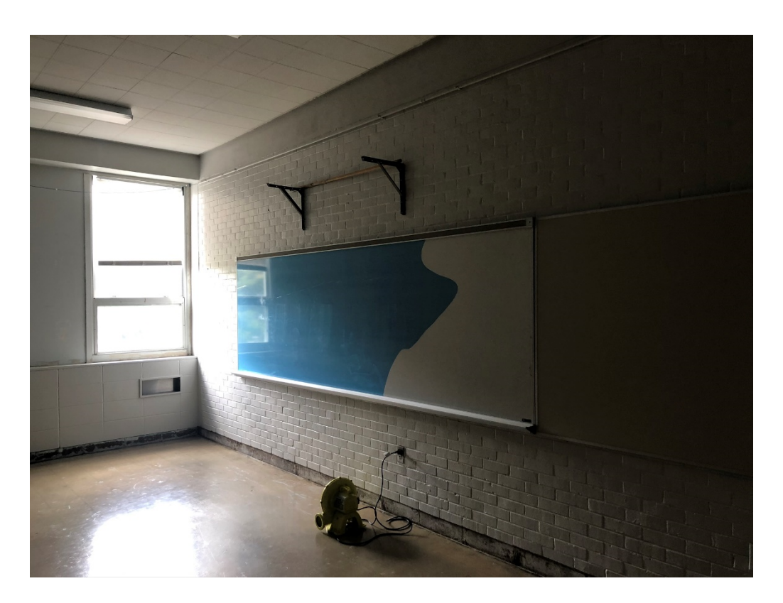
Figure 1 – Display Board Installed