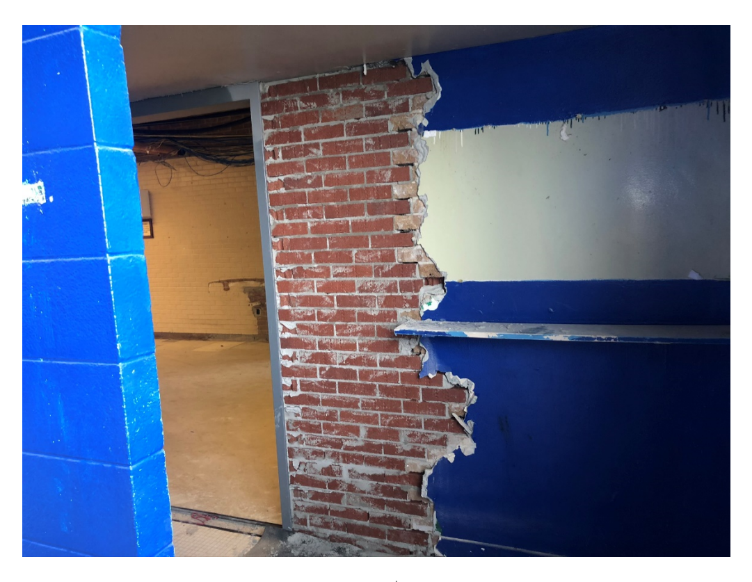
Figure 2 – Masonry Patch at Bathroom Interior 3<sup>rd</sup> Floor