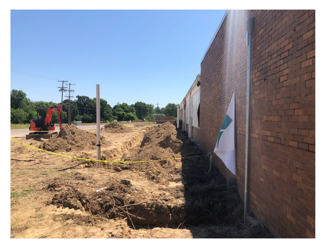
Figure 1 – Sewer work at Front Entry of Project in preparation for Addition