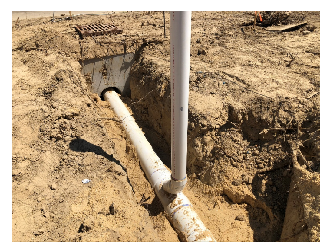
Figure 3 – Sewer discharge to Street