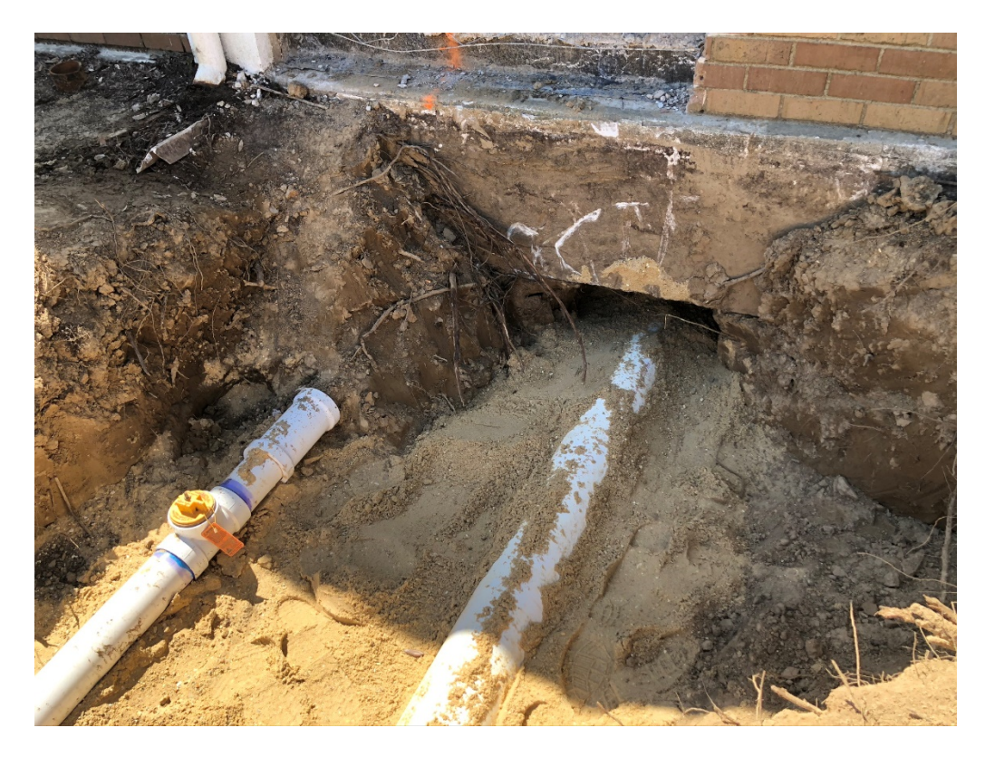
Figure 2 – Sewer leaving main building