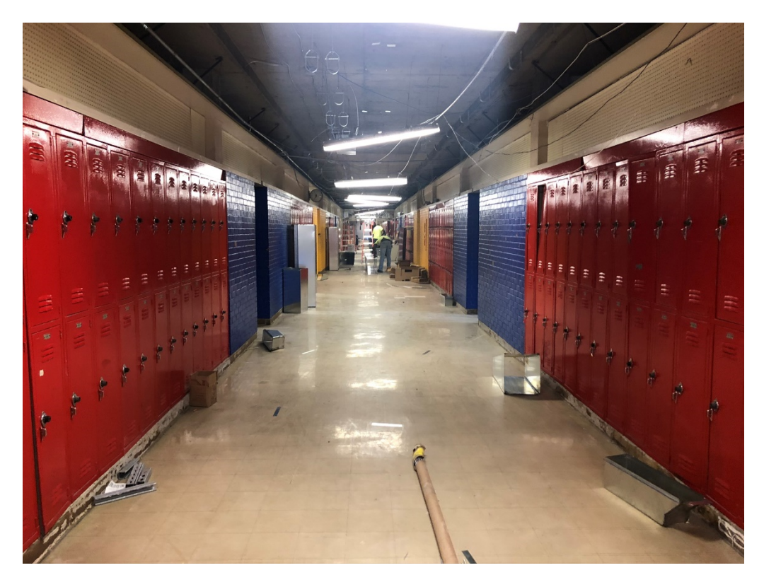
Figure 6 – Mechanical Rough In is Ongoing