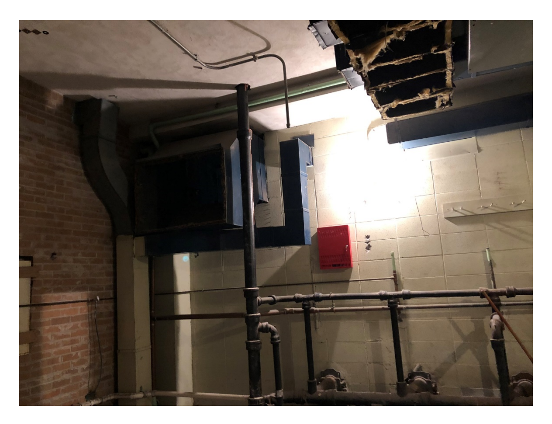
Figure 3 – E-322 Demo