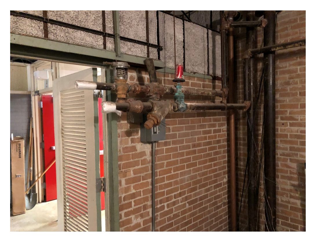
Figure 4 – E-322; existing hazard at door to be used for entry to Janitor's closet