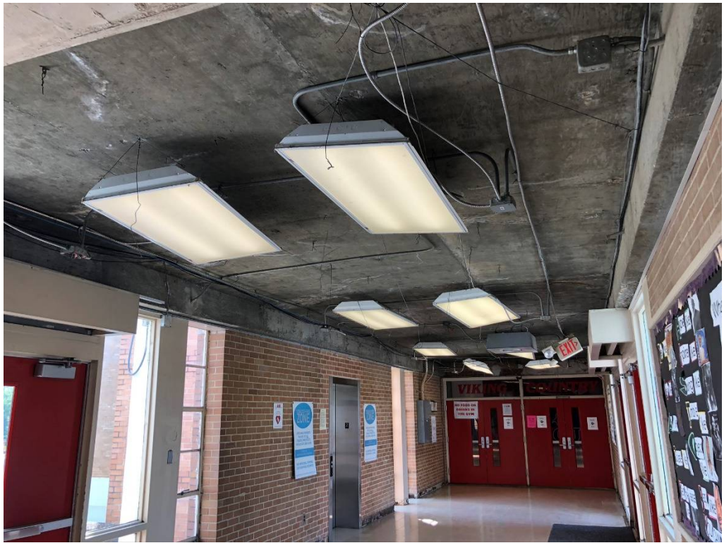
Figure 3 – 2 nd Floor Hall Ceiling Demo