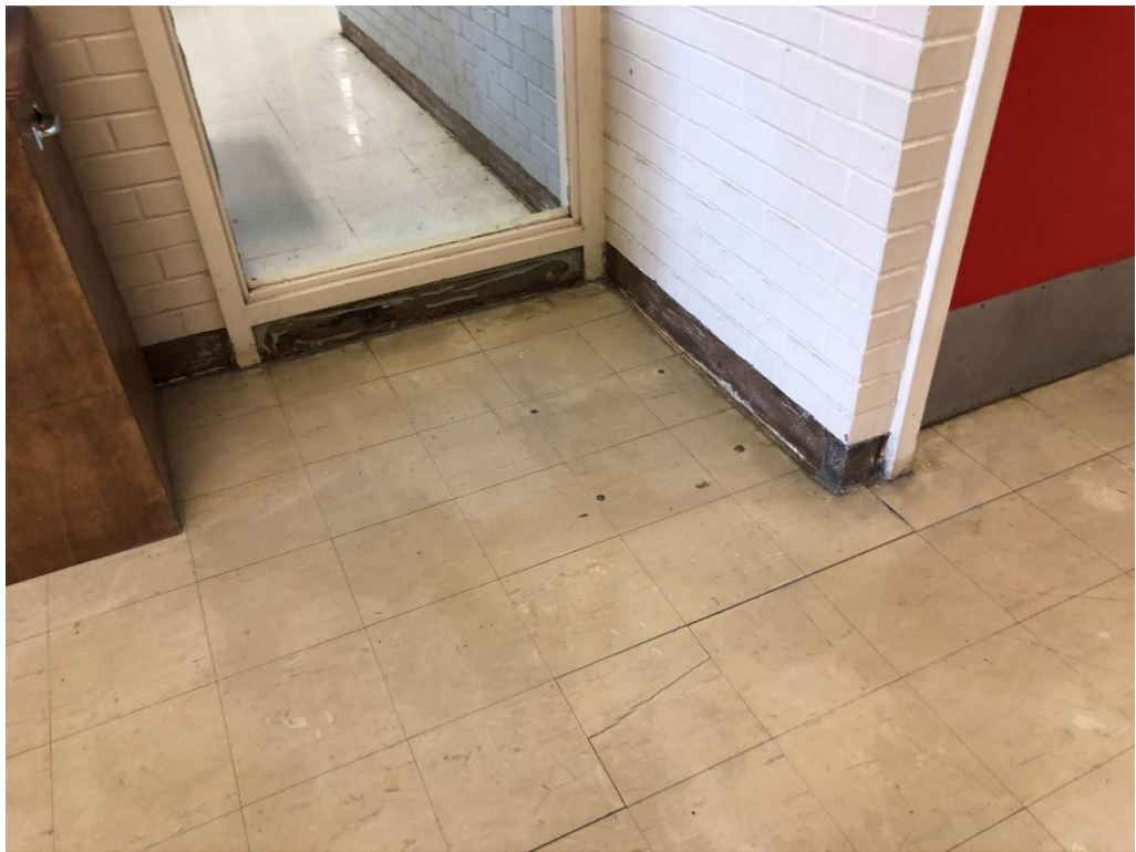
Figure 4 – Base Removal Continued