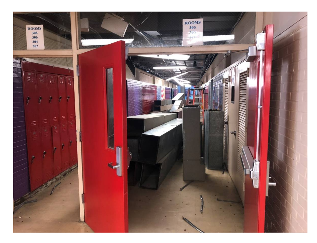
Figure 1 – West Wing 3<sup>rd</sup> Floor HVAC Demo