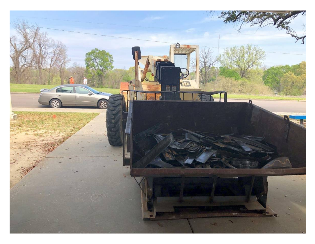
Figure 4 – Methods for Removing Debris from Front Door