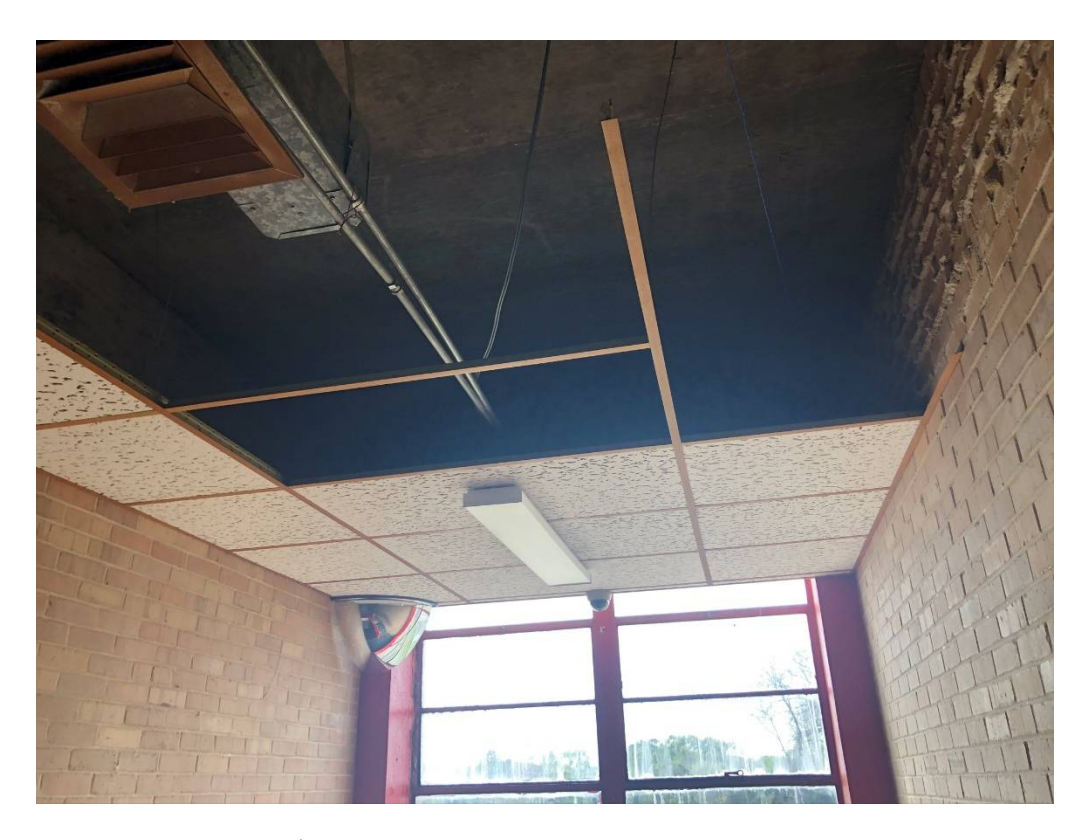
Figure 3 – West Wing 3<sup>rd</sup> Floor Ceiling Demo Remaining