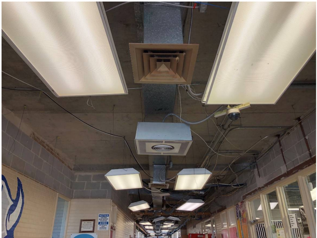
Figure 2 – Upper Floor Ceiling Demo