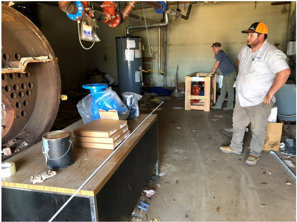
Figure 1 – Backflow Installation On Going