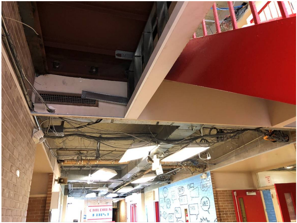
Figure 7 – 2 nd Floor Ceiling Demo