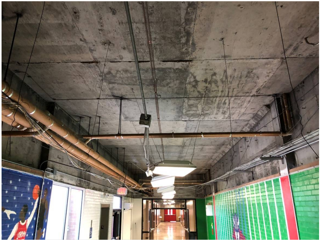
Figure 9 – 1 st Floor Ceiling Demo