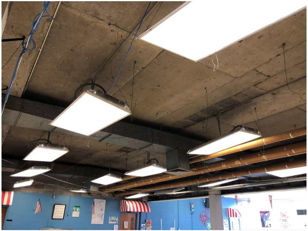
Figure 3 – Cafeteria Ceiling Demo