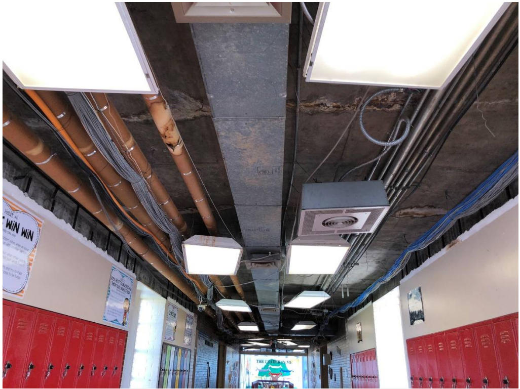
Figure 5 – Side Halls Ceilings Demoed