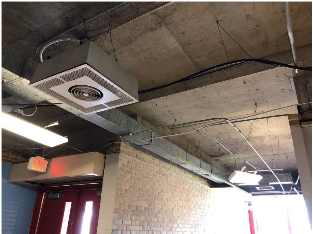
Figure 6 – Hall Demo