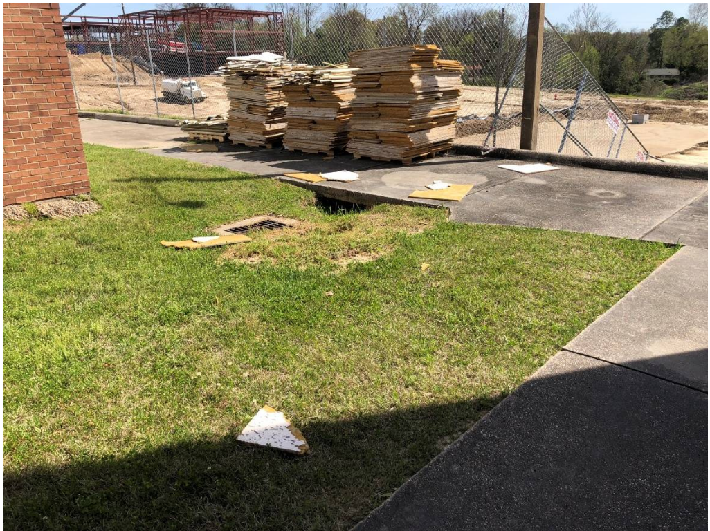
Figure 10 – Demolded Tiles Stored: What is the timeline for removal?