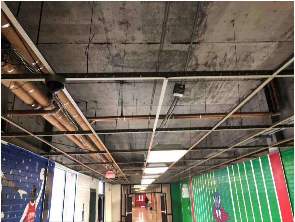
Figure 7 – Ceiling Tiles Removed in Main Hall