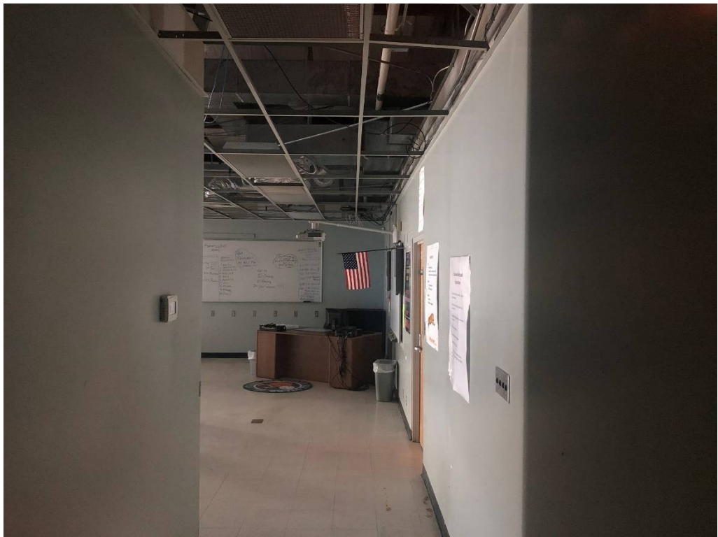
Figure 4 – Ceiling Tiles Removed in Classrooms