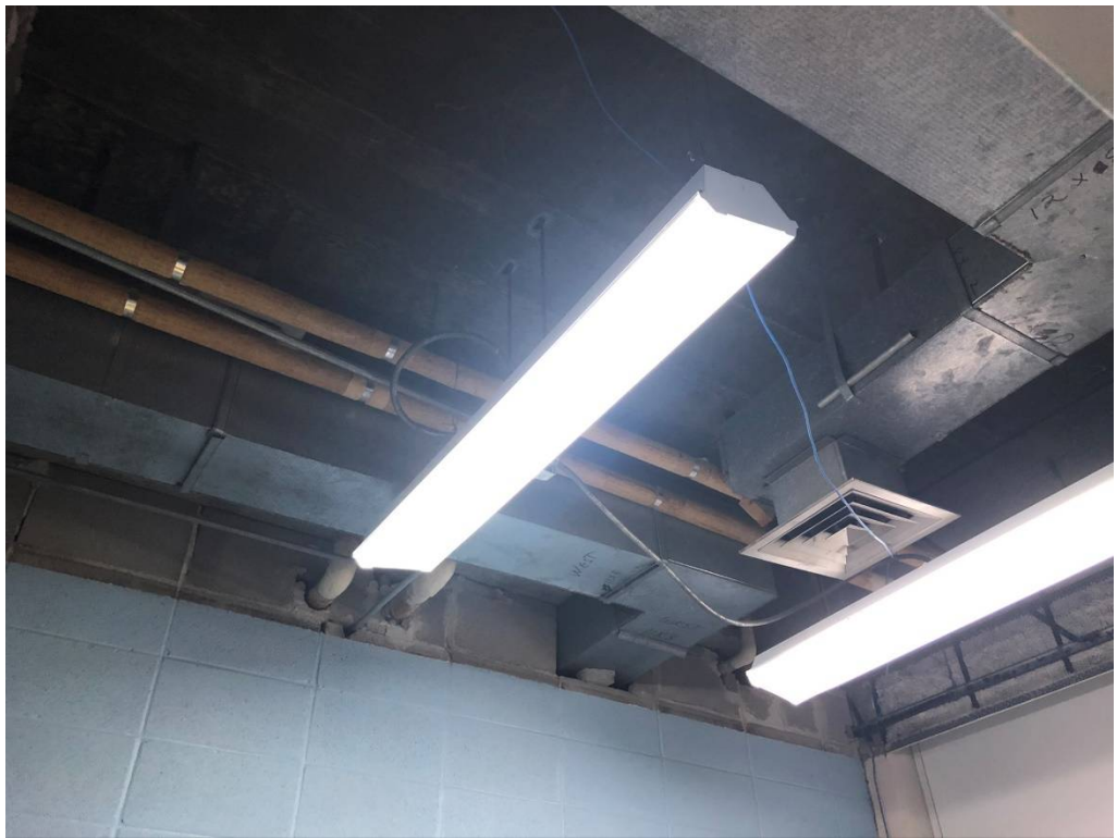
Figure 10 – Lights Suspended after Demo of Grid