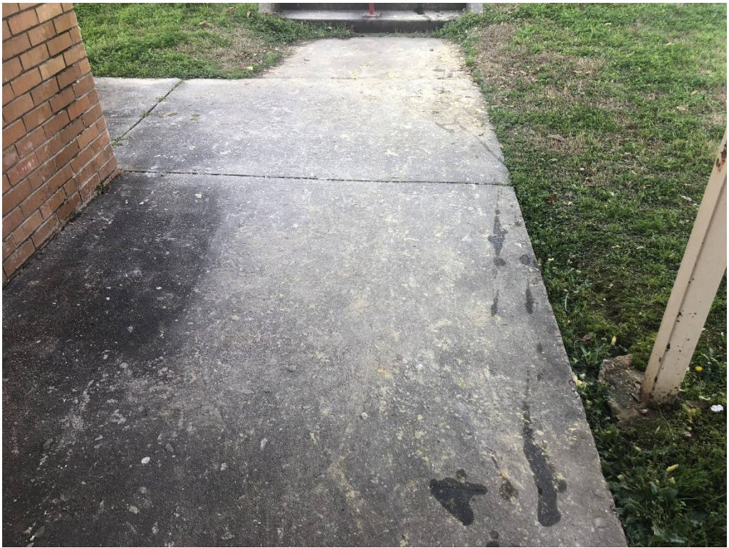
Figure 5 – Debris Trail (sidewalk to be replaced)