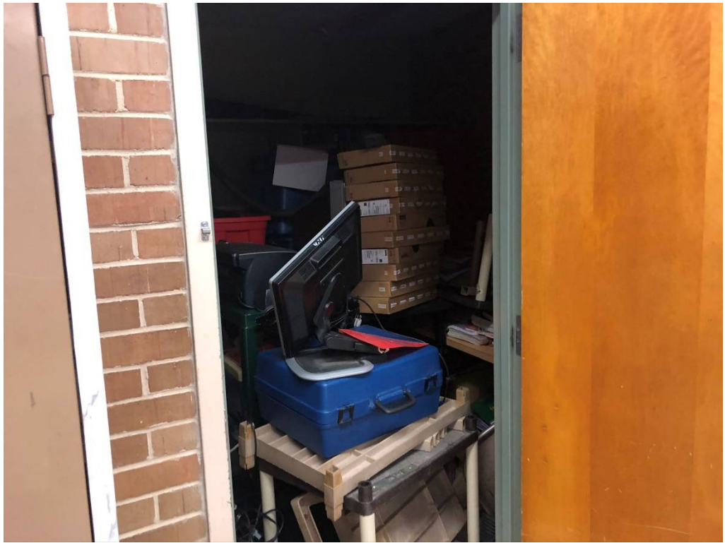
Figure 9 – Storage Room E-102C