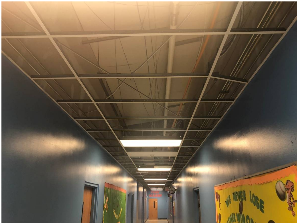
Figure 2 – Ceiling Tiles Removed in Hall