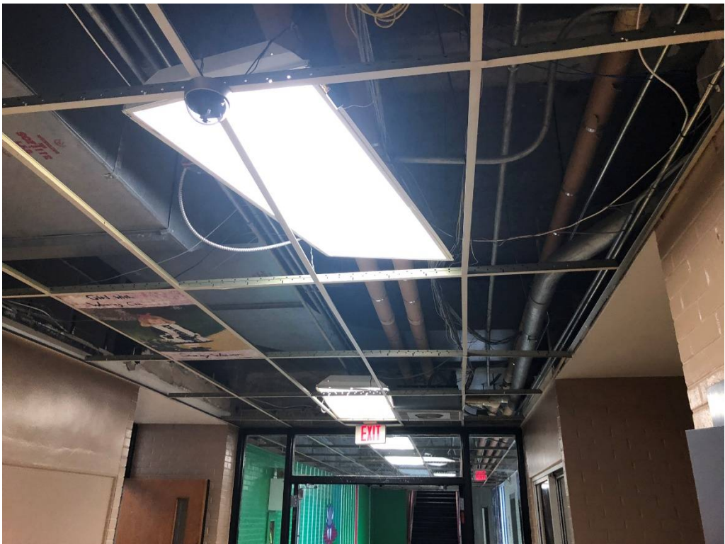
Figure 8 – Ceiling Tiles Removed