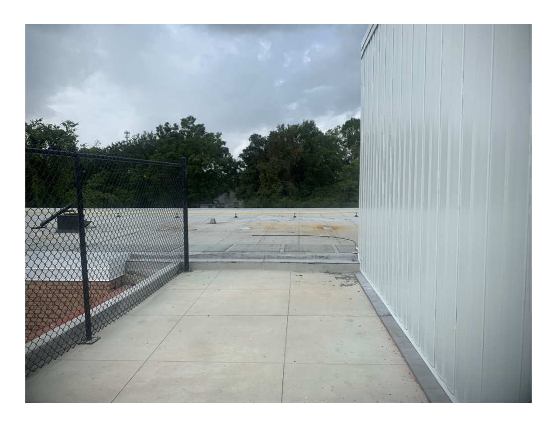
Figure 5 – Fence work is Ongoing