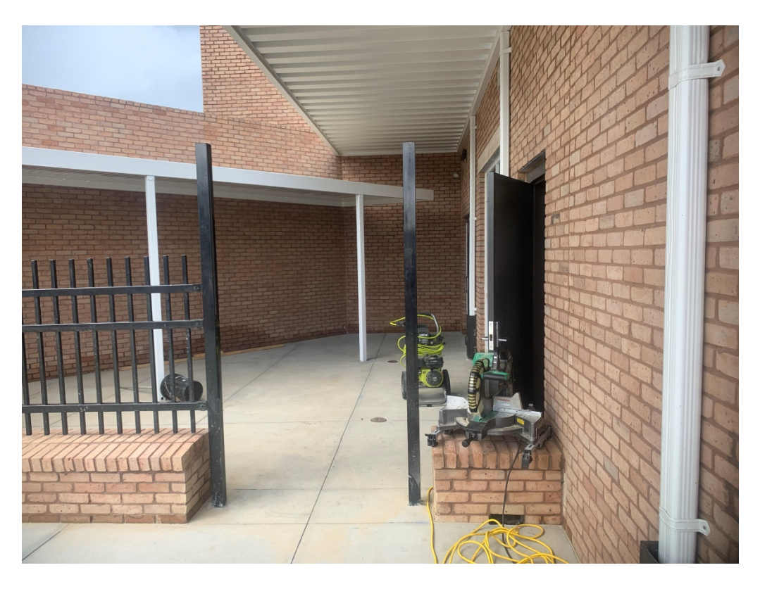
Figure 2 – Fence work is Ongoing