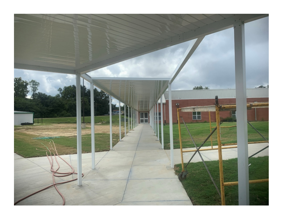
Figure 3 – Awning is Ongoing