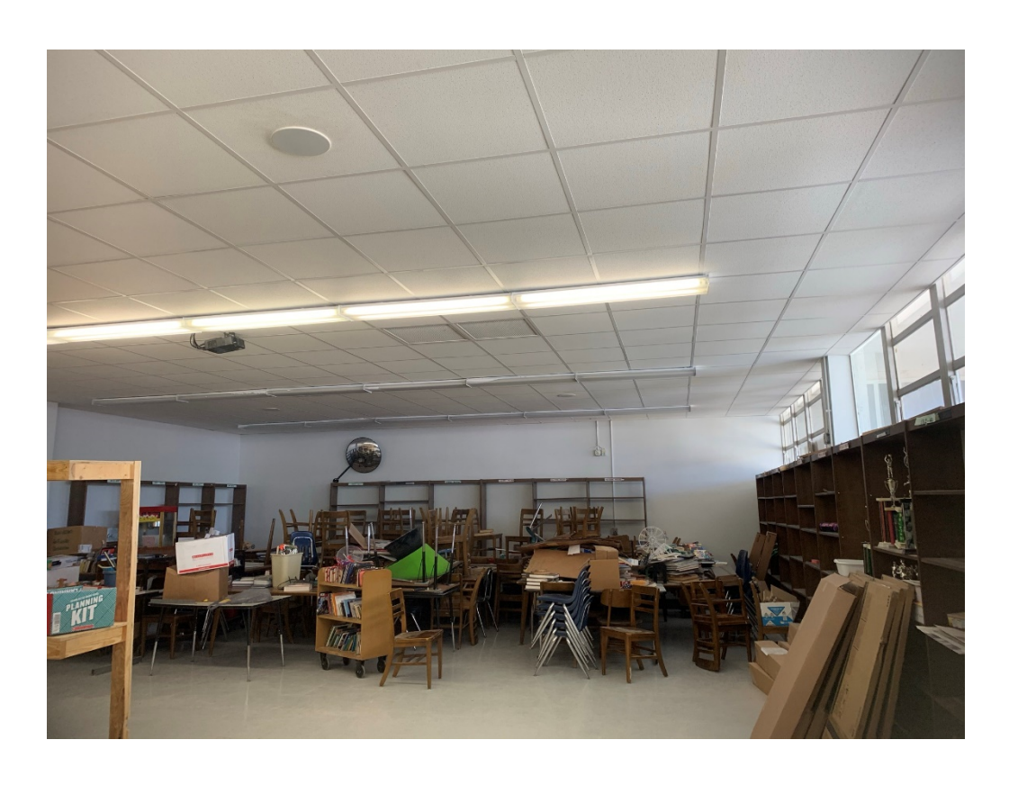
Figure 11 – New Ceiling in Library