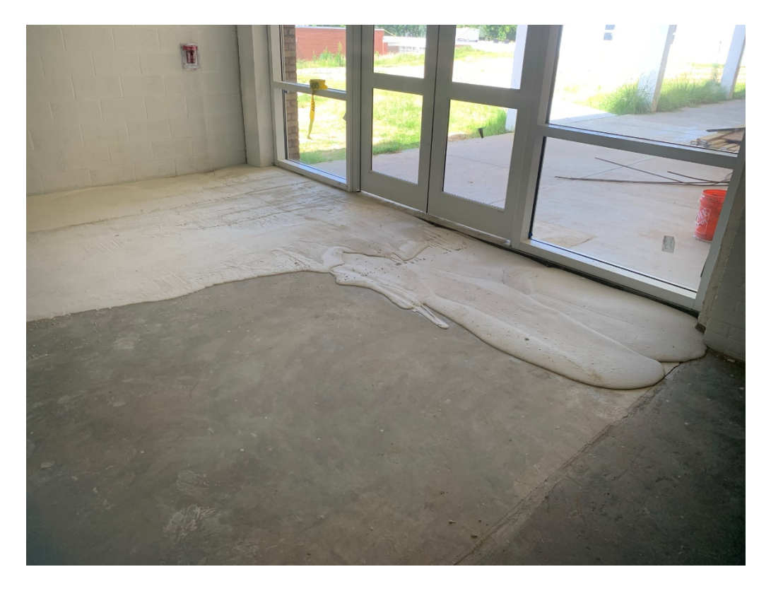
Figure 8 – Leveling at Up Floor in Ongoing for new Storefront Entrance