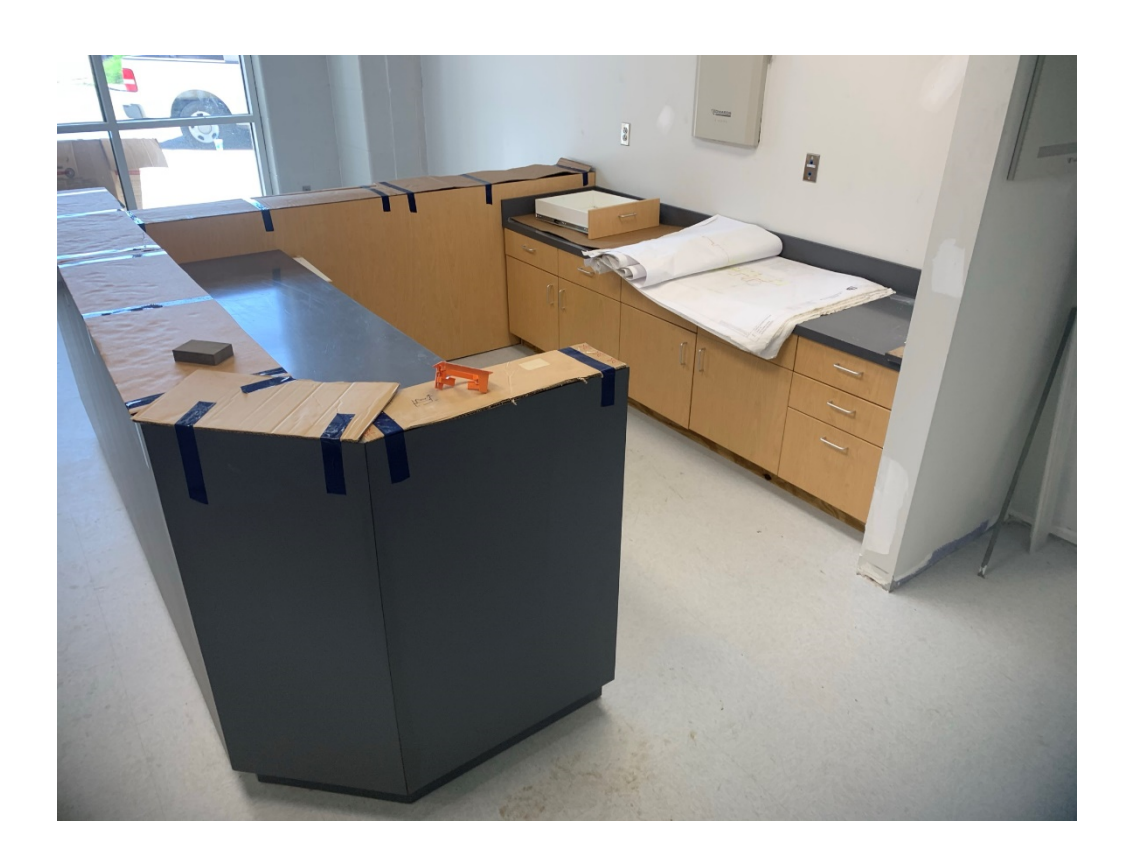
Figure 5 – New Millwork Installed