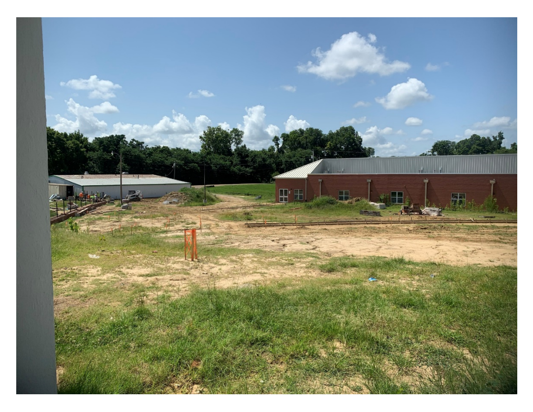
Figure 10 – Site Work is Ongoing