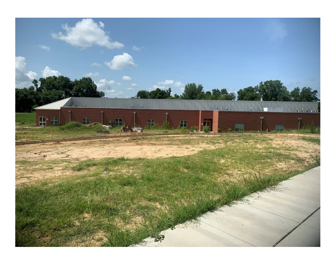
Figure 9 – Site Work is Ongoing