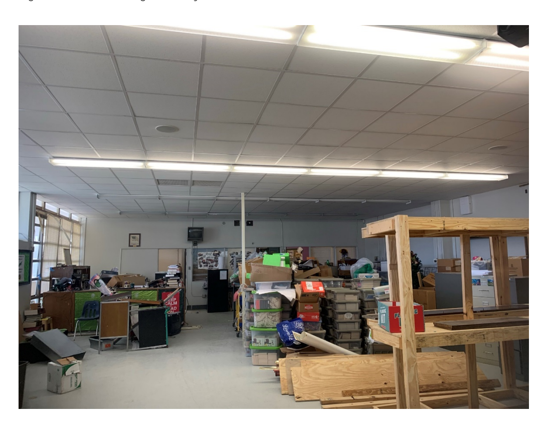
Figure 12 – New Ceiling in Library