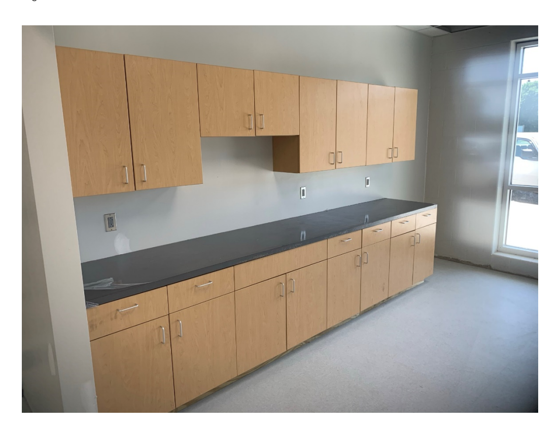
Figure 6 – New Millwork Installed