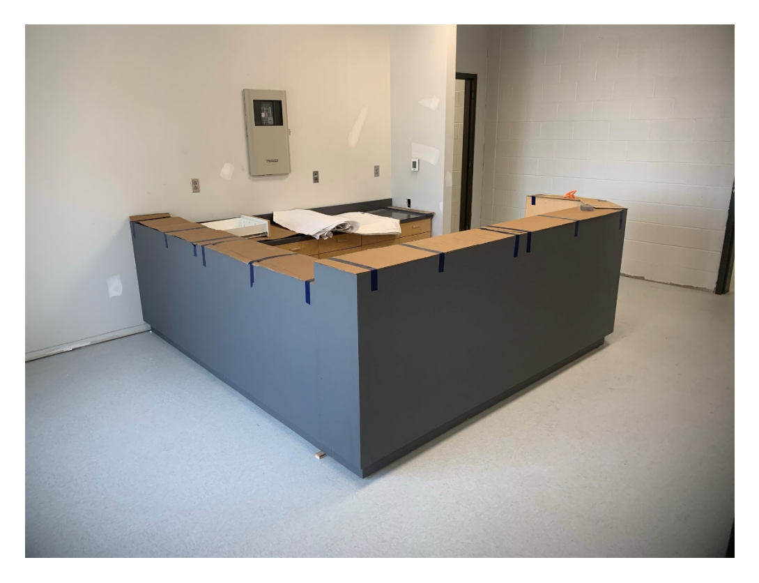
Figure 4 – New Millwork Installed