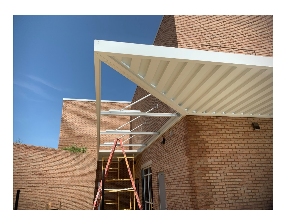
Figure 3 – Awning Installation is Ongoing