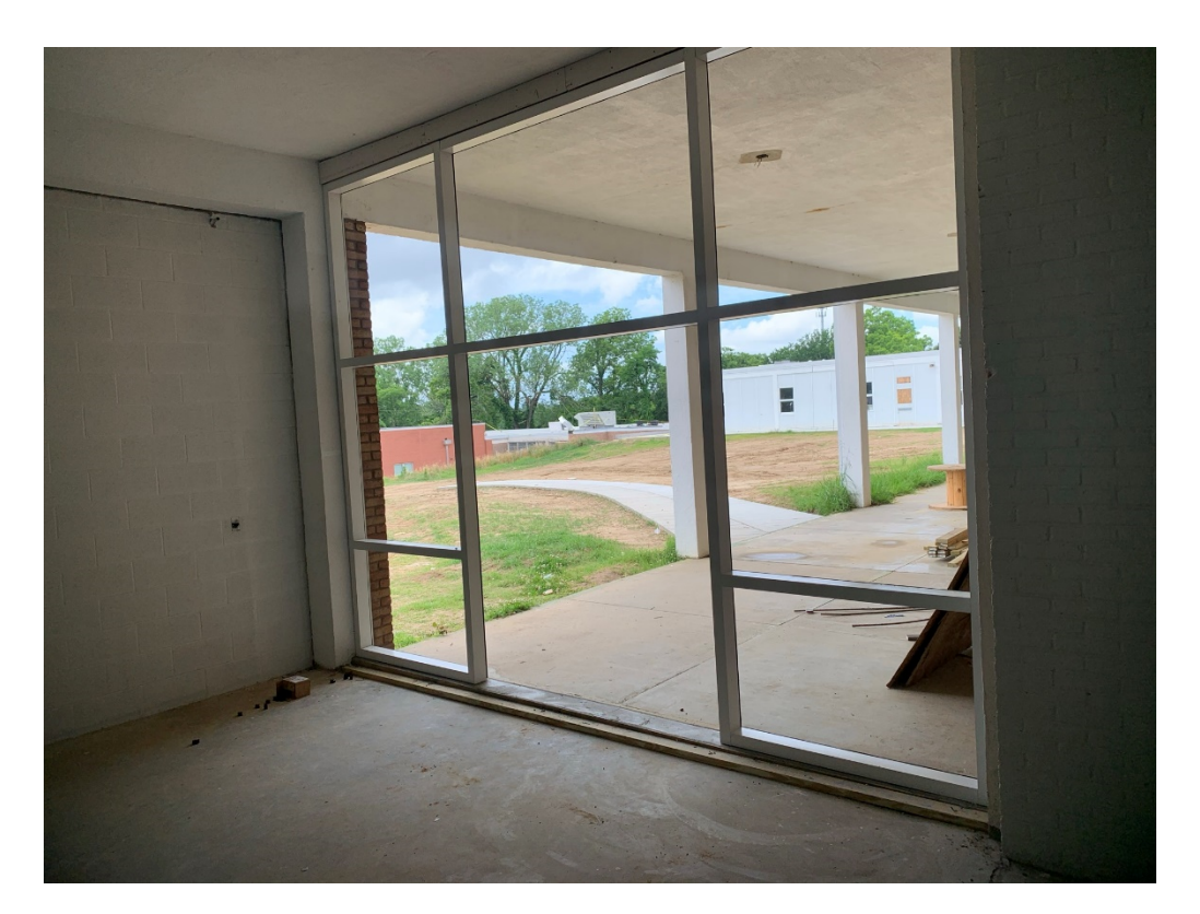
Figure 10 – Storefront; will interior of porch area be raised for final floor level to match threshold?