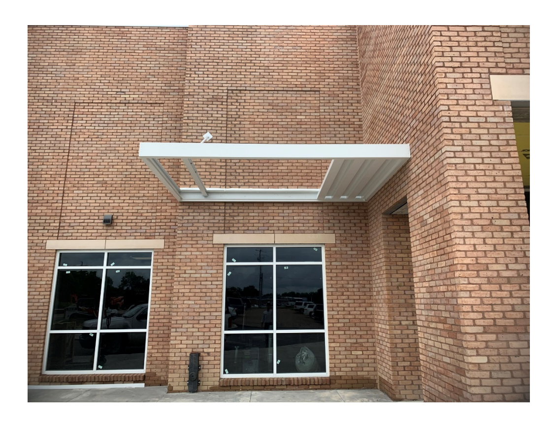
Figure 3 – Metal Awning Install has begun