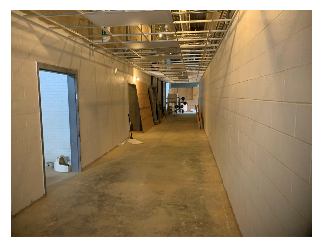
Figure 8 – Ceiling Grid installed at Hall