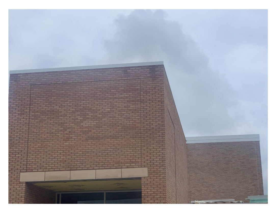
Figure 2 – Roof Trim Installed at parapet