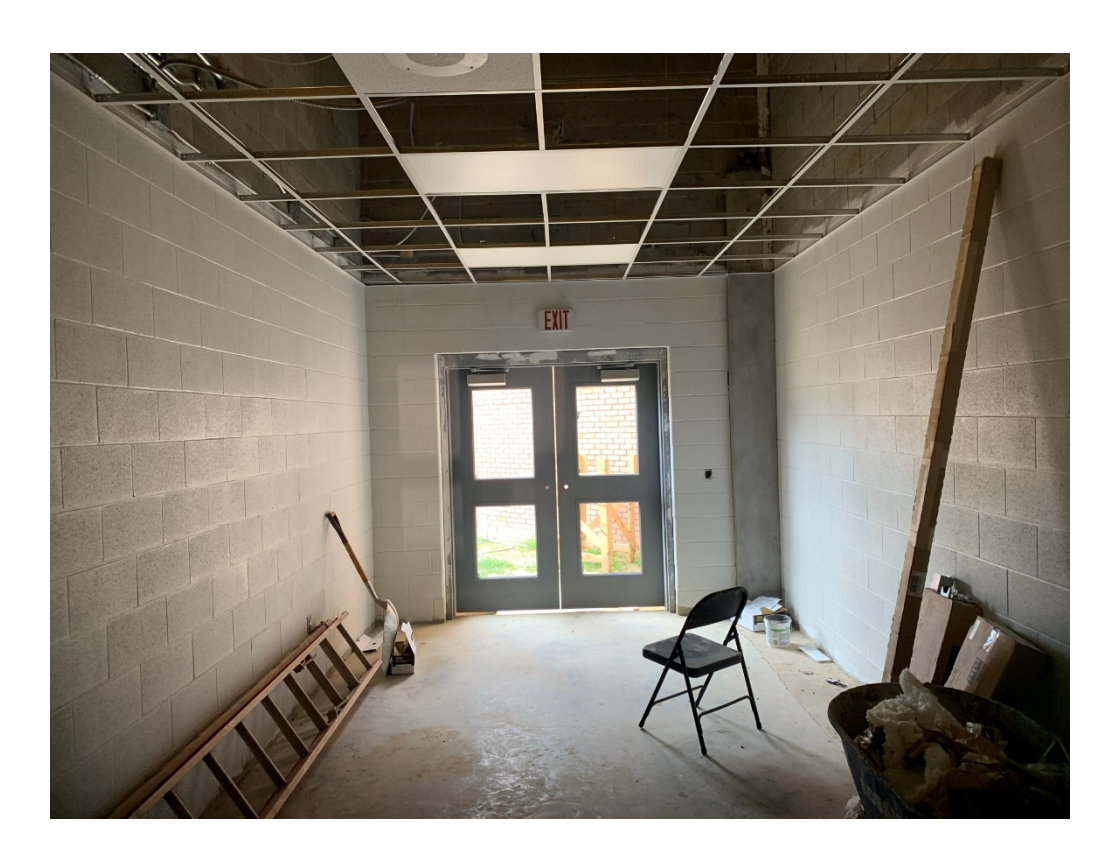
Figure 9 – Exit Doors Installed