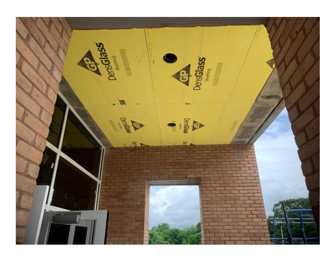
Figure 5 – Gypsum Ceiling Installed