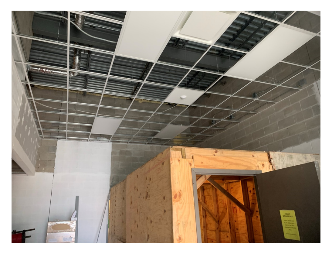
Figure 6 – Ceiling Grid Install at Entry