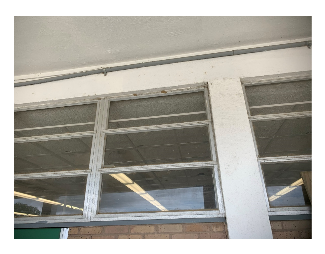
Figure 11 – Library ceiling needs finishing at end where window shows above new ceiling