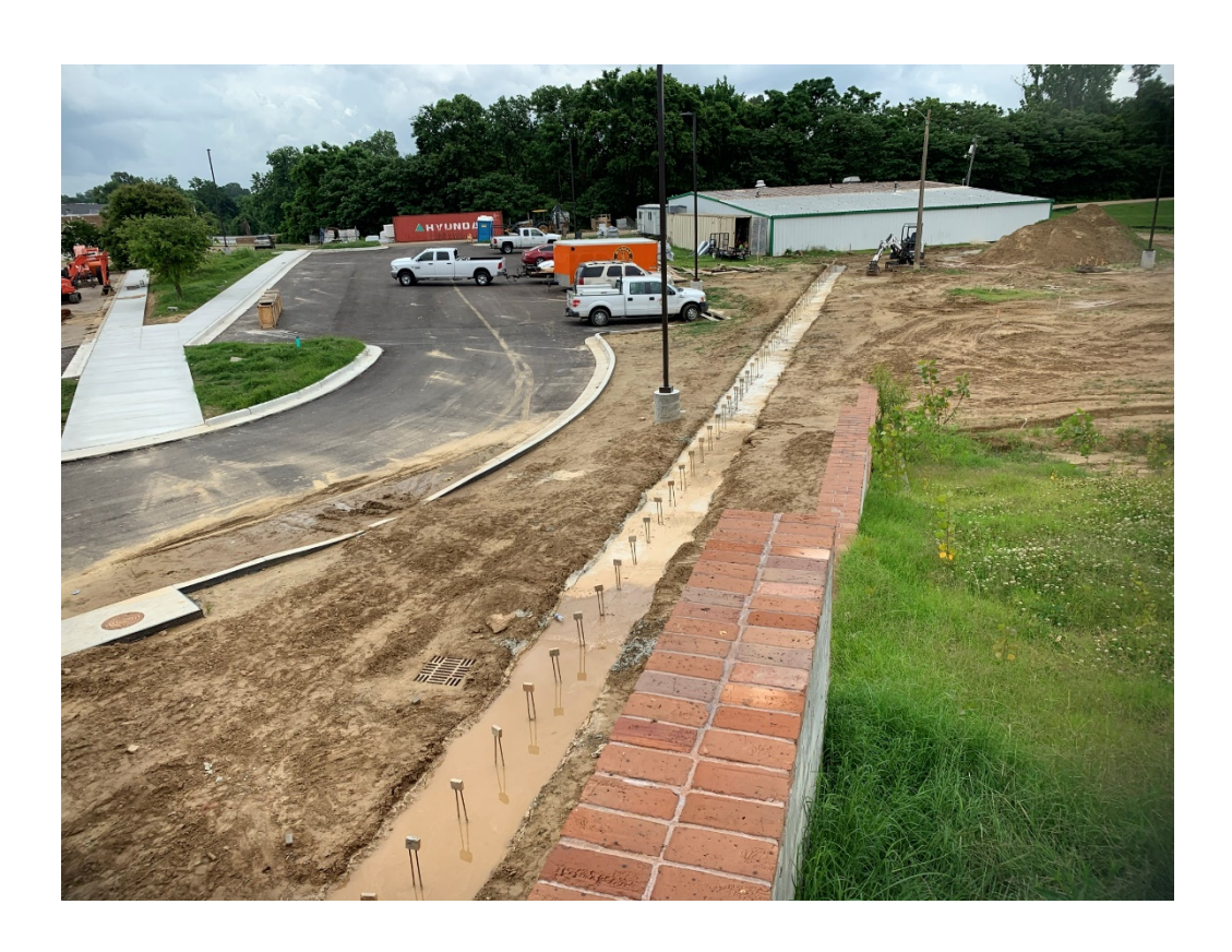
Figure 13 – New Sidewalk Base