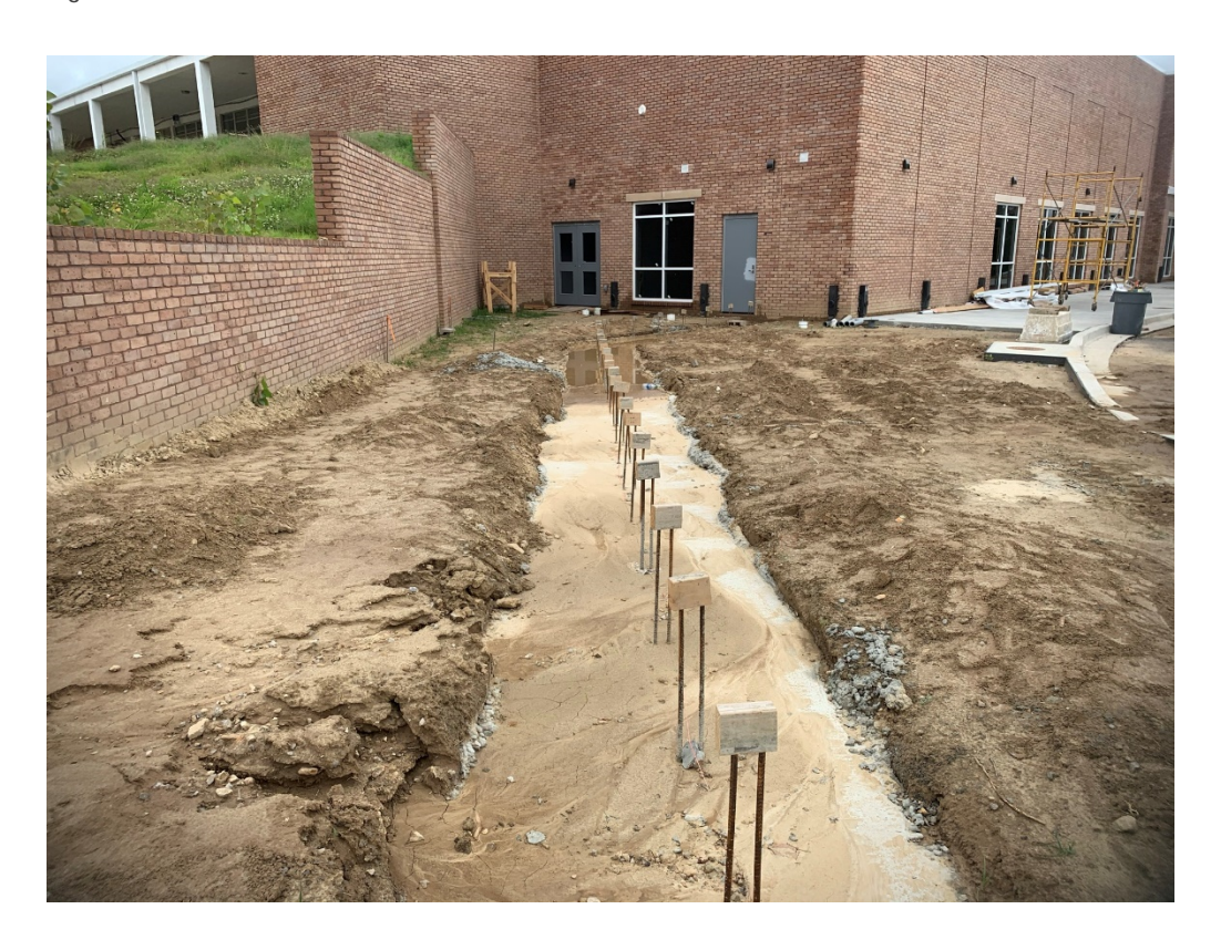
Figure 14 – Sidewalk Base