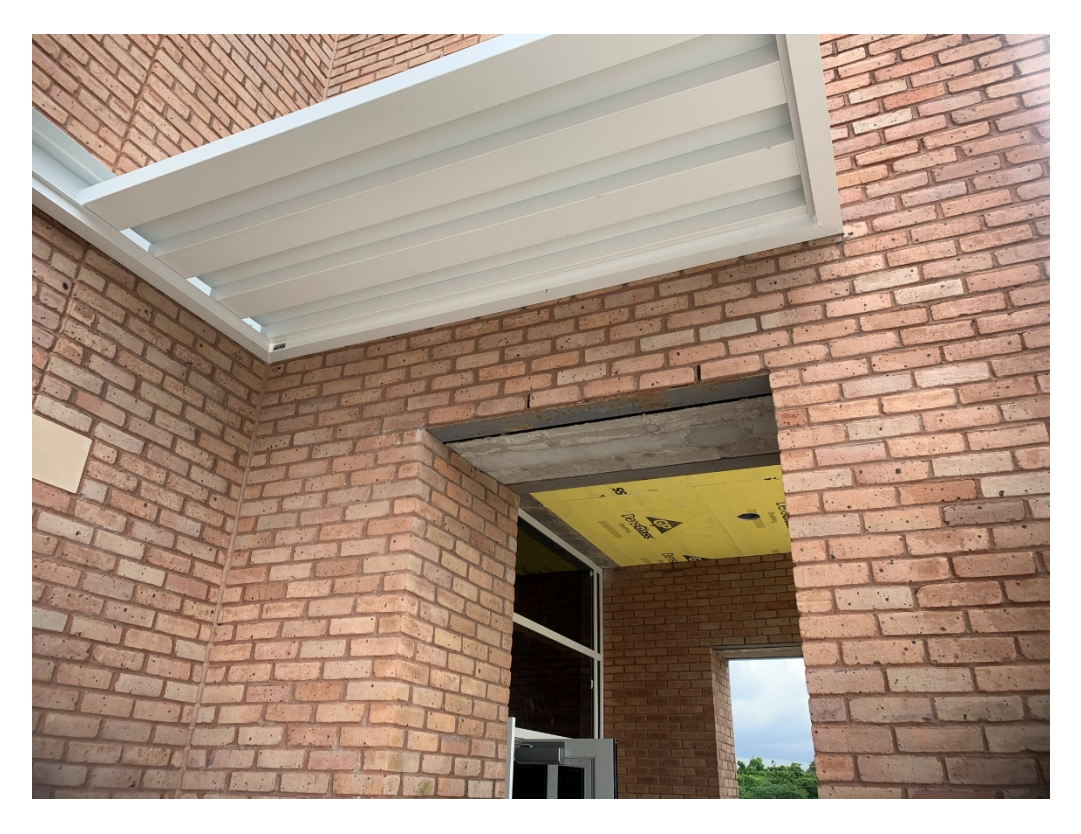
Figure 4 – Metal Awning Install has begun