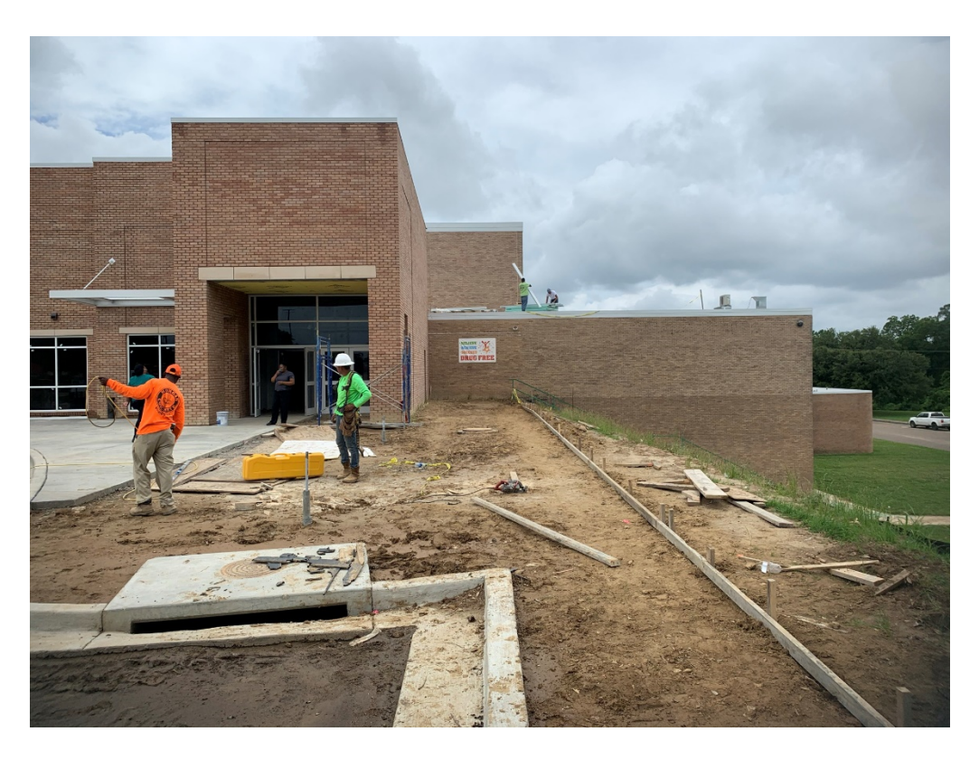
Figure 1 – Roof Work is nearing completion