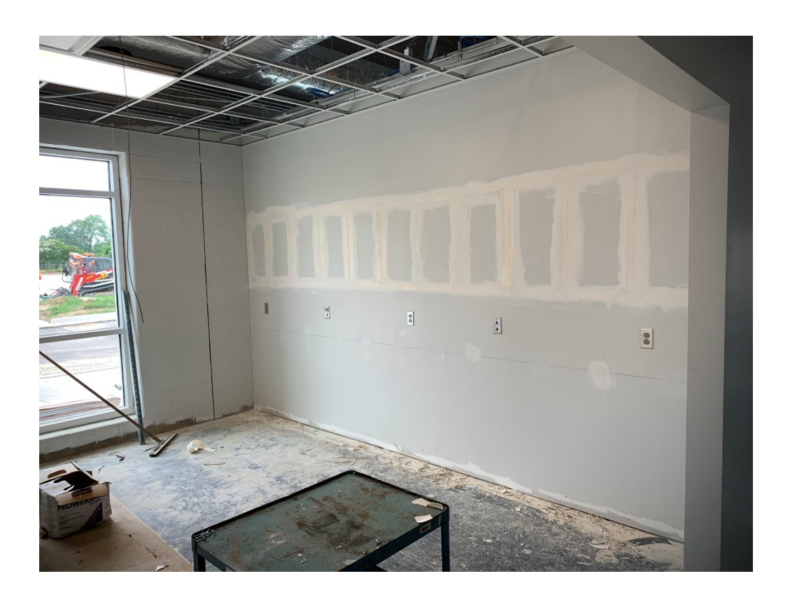
Figure 7 – Drywall Repair at Work Room