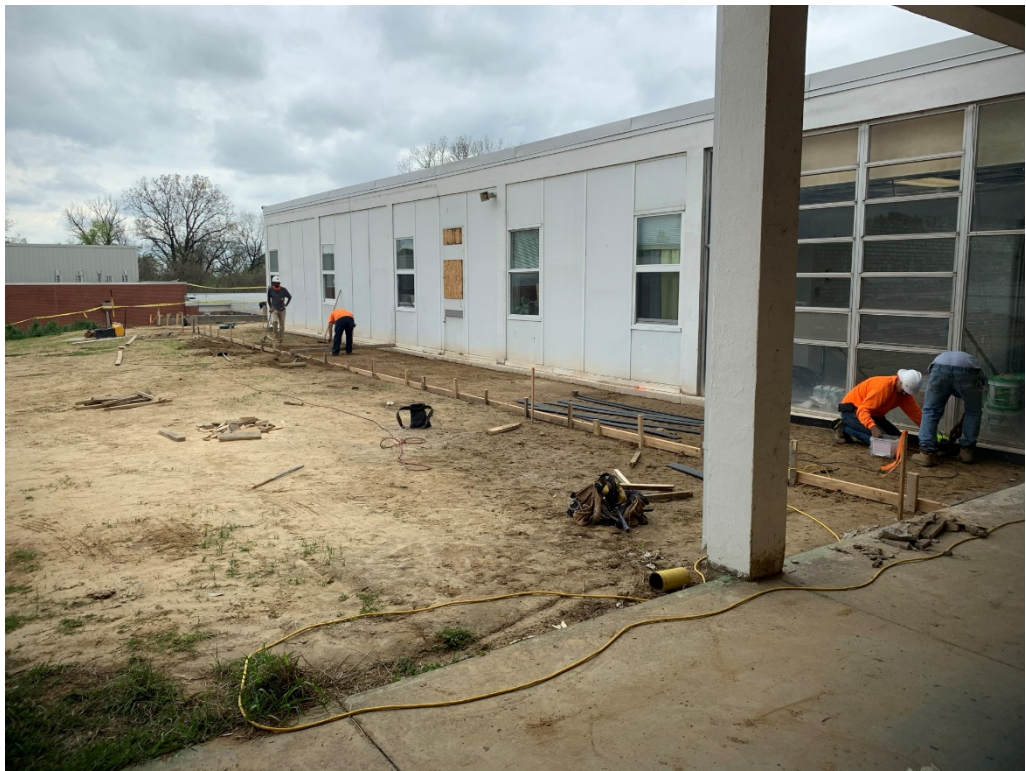
Figure 17 – Forms for new Sidewalk