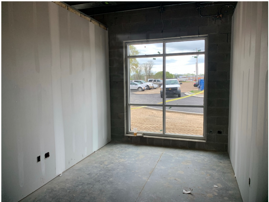
Figure 7 – Book Keeper