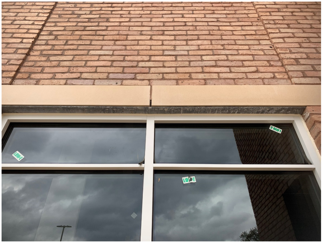
Figure 3 – Storefront Installed