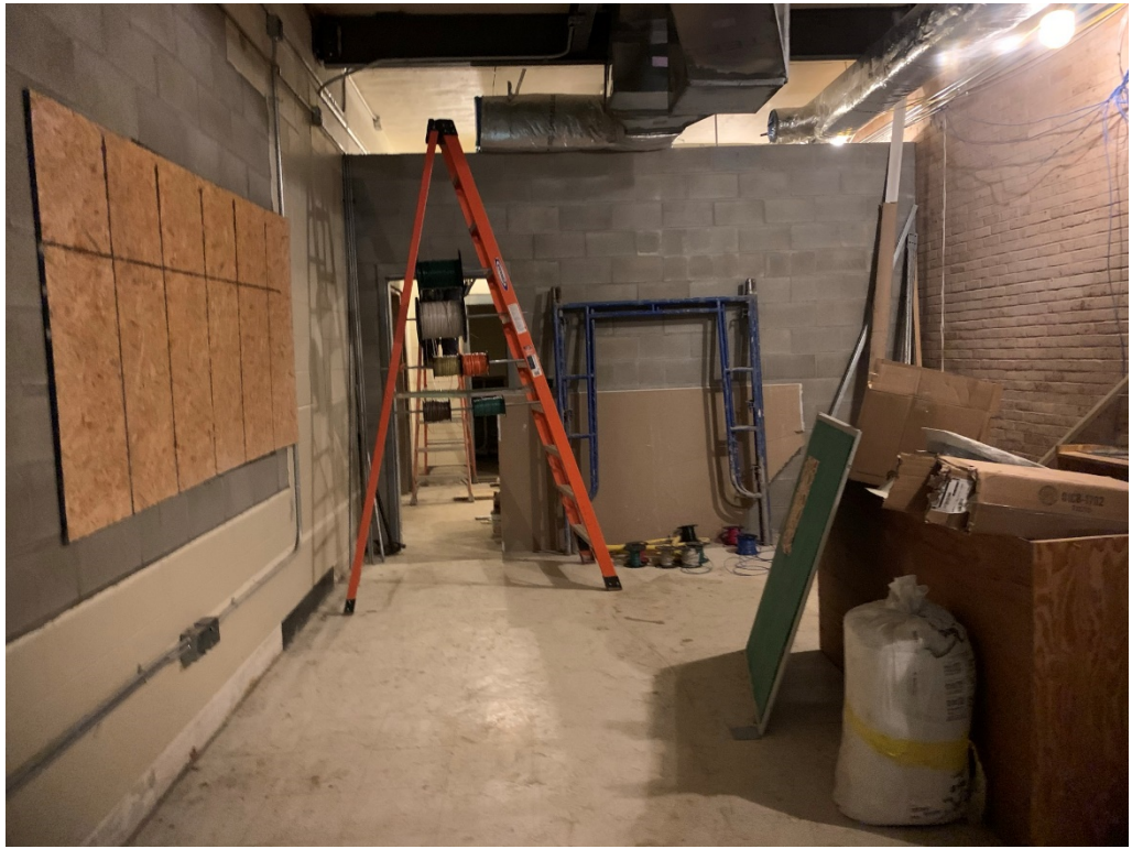
Figure 5 – Electricians On Site