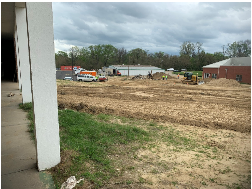
Figure 18 – Contractor Reviewing Grading