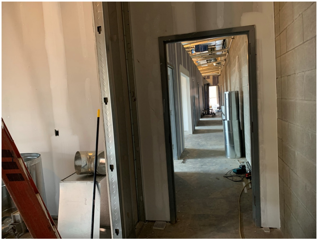
Figure 6 – Reception Looking Down Corridor