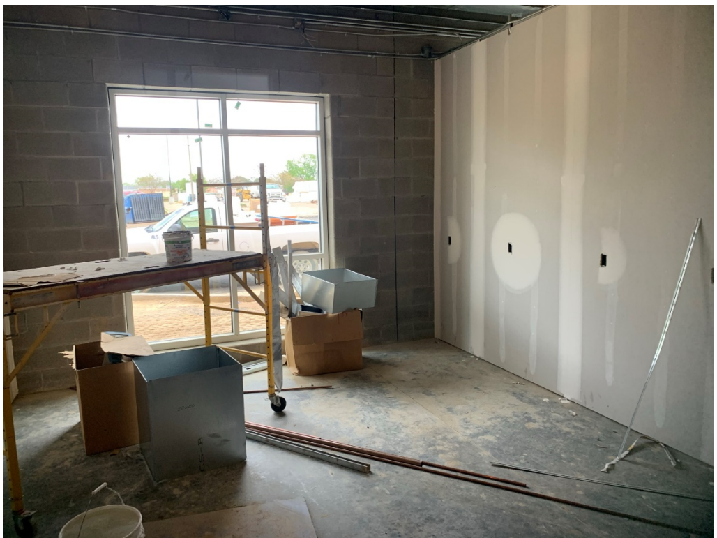
Figure 8 – Work Room