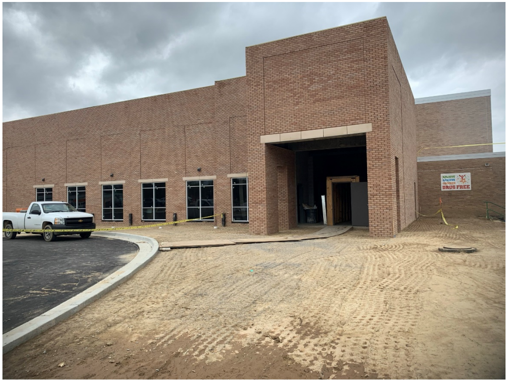
Figure 1 – Storefront Installed