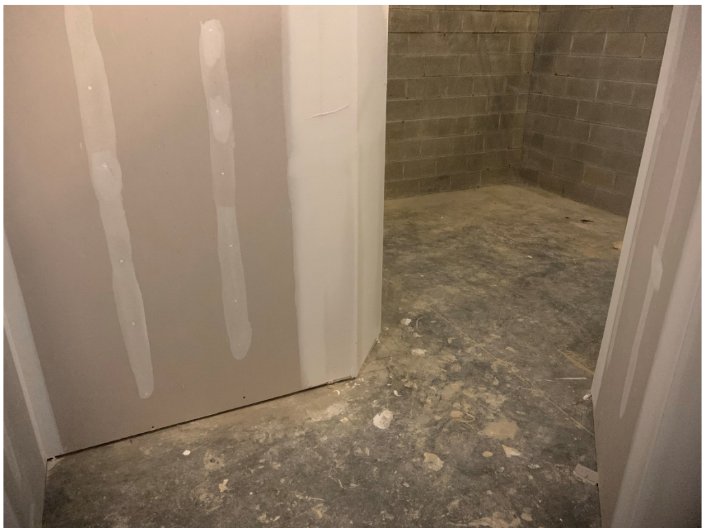
Figure 14 – The Vault