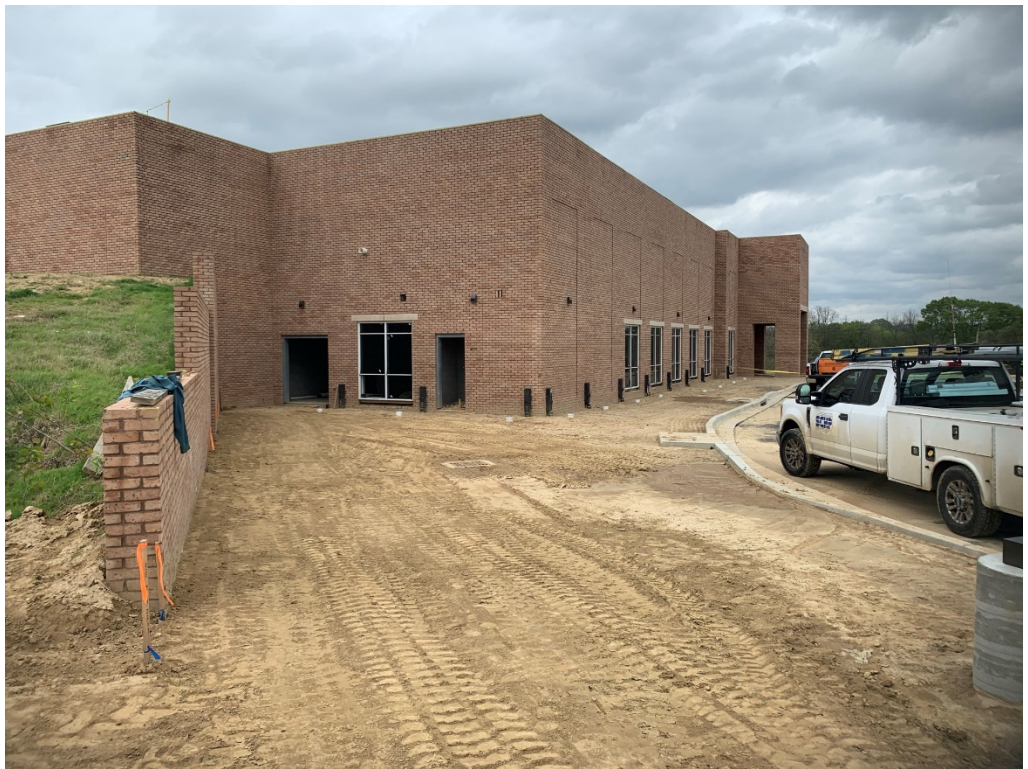
Figure 16 – Storefront Installed