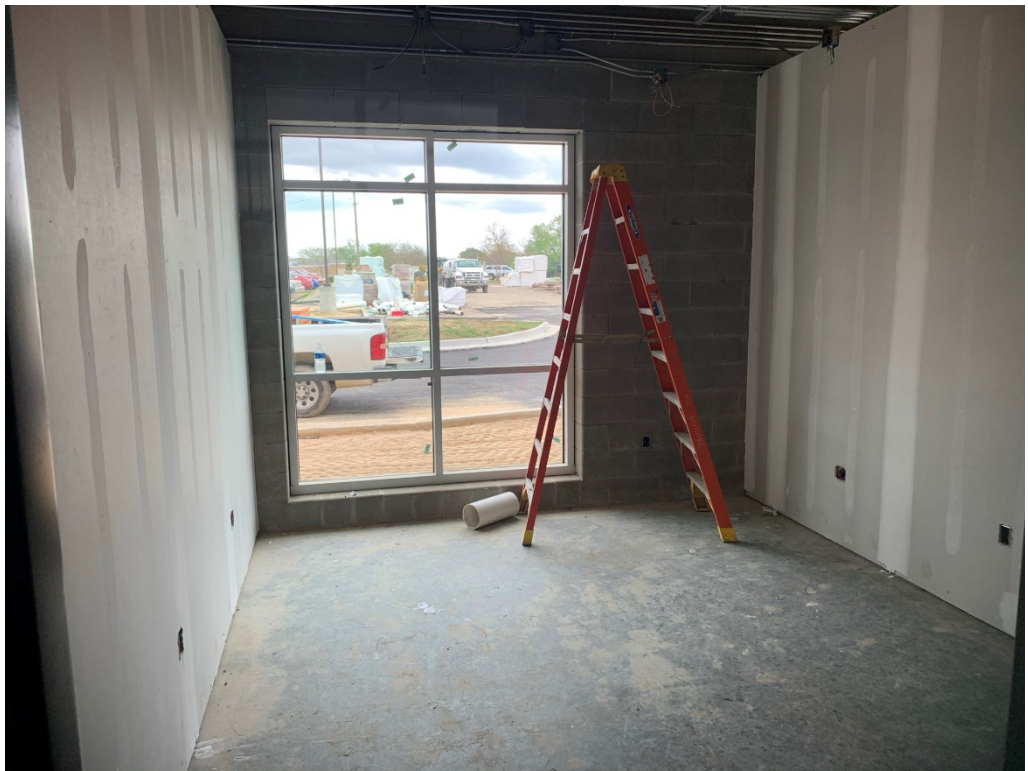
Figure 9 – Conference