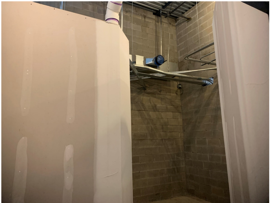
Figure 13 – The Vault