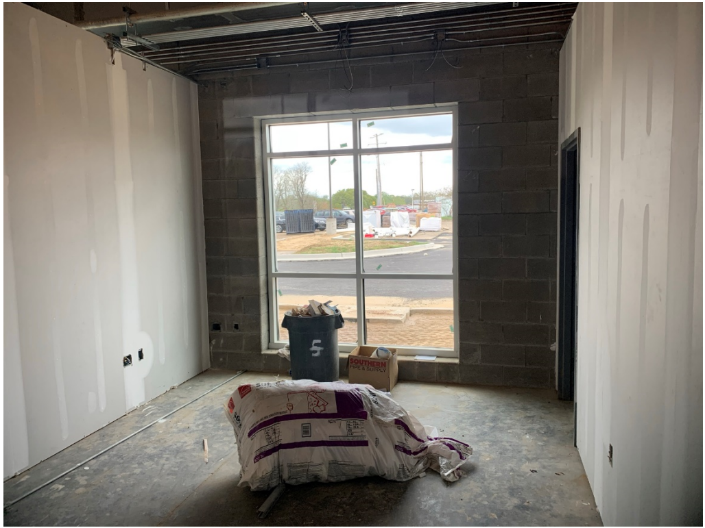
Figure 11 – Principal's Office