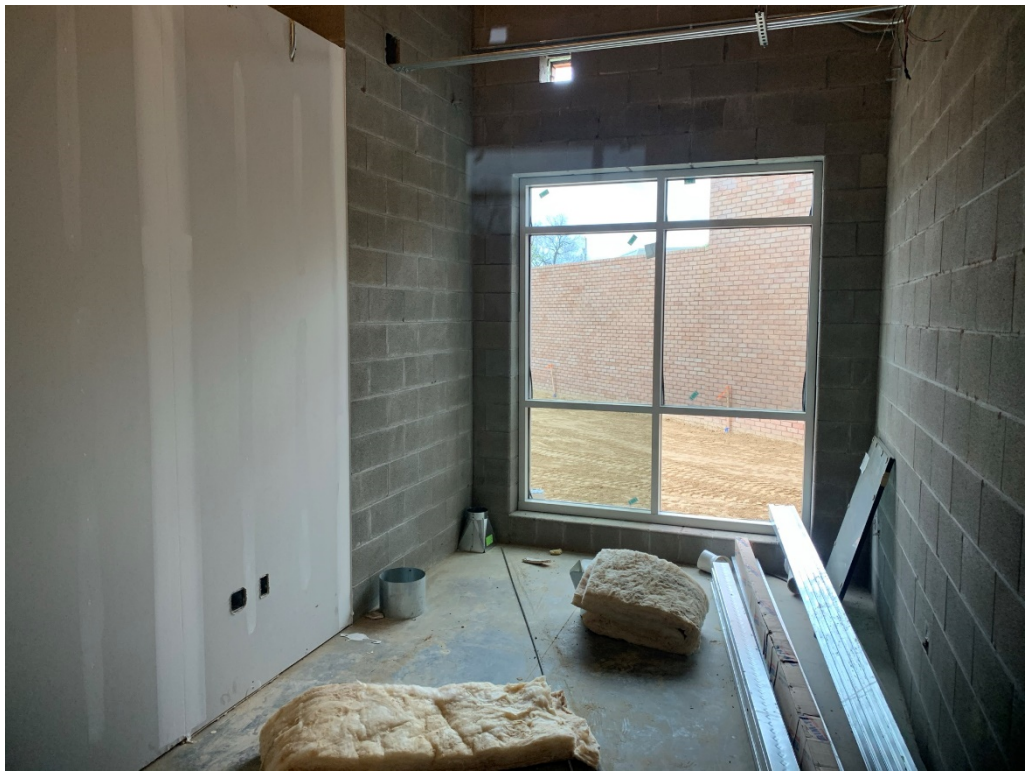
Figure 15 – Counselor Office