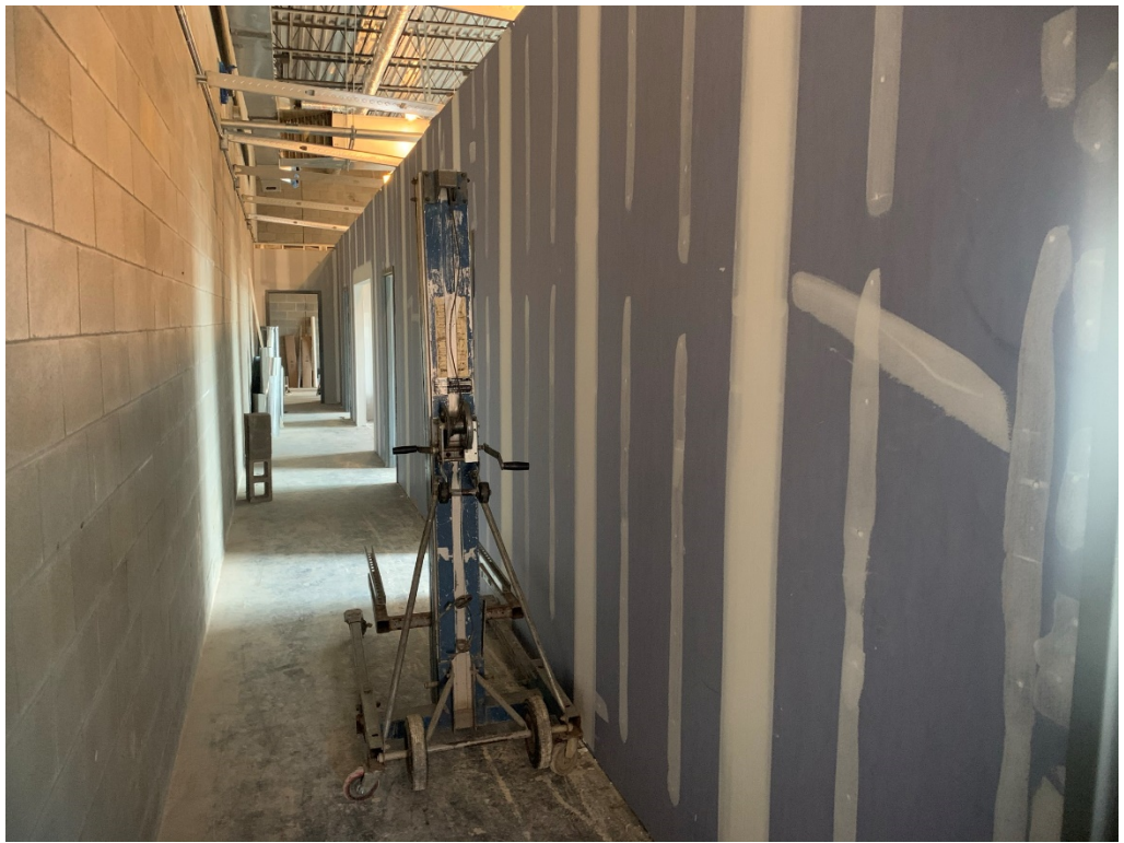
Figure 12 – Corridor A-212