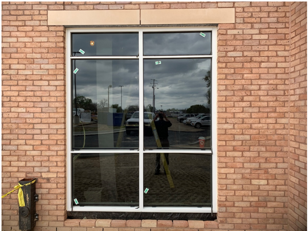
Figure 2 – Storefront Installed