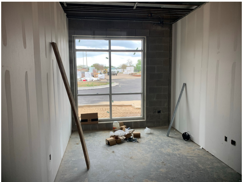
Figure 10 – Office 207