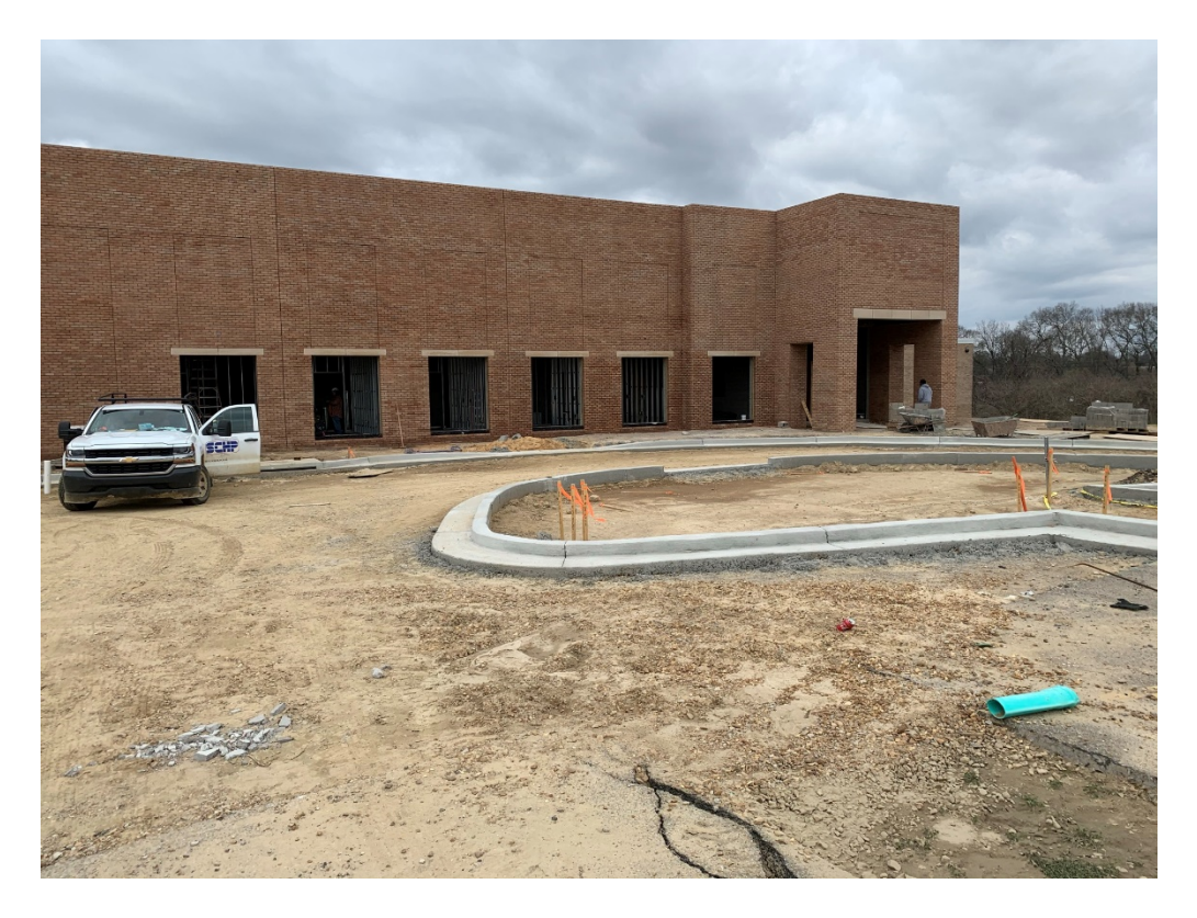
Figure 2 – East Elevation