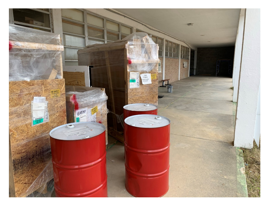
Figure 12 – Upstairs Storage Outside of Library