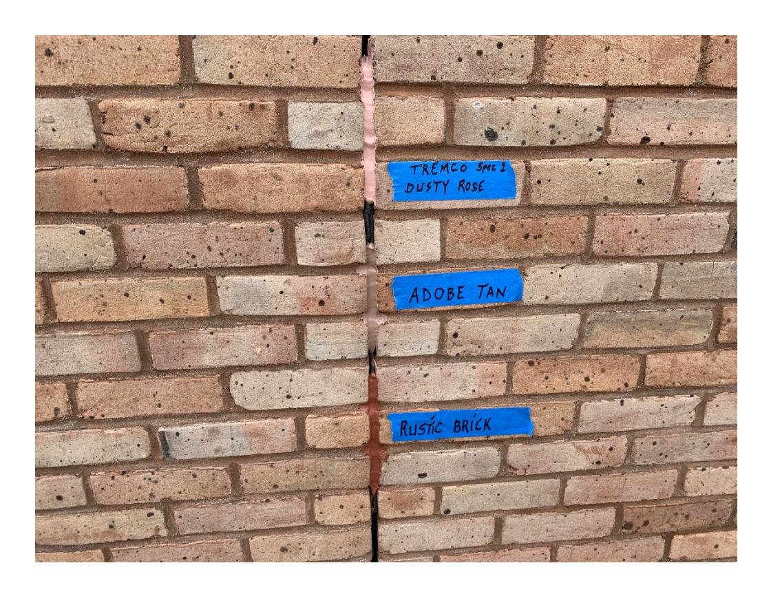
Figure 3 – Test Sealant Colors at Exterior Brick