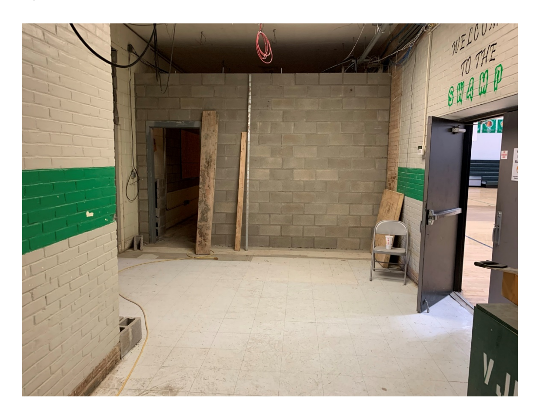
Figure 10 – Block work at new concessions area