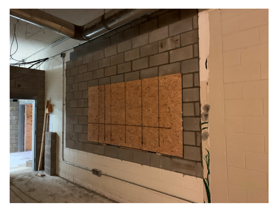
Figure 8 – Block work at new concessions area