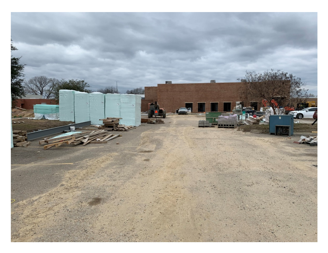
Figure 1 – Storage Area at Parking Lot