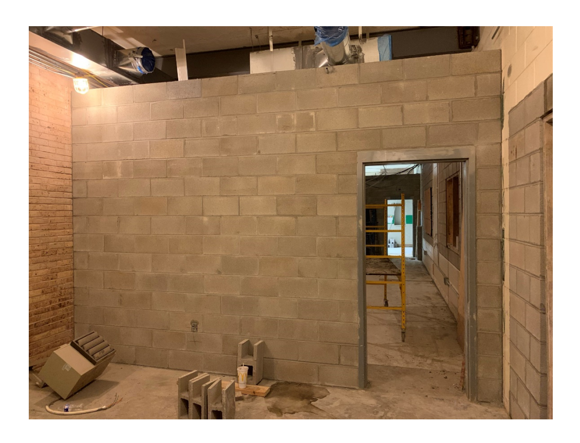
Figure 7 – Block work at new concessions area