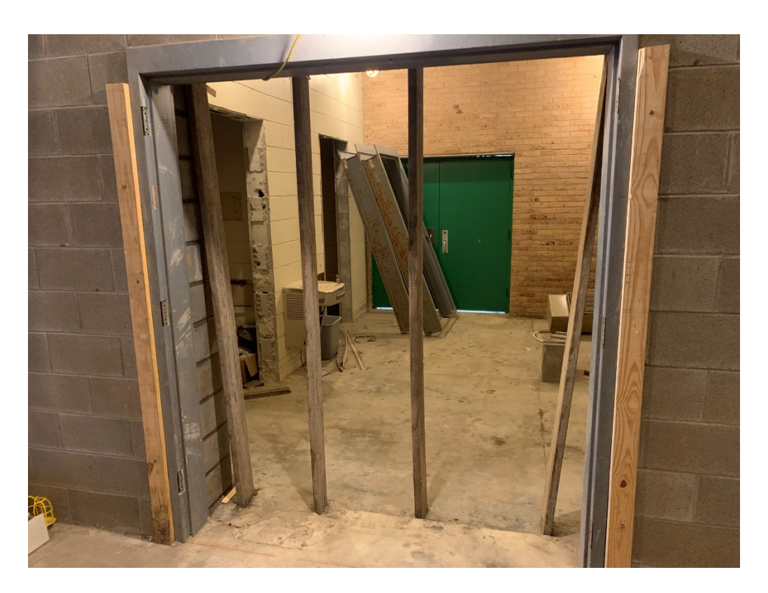
Figure 5 – Block work at new concessions area