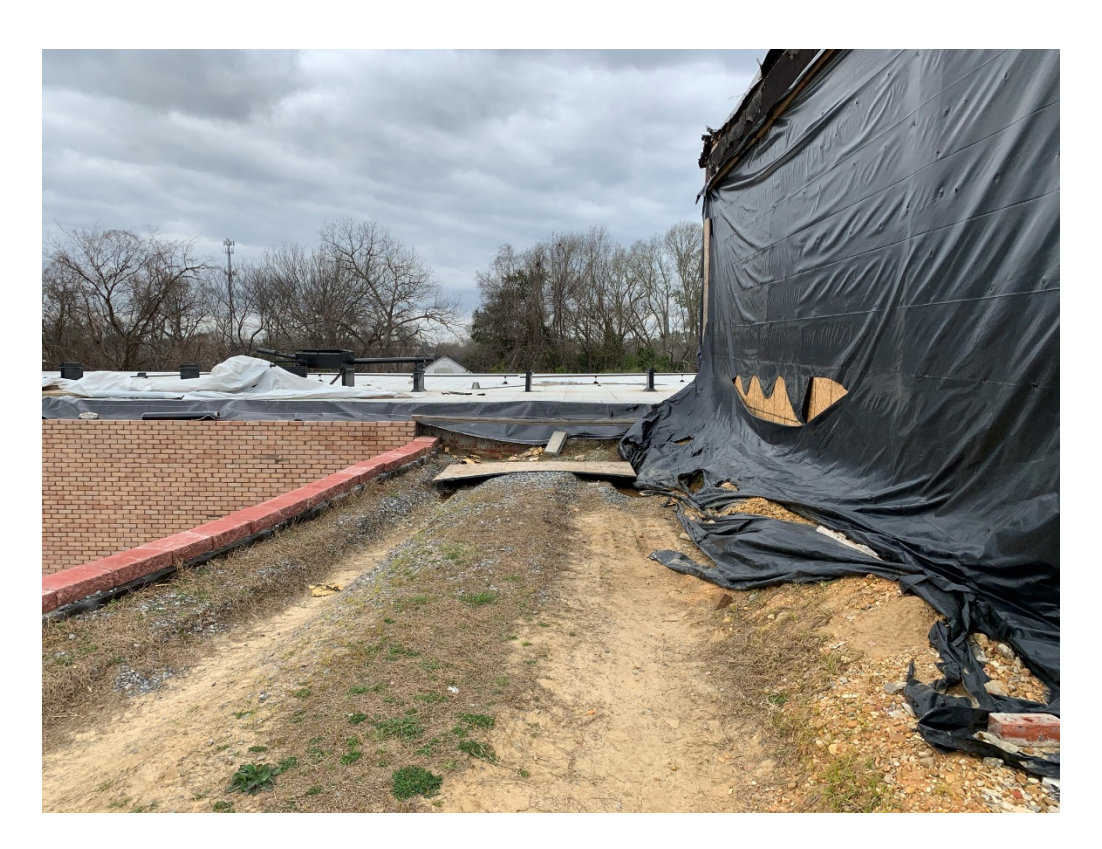
Figure 13 – Roof Awaiting Tie In