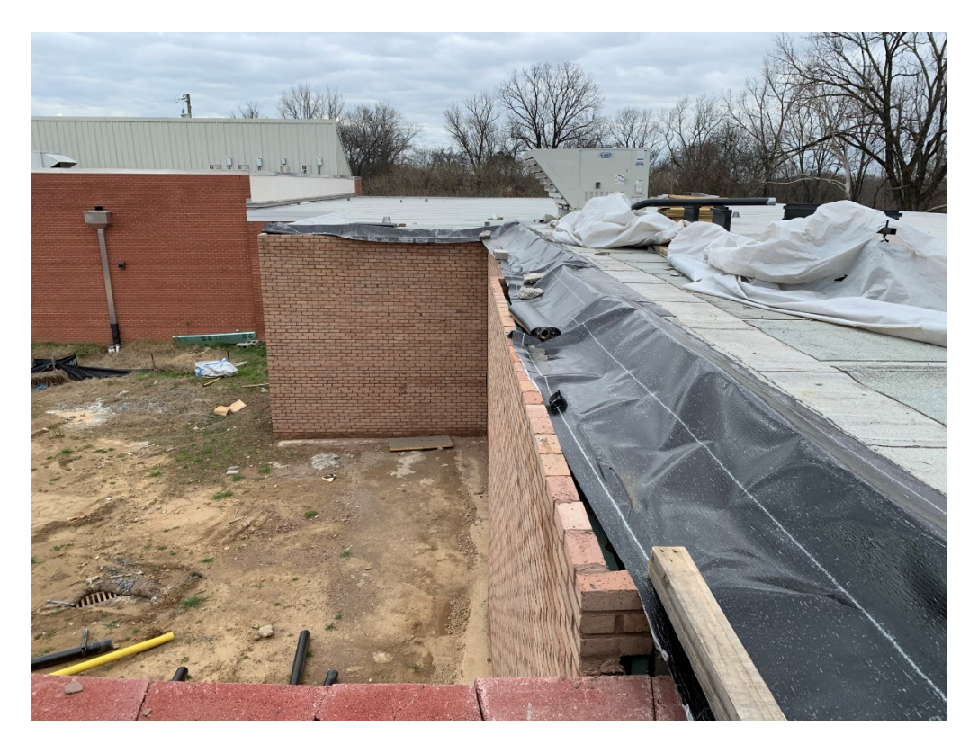
Figure 14 – Roof Awaiting Tie In