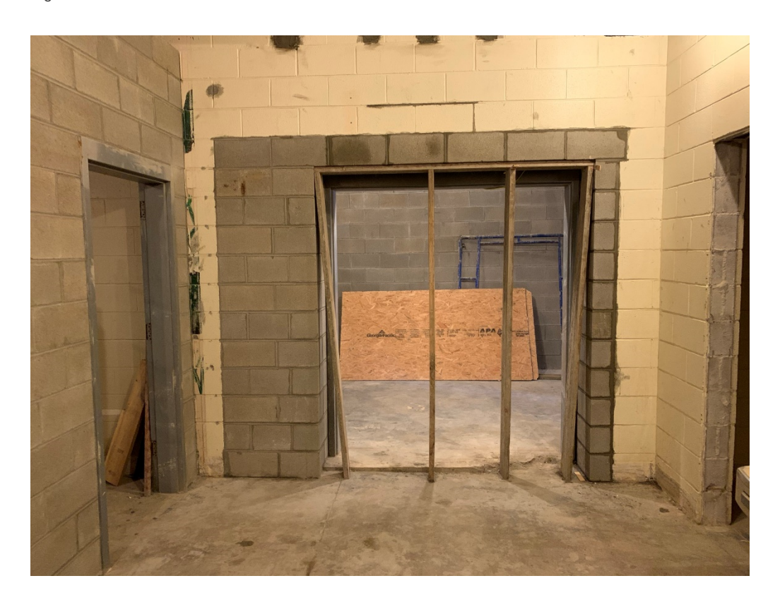
Figure 6 – Block work at new concessions area