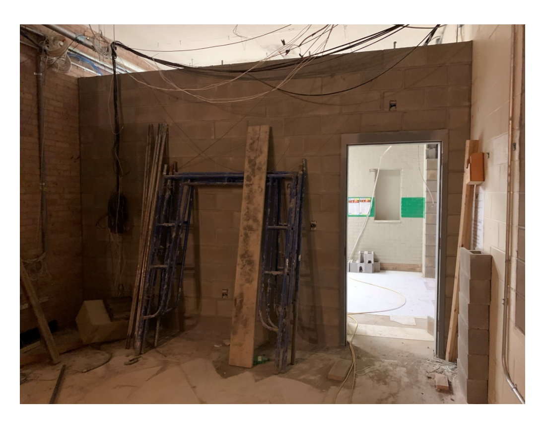
Figure 9 – Block work at new concessions area