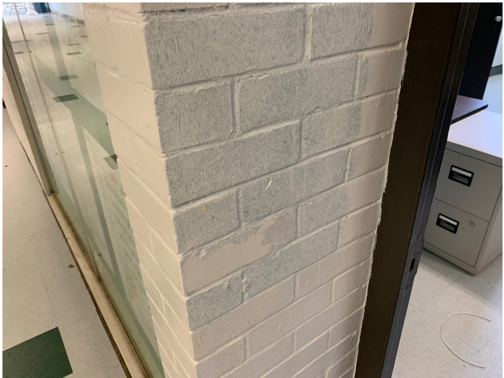
Figure 11 – Interior Hall Paint is Ongoing