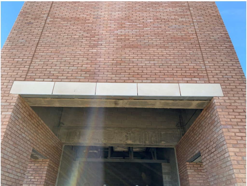
Figure 2 – East Entry