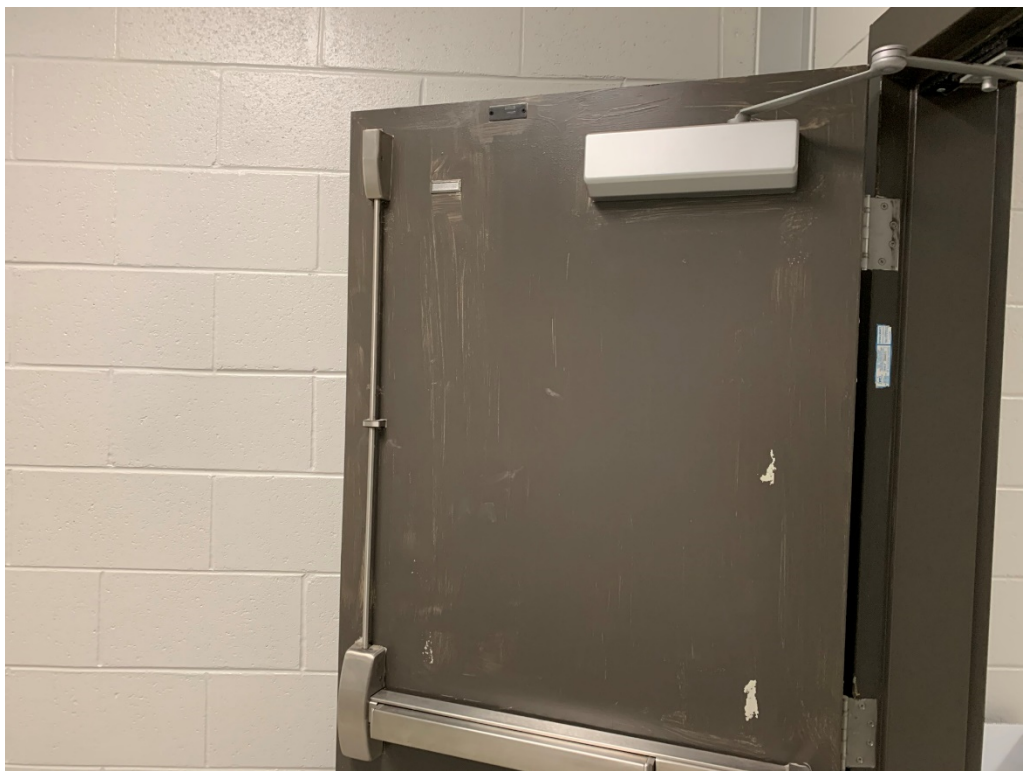
Figure 12 – Interior Hall Paint is Ongoing