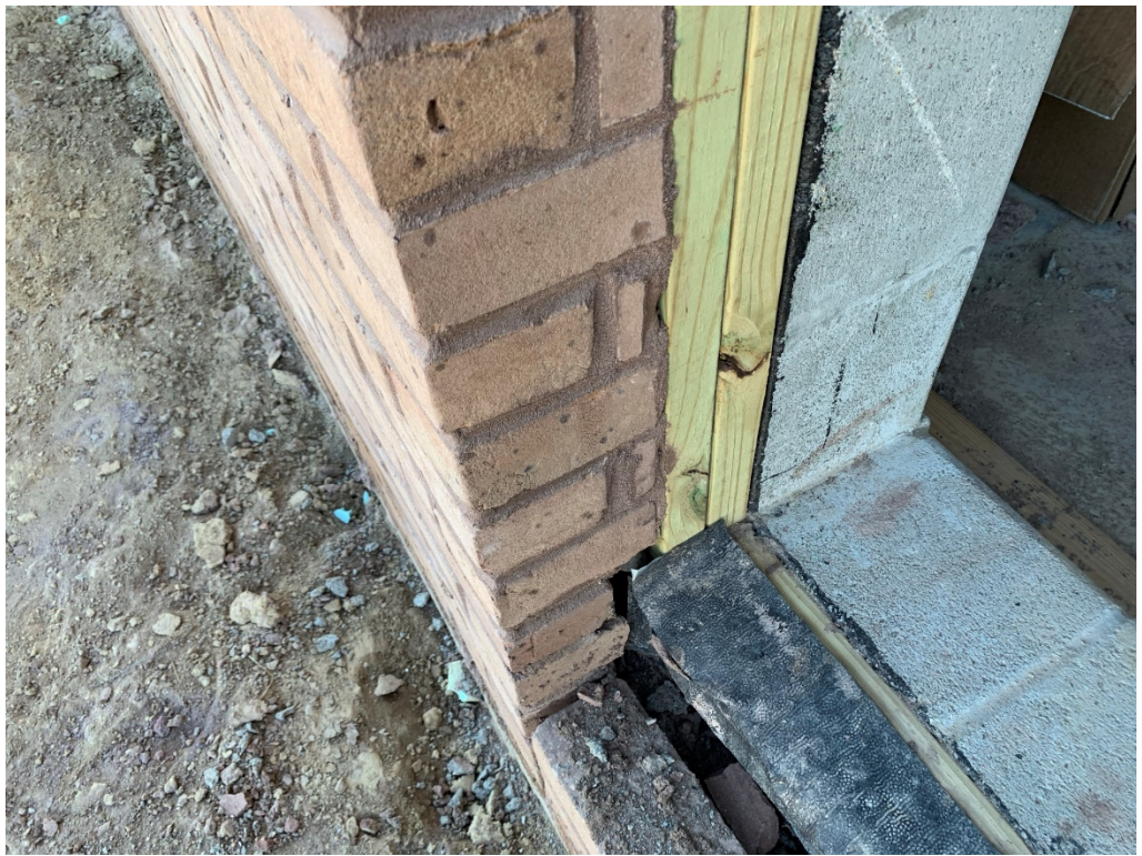
Figure 4 – Typical Window Jamb Detail