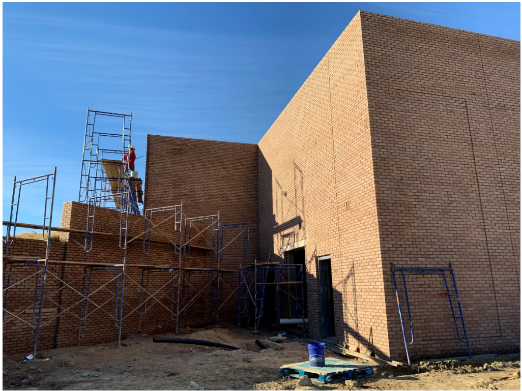
Figure 5 – South Elevation