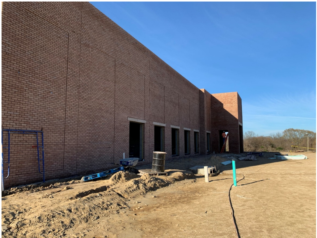
Figure 6 – South Elevation