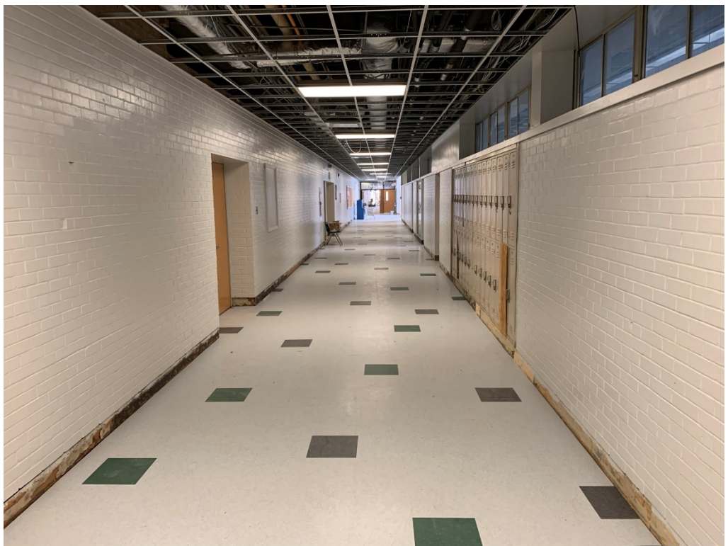
Figure 10 – Interior Hall Paint is Ongoing