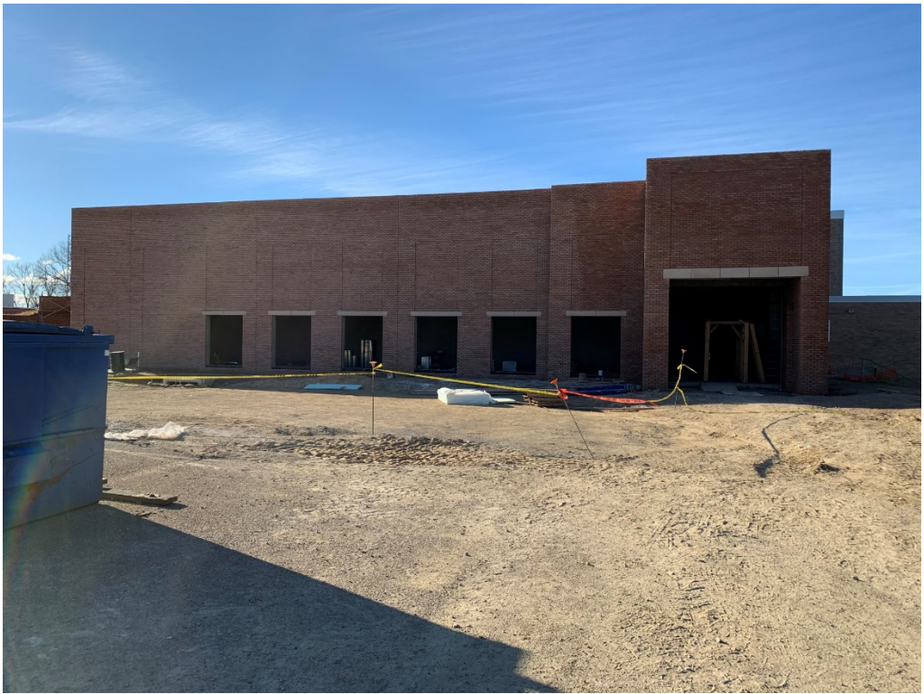
Figure 1 – East Elevation