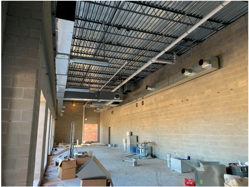
Figure 7 – Interior Admin Area