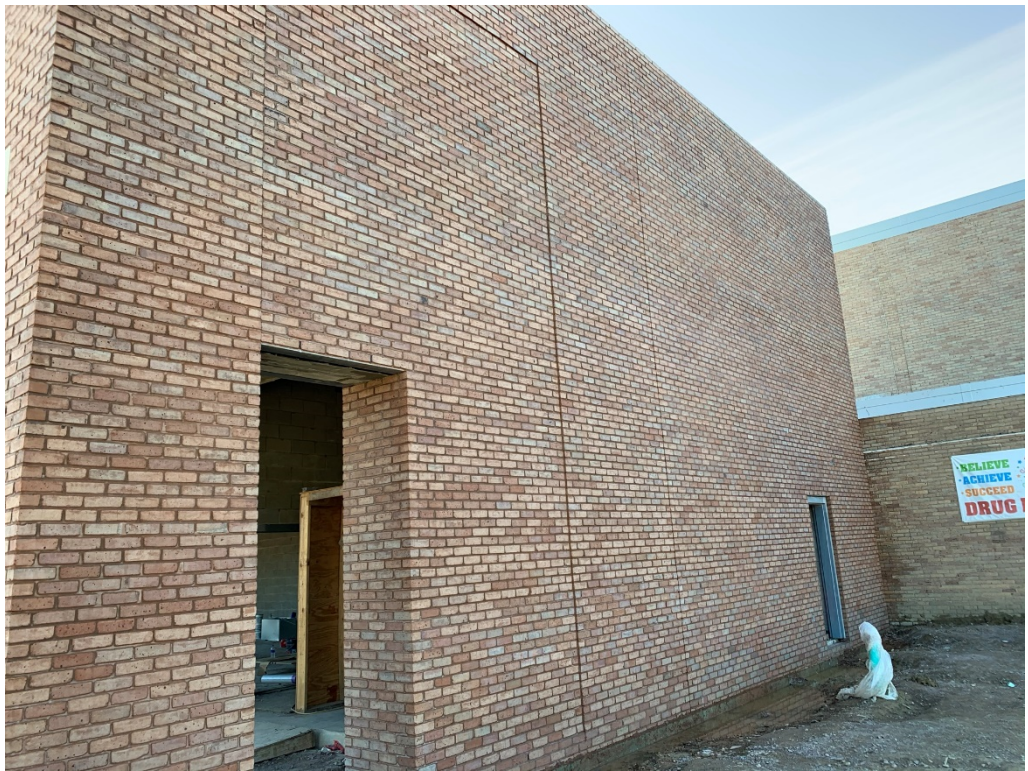
Figure 3 – North Elevation