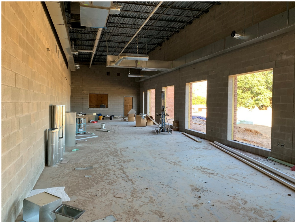
Figure 9 – Interior Admin Area