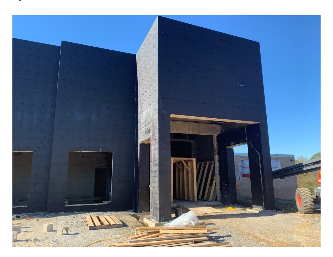
Figure 2 – East Elevation