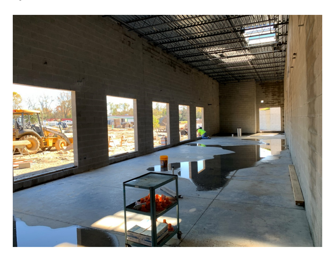
Figure 4 – Interior Admin Area