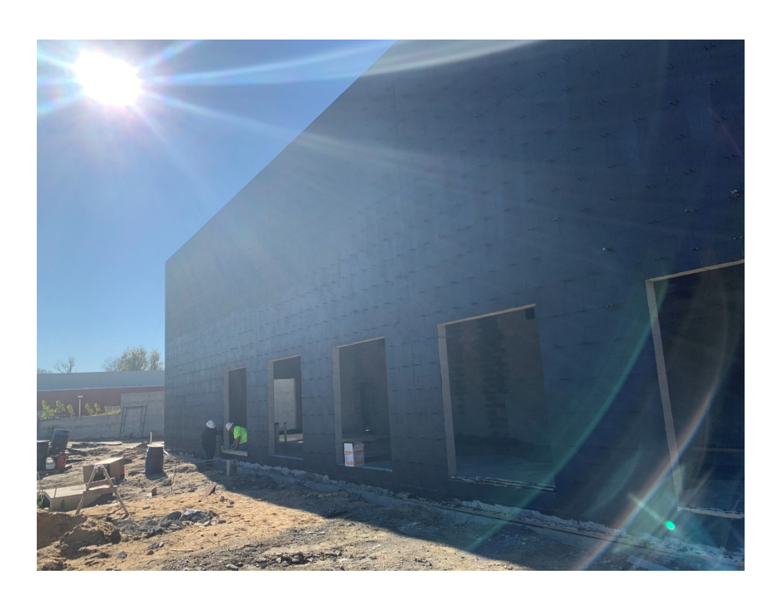
Figure 3 – East Elevation