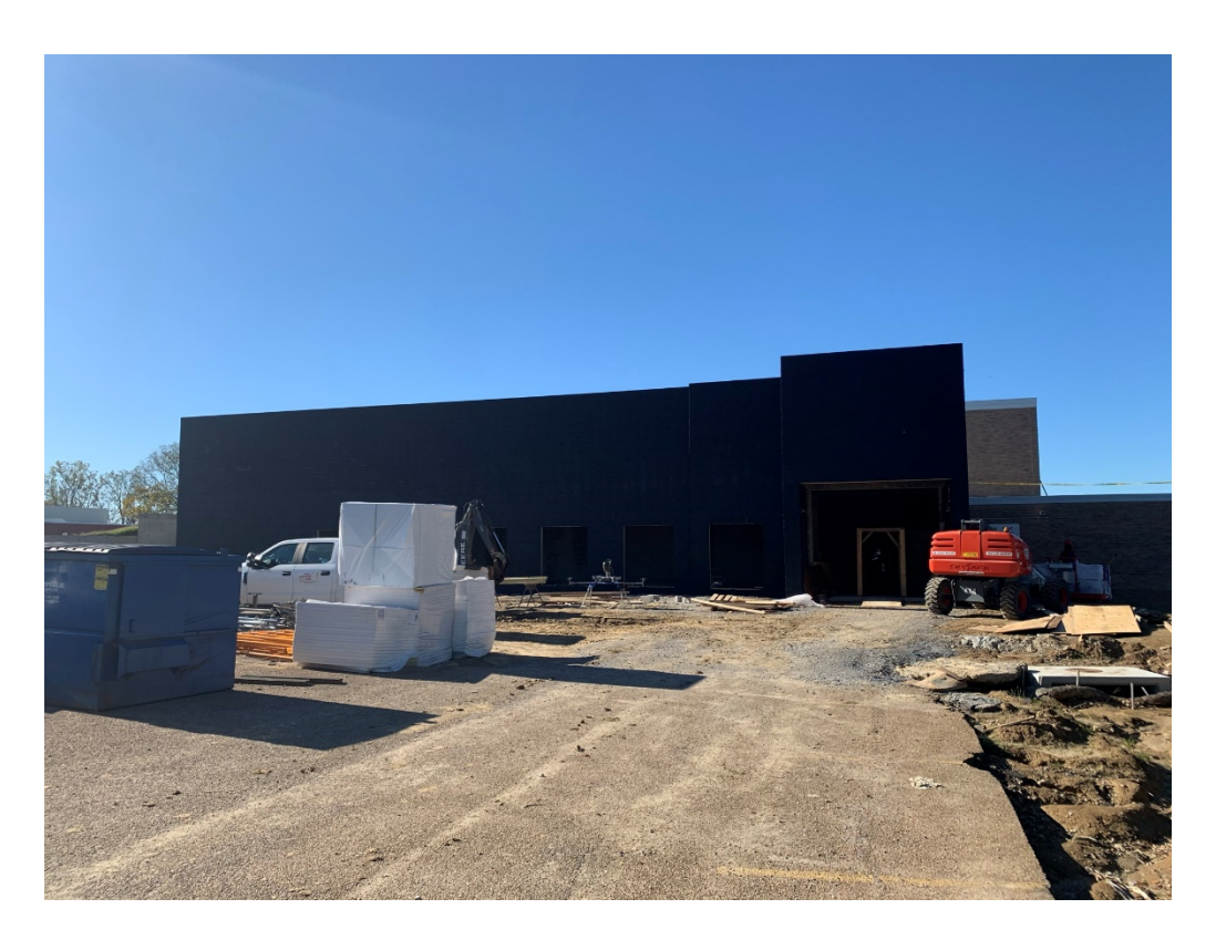
Figure 1 – East Elevation