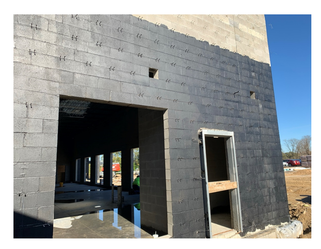
Figure 5 – South Elevation