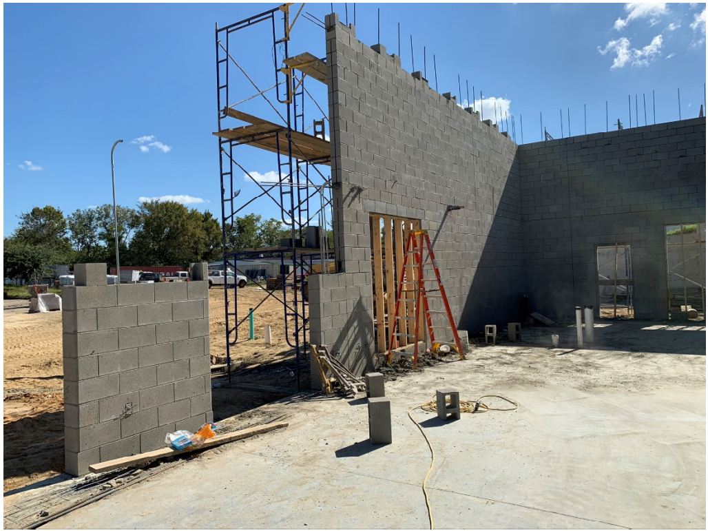
Figure 7 – Block Work Ongoing