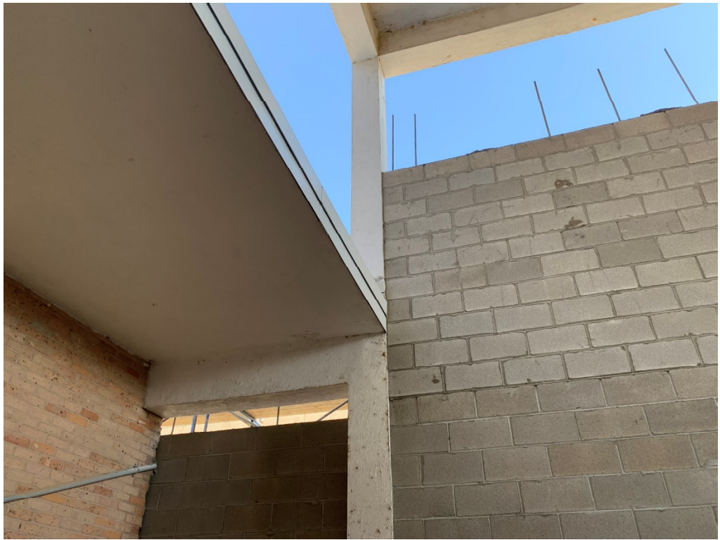
Figure 9 – Block Work Between Columns at Existing Stair