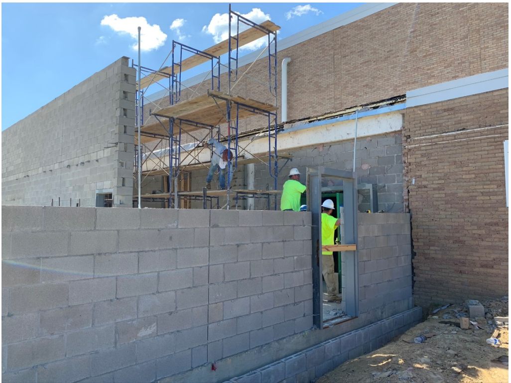
Figure 4 – Block Work Ongoing