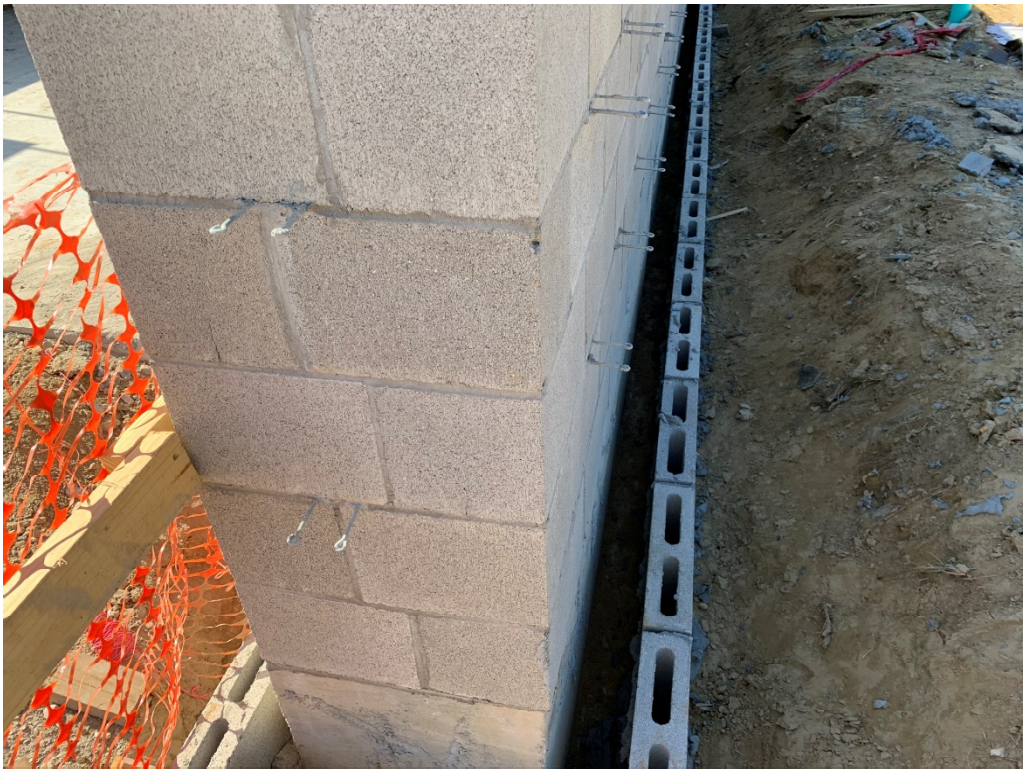
Figure 3 – Block Cavity at Footing