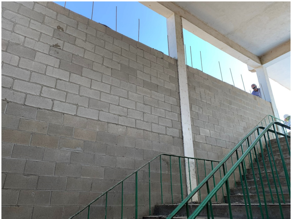
Figure 8 – Block Work Between Columns at Existing Stair