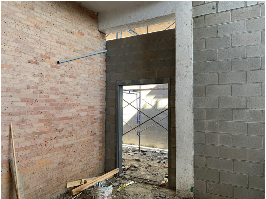
Figure 10 – Block Work Between Columns at Existing Stair