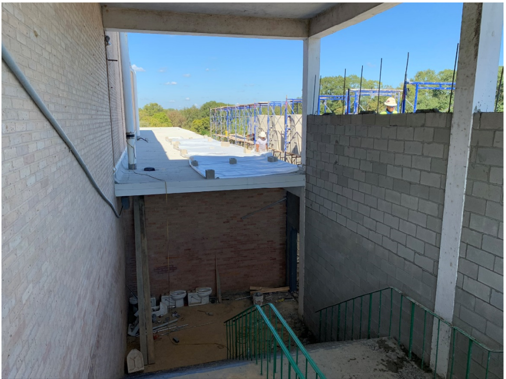
Figure 12 – Block Work at Stair