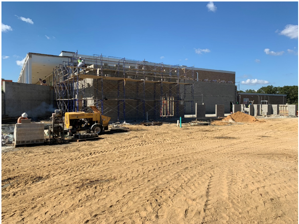
Figure 14 – SE View Looking NW