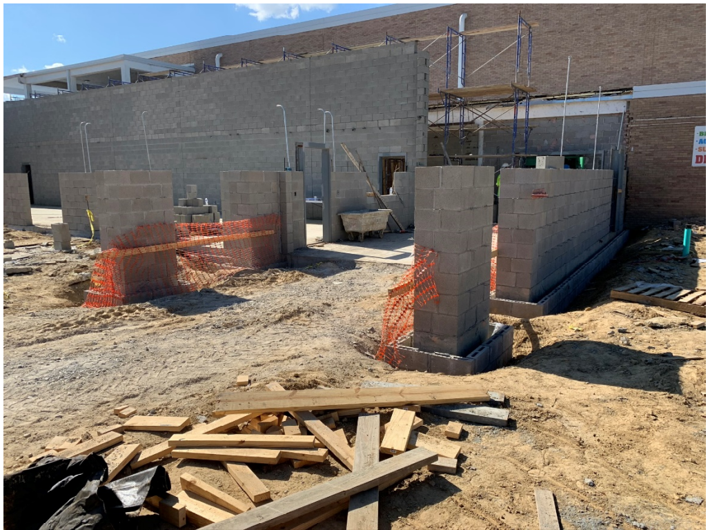
Figure 2 – Block Work at NE Corner