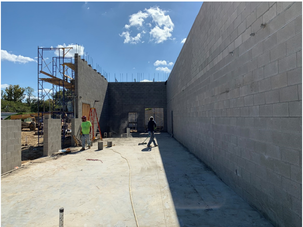
Figure 6 – Block Work Ongoing