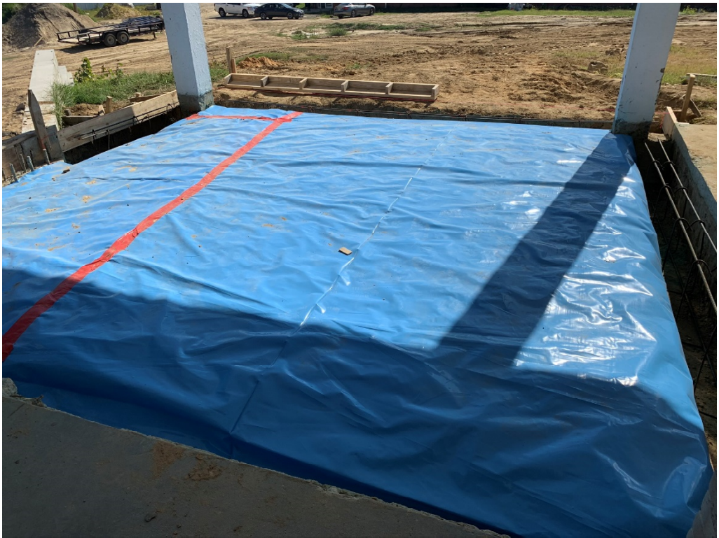
Figure 11 – Slab Prep at Upper Landing of Existing Stair