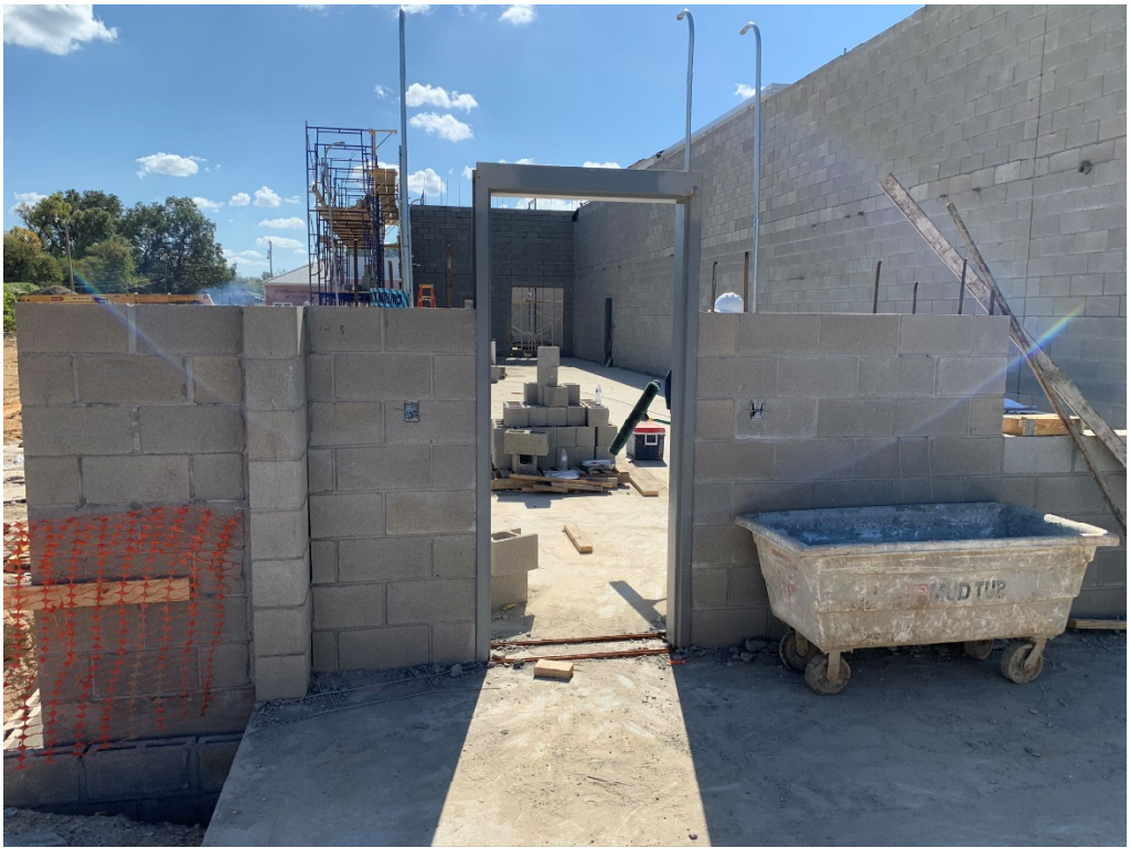
Figure 5 – Block Work Ongoing