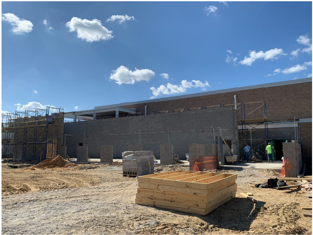
Figure 1 – NE View Looking SW