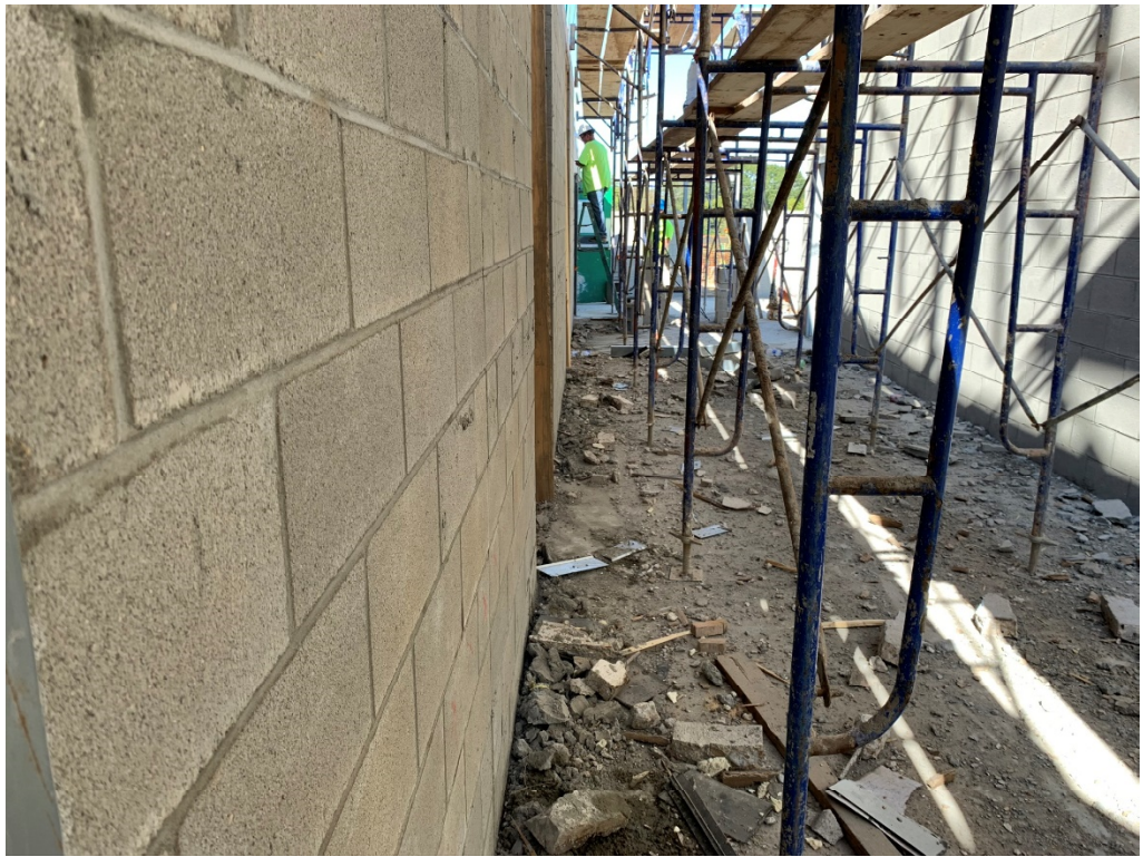
Figure 13 – Scaffold at CMU Work