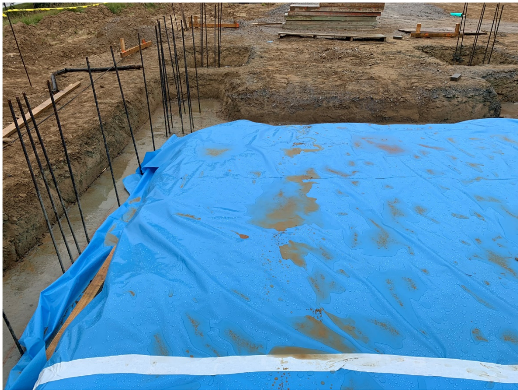
Figure 2 – Preparation for Slab Pour is ongoing