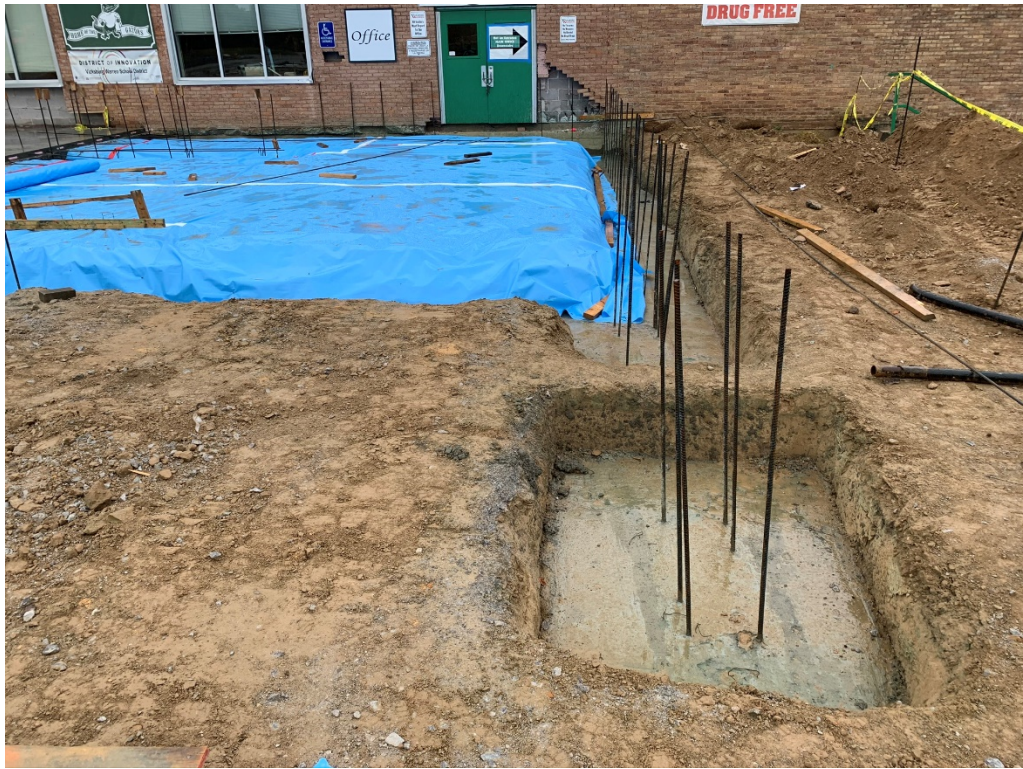
Figure 1 – Concrete Footings Poured at Addition North