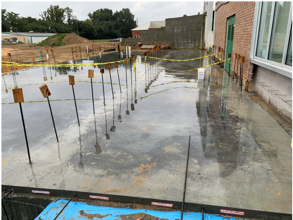
Figure 6 – Connection between first pour and upcoming pour