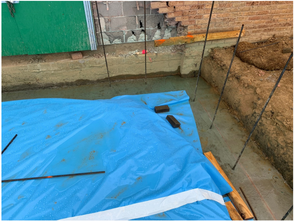
Figure 3 – Preparation for Slab Pour is ongoing