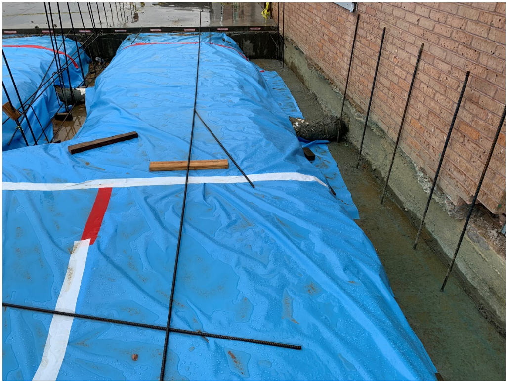
Figure 4 – Preparation for Slab Pour is ongoing