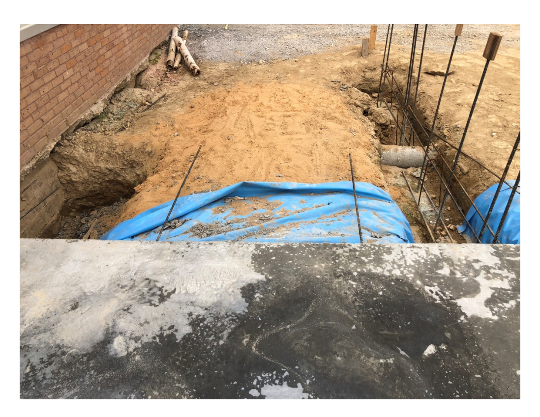
Figure 7 – First Section of Slab Pour