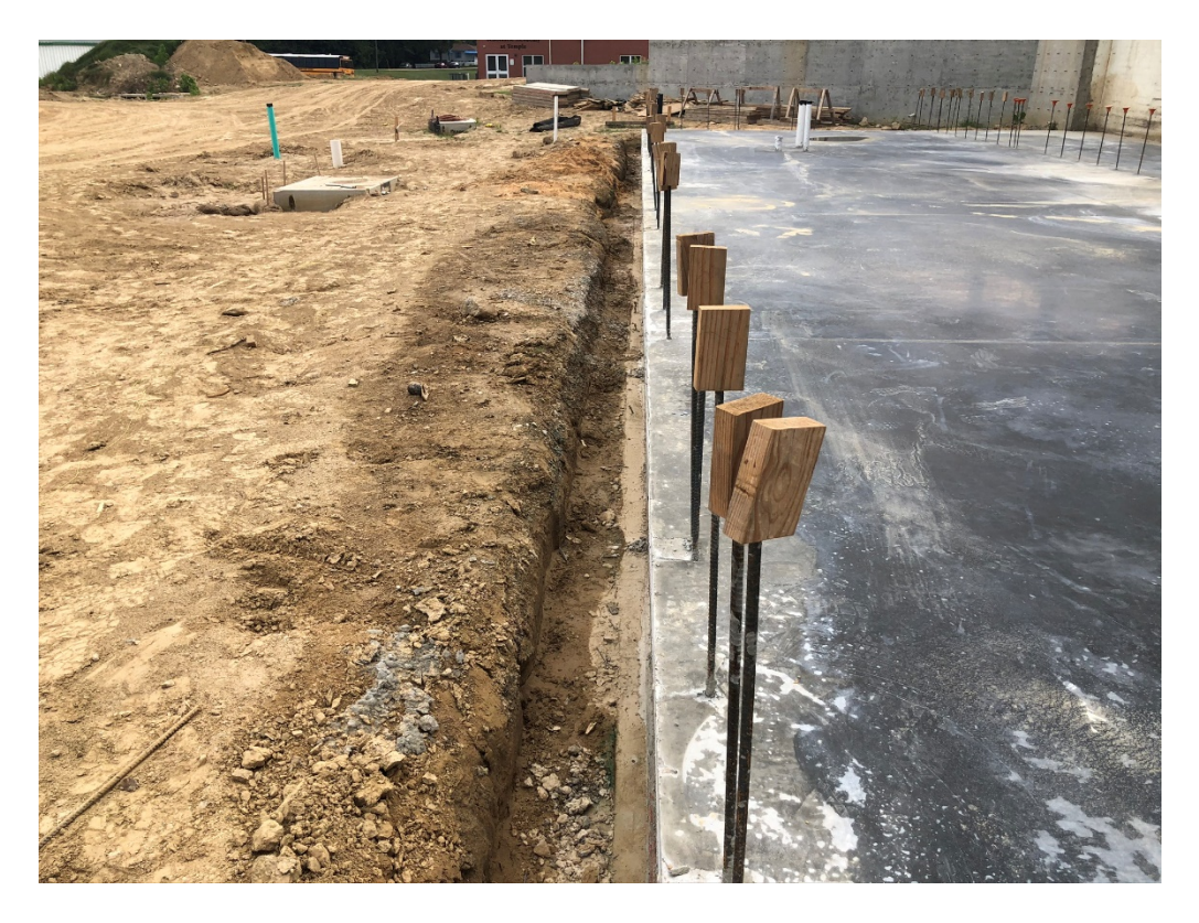
Figure 6 – Concrete Slab Poured