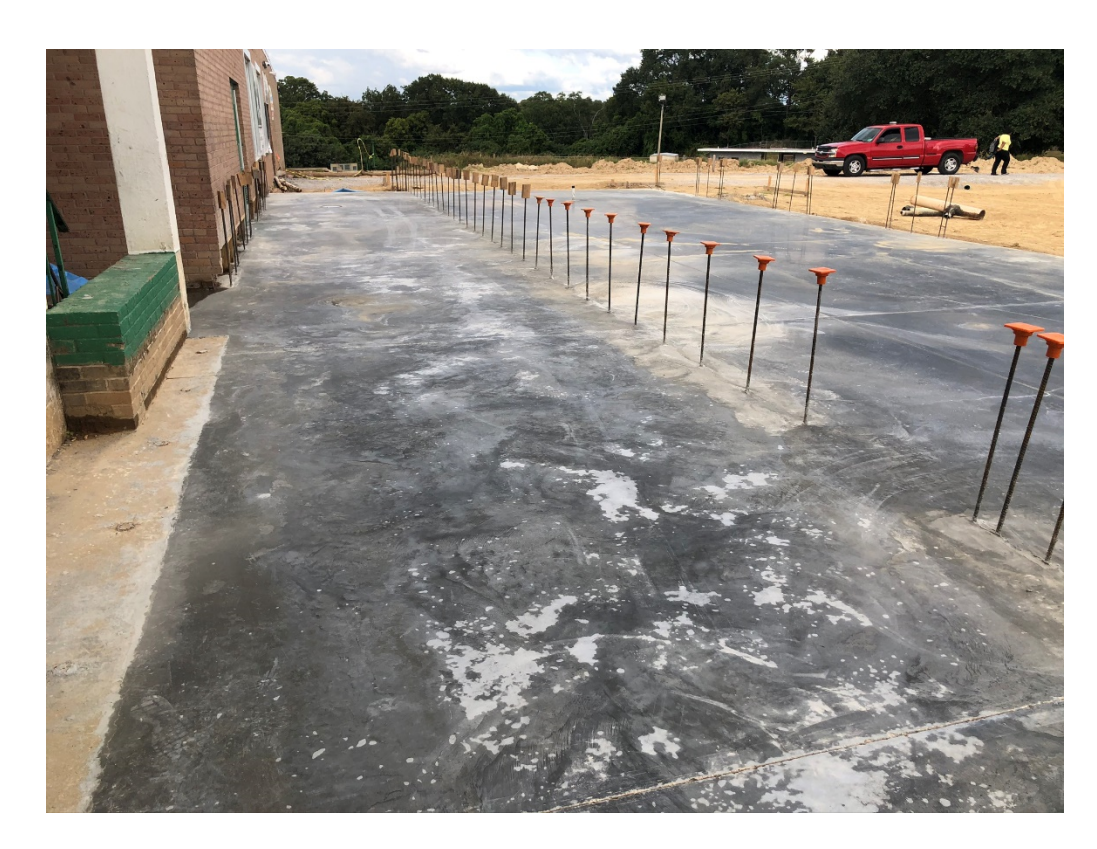
Figure 3 – Concrete Slab Poured