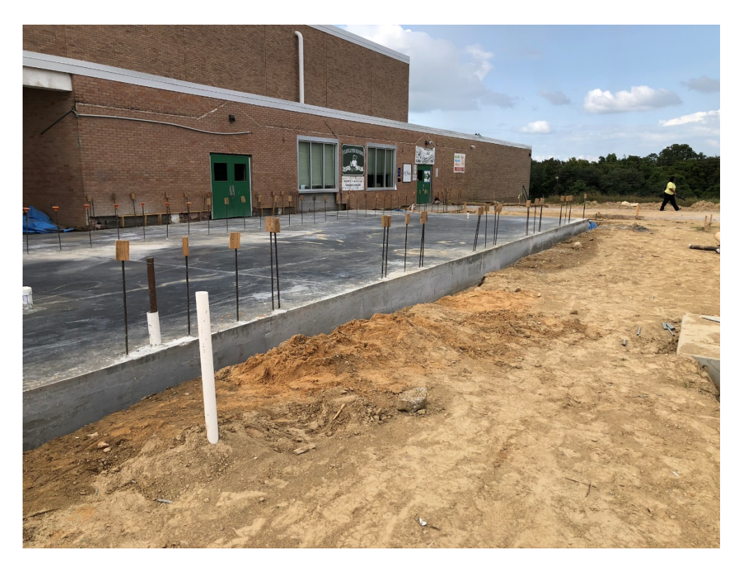
Figure 2 – Concrete Slab Poured