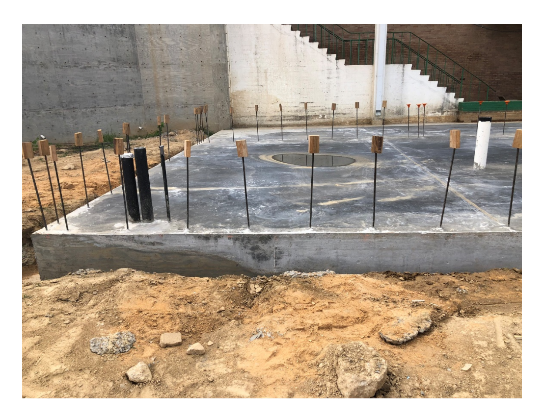
Figure 1 – Concrete Slab Poured