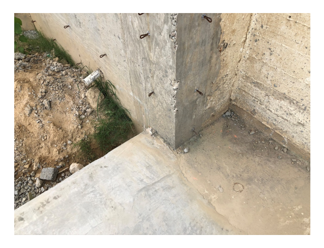
Figure 4 – Footing Install Ongoing