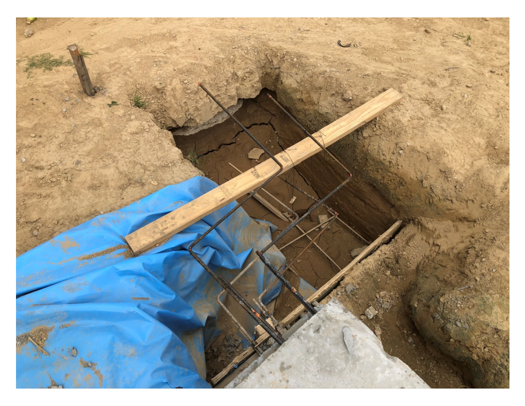
Figure 8 – Slab to be Continued