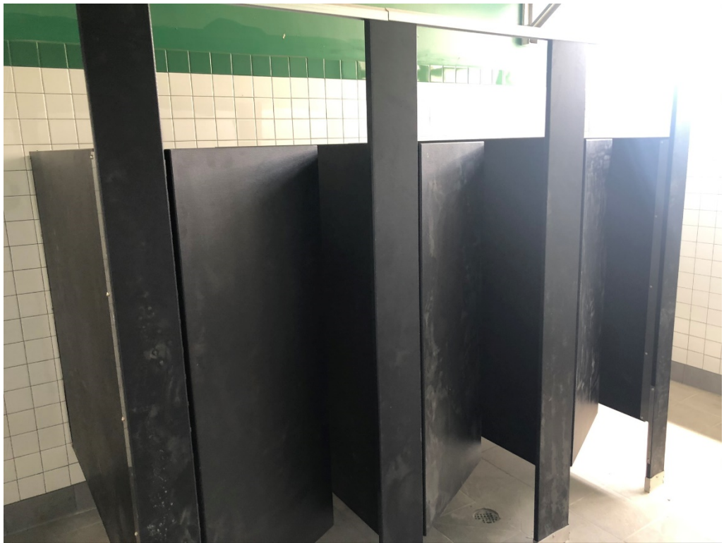
Figure 6 – Toilet Partitions Installed