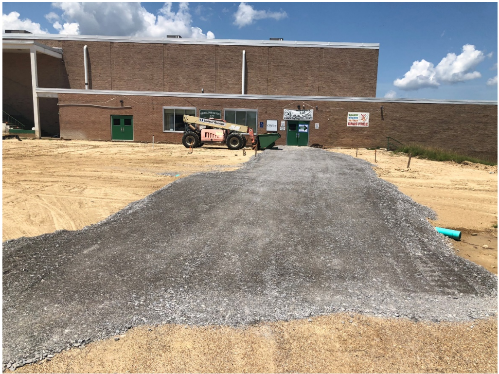
Figure 1 – Entry Condition at Addition Dirt Work