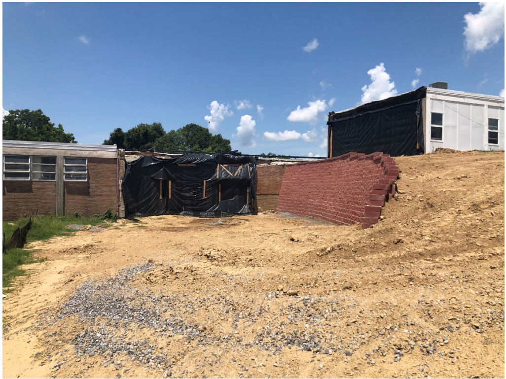
Figure 7 – Installed Retaining Wall