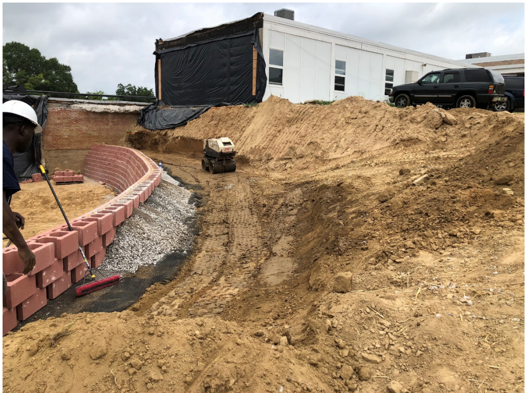
Figure 8 – Image from Site Visit 7/30 on Wall Progress