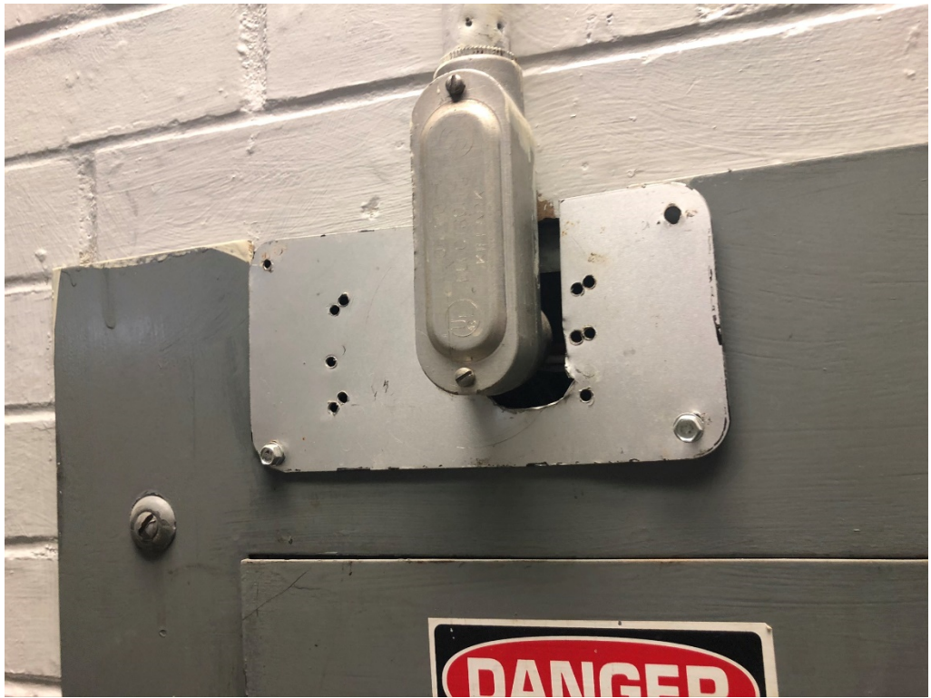
Figure 5 – Could this be addressed prior to Closing in Exterior?