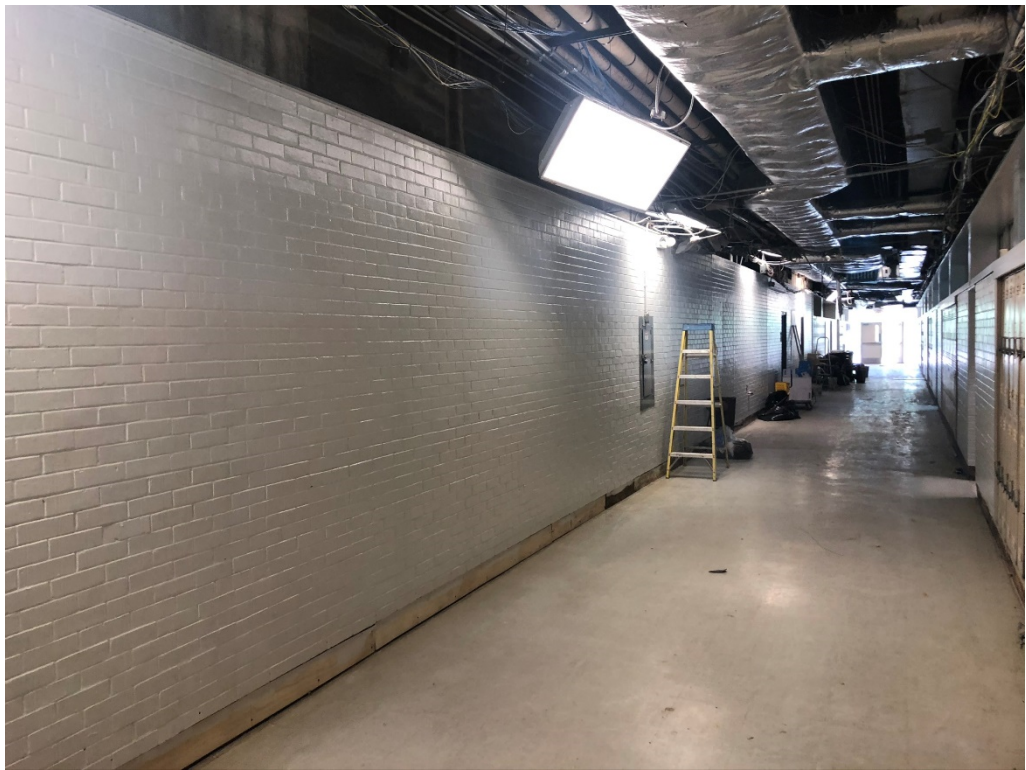
Figure 4 – Interior Brick Wall Painted