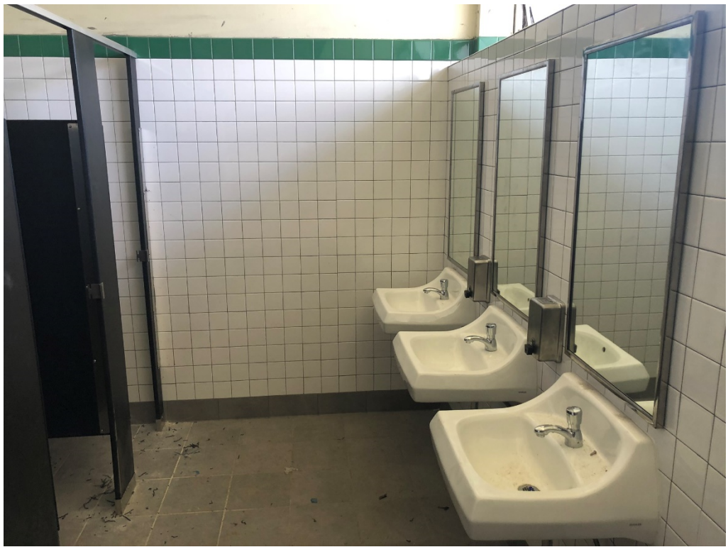
Figure 3 – Bathrooms Fixtures and Partitions Installed @ E-217B