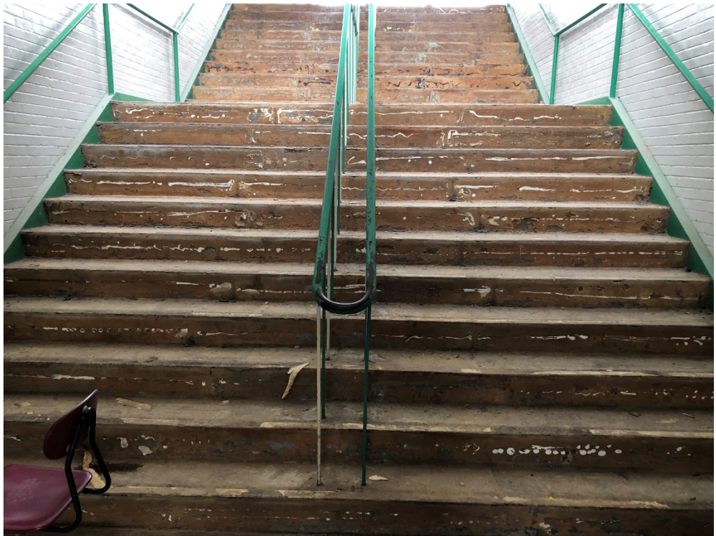
Figure 4 – Stair Demo of Finishes