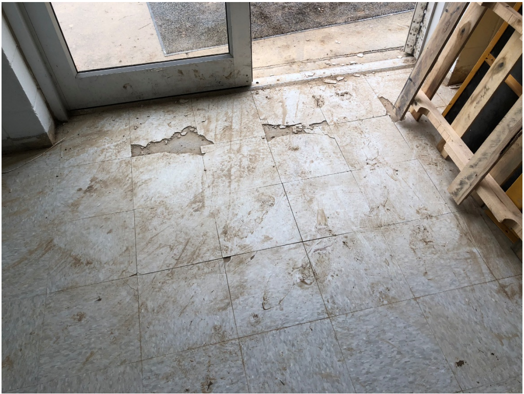
Figure 1 – Entry @ SE Corridor E-140