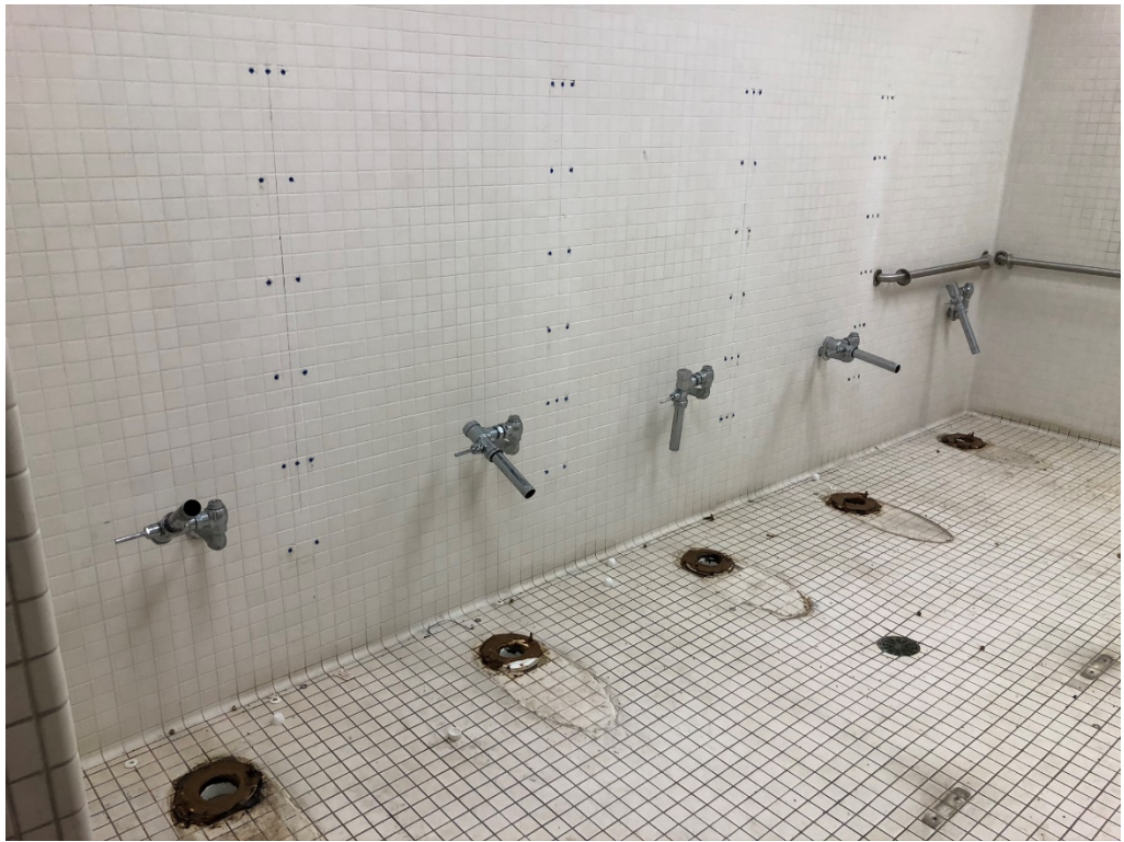
Figure 11 – Fixture Demo @ Lower Level Bathrooms