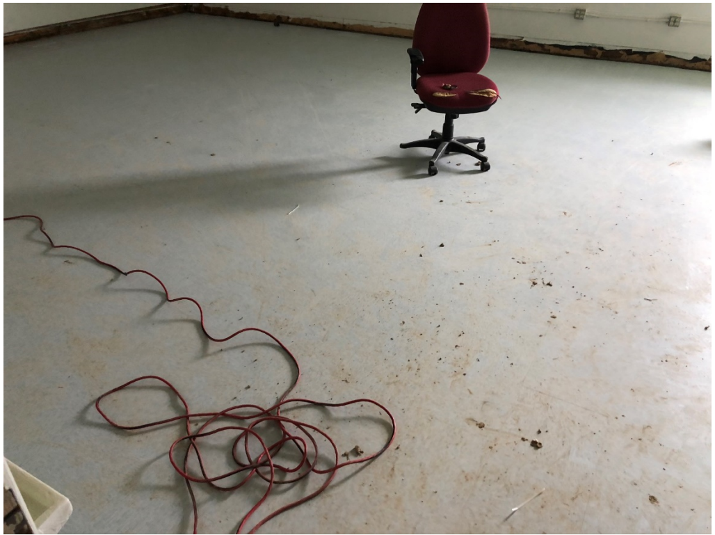
Figure 3 – New Unwaxed Floor