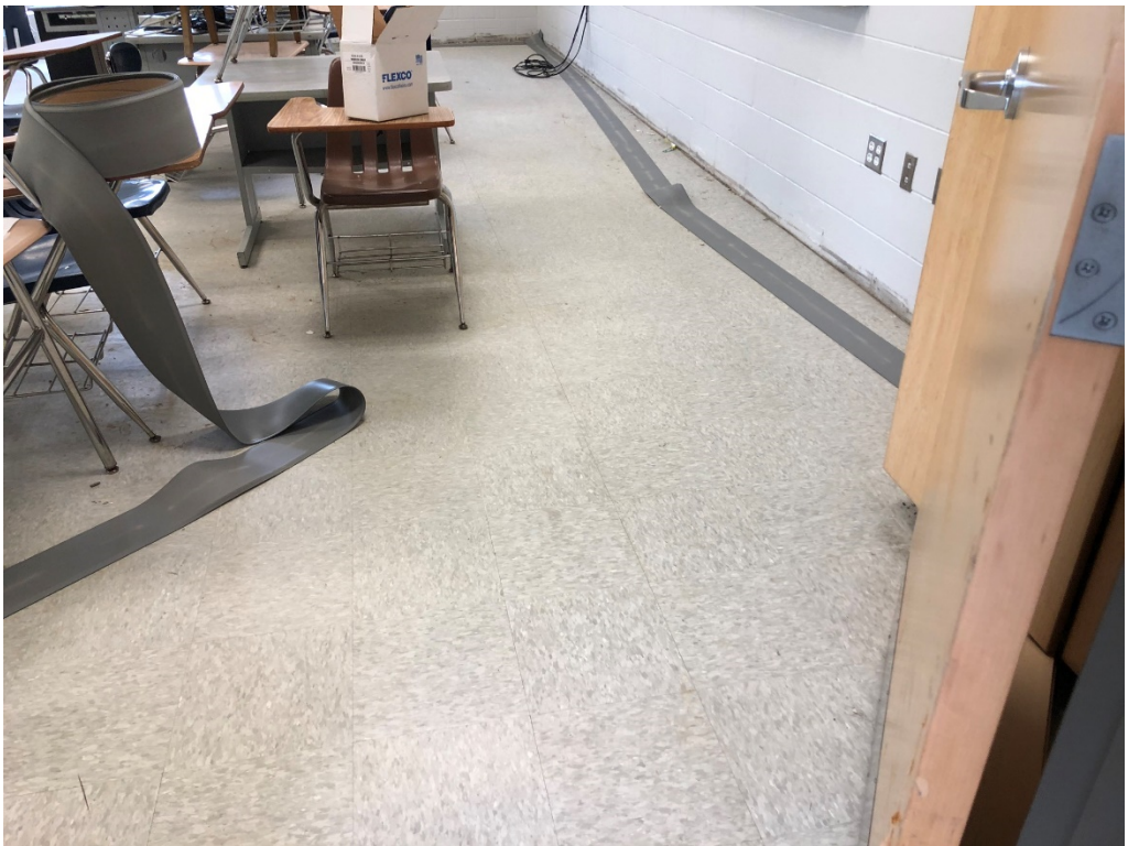
Figure 2 – Base Installation is Ongoing In south Hallway