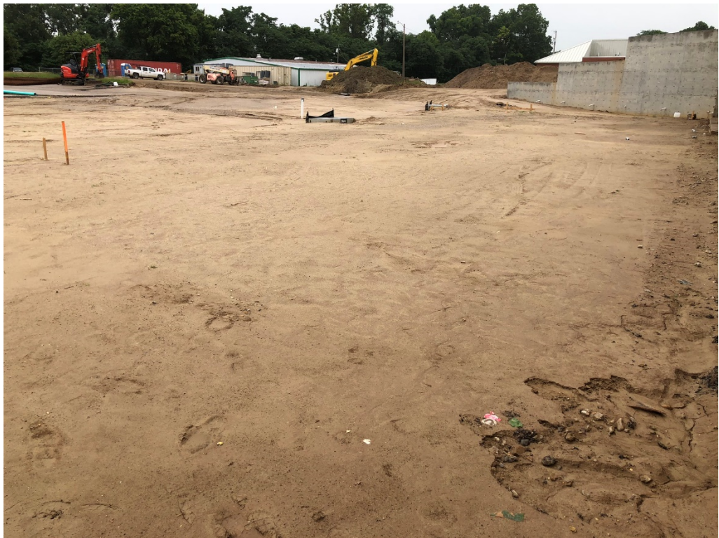
Figure 12 – Building Pad for Addition