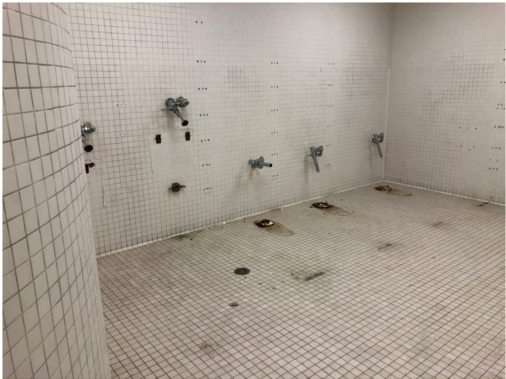
Figure 8 – Fixture Demo @ Lower Level Bathrooms