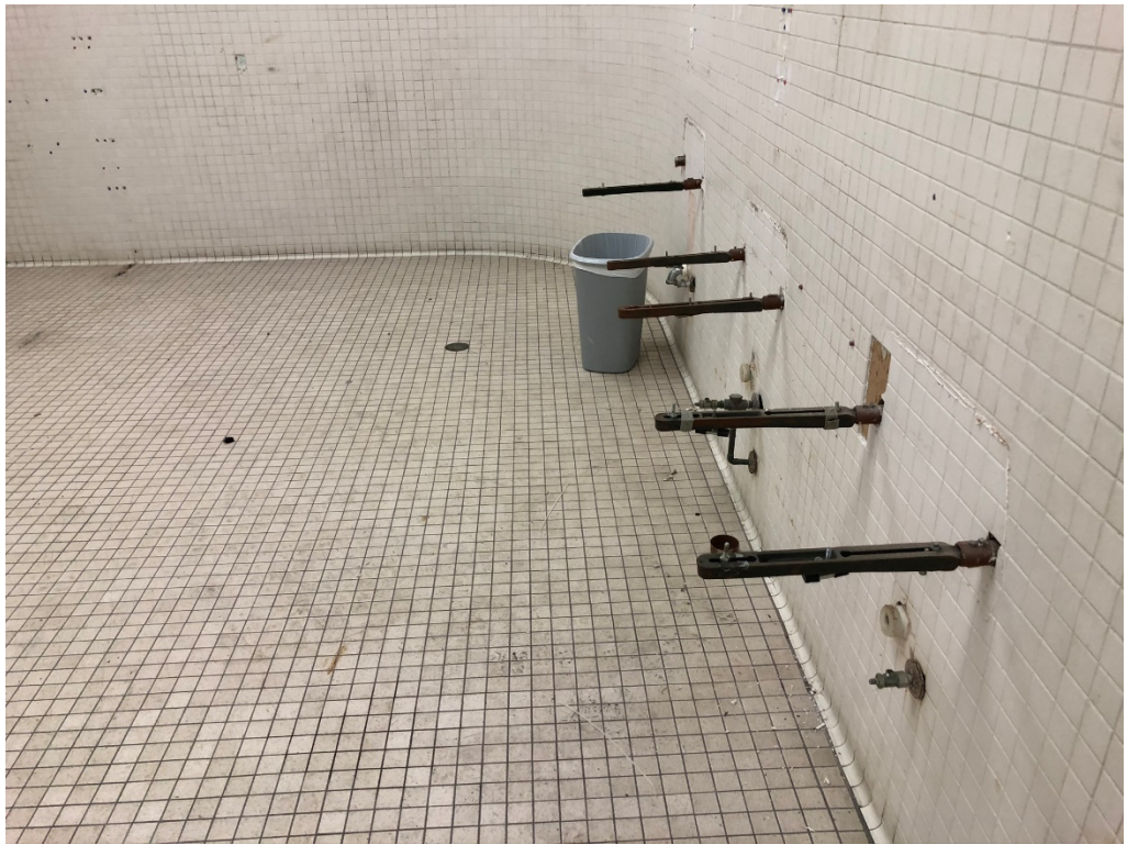
Figure 9 – Fixture Demo @ Lower Level Bathrooms