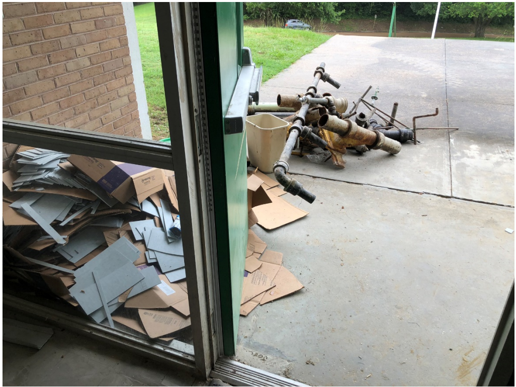
Figure 5 – Storage of Trash @ West Entry