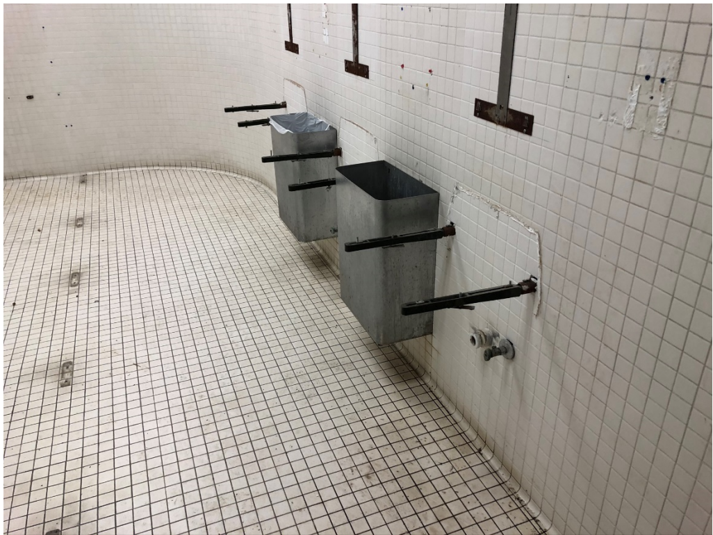
Figure 10 – Fixture Demo @ Lower Level Bathrooms