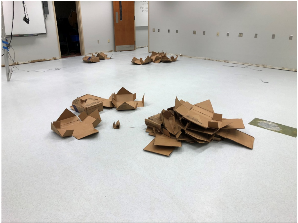
Figure 7 – Floor Prep and Install in ongoing @ the Lower Level Hall