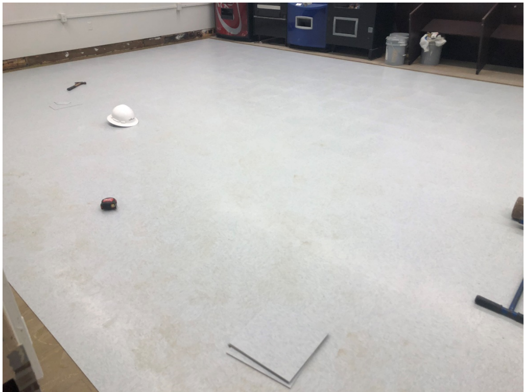
Figure 12 – Flooring at the East Hall