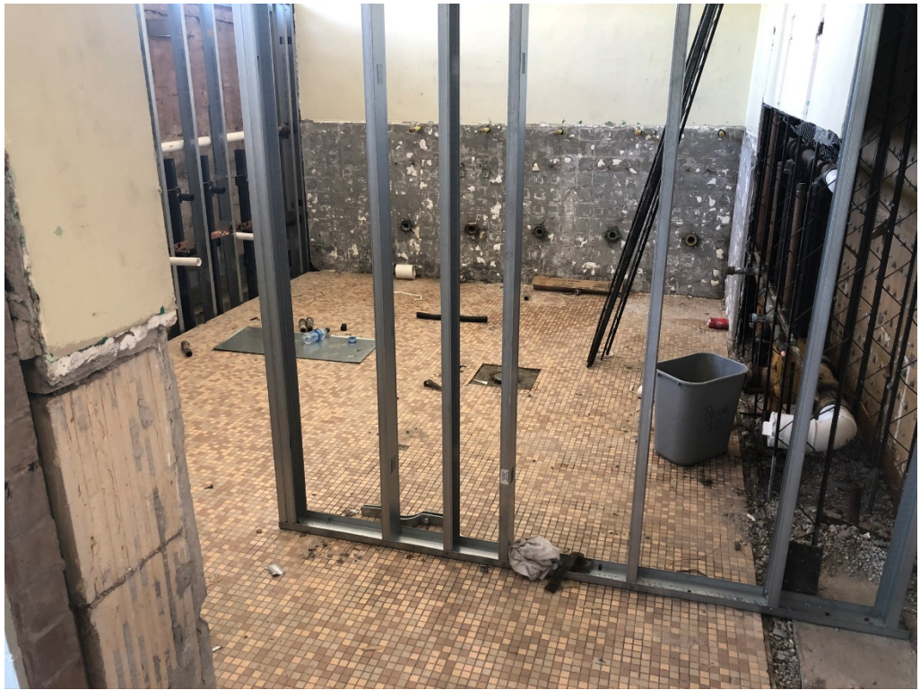
Figure 7 – East Bathrooms