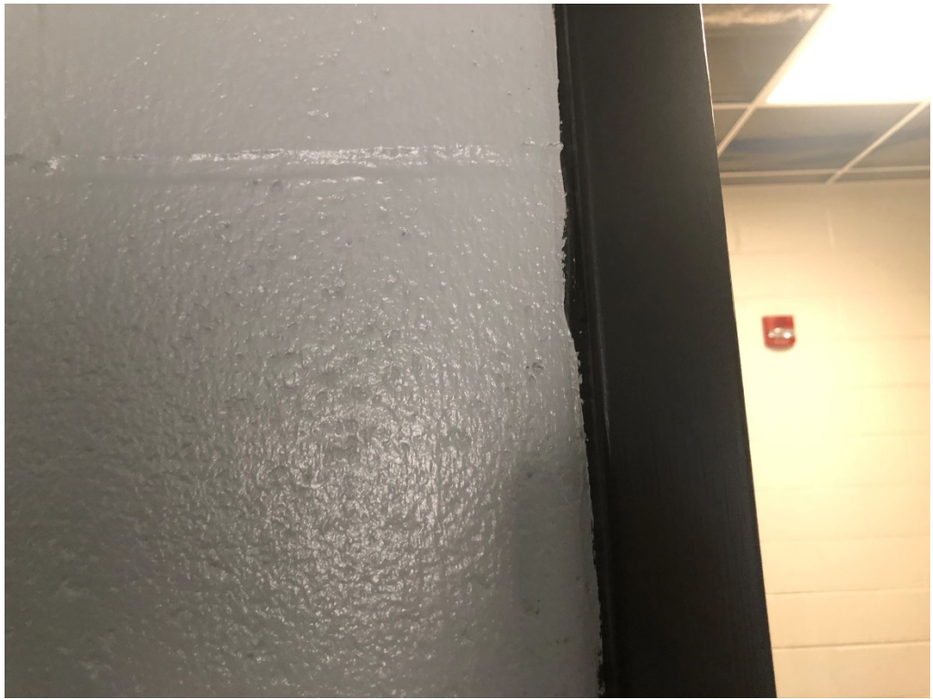
Figure 15 – Retaining Wall