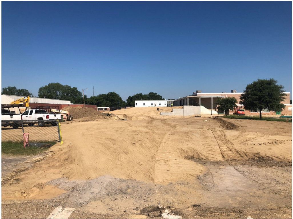
Figure 1 – Site Work is Ongoing