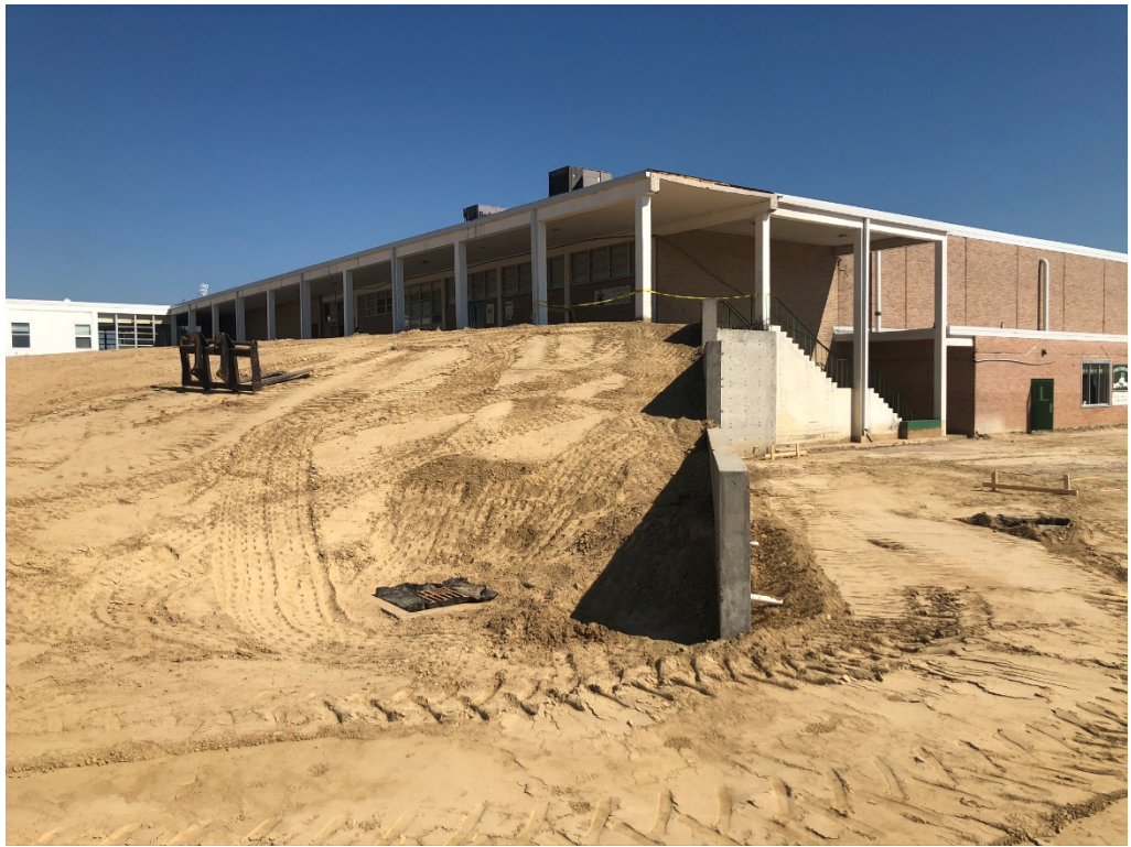
Figure 3 – Backfill Completed at Retaining Wall