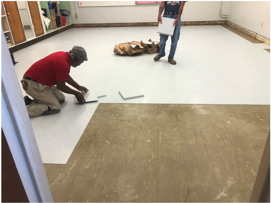
Figure 5 – Flooring at the East Hall