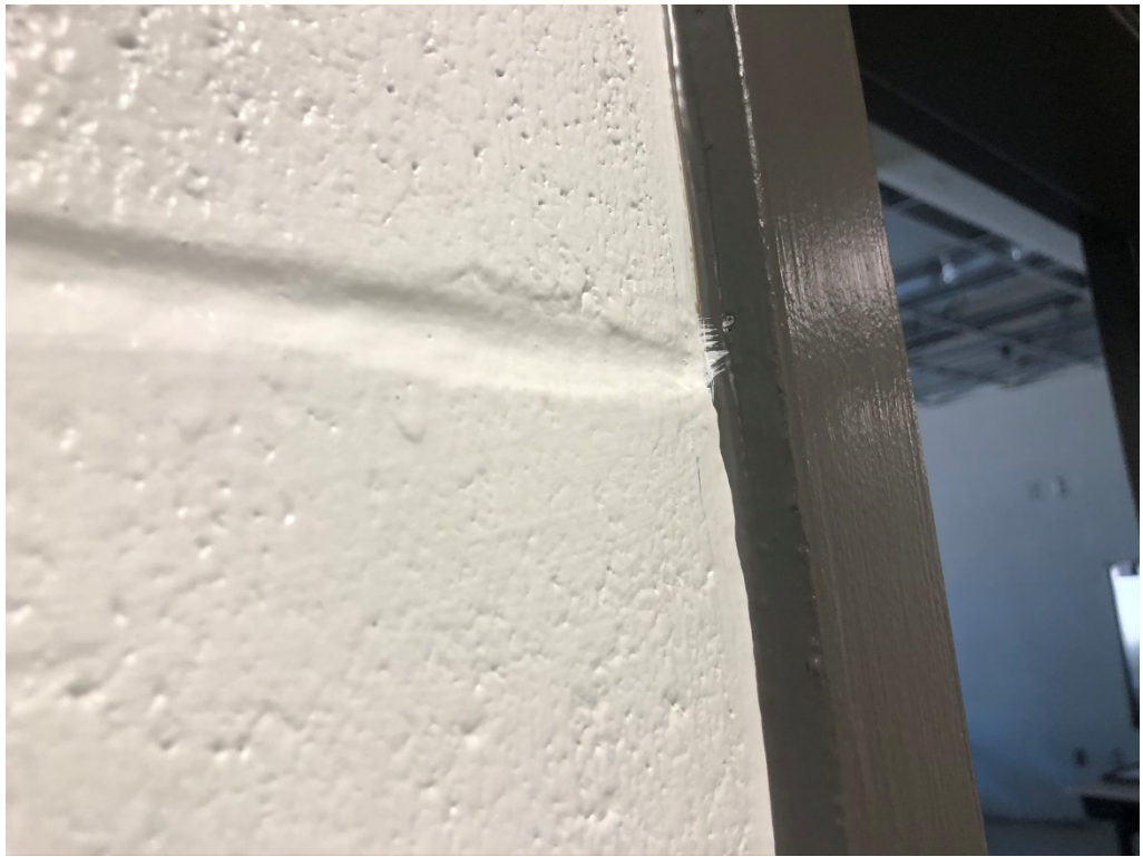
Figure 13 – South Hall Door Jambs Need Touch Up