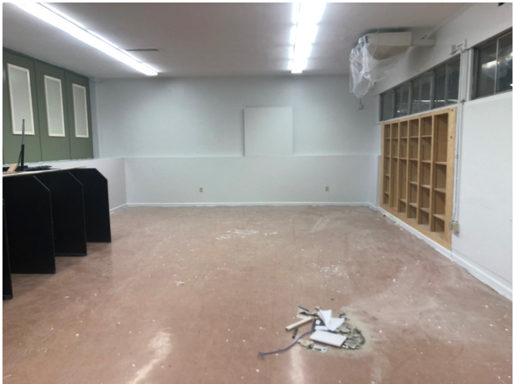
Figure 4 – Paint work in the East Hall Classrooms