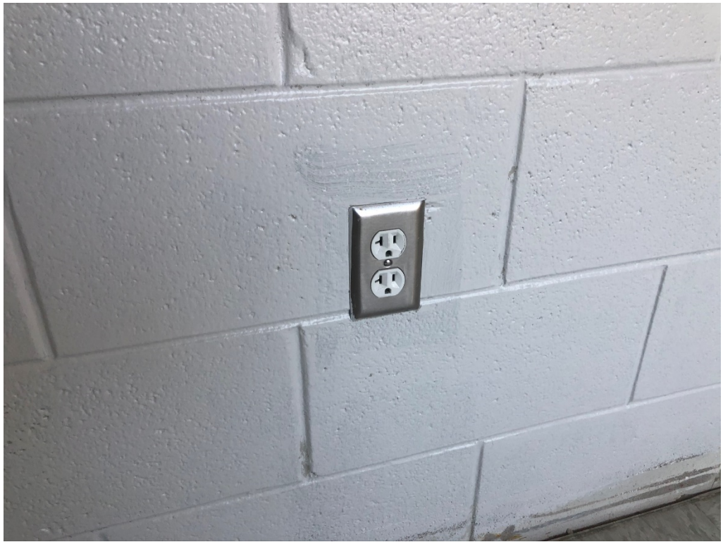
Figure 19 – Incomplete Coverage in many places