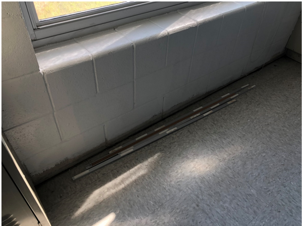
Figure 20 – Pour Coverage Below Windows