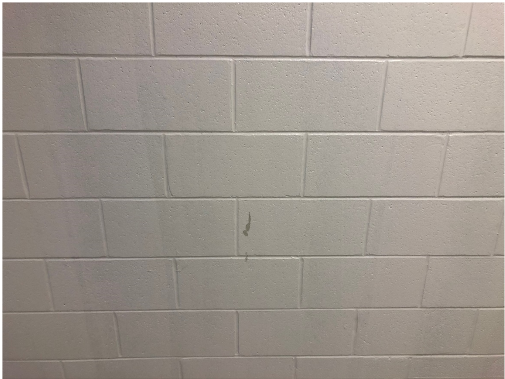
Figure 16 – Non-Matching Colors at Many Wall Surfaces