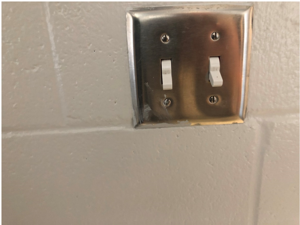
Figure 14 – Paint on Light Switch Covers (typical)