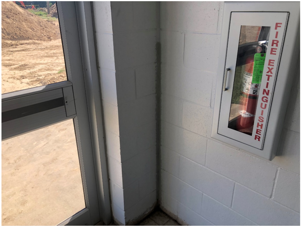
Figure 21 – Pour Coverage