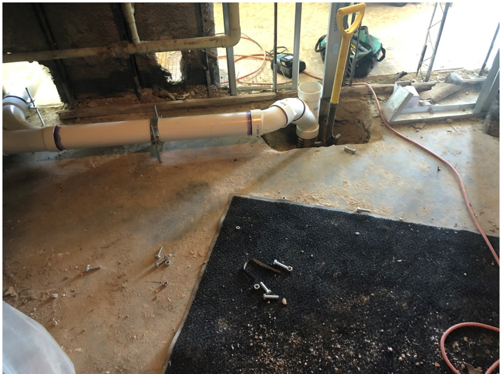
Figure 10 – Plumbing in MECH 215-B