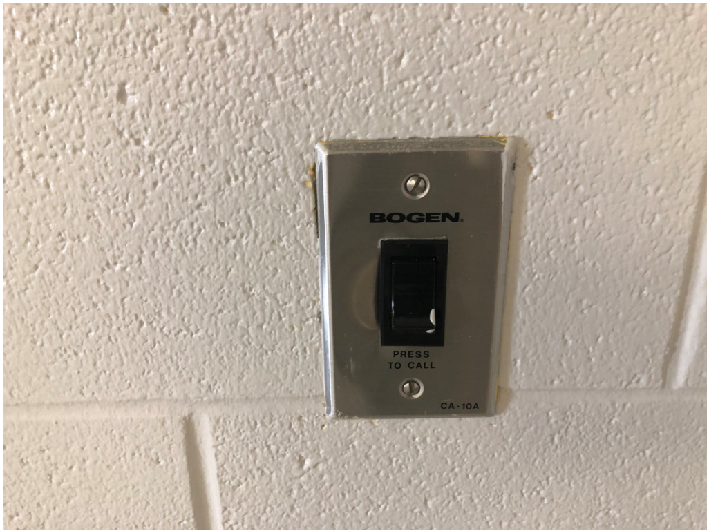
Figure 17 – Paint on Light Switch Covers (typical)