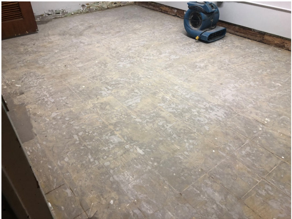
Figure 6 – Flooring Prep after Paint