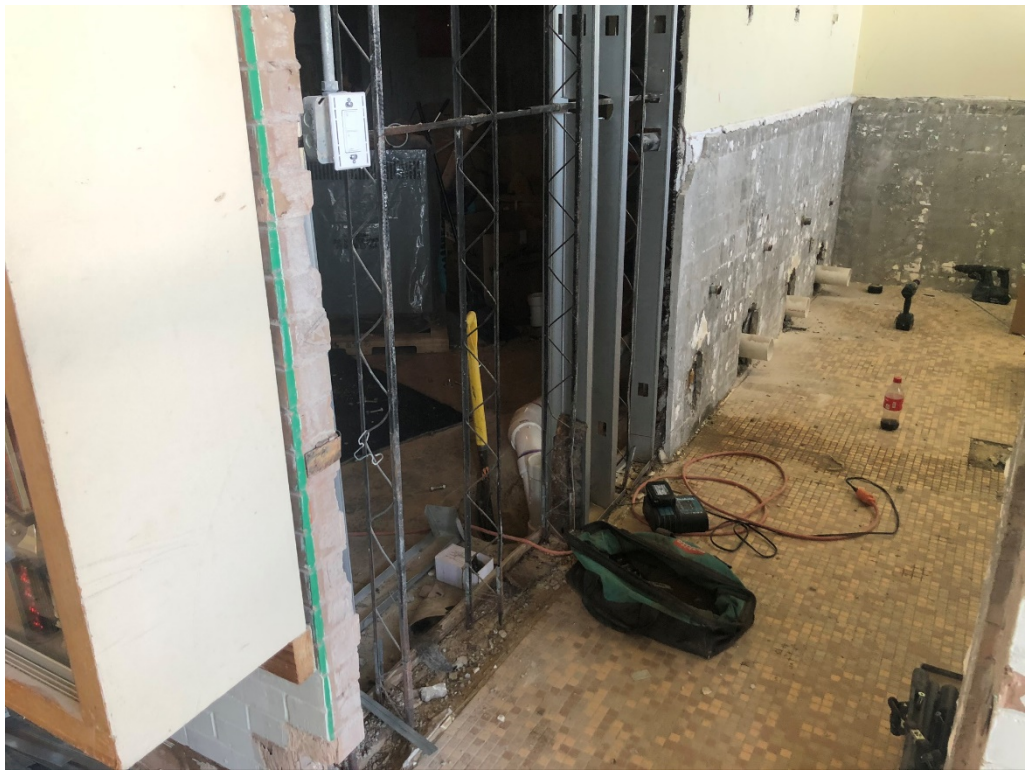
Figure 8 – East Bathrooms