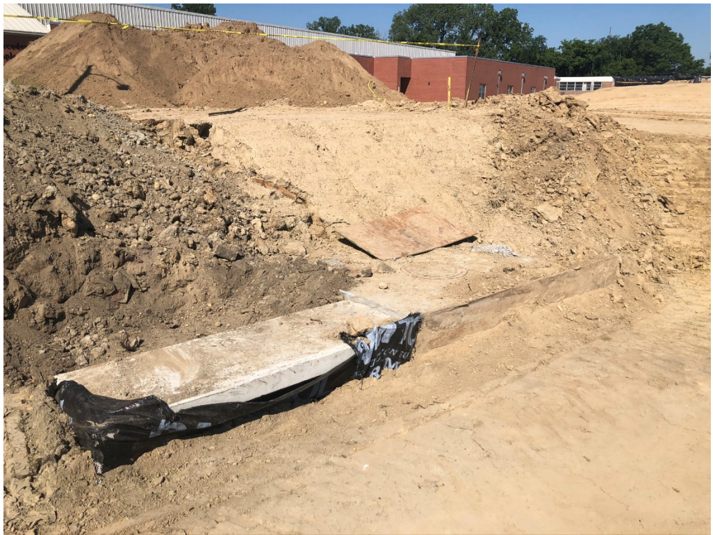
Figure 2 – Storm Sewer Installed