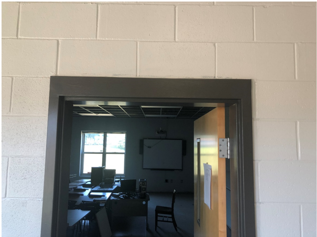
Figure 22 – Pour Coverage Above Door