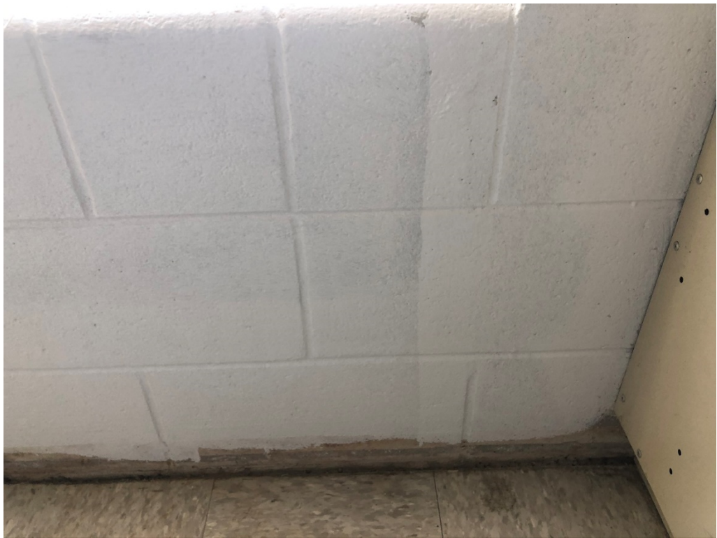
Figure 18 – Pour Coverage Below Windows