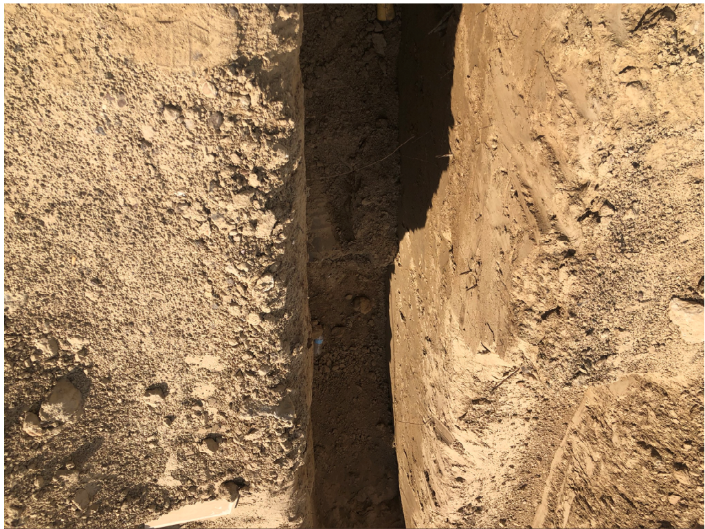
Figure 6 – Exploratory Excavation