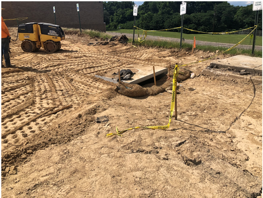
Figure 2 – Compacted Dirt Work