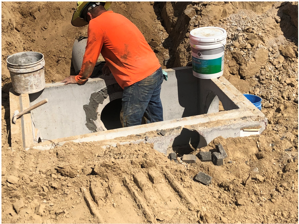
Figure 3 – Concrete Pipe Fitting