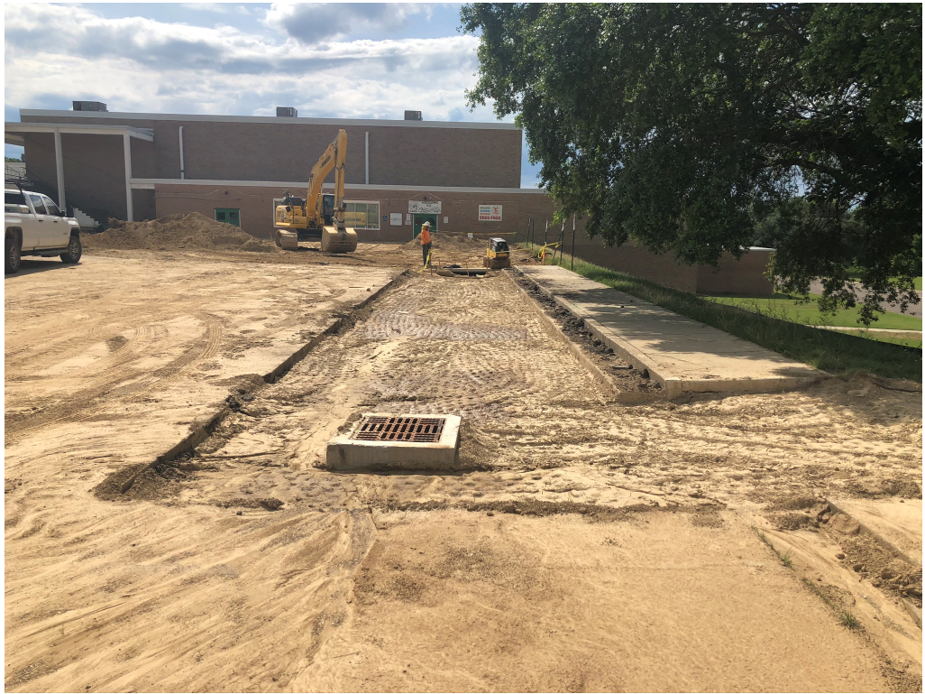
Figure 1 – Compacted Dirt Work