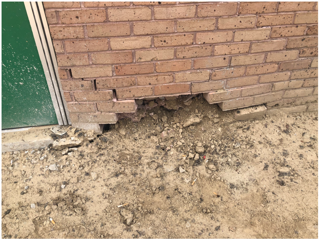
Figure 5 – Some Damage Noted to Brick Work to Left of Entry