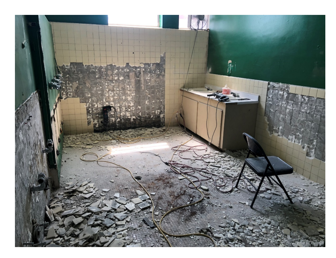
Figure 7 – Demo @ 226B