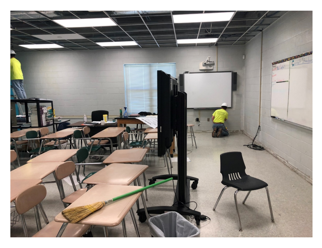
Figure 4 – Paint @ Southern Wing