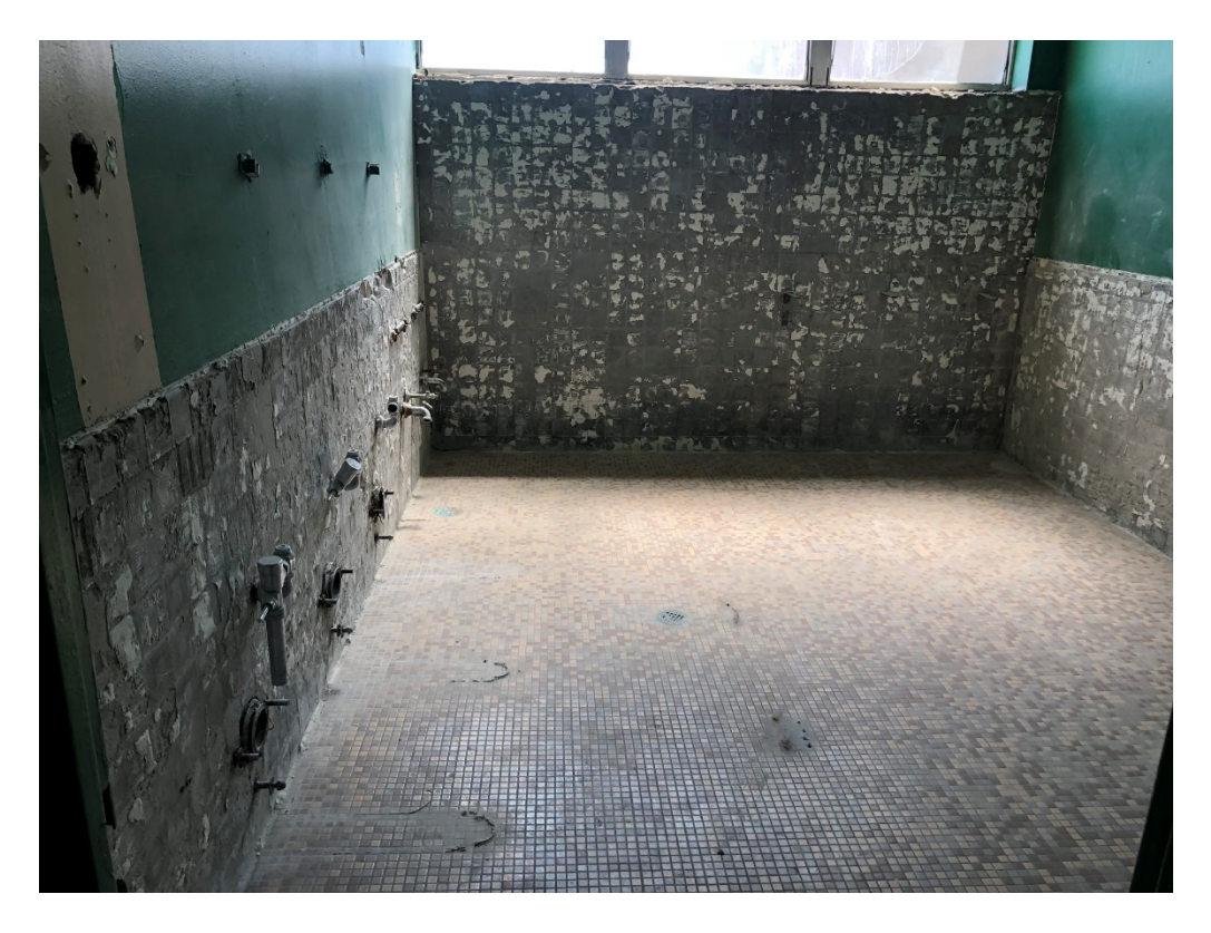
Figure 6 – Demo @ 226C