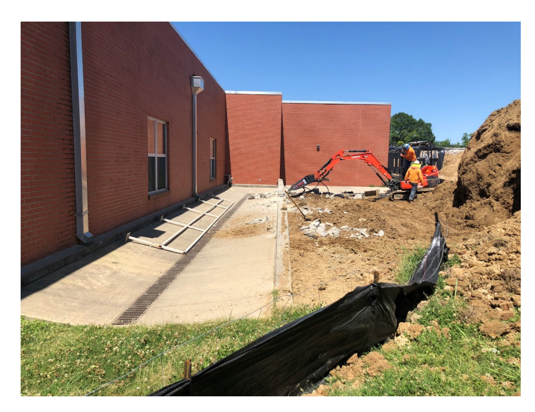
Figure 3 – Demo on Concrete Wall