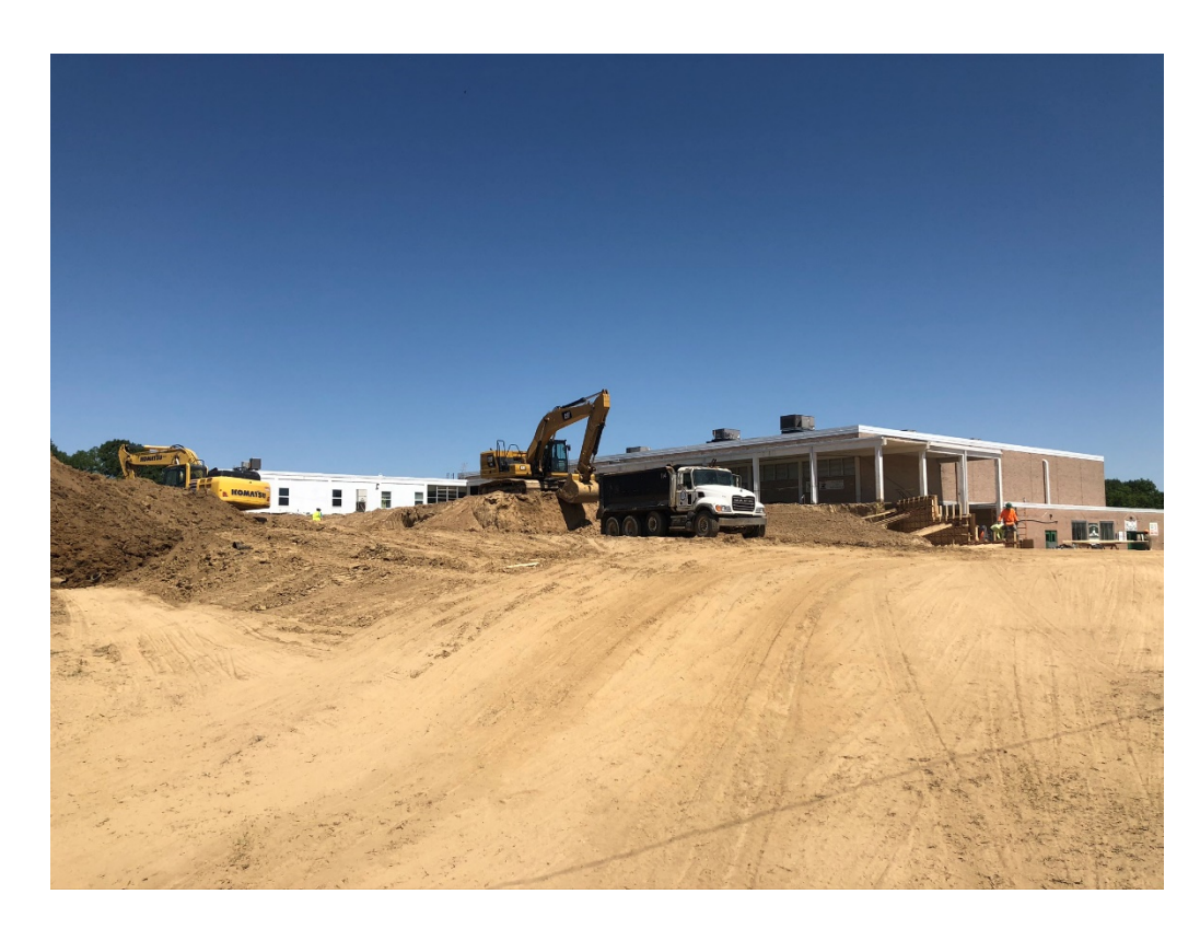
Figure 1 – Continued Dirt Work