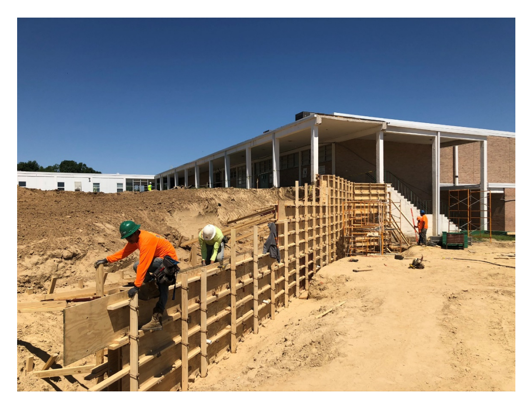
Figure 2 – Retaining Wall Formwork