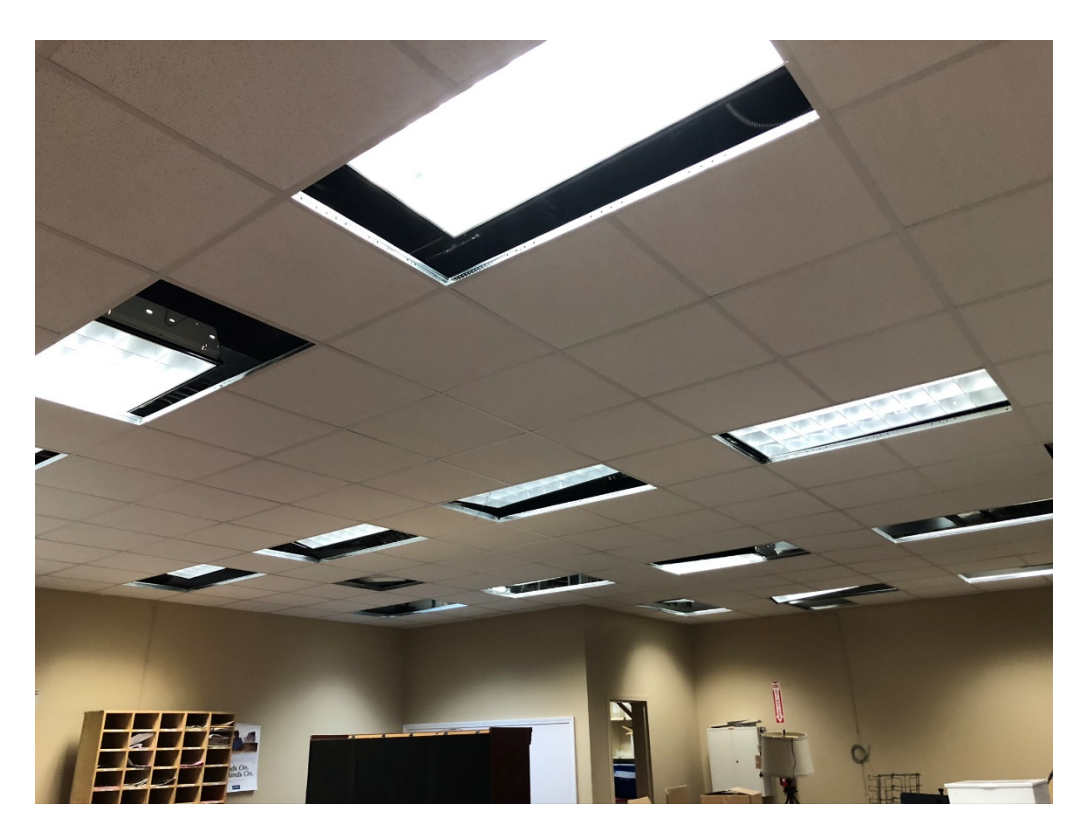
Figure 7 – Lower Level Ceiling Grid and New Tile Work