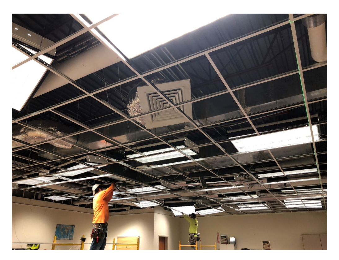
Figure 9 – Lower Level Ceiling Grid and New Tile Work