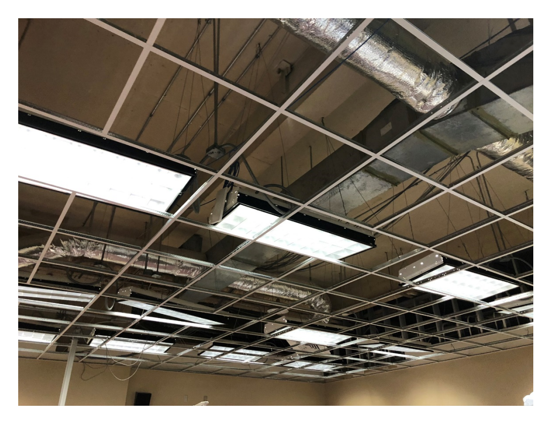
Figure 8 – Lower Level Ceiling Grid and New Tile Work