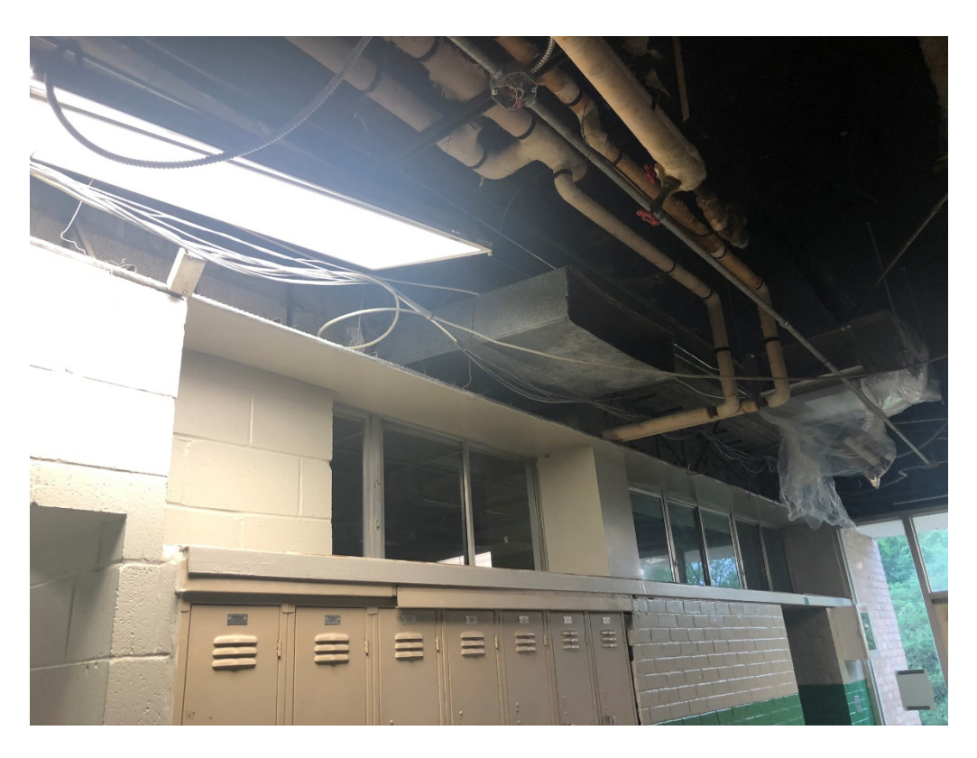
Figure 5 – Return to Sped E-227 (Contractor proposes to cap, leaving room without return)