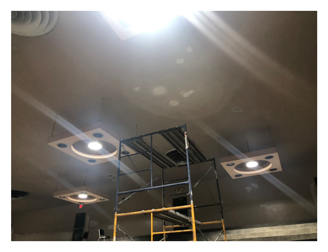
Figure 6 – Plaster patching @ Auditorium