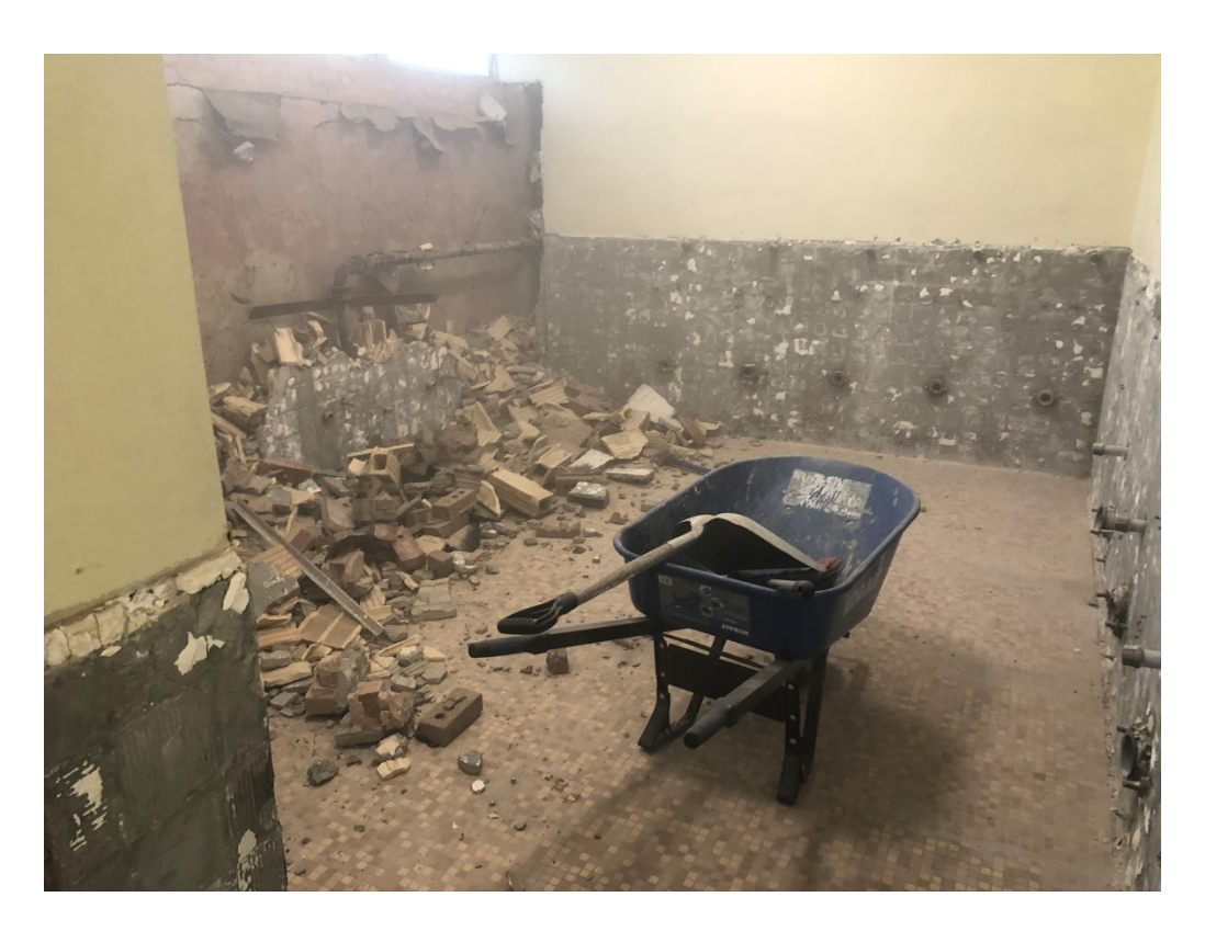
Figure 1 – Bathroom Demo of Chase Wall