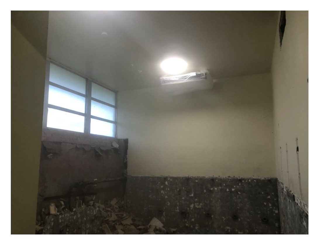
Figure 2 – Windows at Bath Area