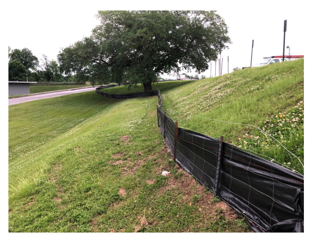
Figure 10 – North Hill Sediment Control In Place