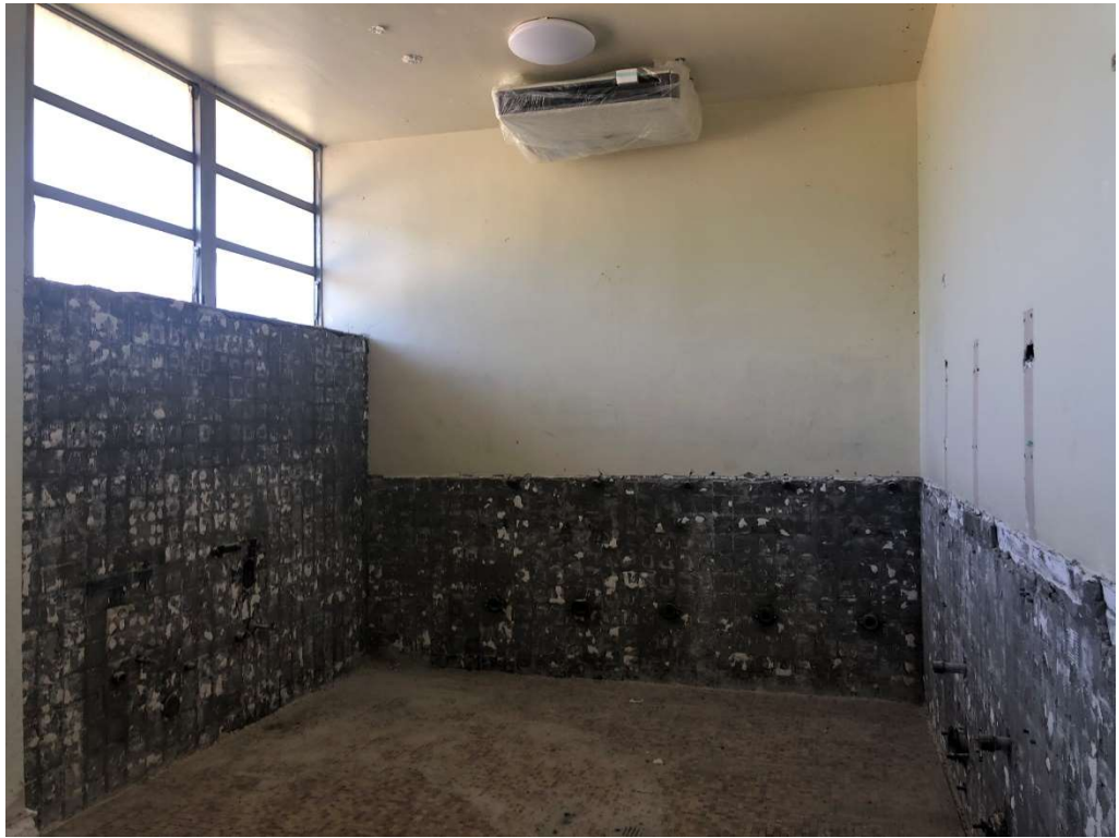
Figure 5 – Units set in Demoed Bathrooms