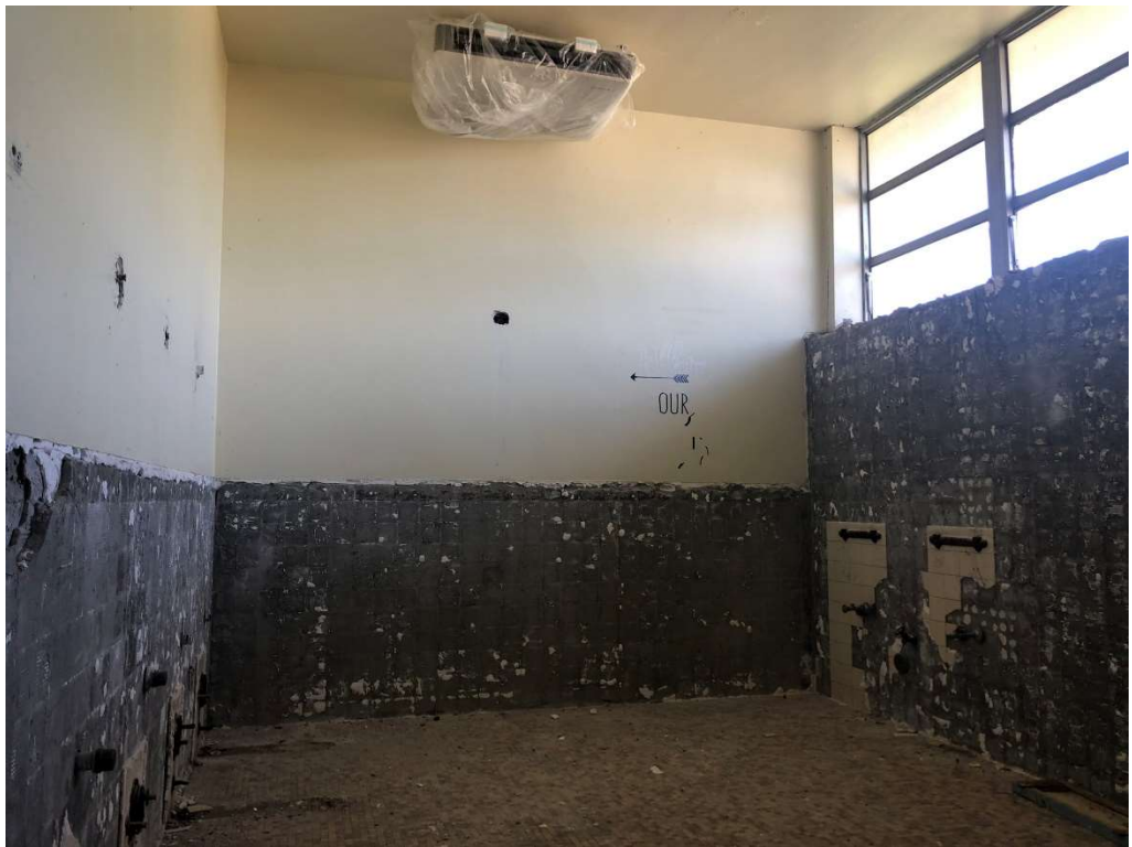
Figure 6 – Units set in Demoed Bathrooms