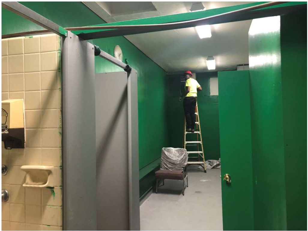
Figure 3 – Locker Room Heater Removal