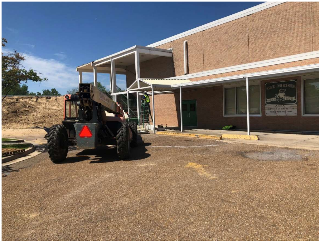
Figure 1 – Metal Awning Demo