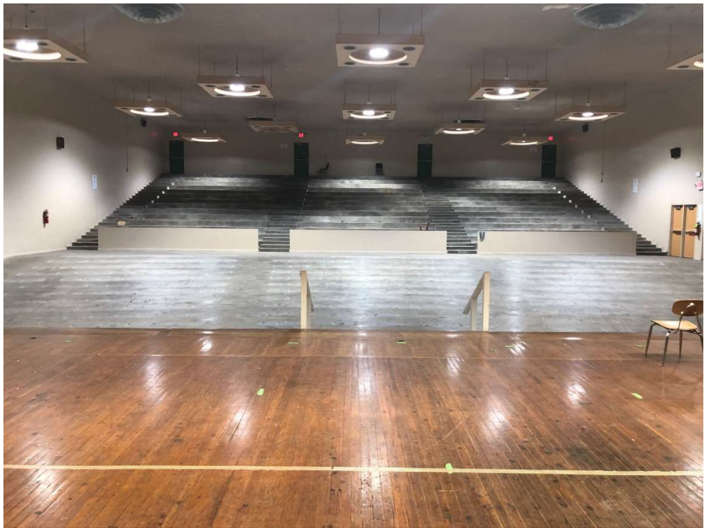
Figure 4 – Cleared Auditorium